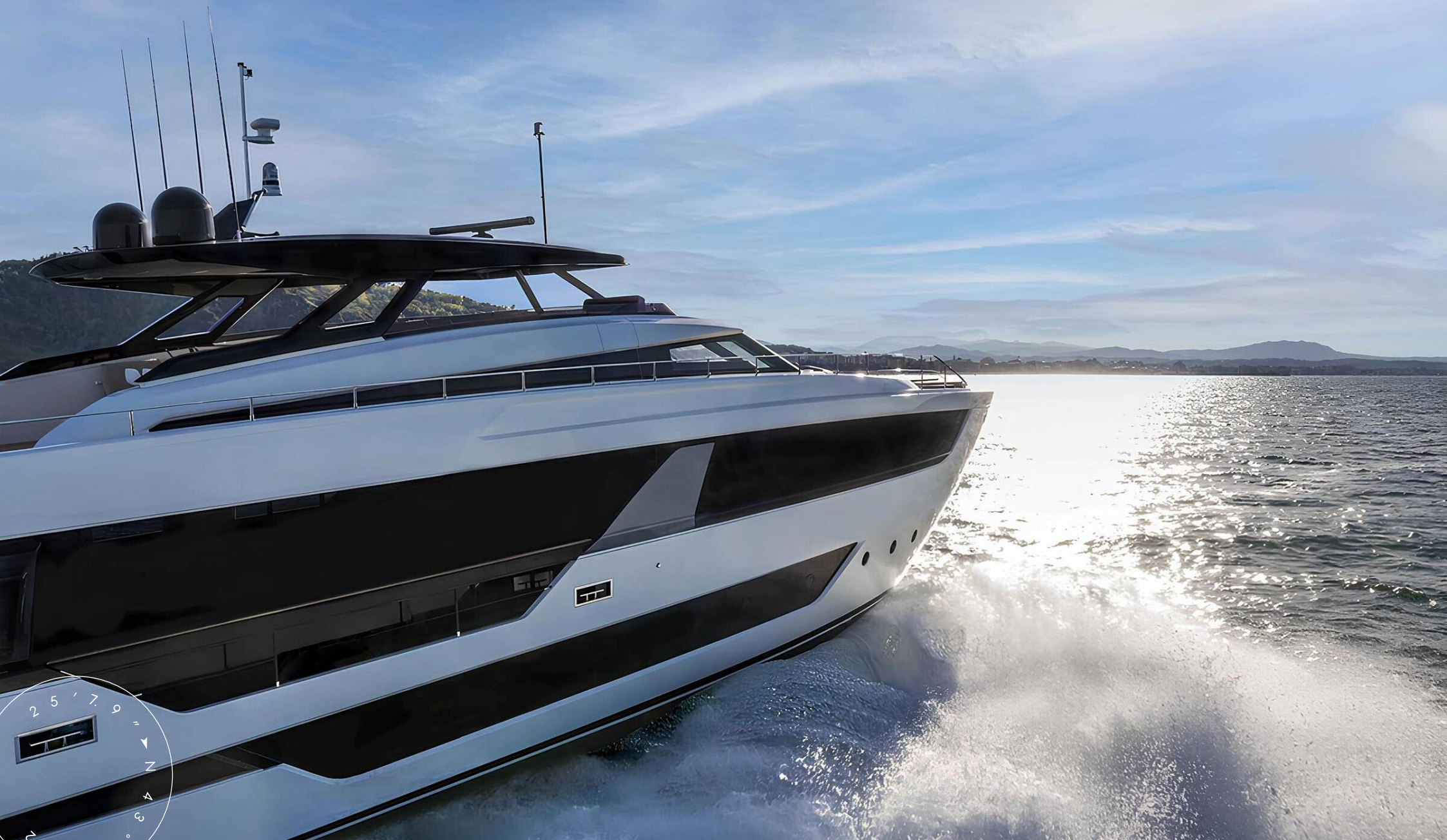
EXTERIOR FERRETTI 1000 2023 MY DANIMA