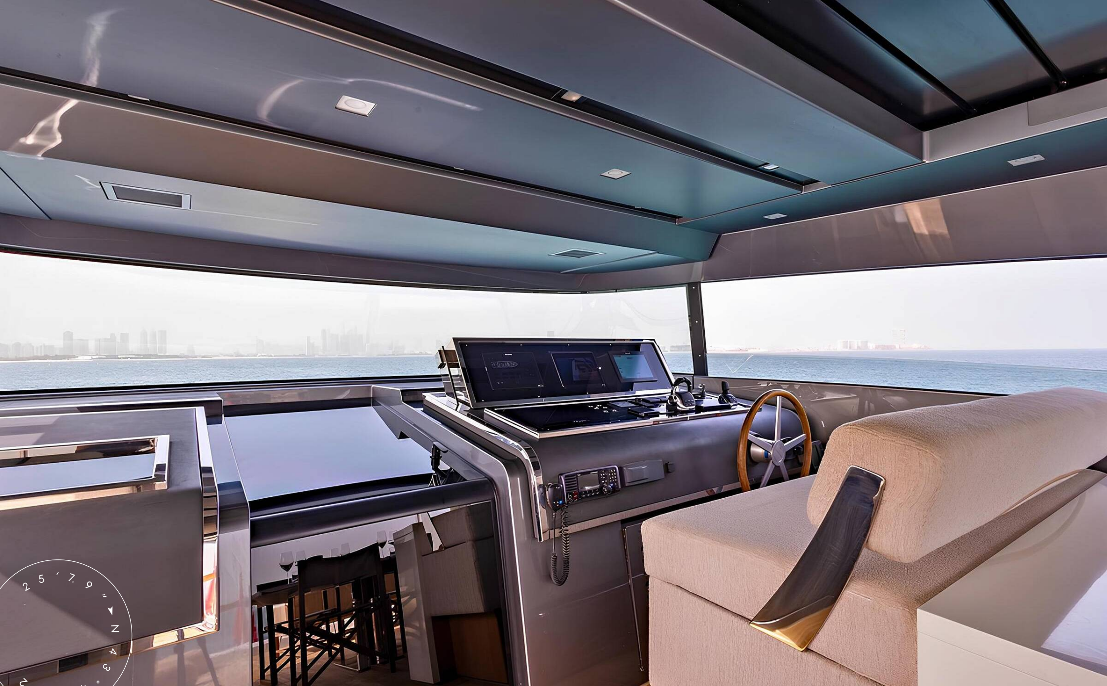
SECOND HELM STATION