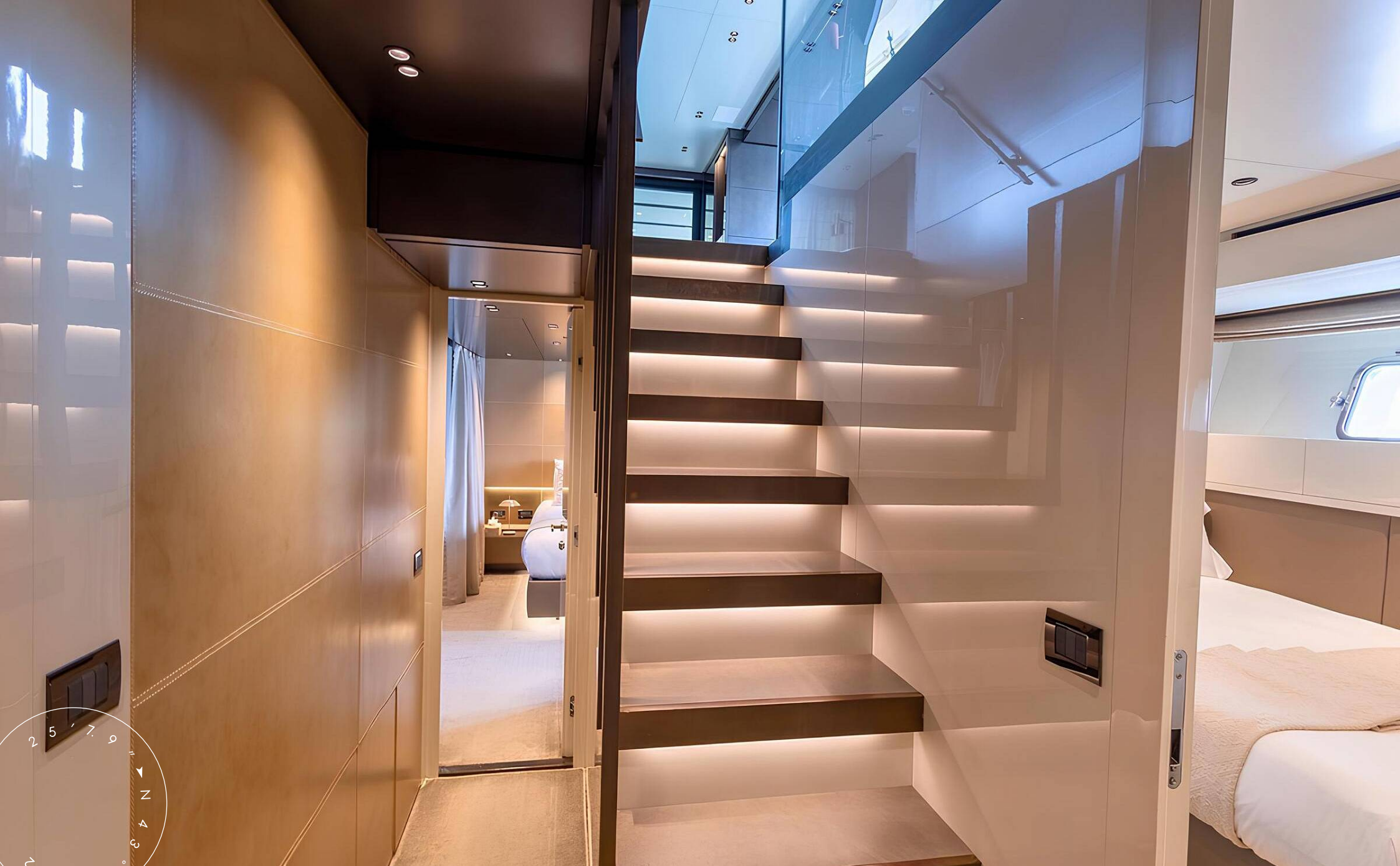
STAIRS FROM MD TO LD