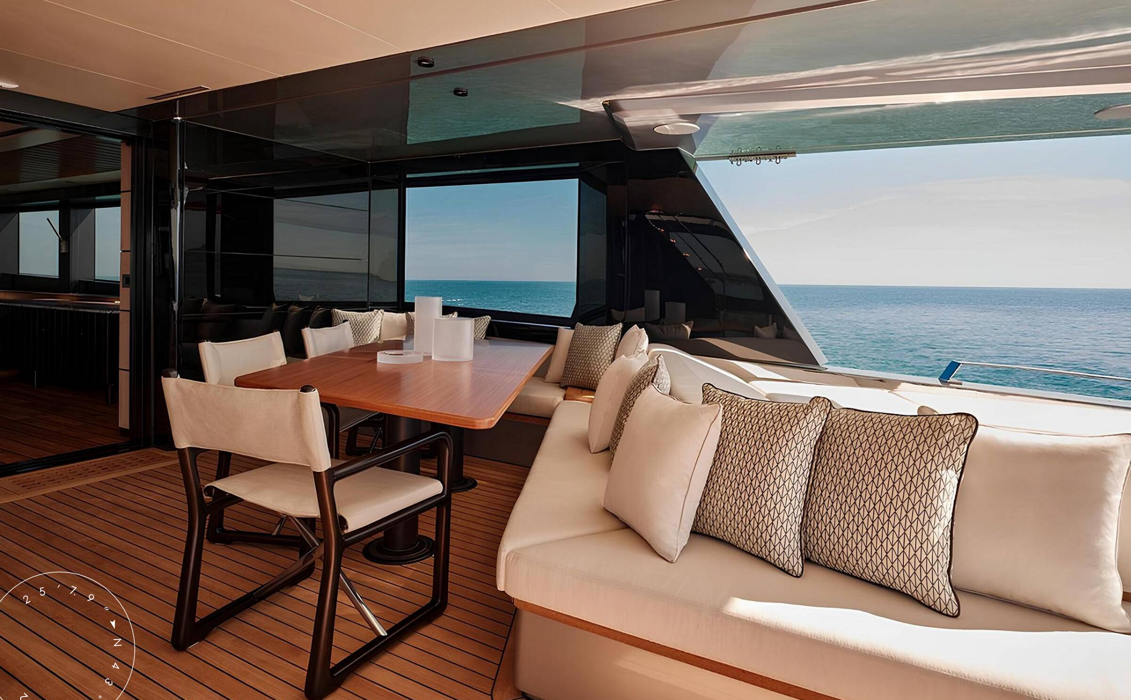
AFT MAIN DECK DINING AREA