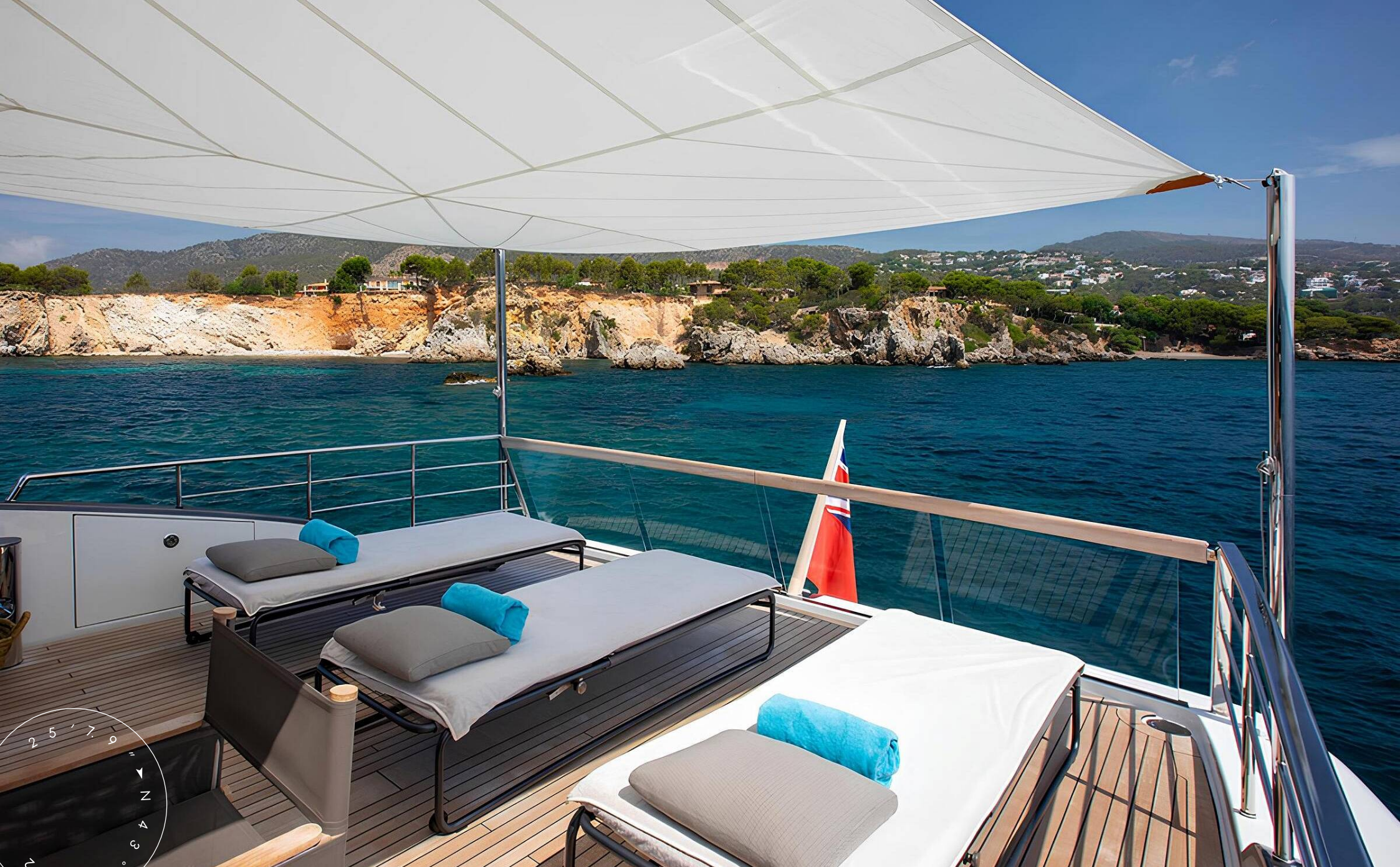
FLYBRIDGE AFT SUNBATHING AREA