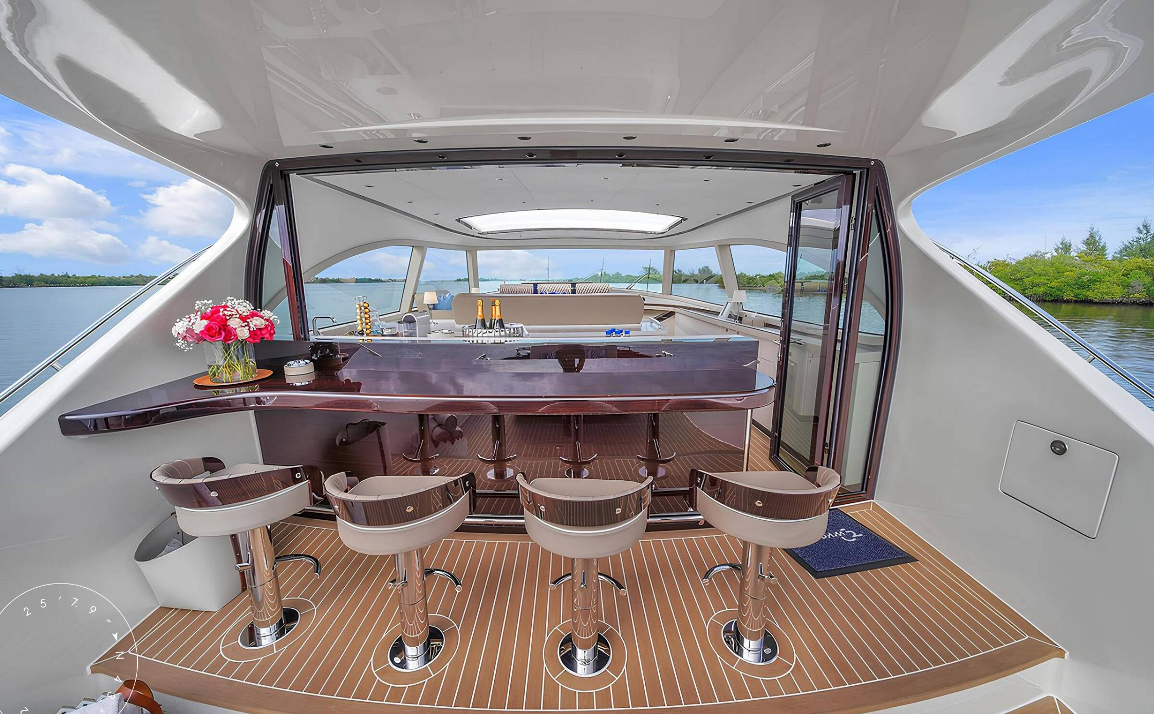
MAIN DECK BAR