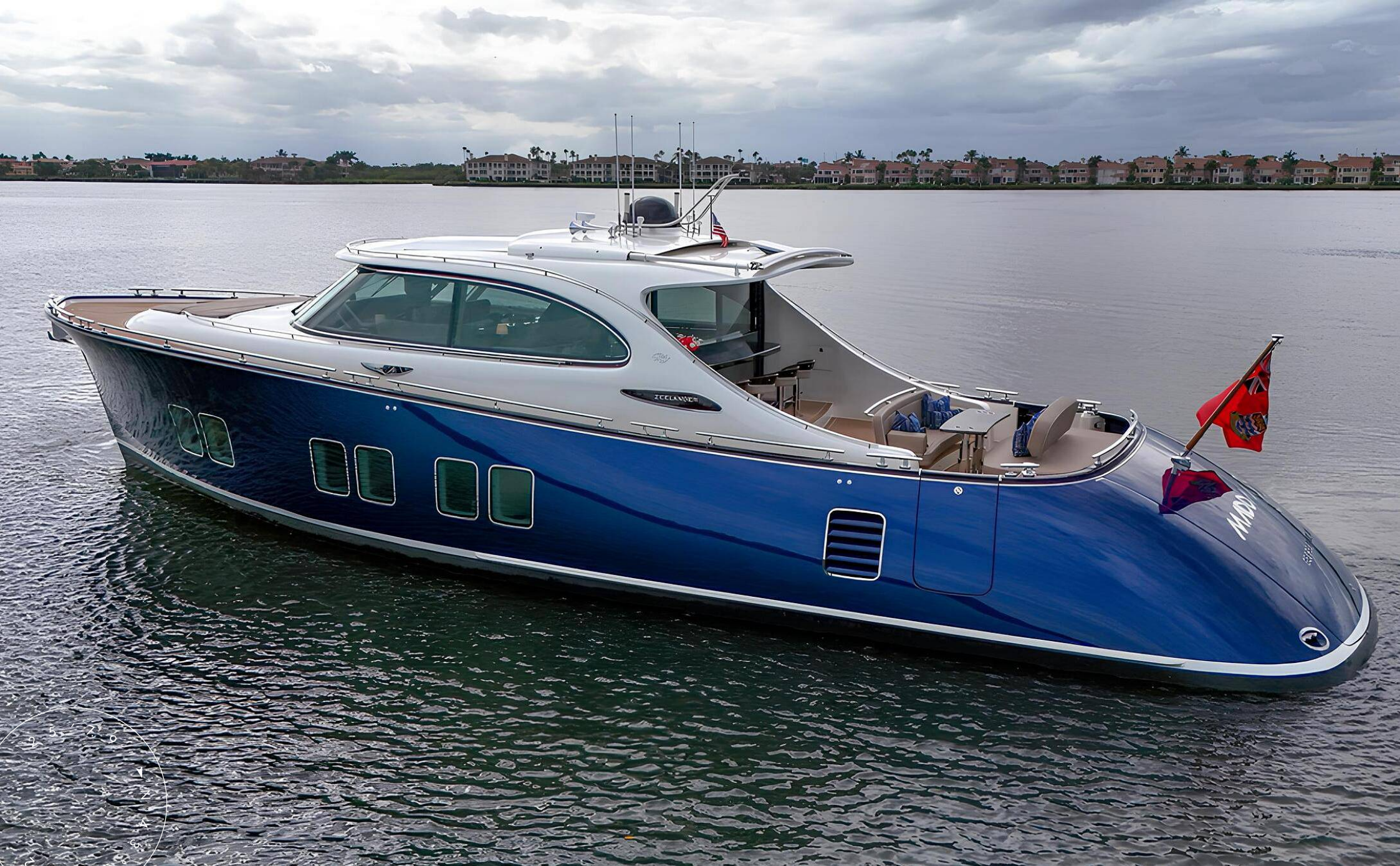
EXTERIOR ZEELANDER 72 2023 MY MADDAMC2