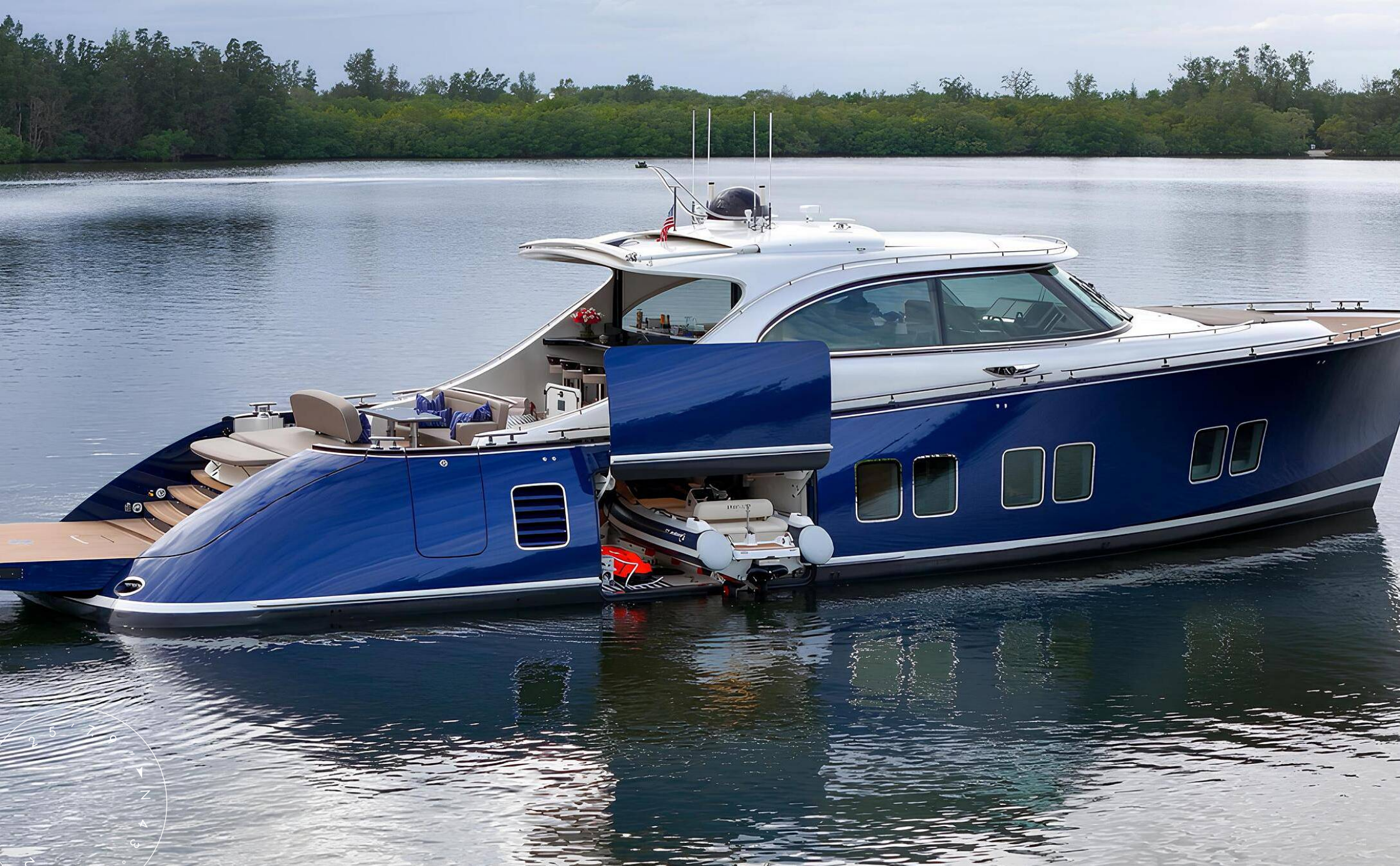
EXTERIOR ZEELANDER 72 2023 MY MADDAMC2