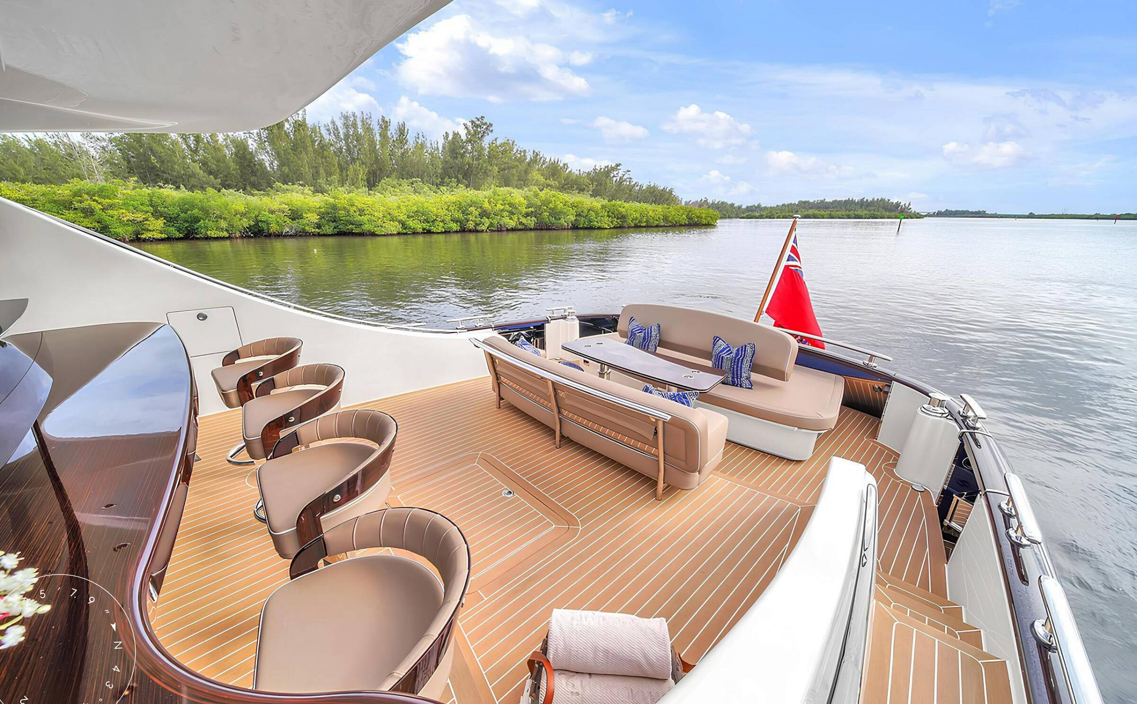
COCKPIT SEATING AREA