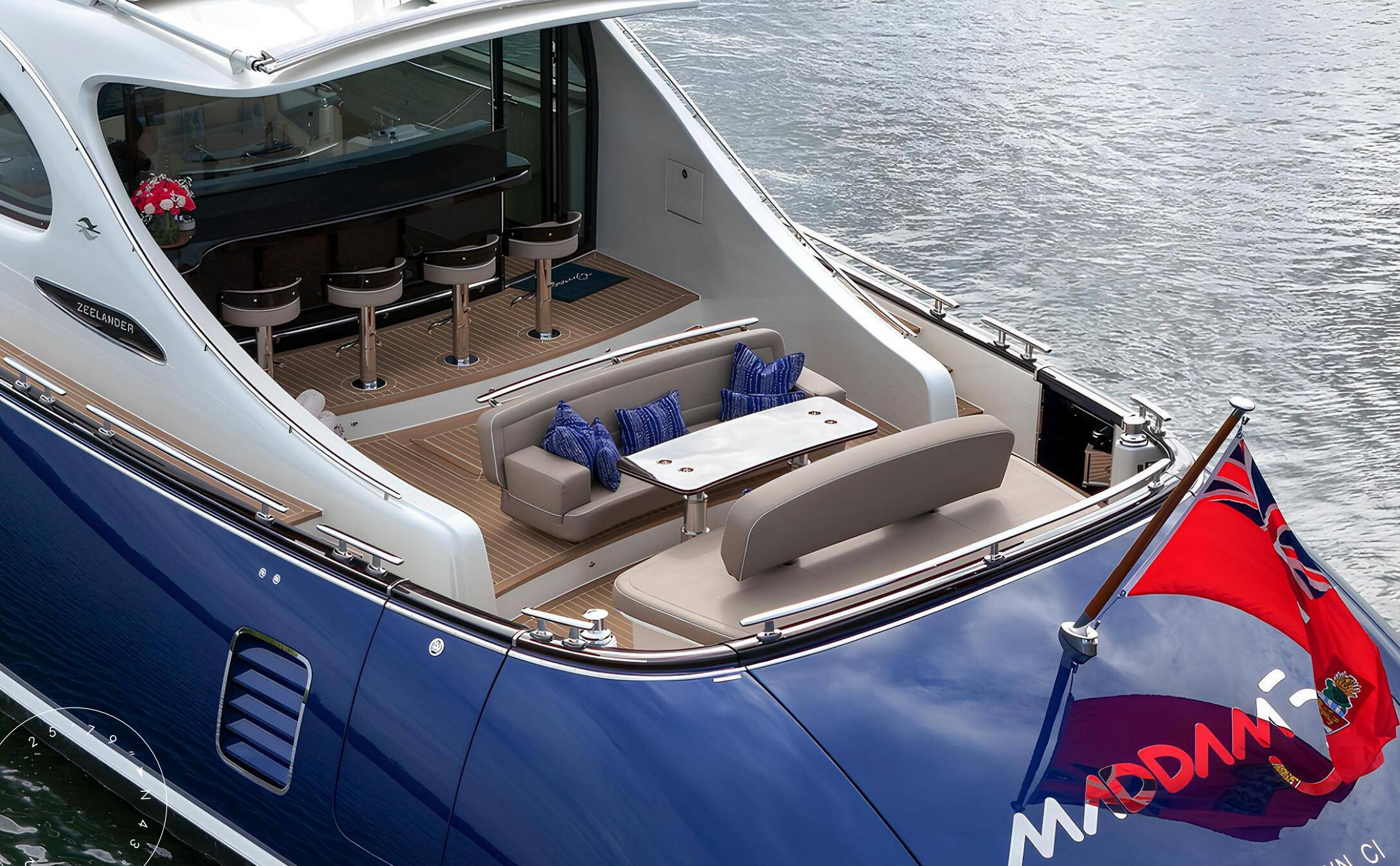
COCKPIT SEATING AREA