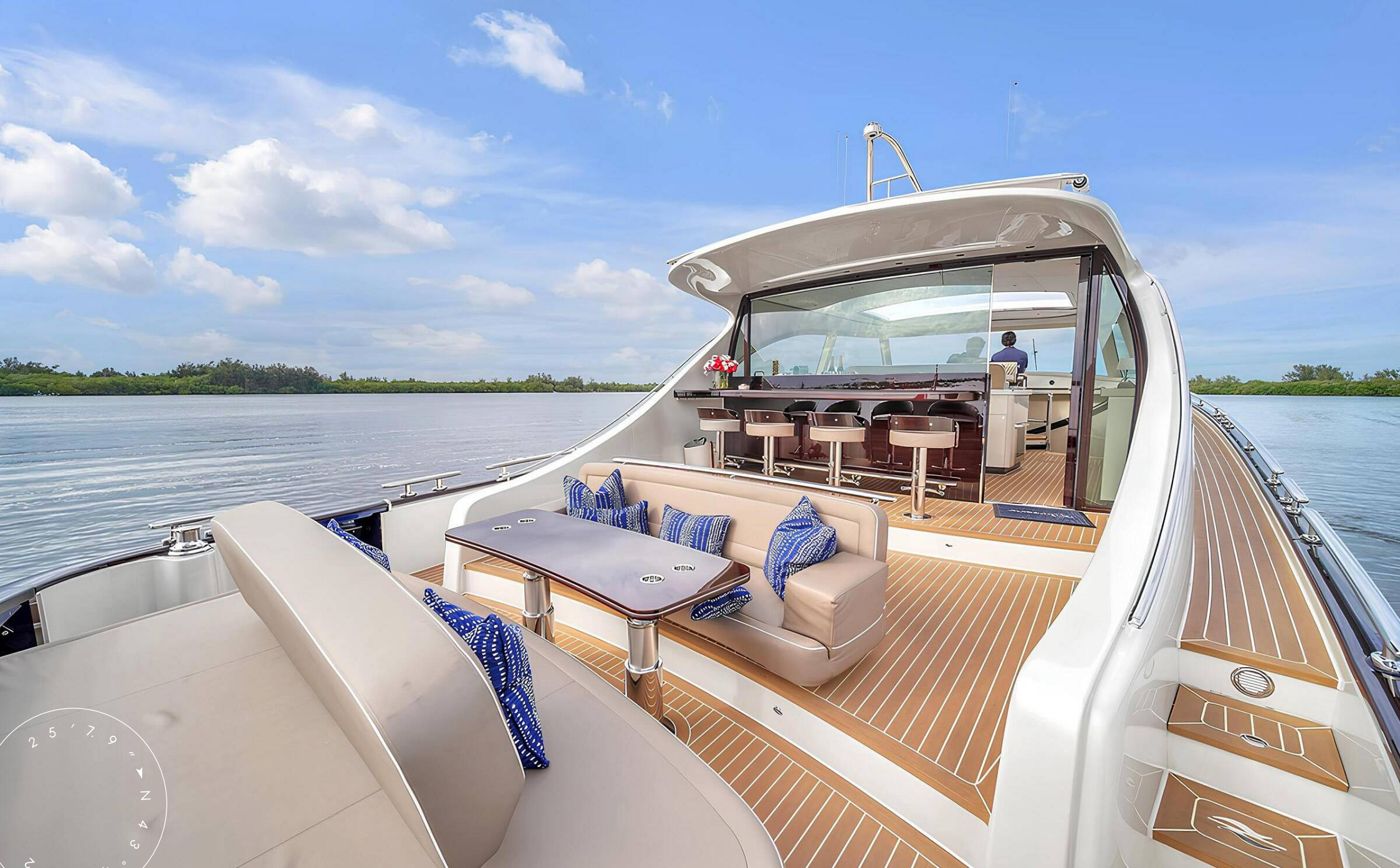
COCKPIT SEATING AREA