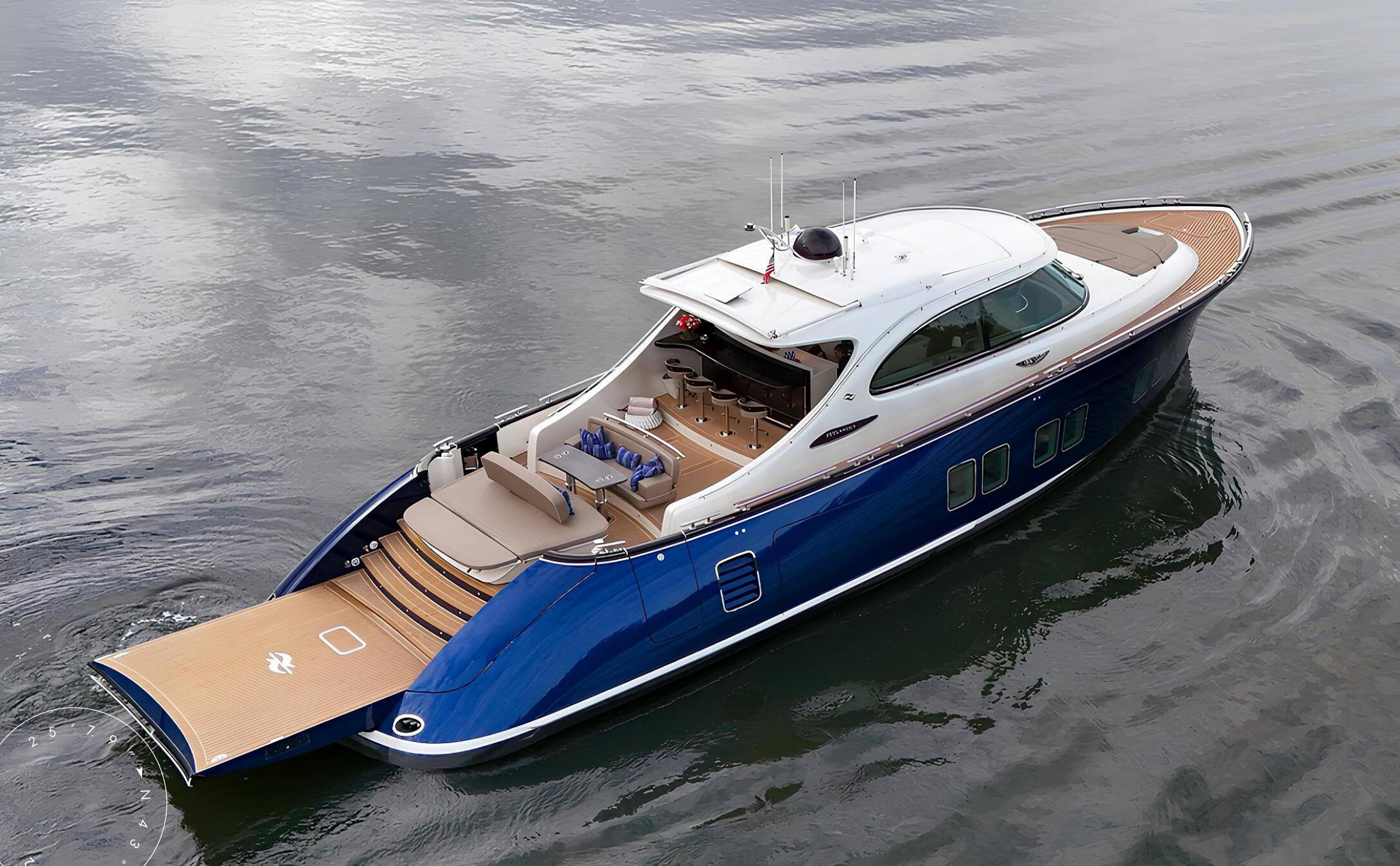
EXTERIOR ZEELANDER 72 2023 MY MADDAMC2