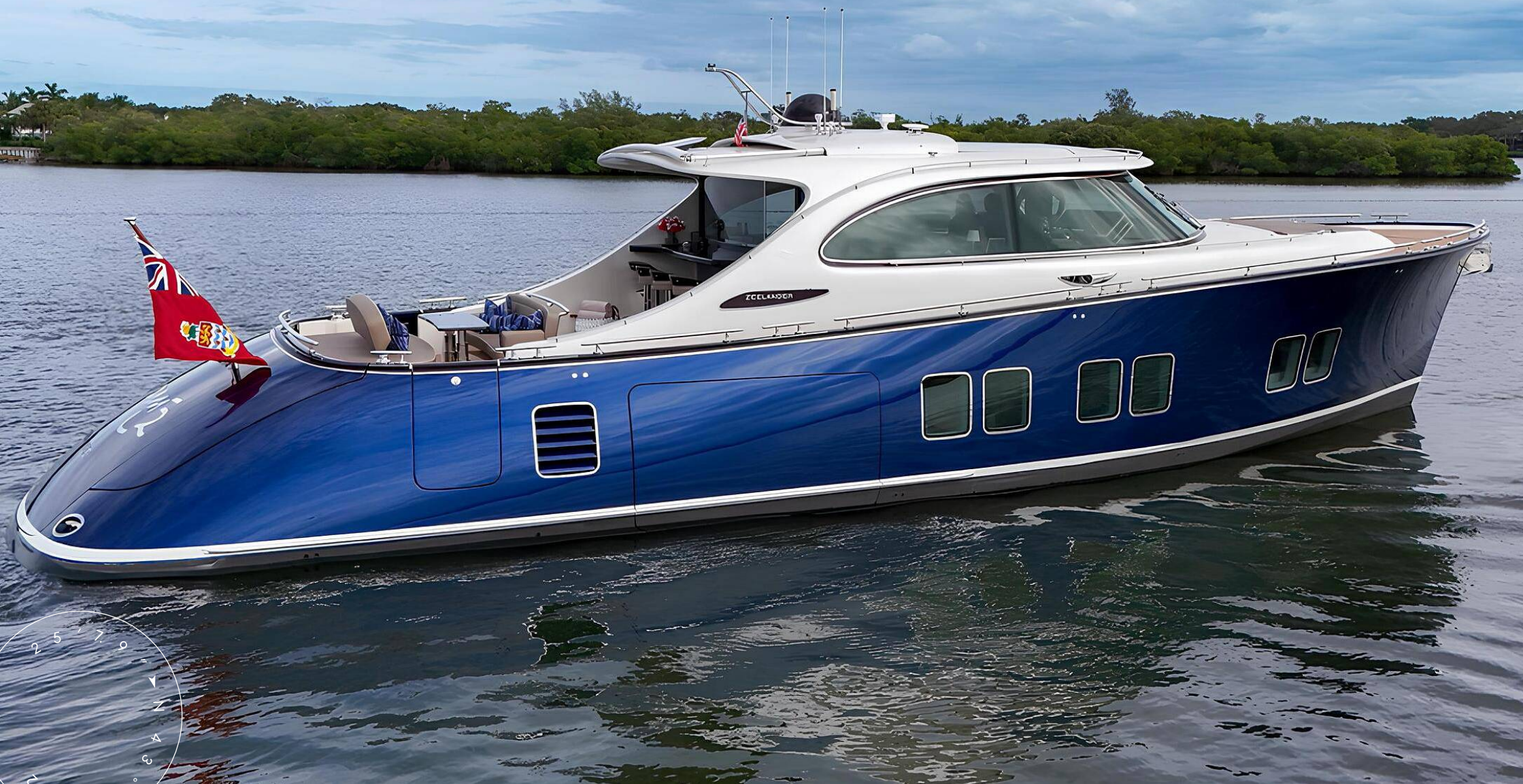
EXTERIOR ZEELANDER 72 2023 MY MADDAMC2