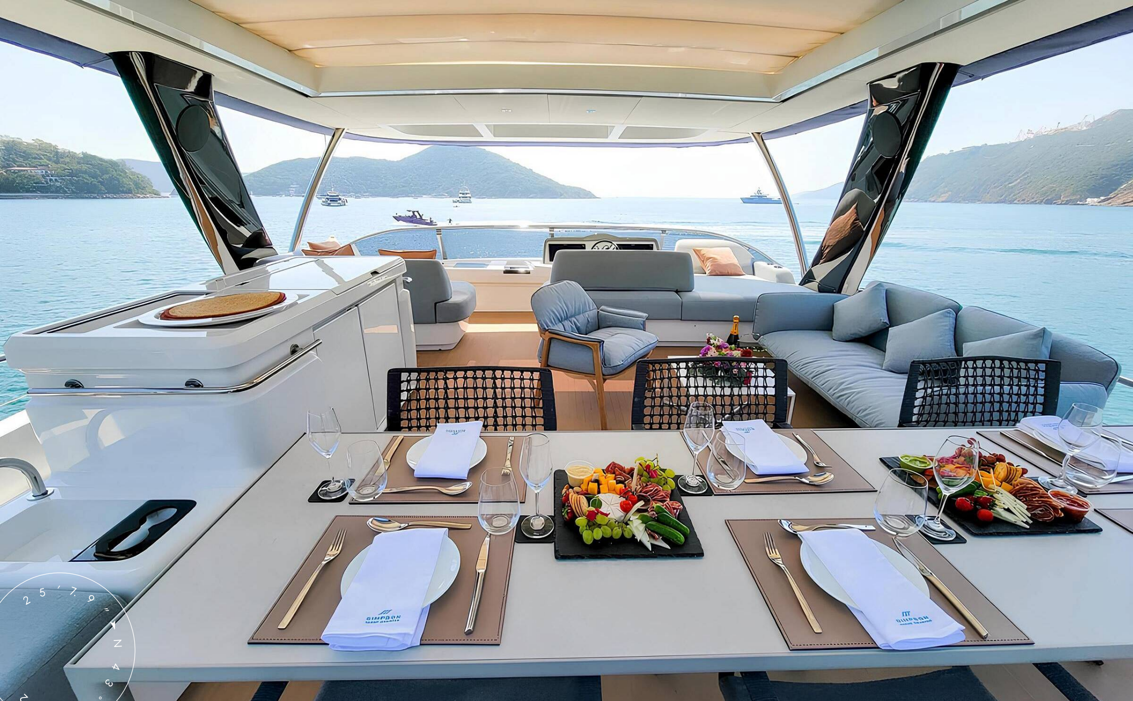
FLYBRIDGE DINING AREA