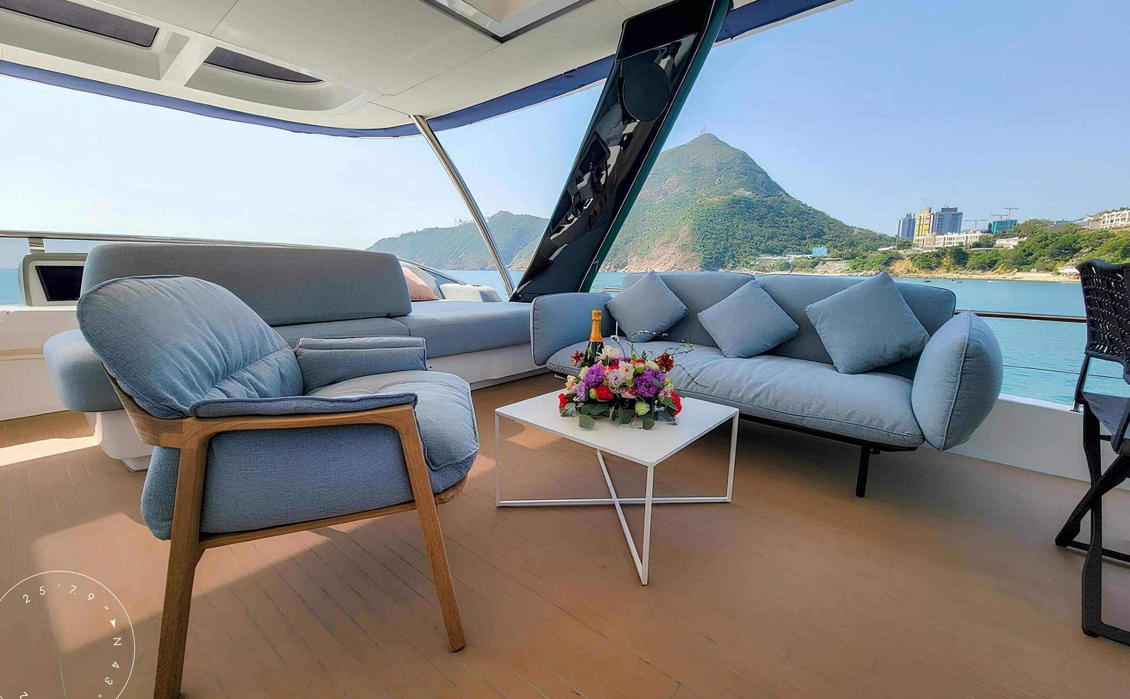
FLYBRIDGE LOUNGE AREA