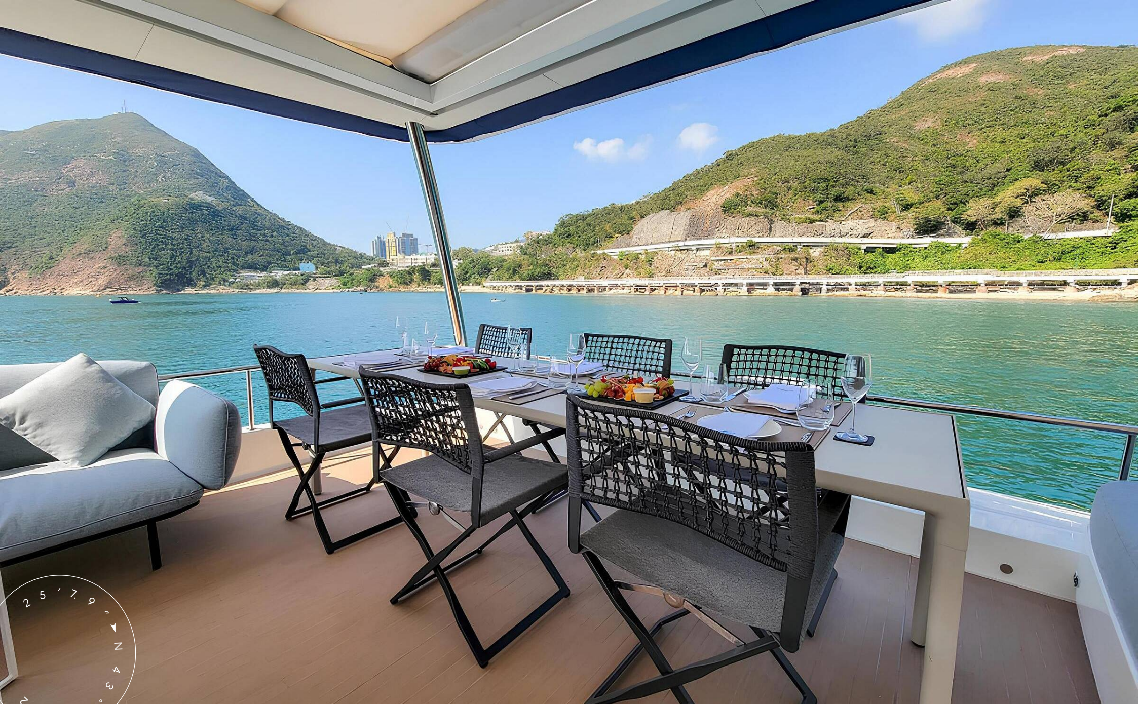
FLYBRIDGE DINING AREA