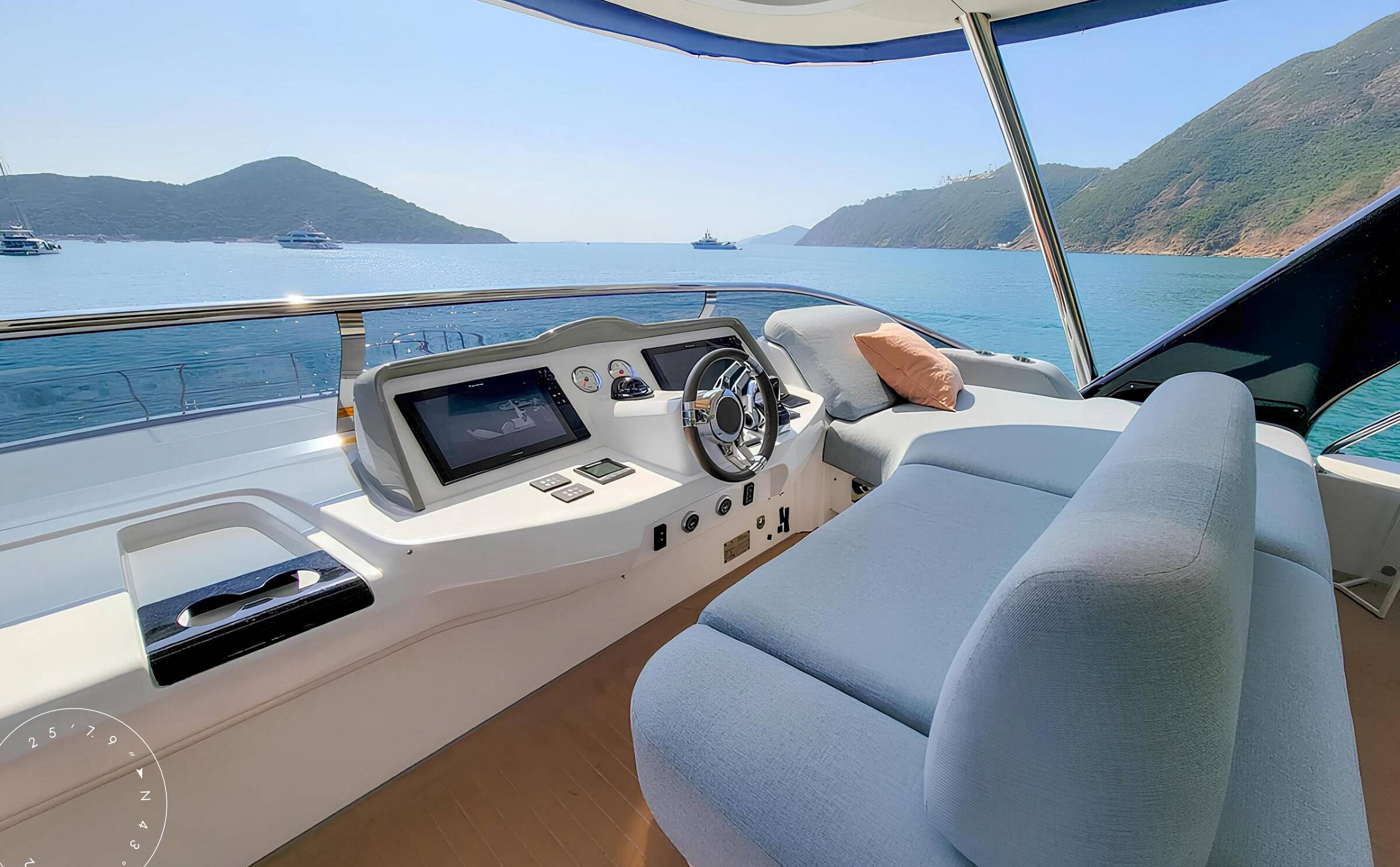
SECOND HELM STATION