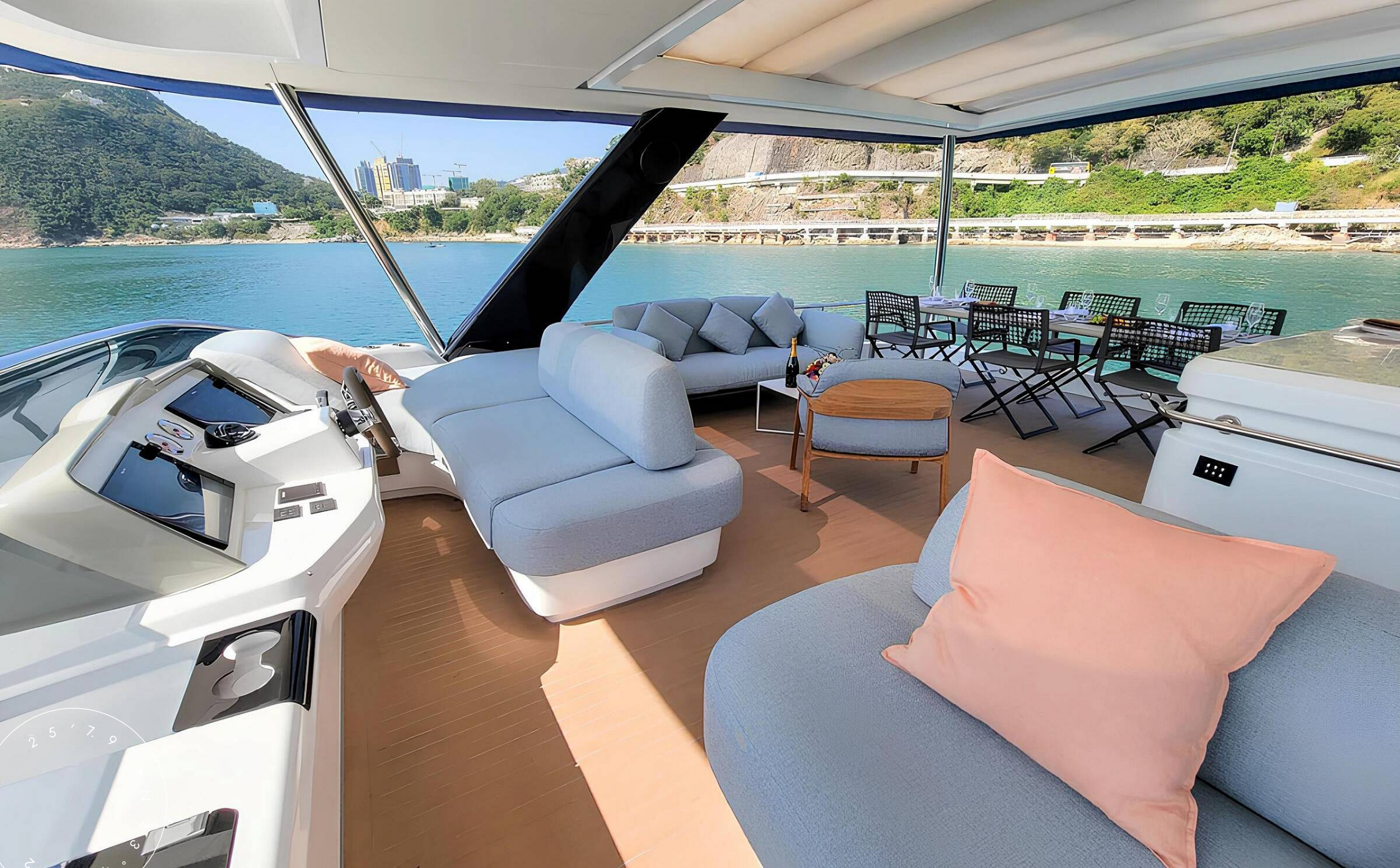
SECOND HELM STATION