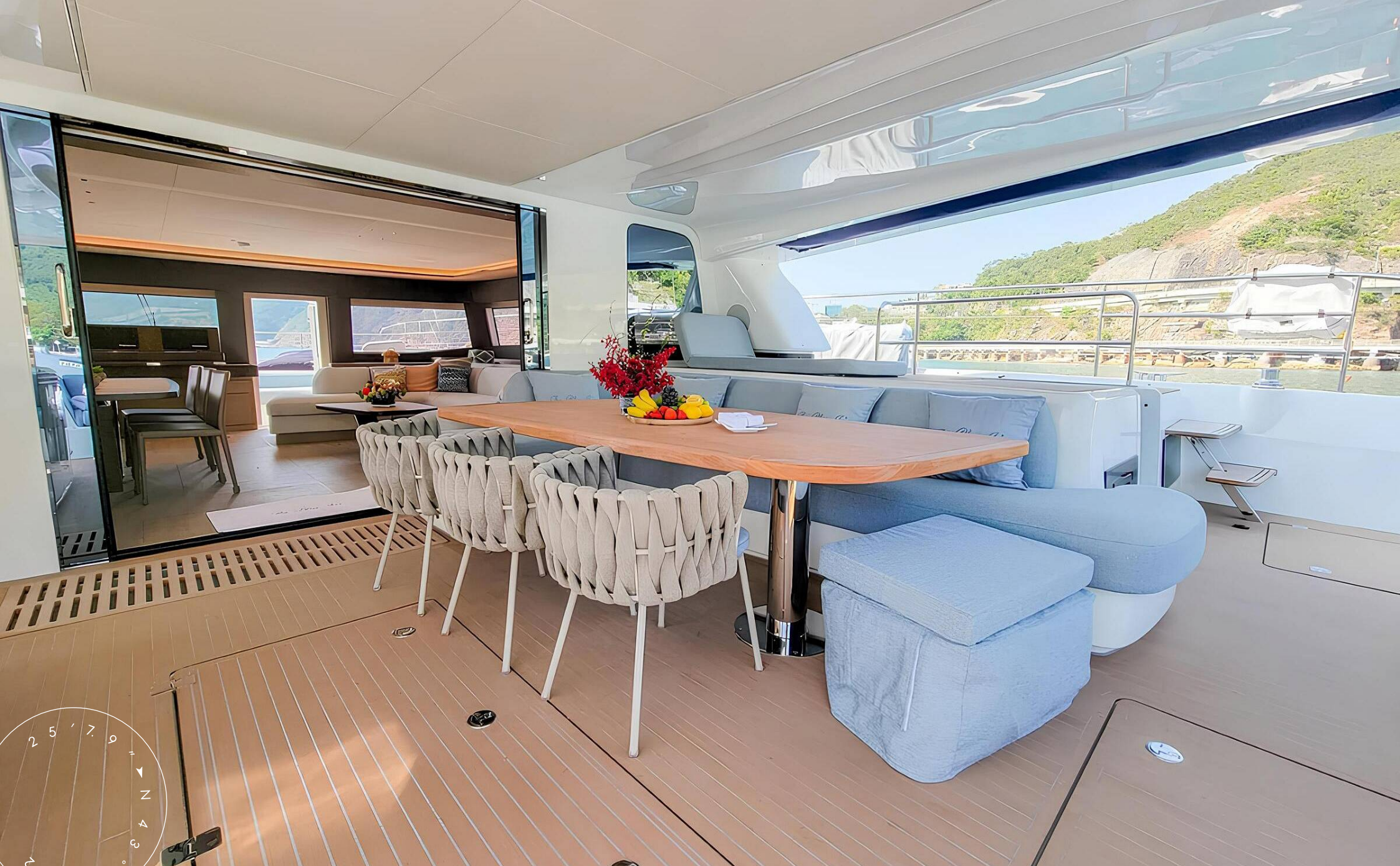
AFT MAIN DECK DINING AREA