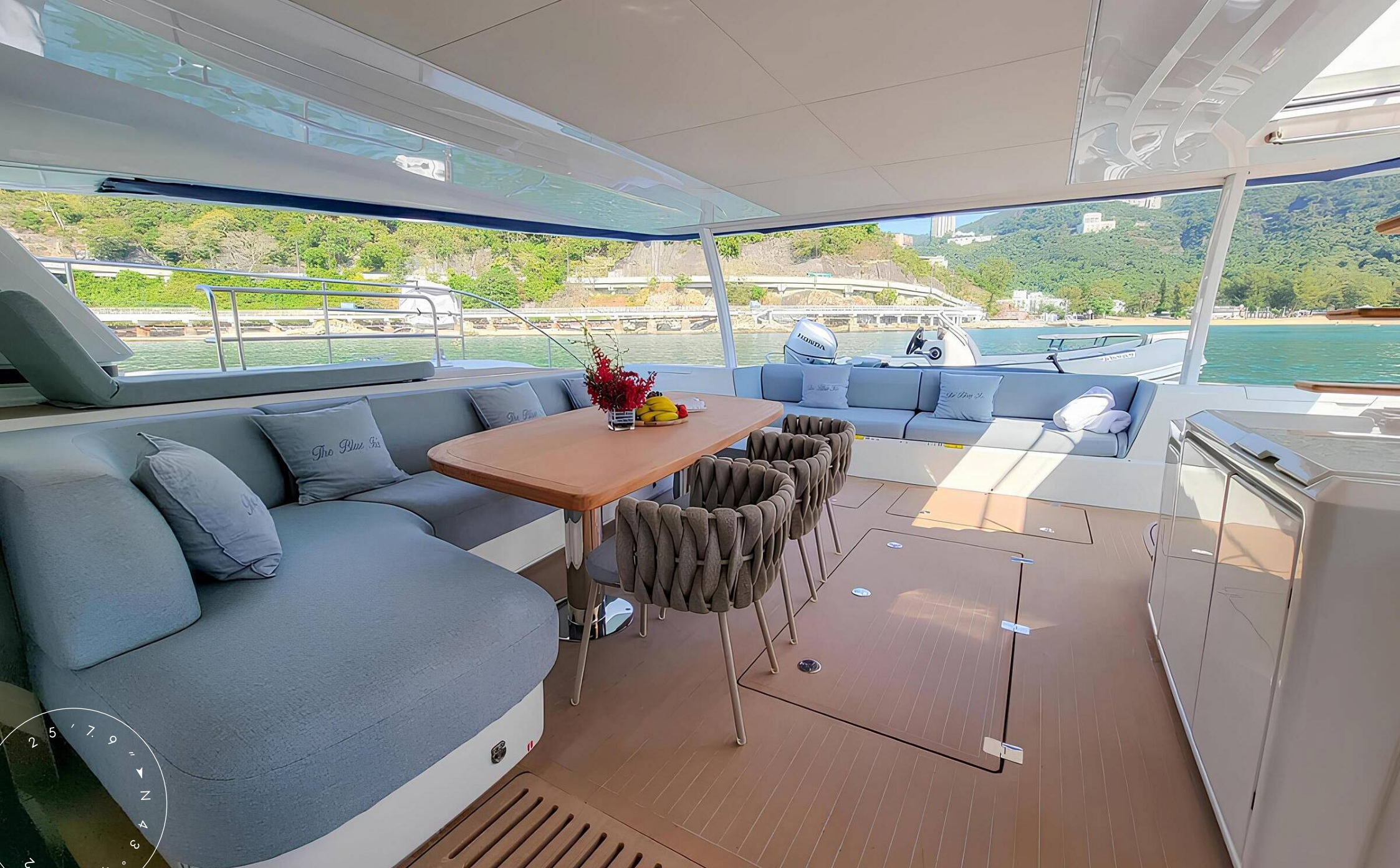
AFT MAIN DECK DINING AREA