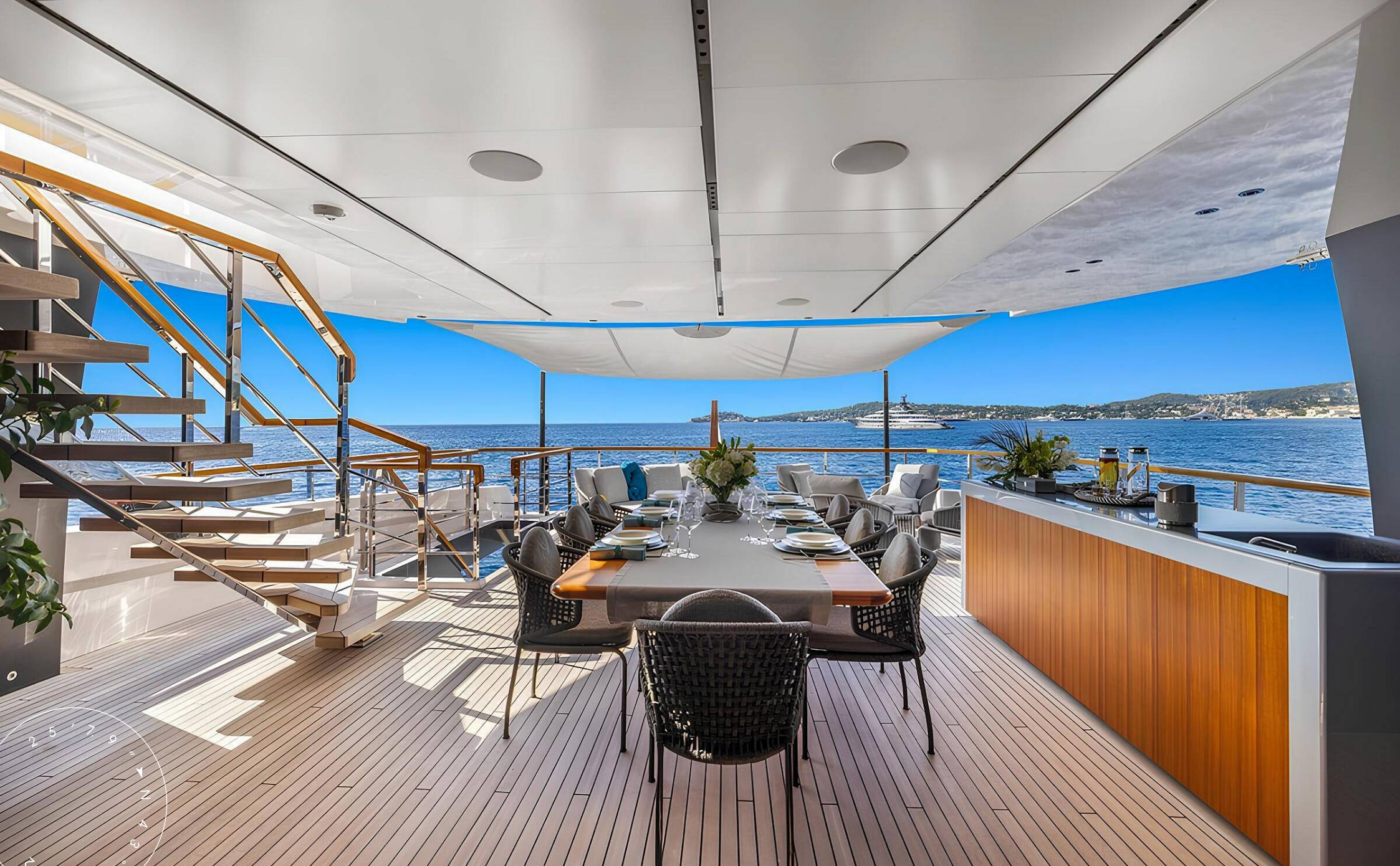
AFT UPPER DECK DINING AREA