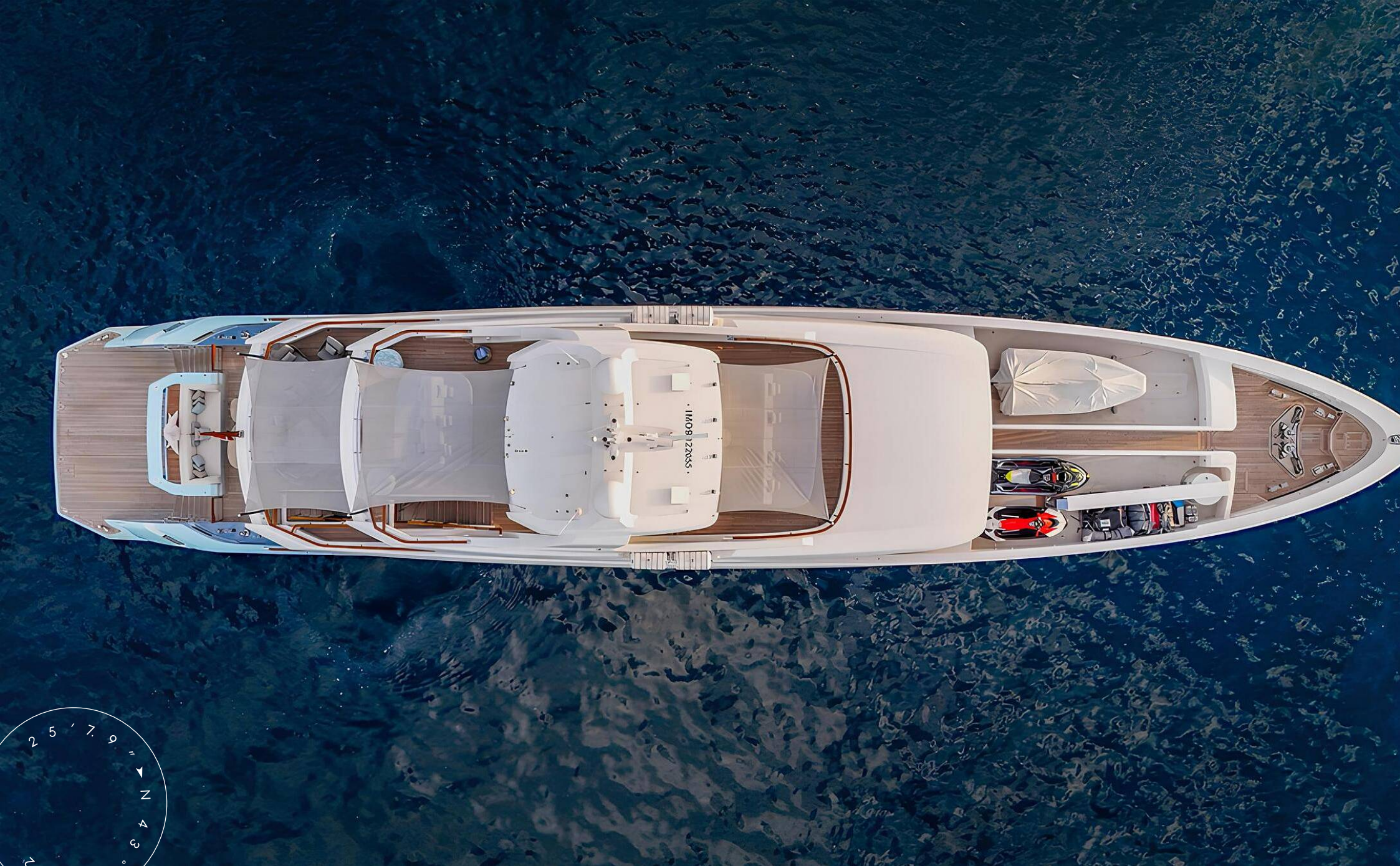
EXTERIOR ADMIRAL ATOS 47 2020 MY ALTHEA