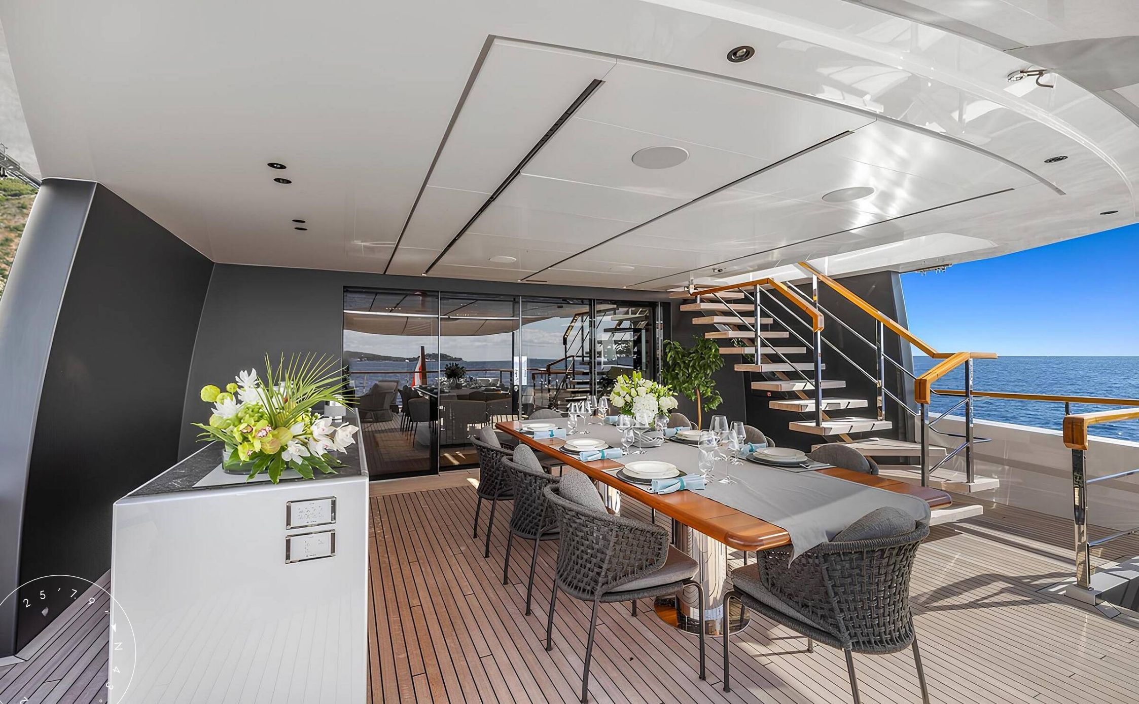
AFT UPPER DECK DINING AREA