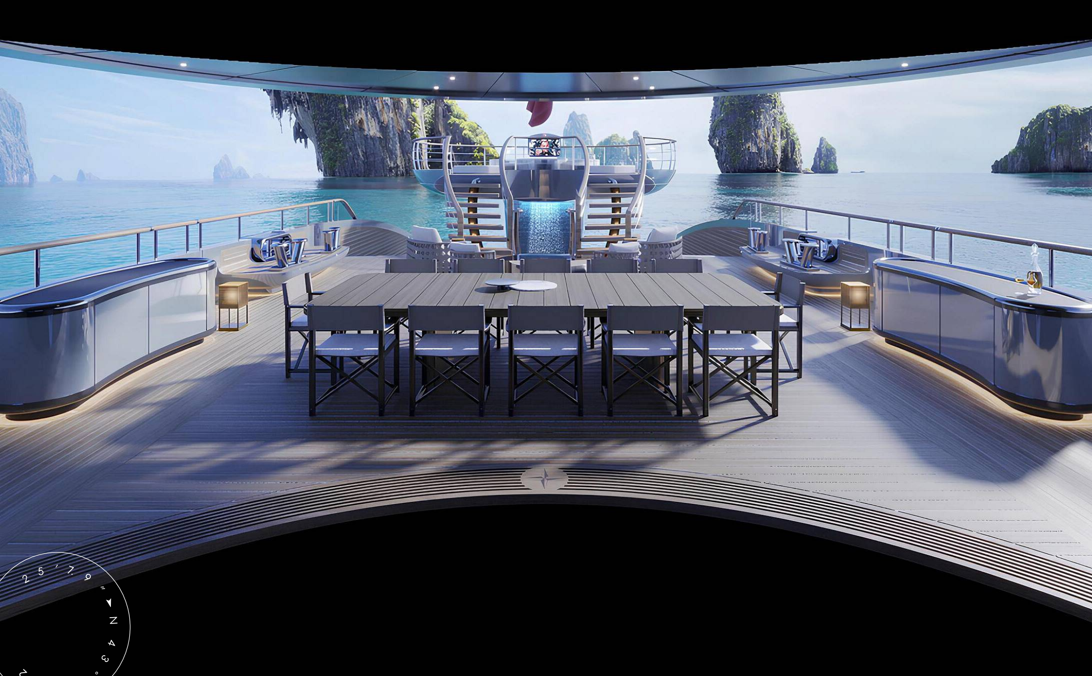
AFT MAIN DECK DINING AREA