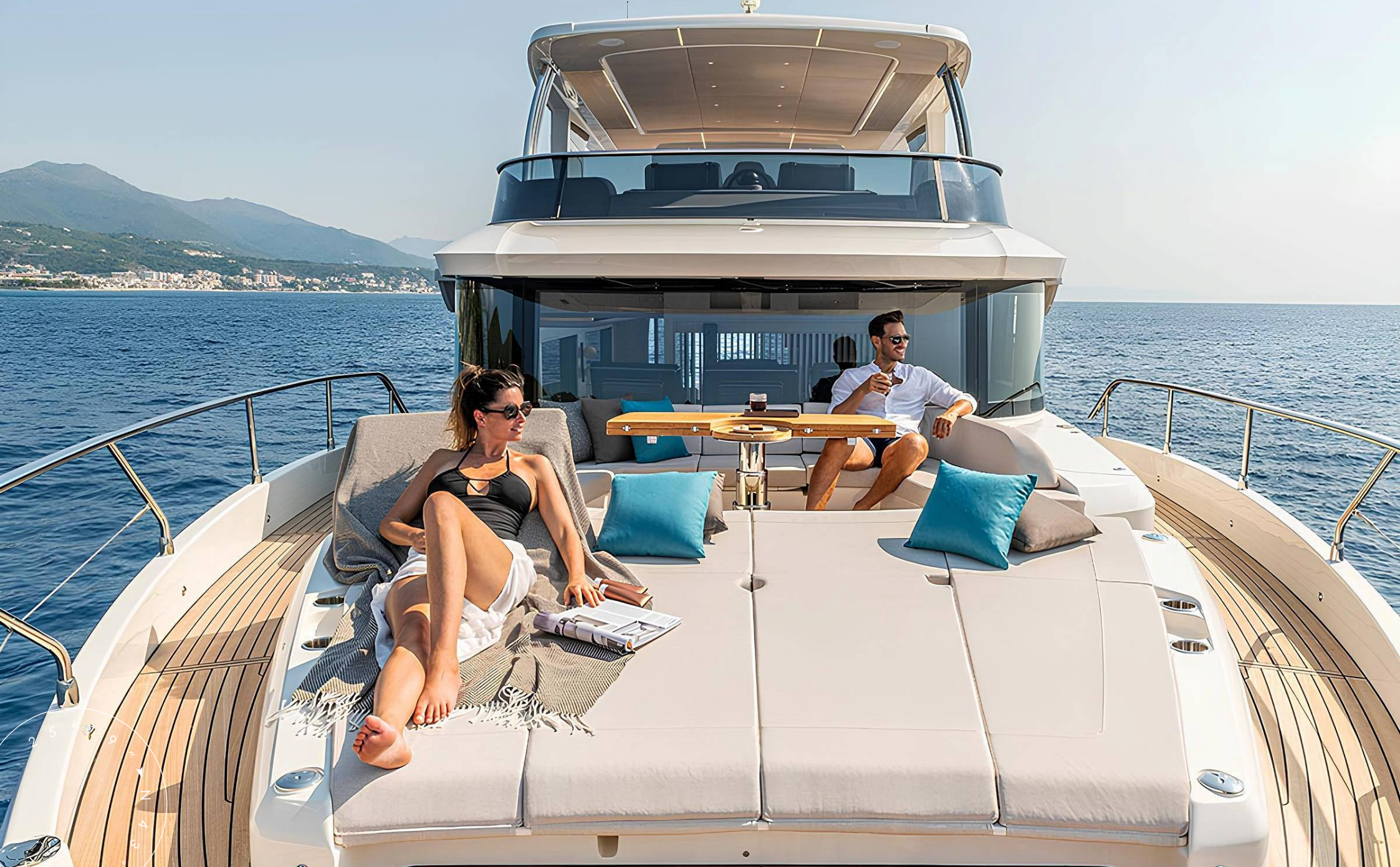
BOW SUNBATHING AREA