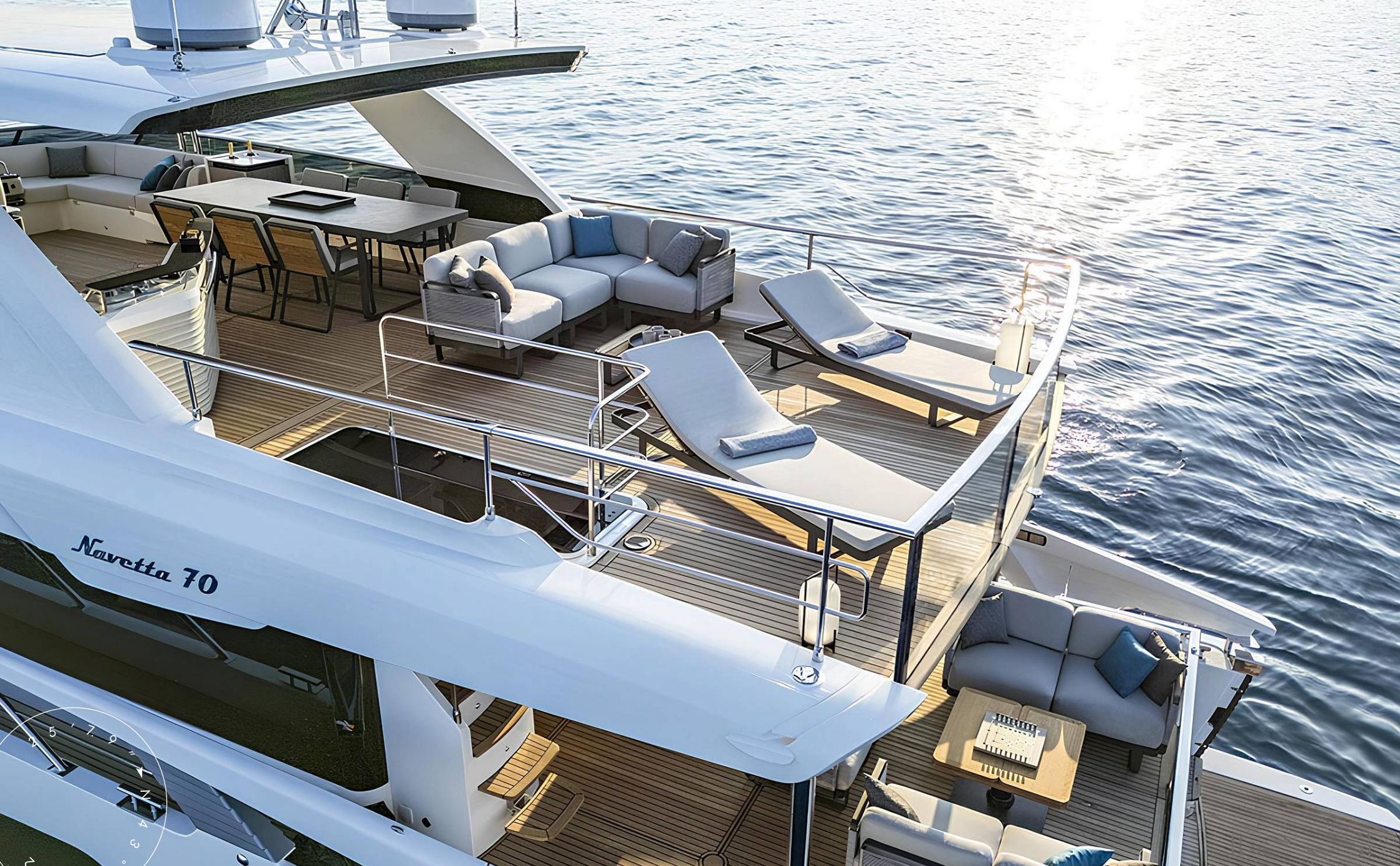
FLYBRIDGE AFT SUNBATHING AREA