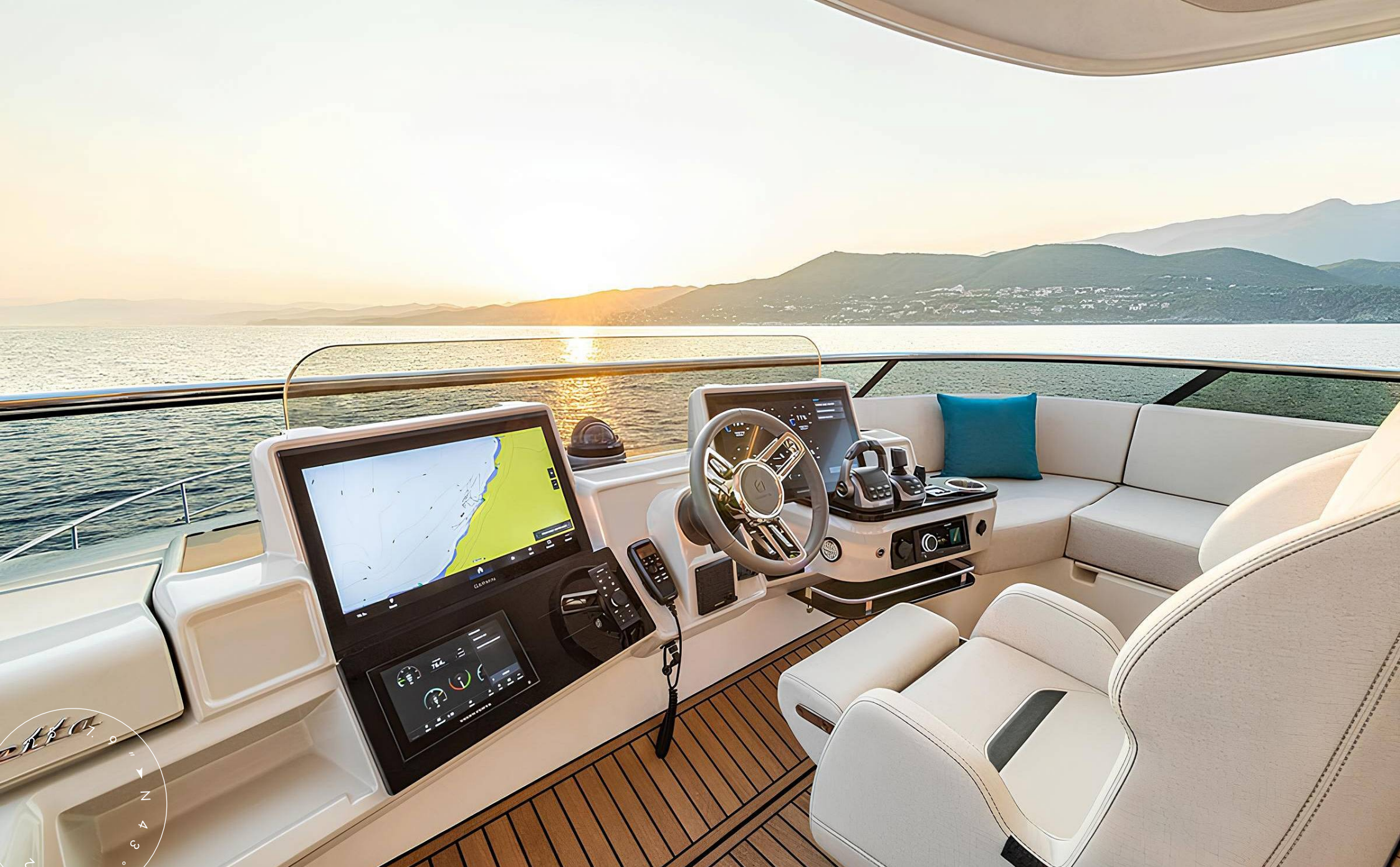
SECOND HELM STATION