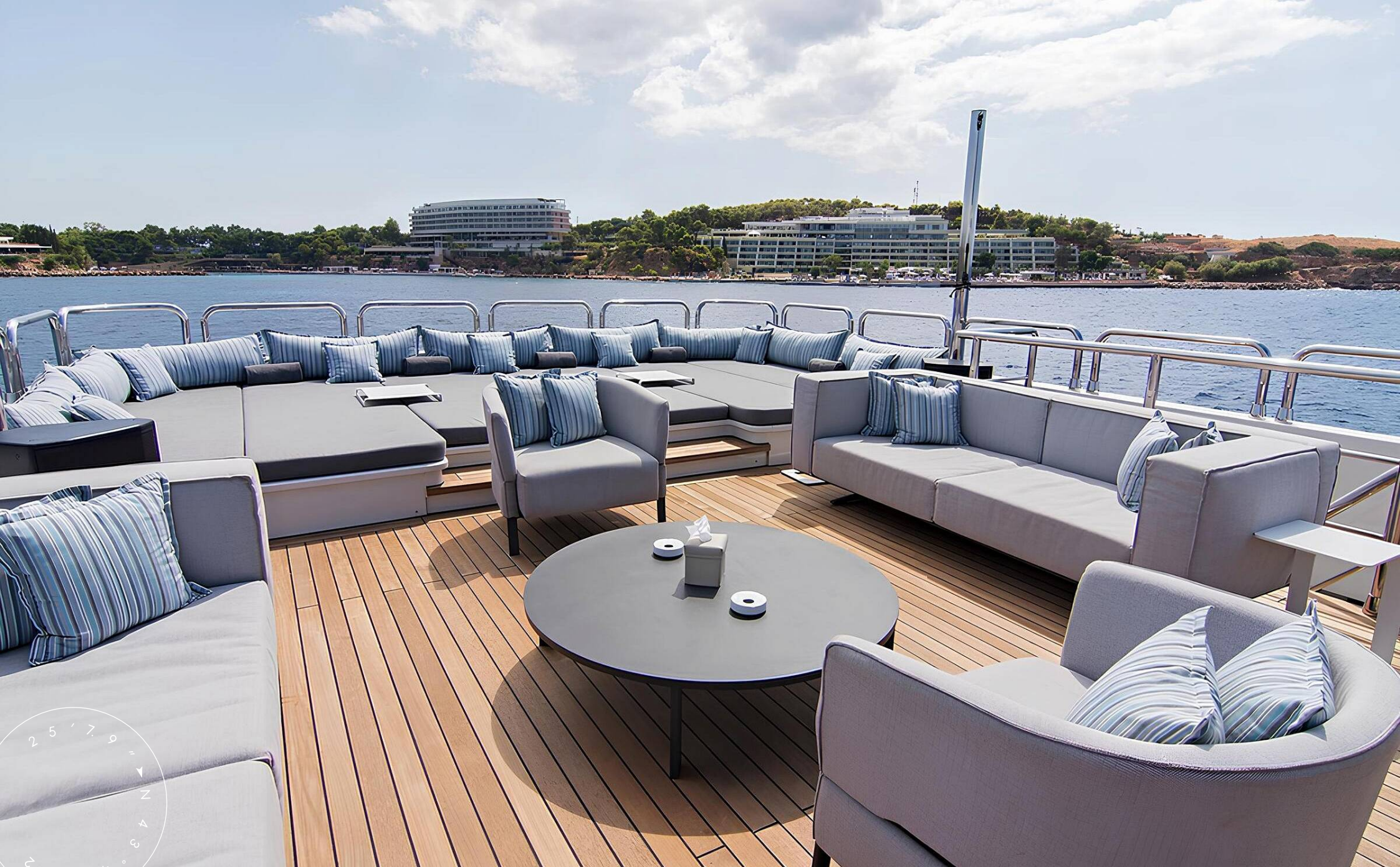
AFT SUNDECK LOUNGE AREA