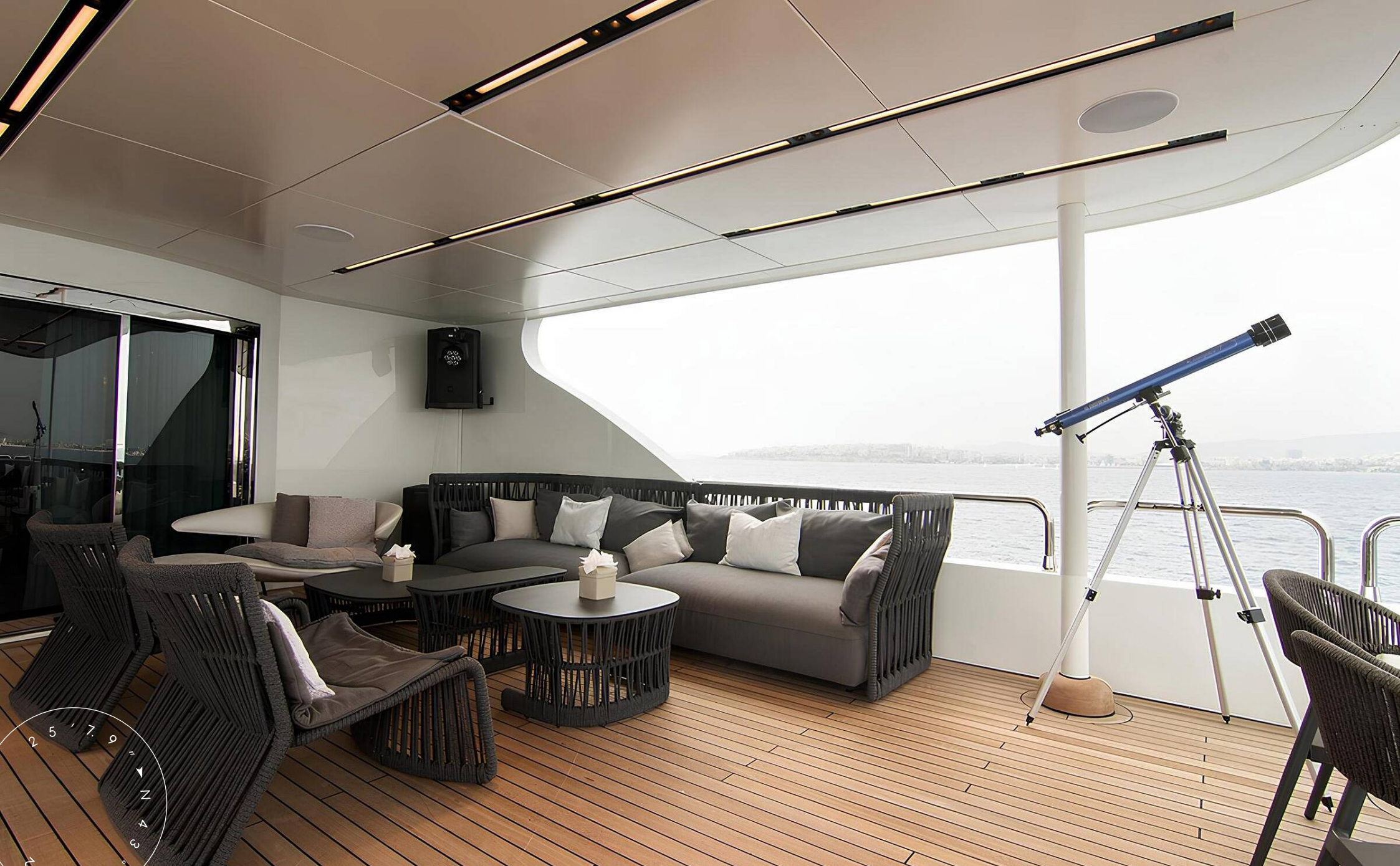
AFT UPPER DECK LOUNGE AREA