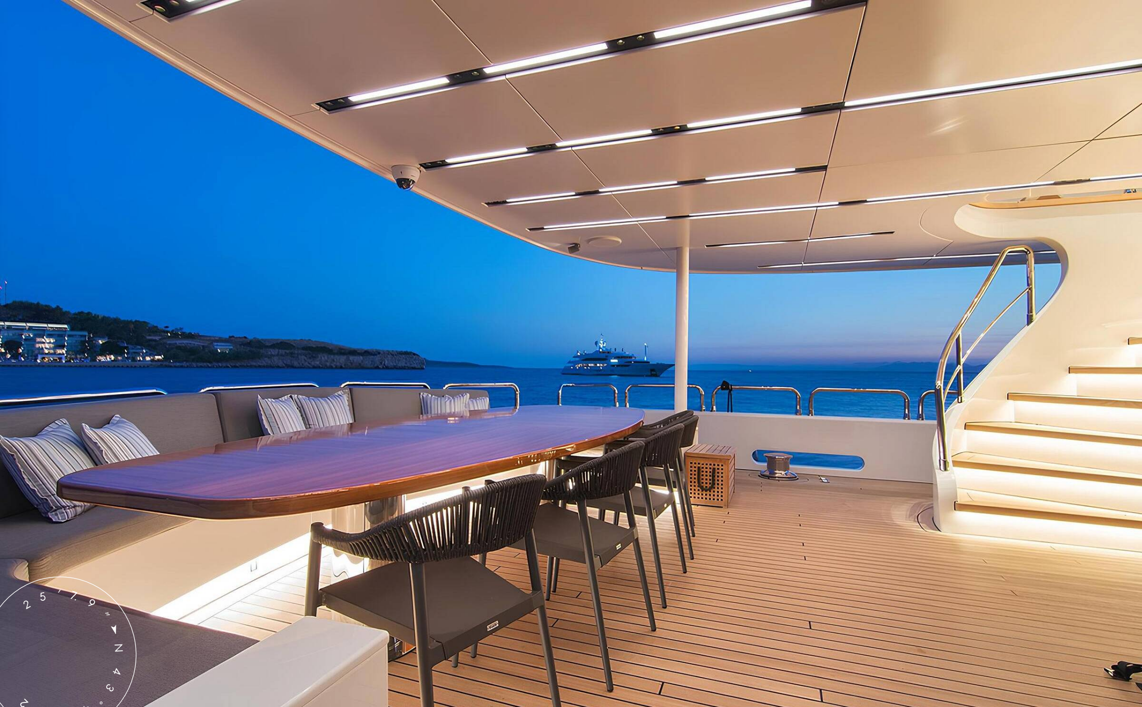
AFT MAIN DECK DINING AREA