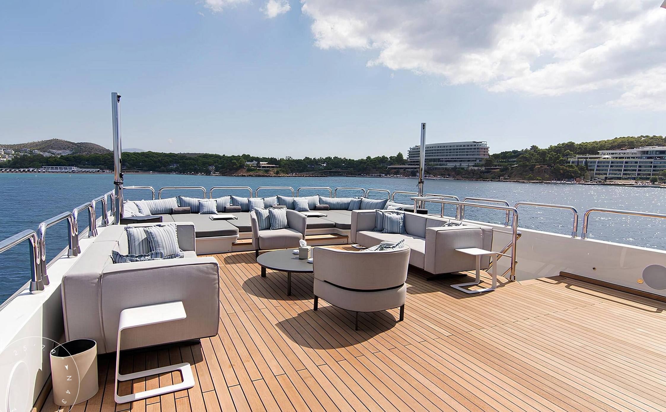
AFT SUNDECK LOUNGE AREA