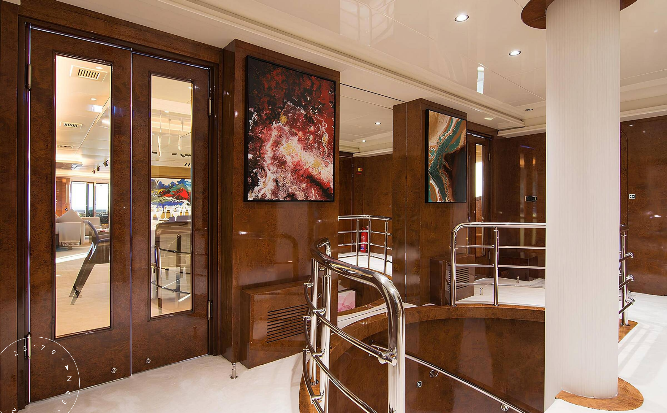
MAIN SALON LOBBY