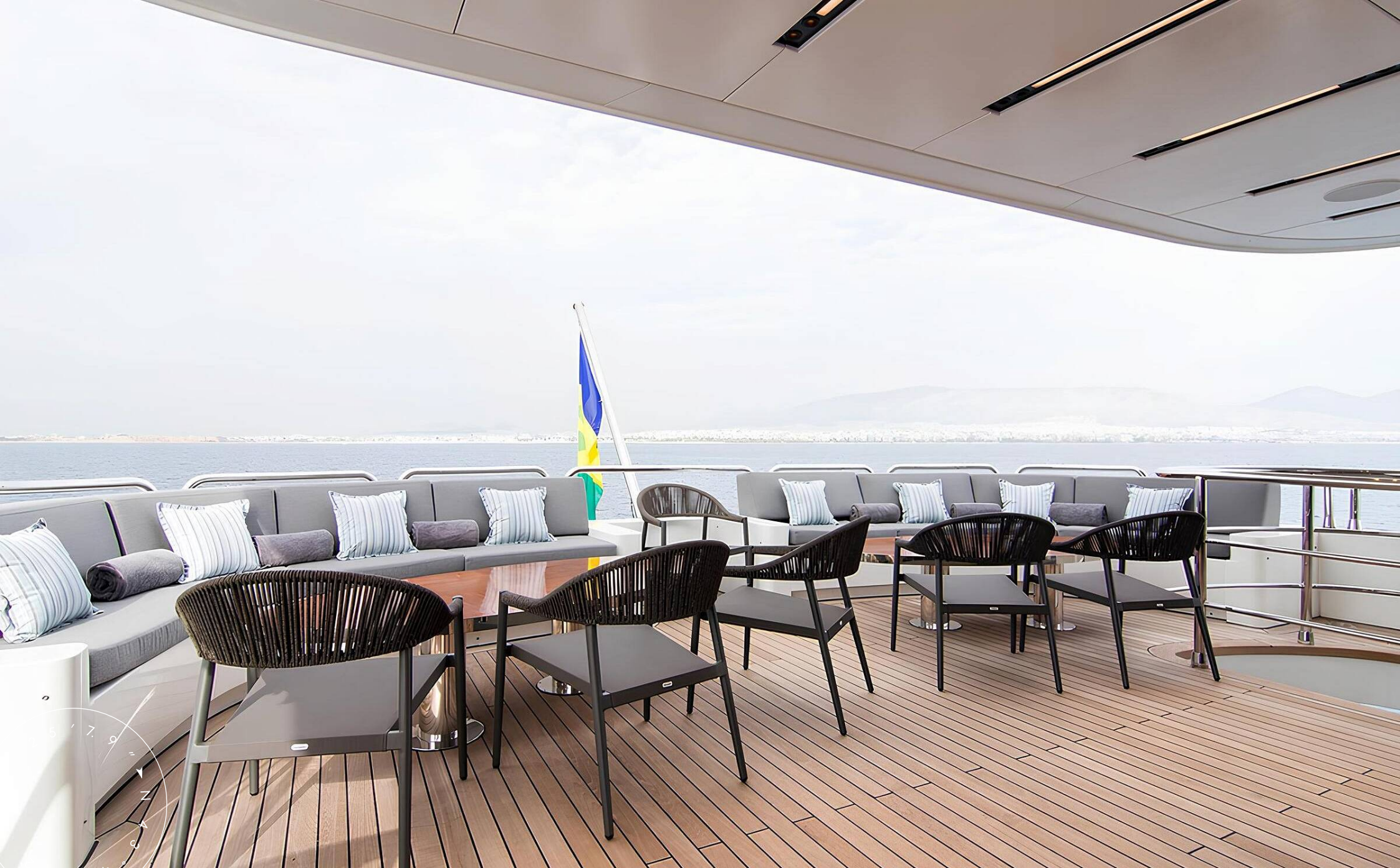
AFT UPPER DECK LOUNGE AREA