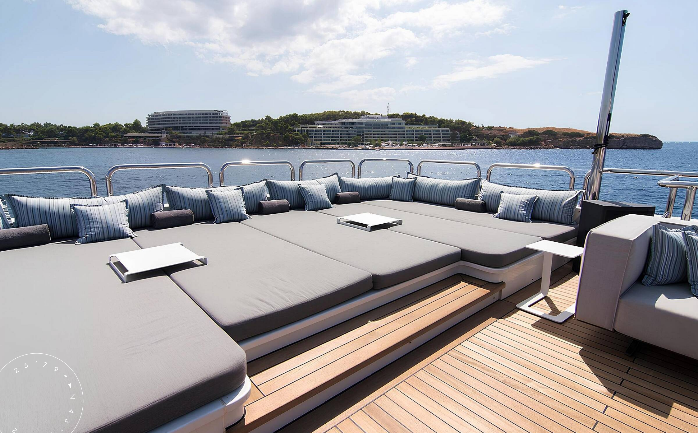
AFT SUNDECK LOUNGE AREA