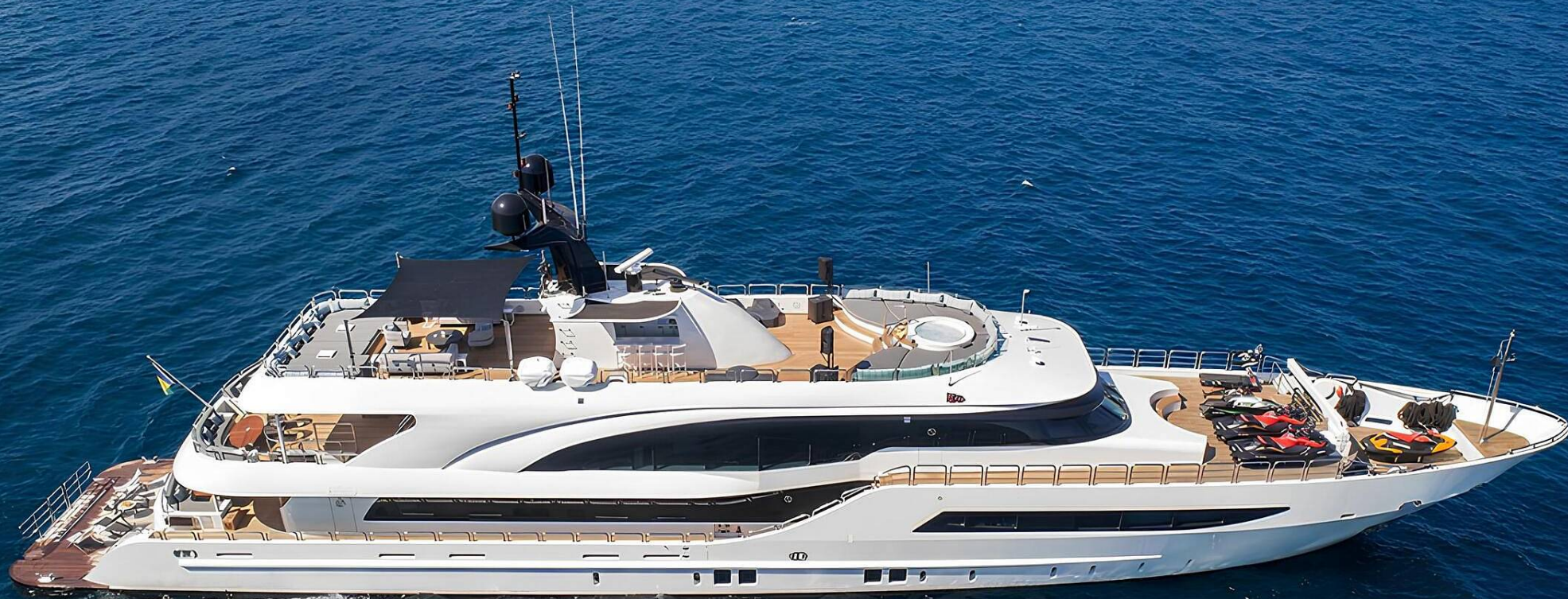
EXTERIOR MISS TOR YACHT 51M 2013 MY HALLO