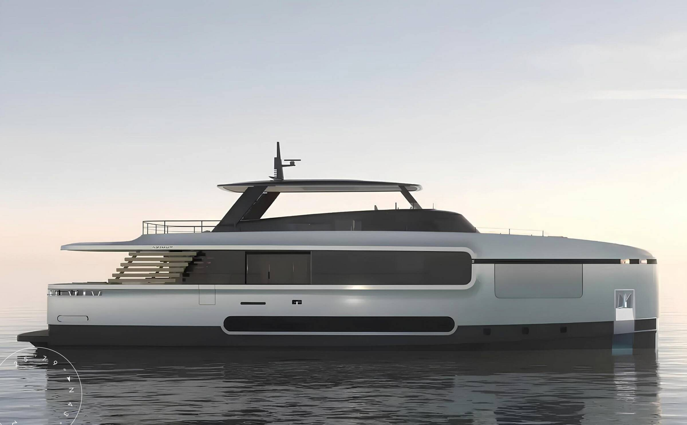
EXTERIOR AZIMUT MAGELLANO 27M