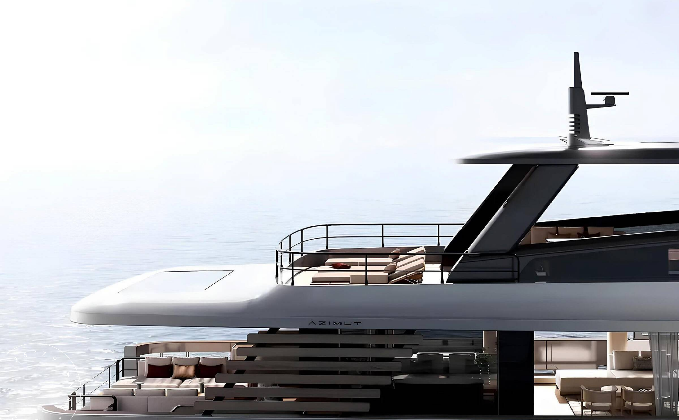
EXTERIOR AZIMUT MAGELLANO 27M