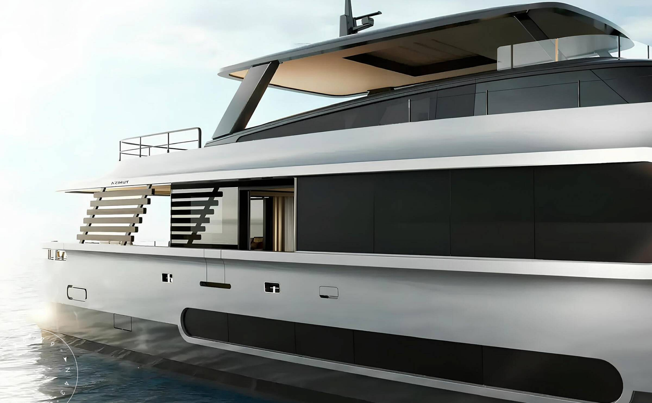
EXTERIOR AZIMUT MAGELLANO 27M