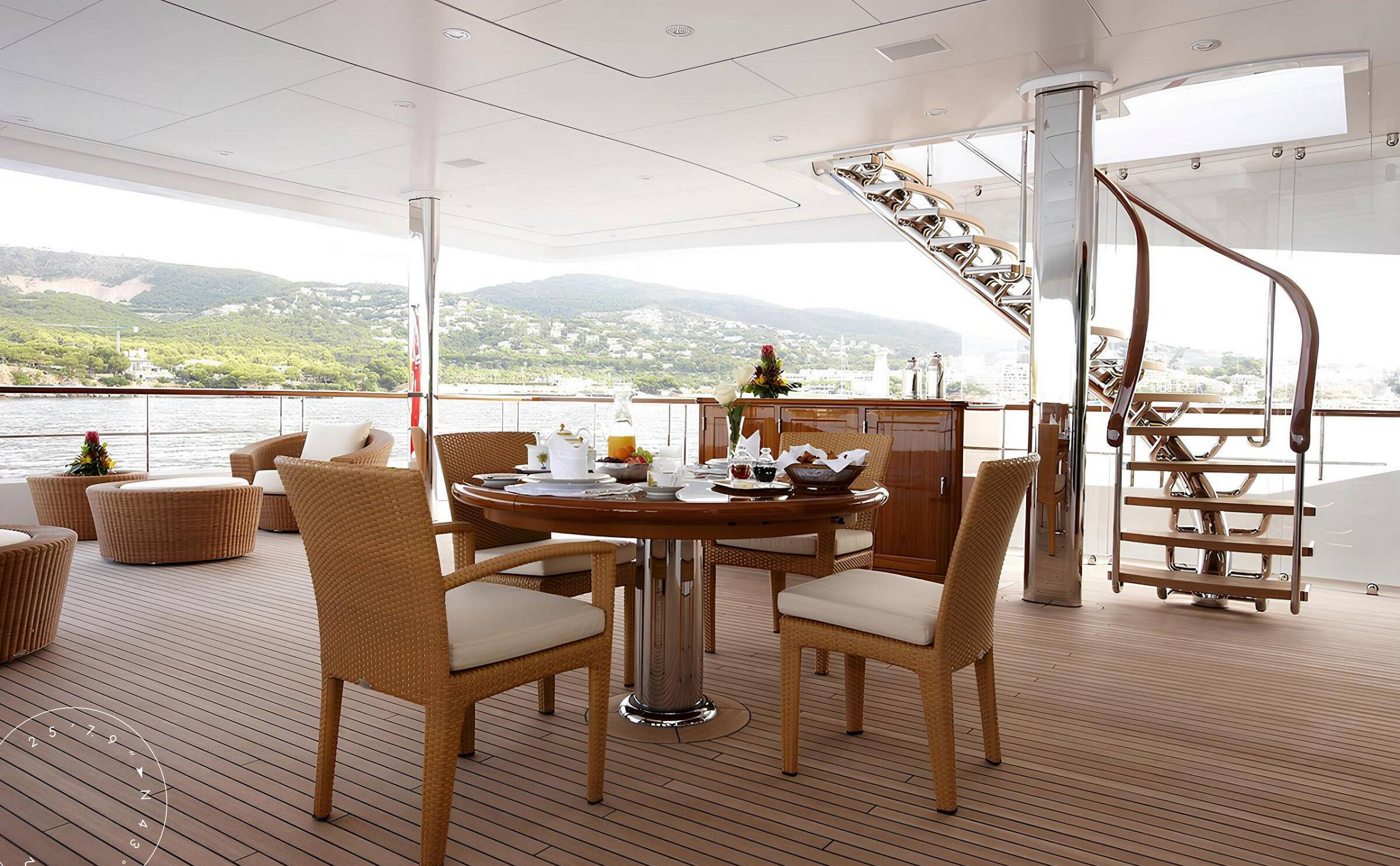
AFT UPPER DECK LOUNGE AREA