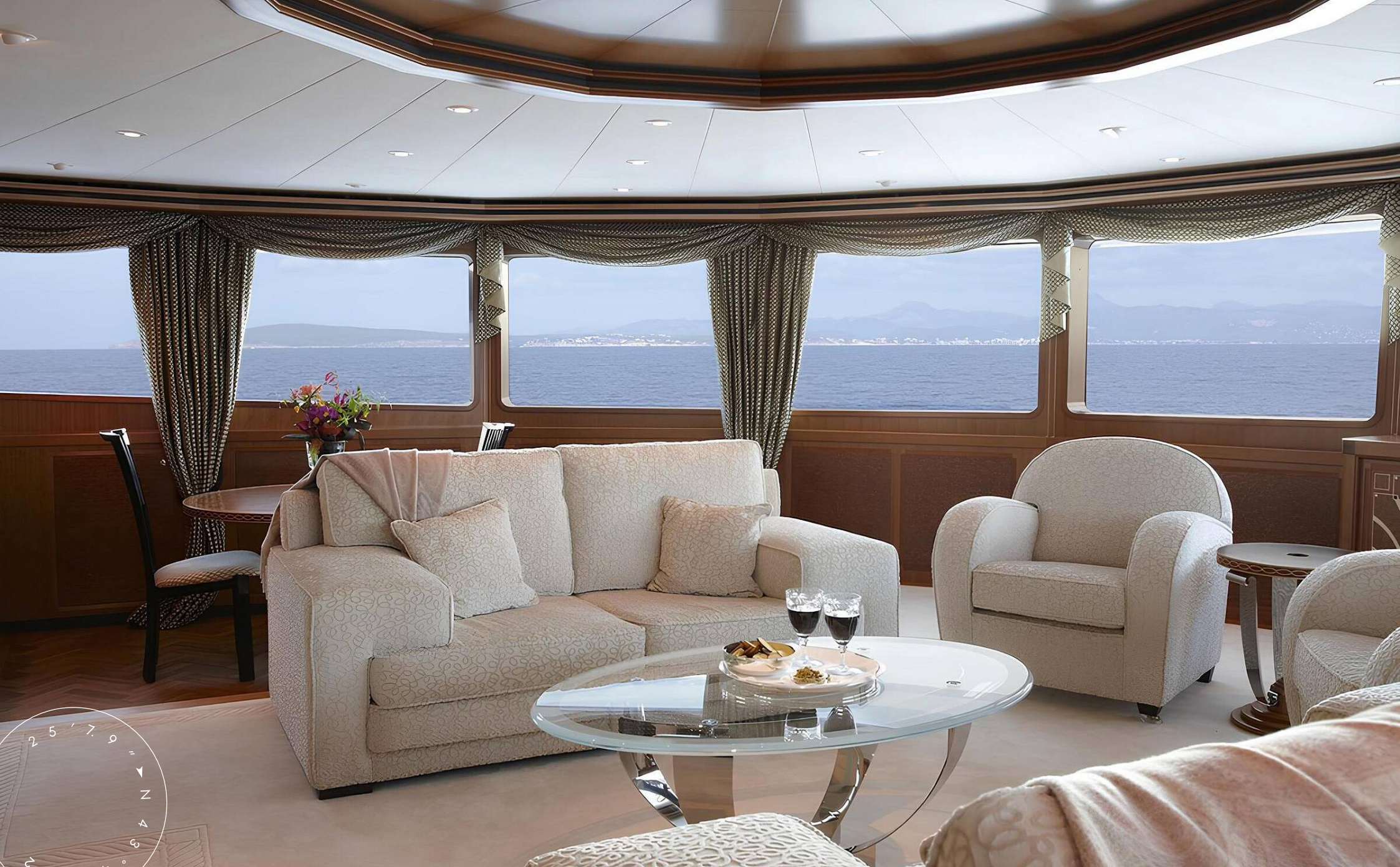
UPPER DECK SALOON