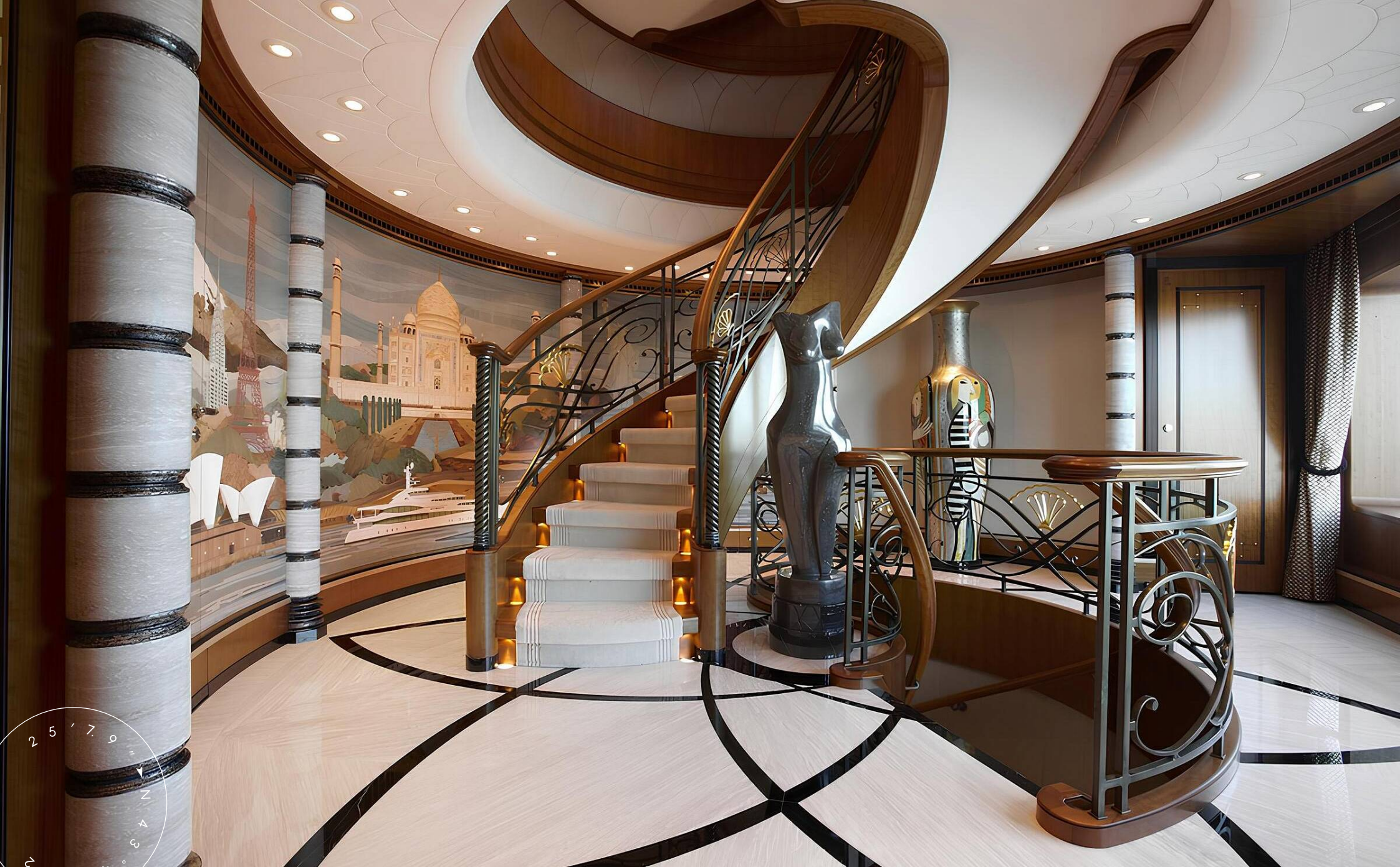
MAIN SALON LOBBY