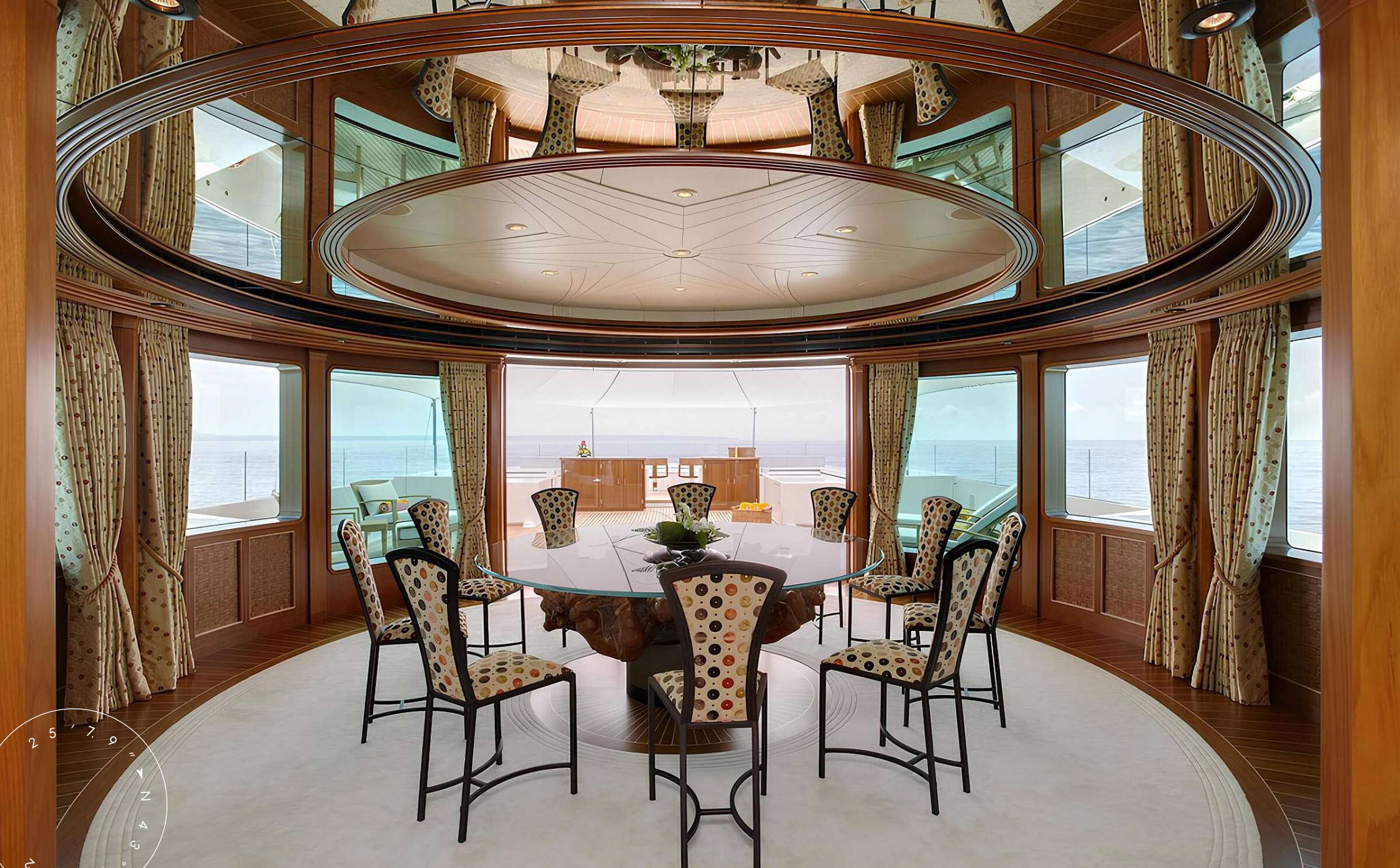
SUNDECK DINING AREA