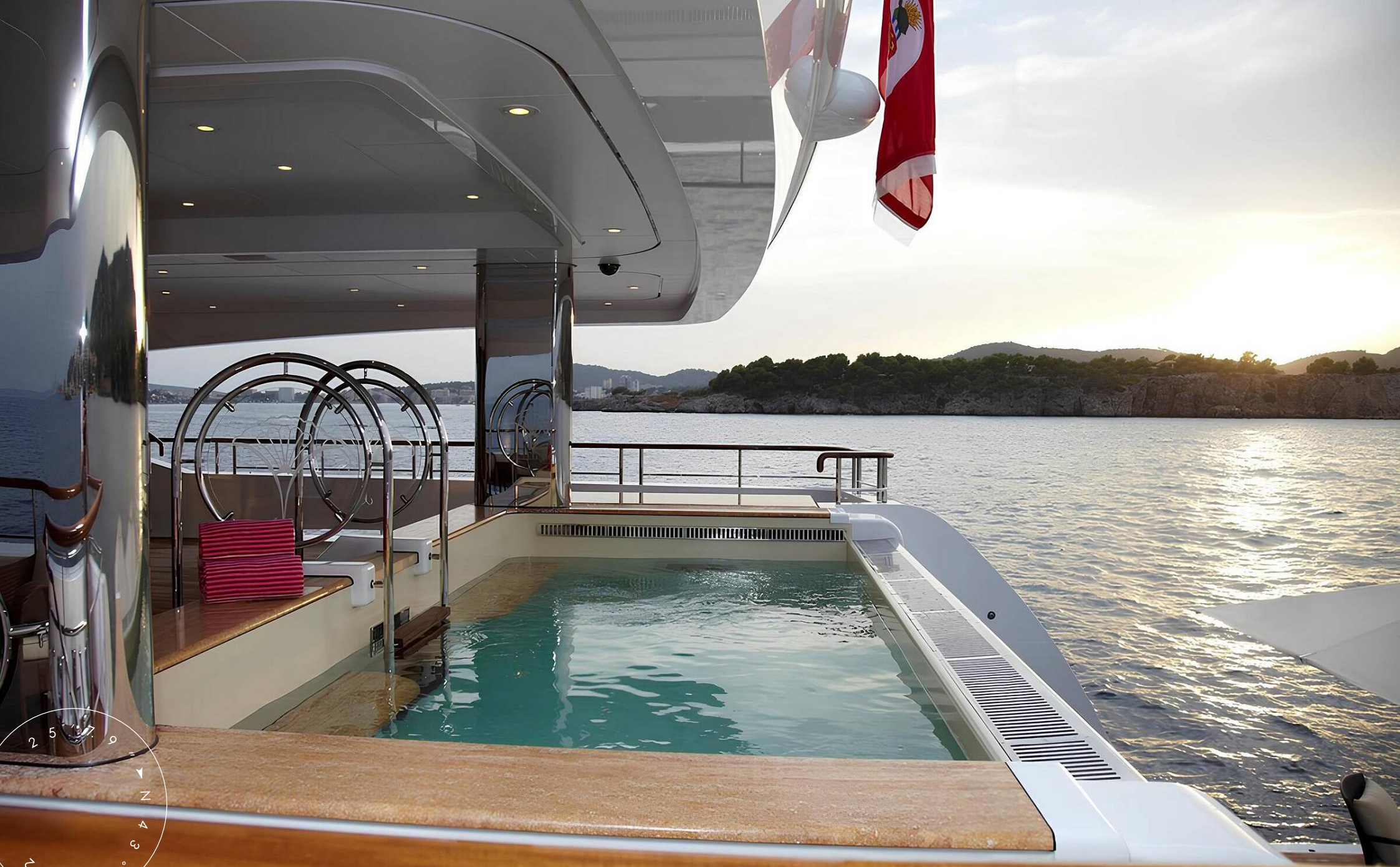
AFT MAIN DECK JACUZZI