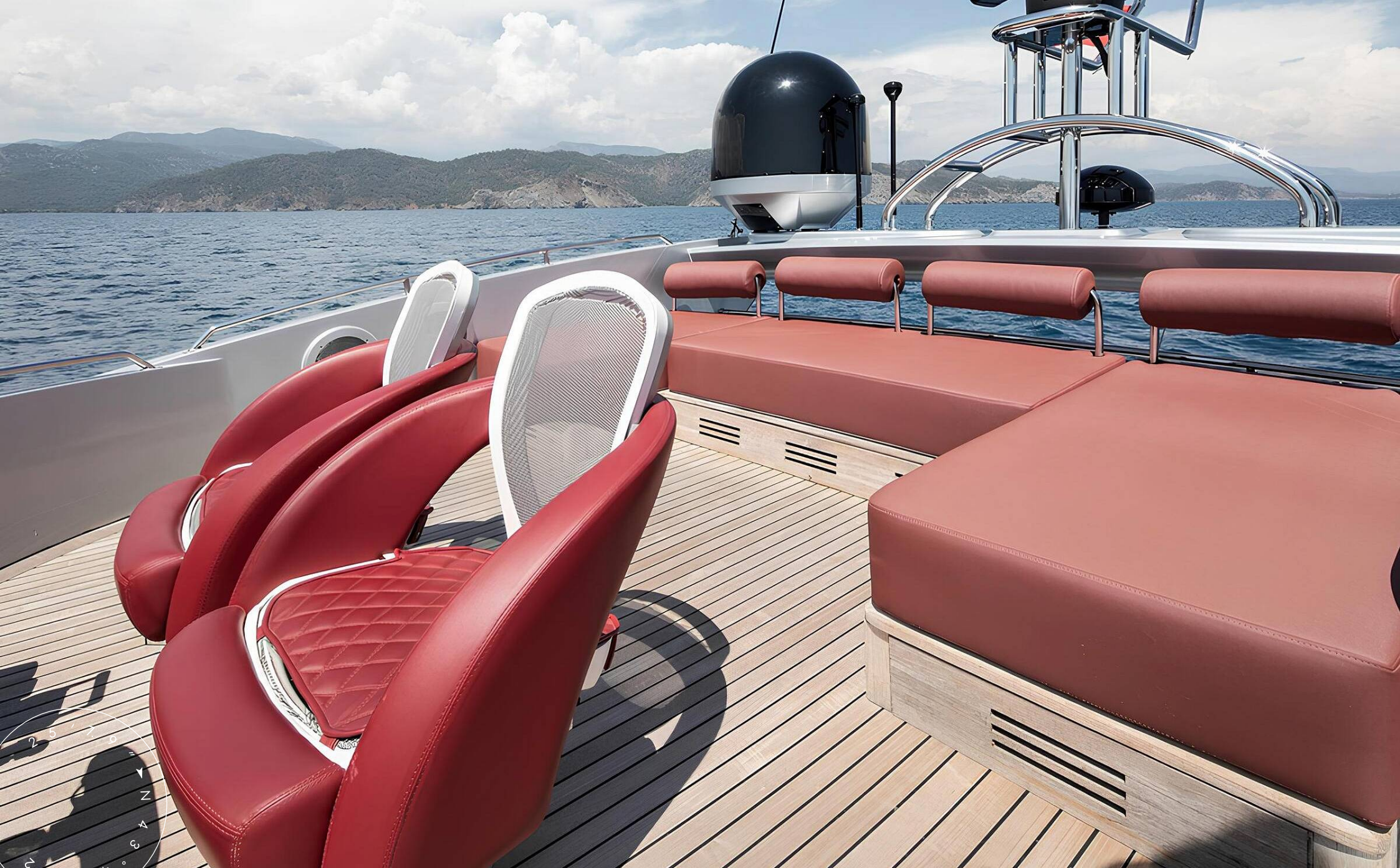
SECOND HELM STATION