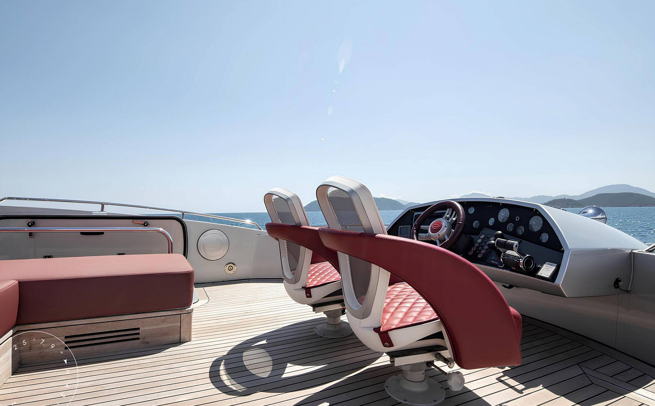
SECOND HELM STATION