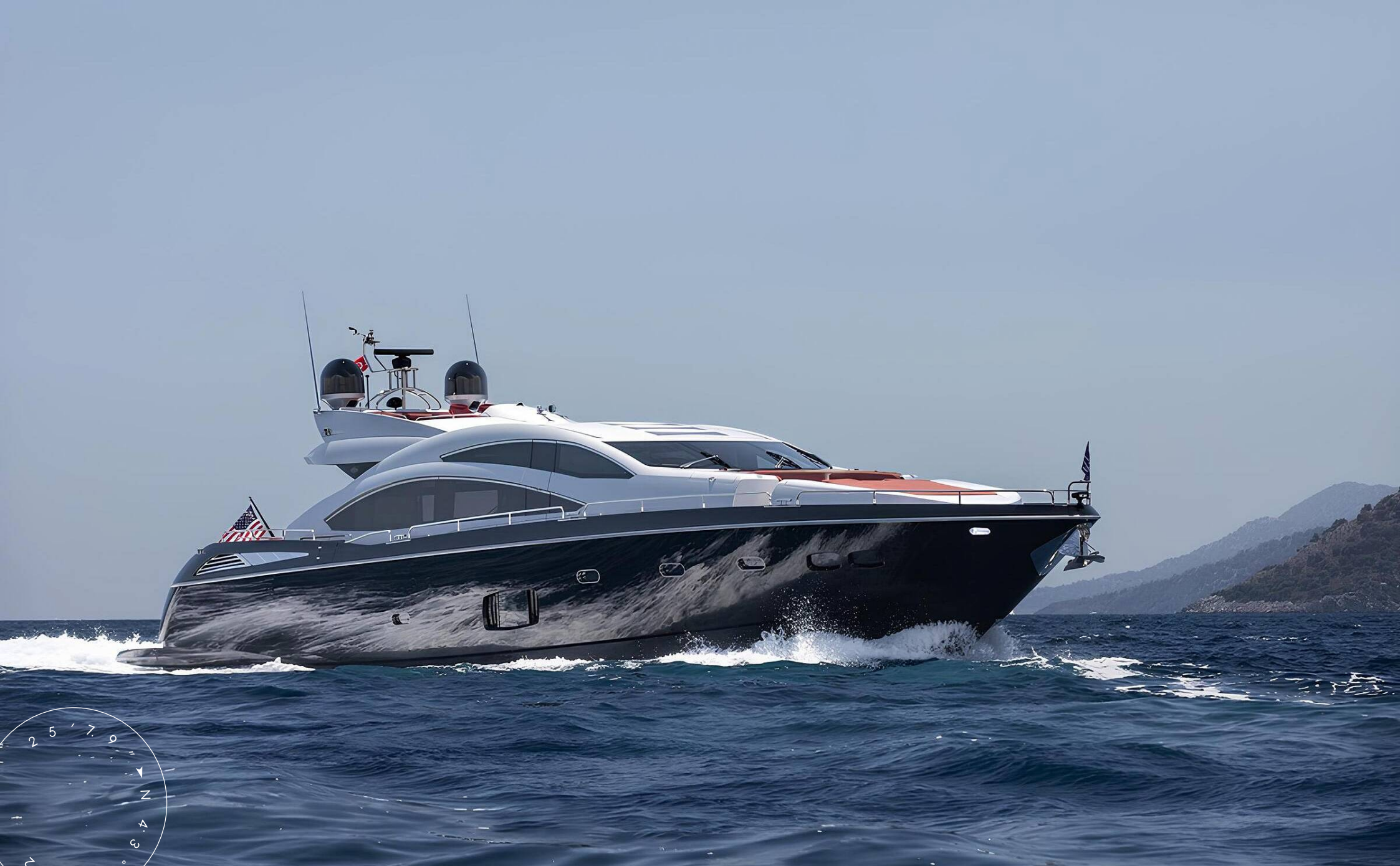
EXTERIOR SUNSEEKER PREDATOR 84 2009 MY AMARA