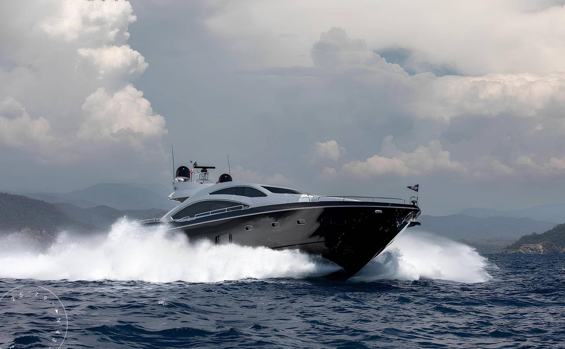
EXTERIOR SUNSEEKER PREDATOR 84 2009 MY AMARA