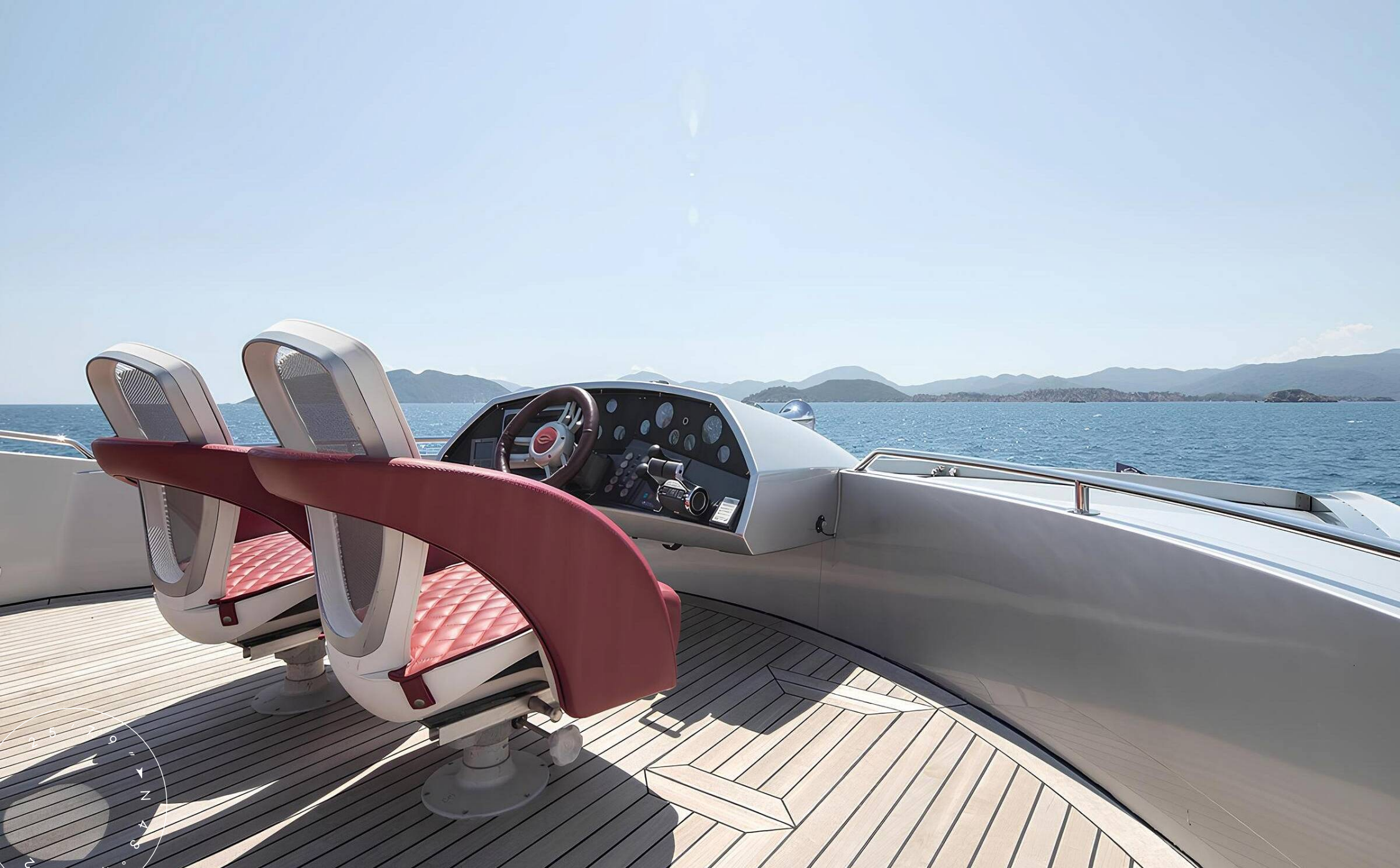
SECOND HELM STATION