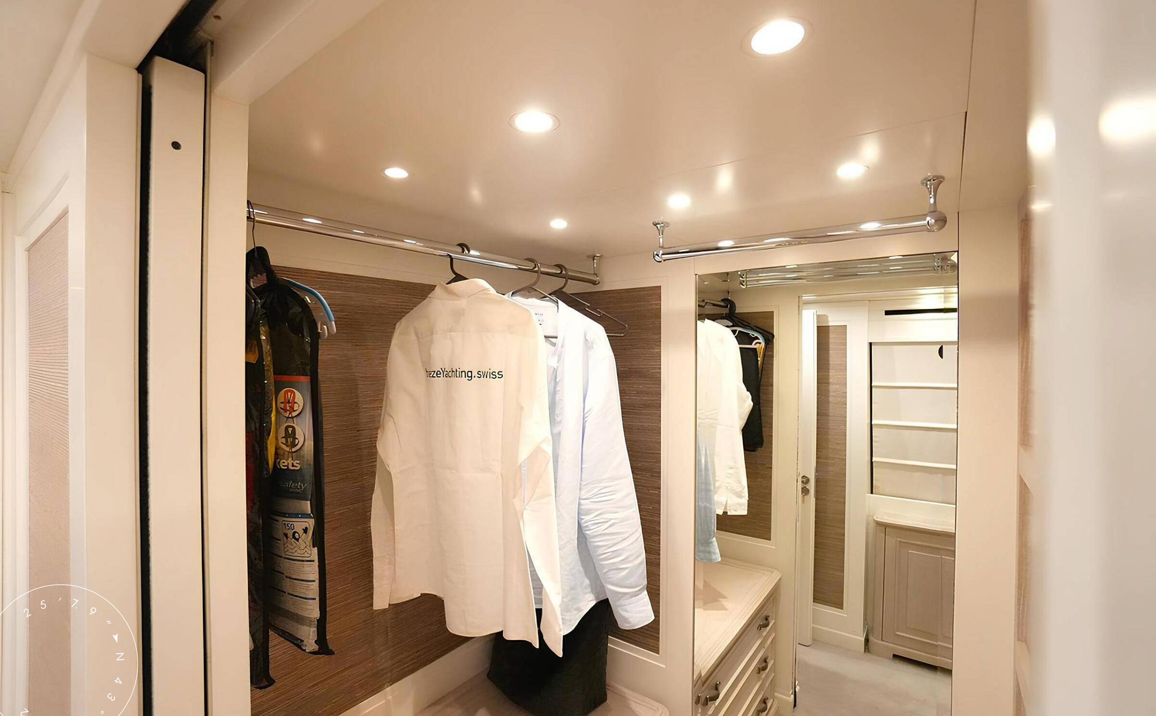
MASTER CABIN DRESSING ROOM