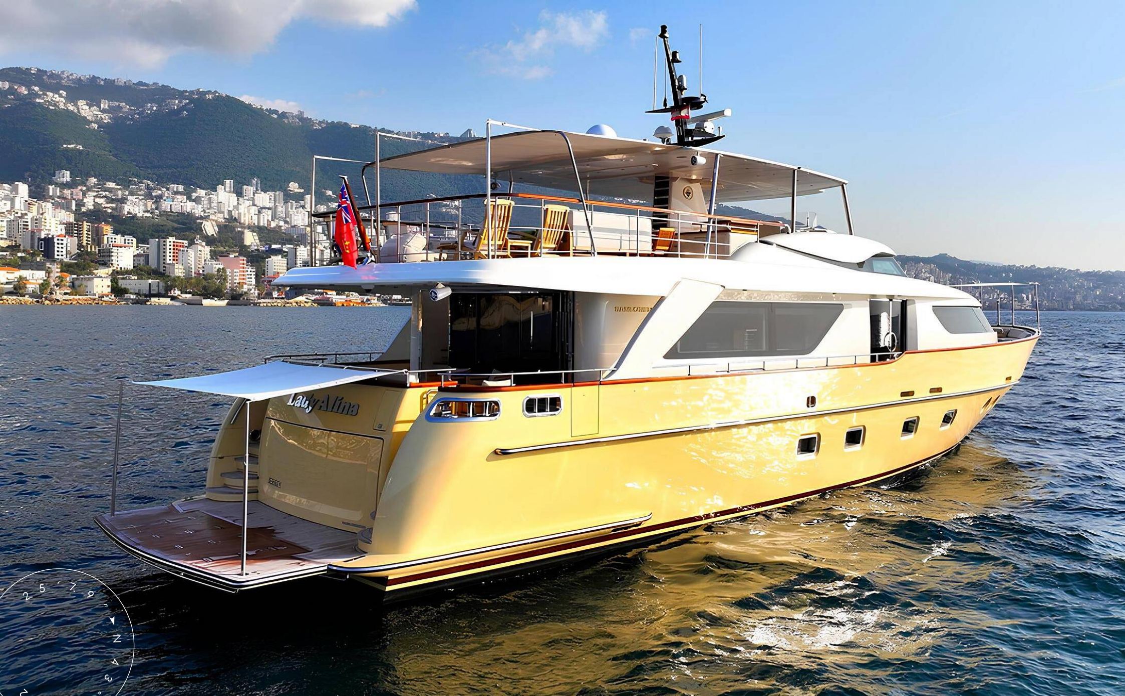
EXTERIOR SANLORENZO SD92 2011 MY LADY ALINA