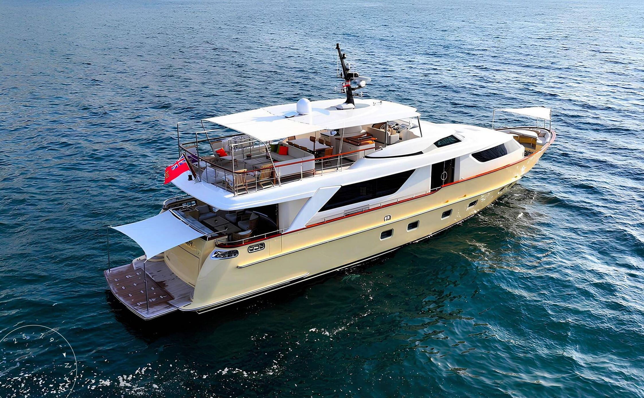
EXTERIOR SANLORENZO SD92 2011 MY LADY ALINA