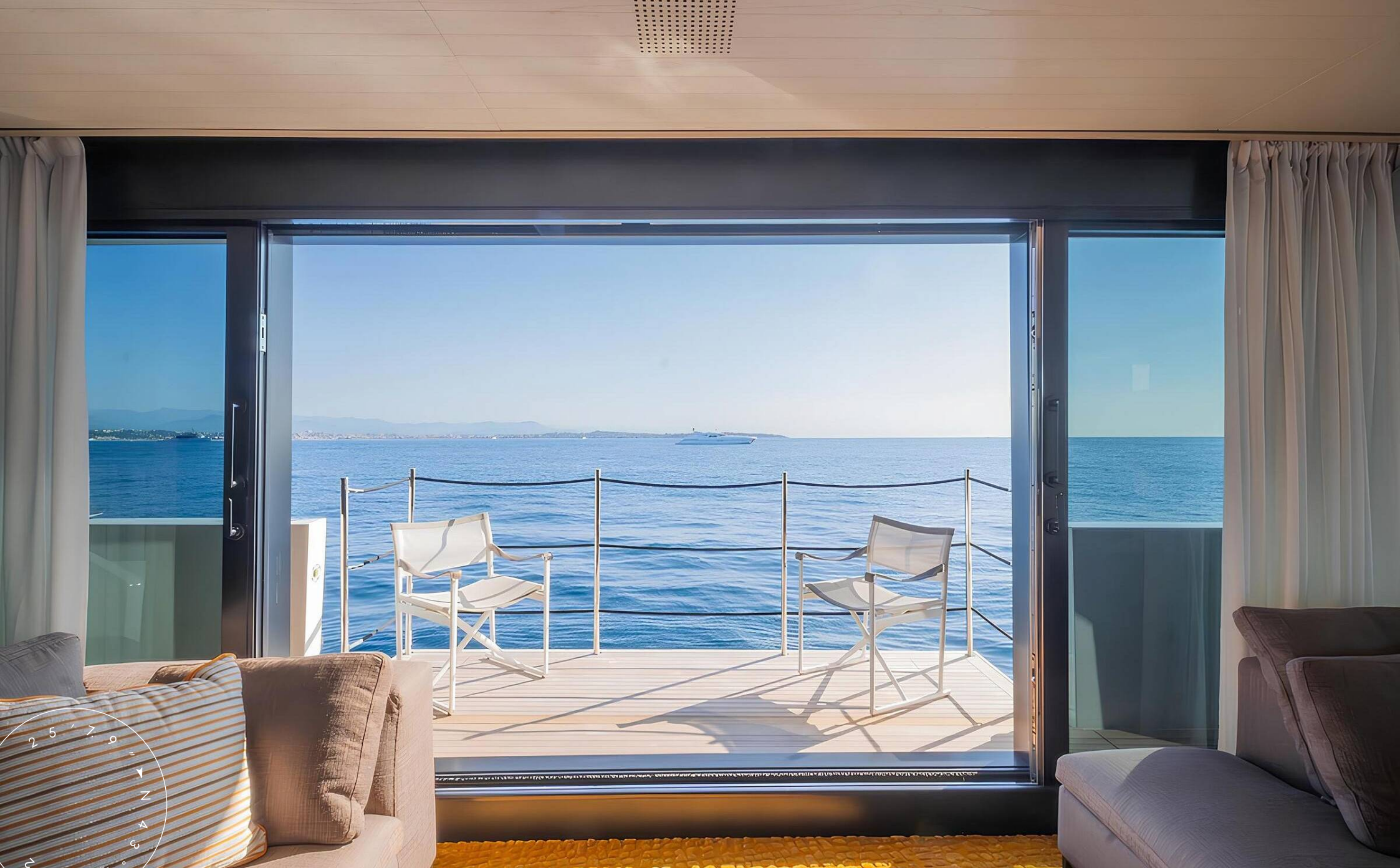
FOLDING STARBOARD BALCONY