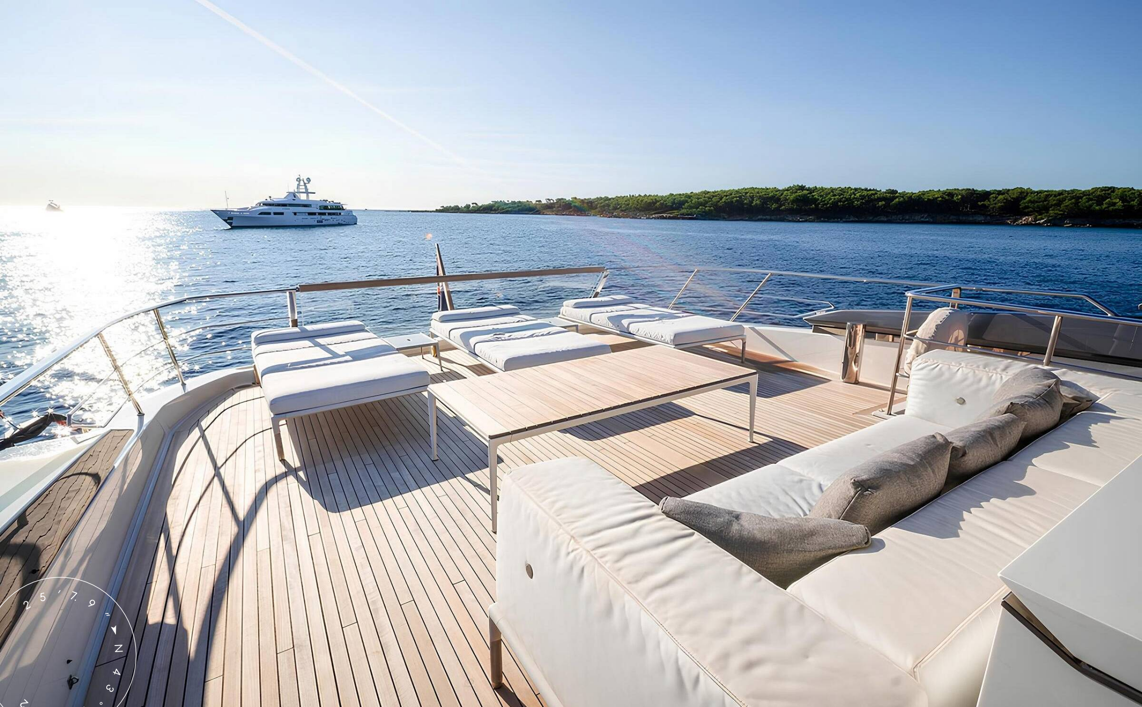
FLYBRIDGE AFT SUNBATHING AREA