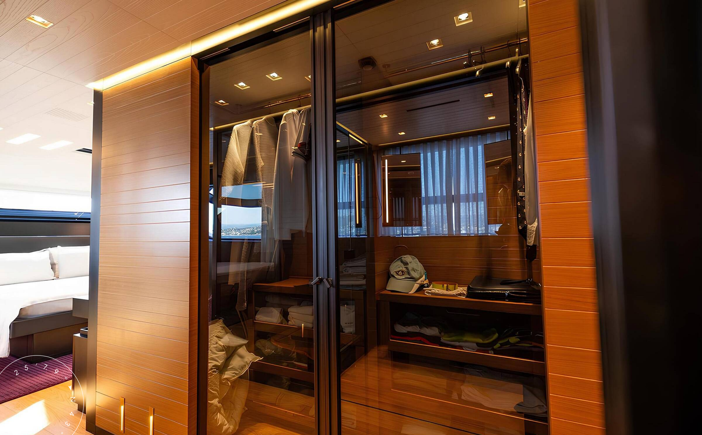
MASTER CABIN DRESSING ROOM