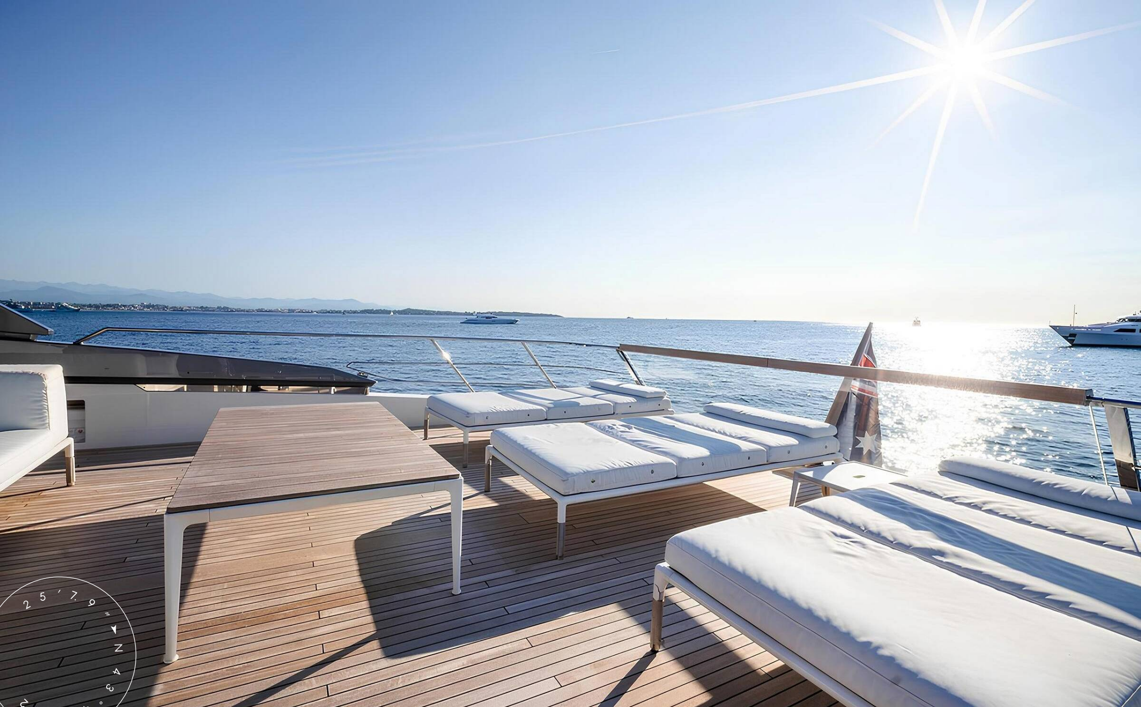
FLYBRIDGE AFT SUNBATHING AREA