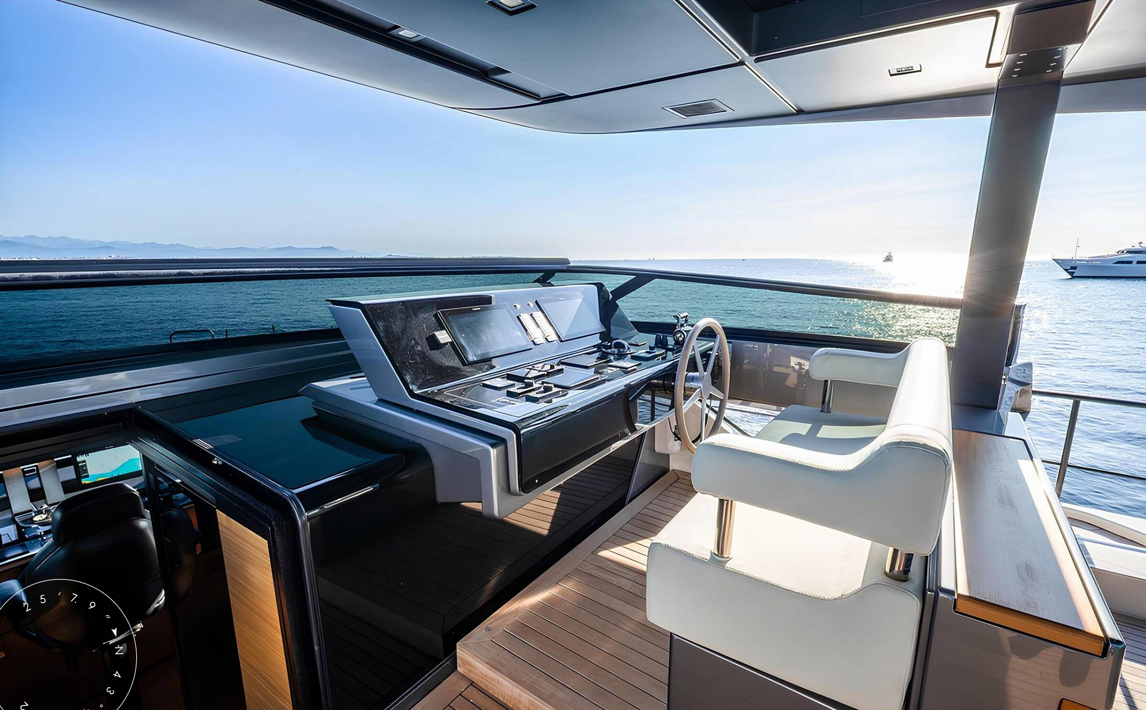
SECOND HELM STATION