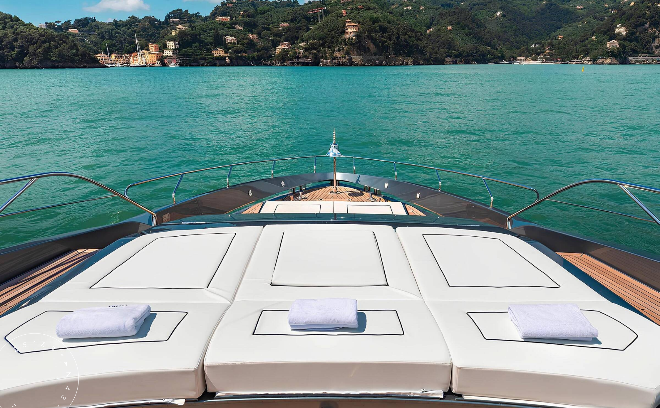
BOW SUNBATHING AREA