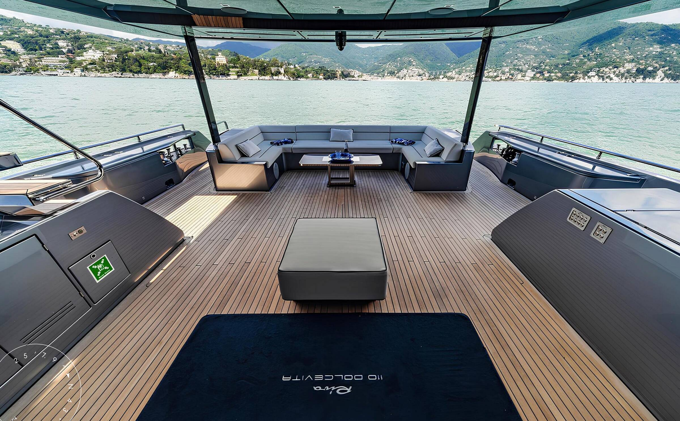
COCKPIT SEATING AREA