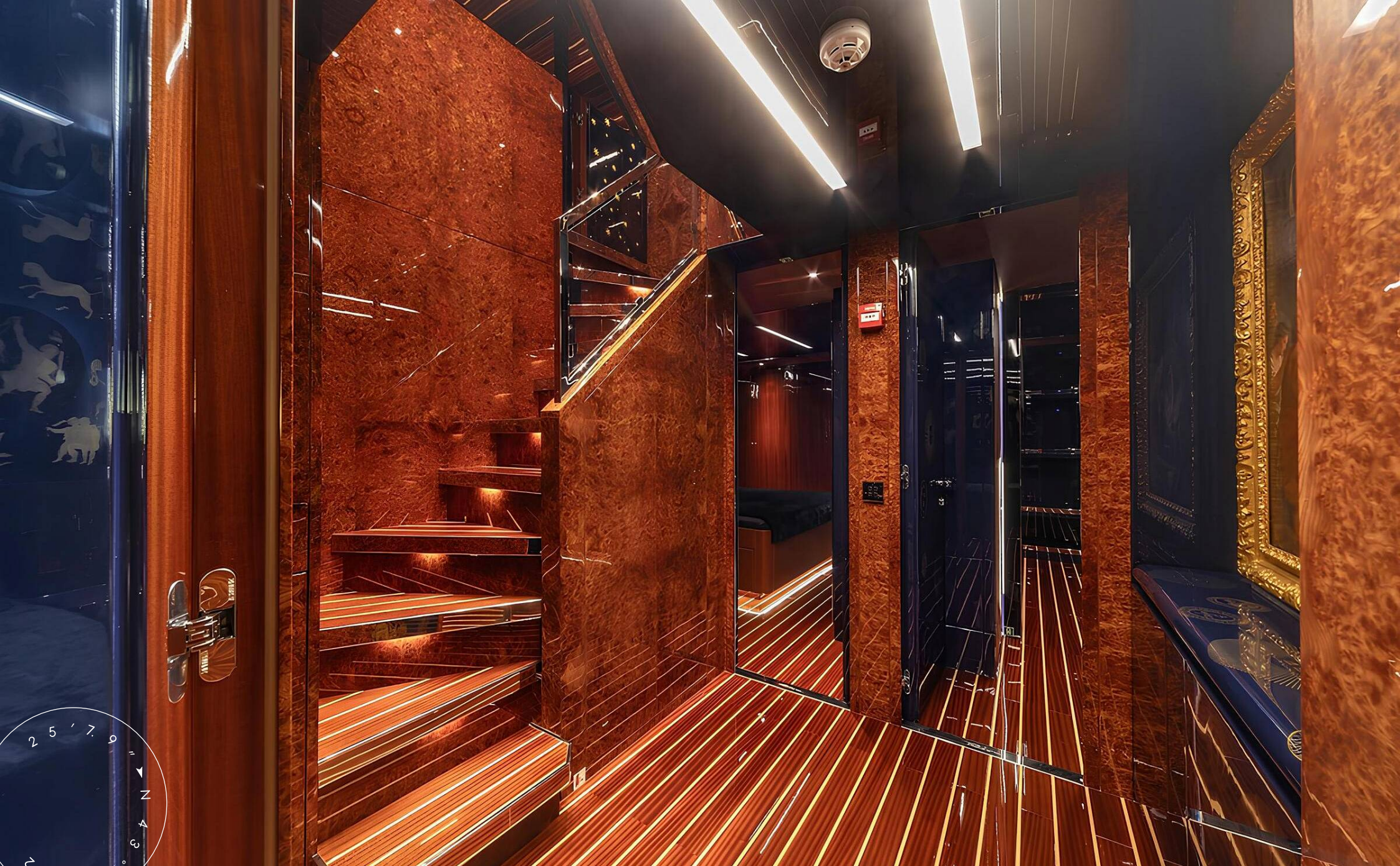
STAIRS FROM MD TO LD