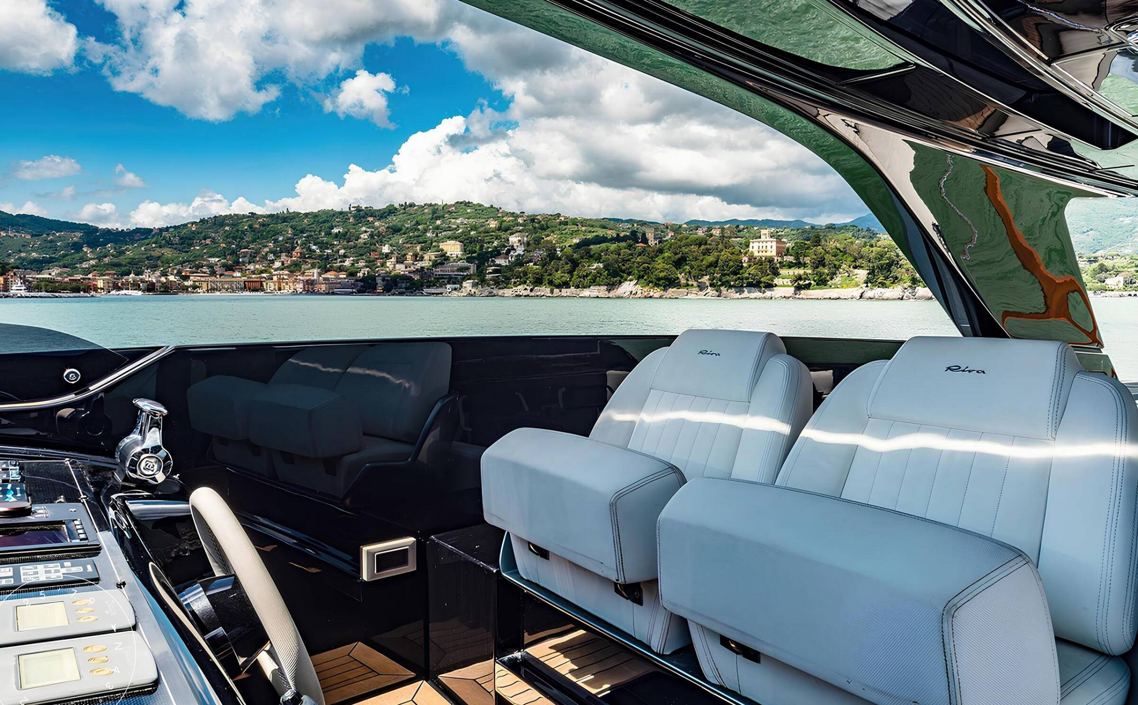
SECOND HELM STATION