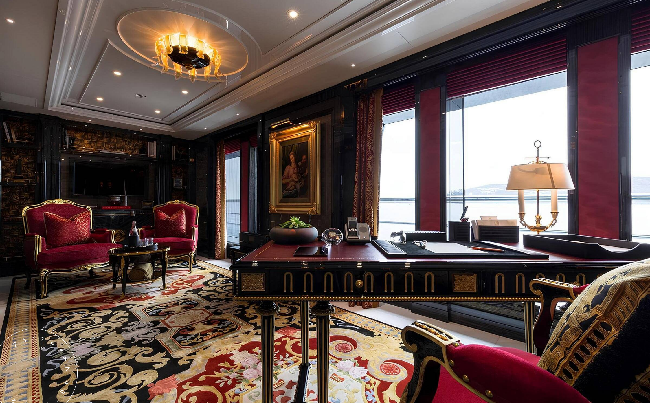
OFFICE IN THE MASTER CABIN