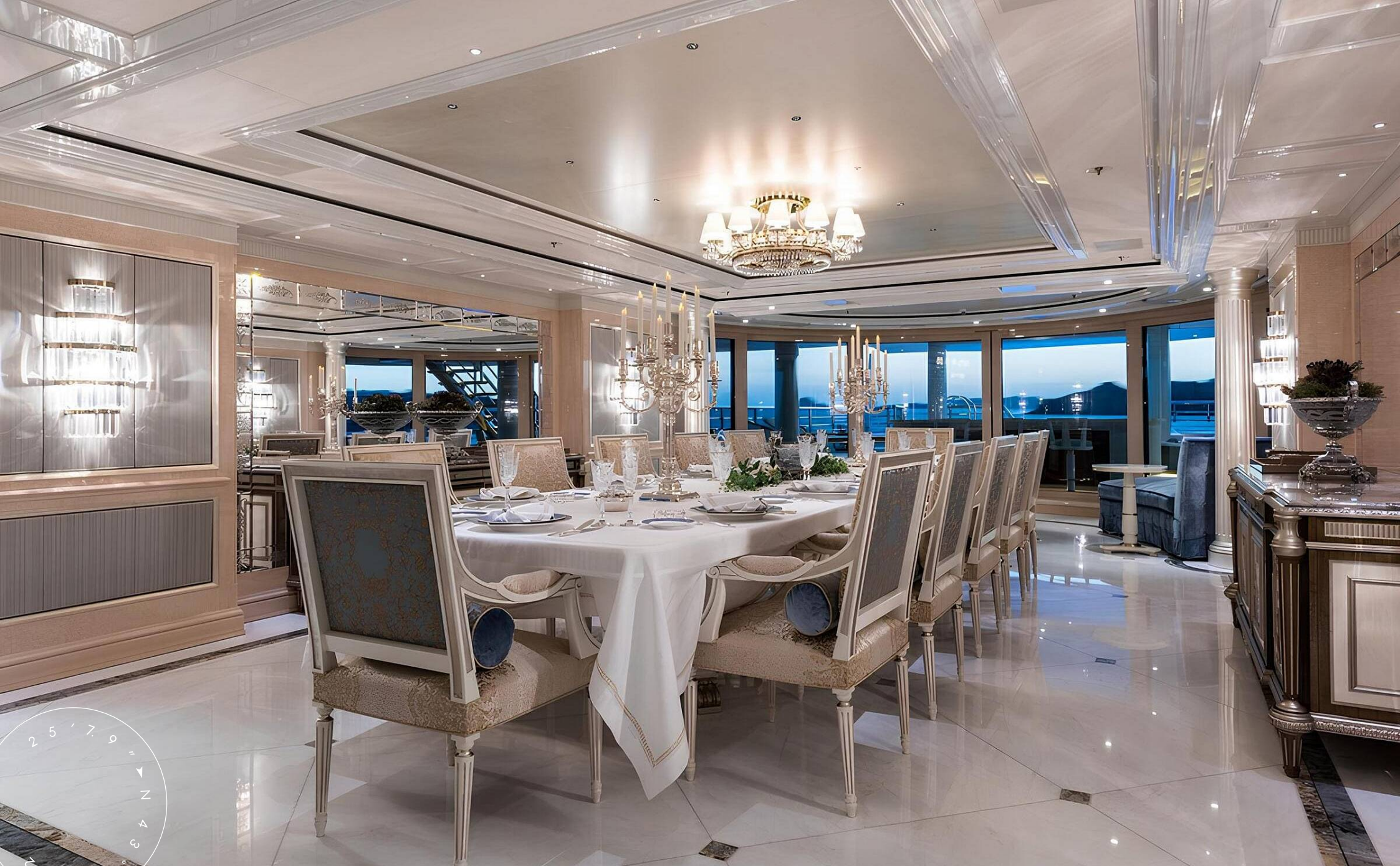
MAIN SALON DINING AREA