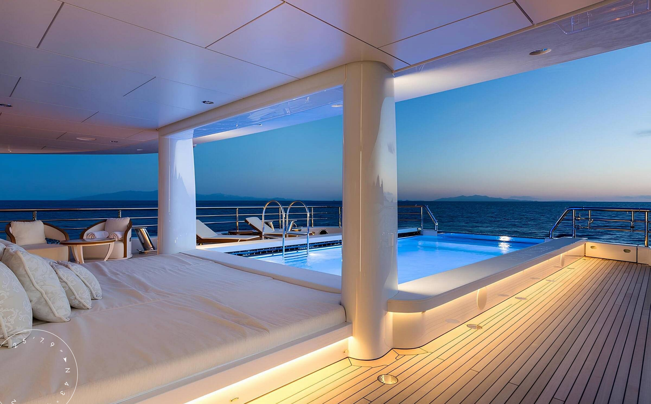
AFT MAIN DECK LOUNGE AREA