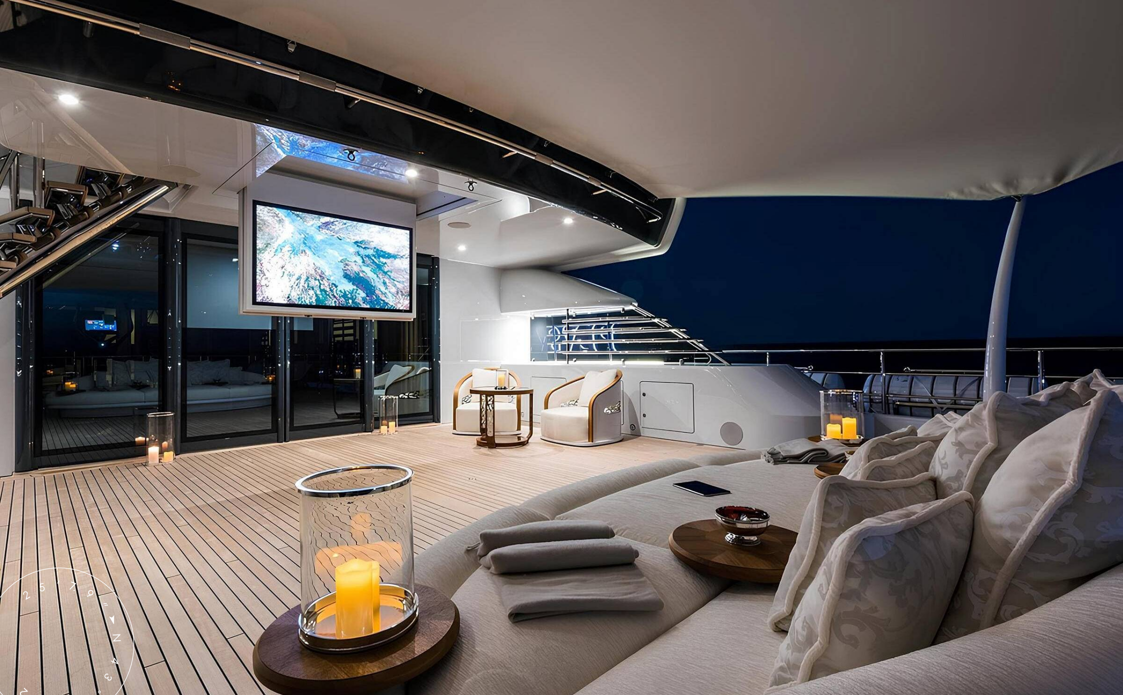
SUNDECK LOUNGE AREA