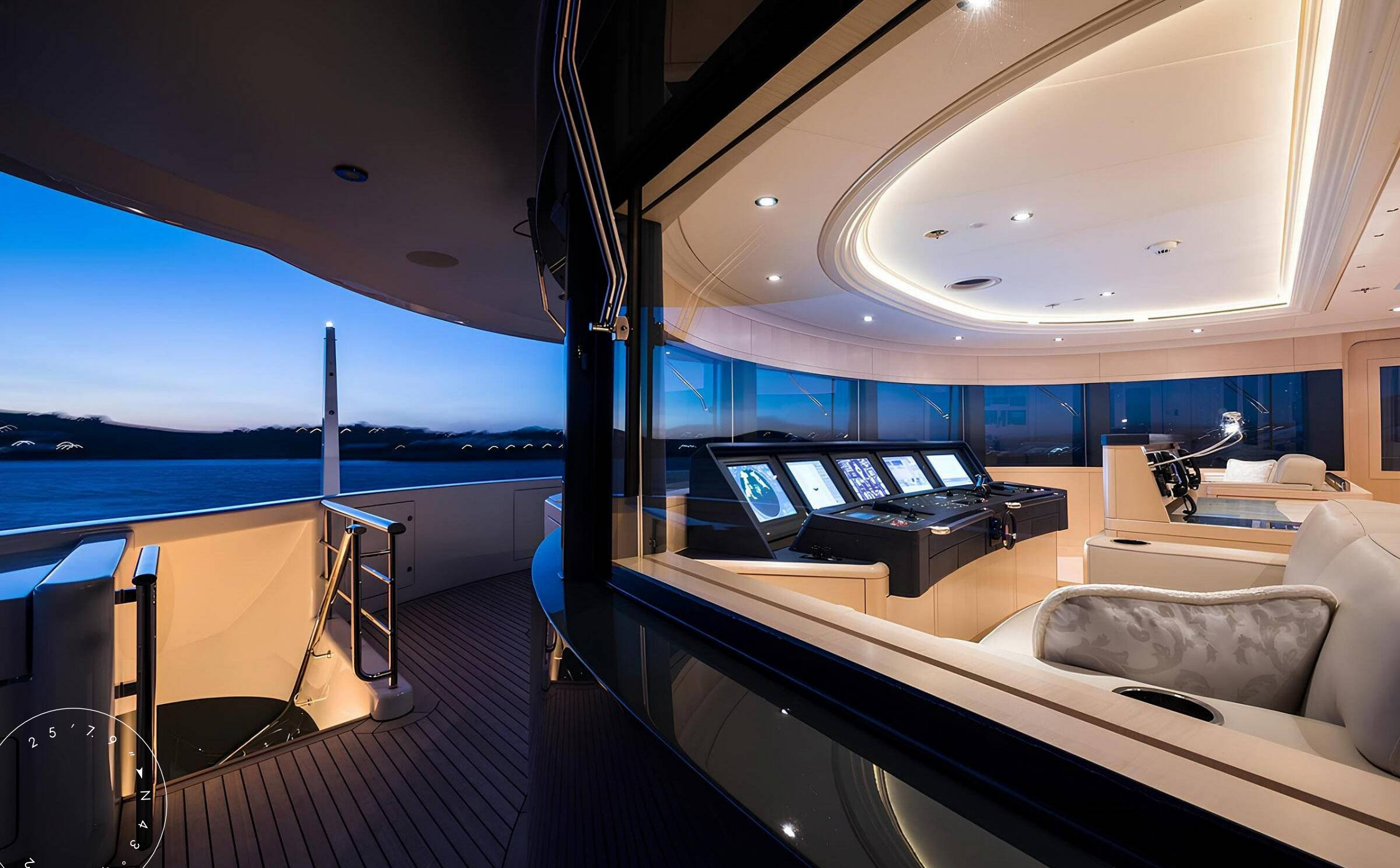
MAIN HELM STATION