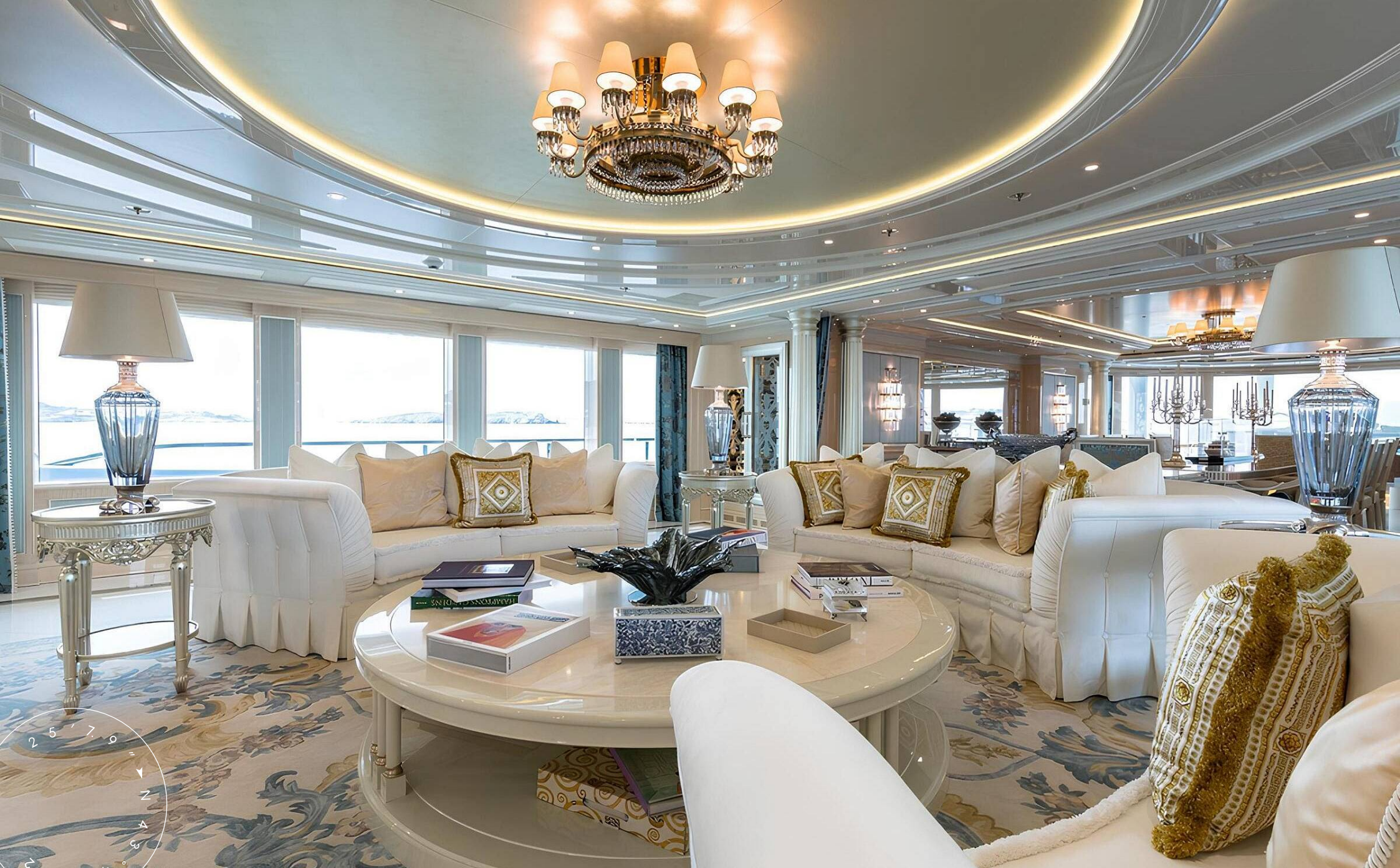
MAIN SALON LOUNGE AREA