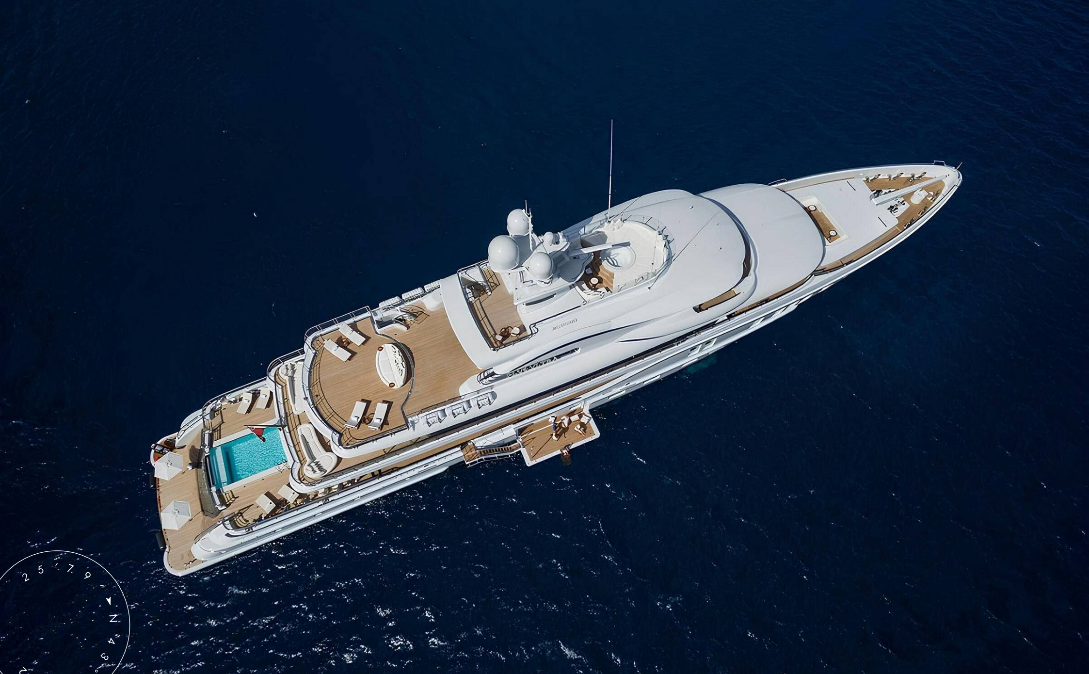
EXTERIOR AMELS 74M 2016 MY PLVS VLTRA