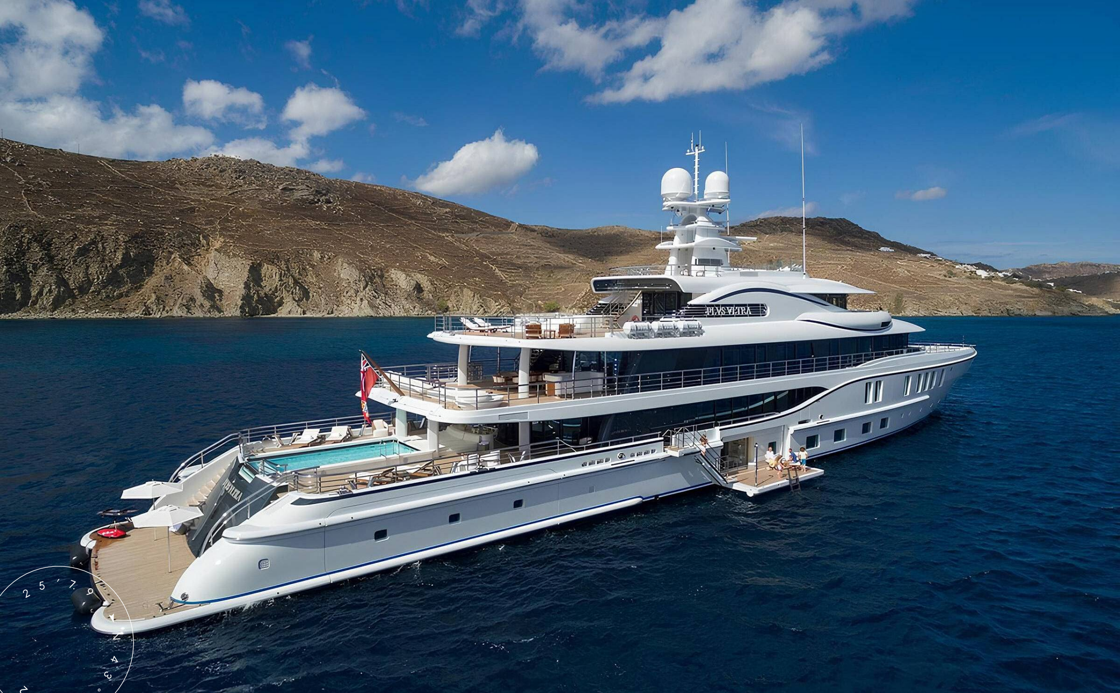
EXTERIOR AMELS 74M 2016 MY PLVS VLTRA