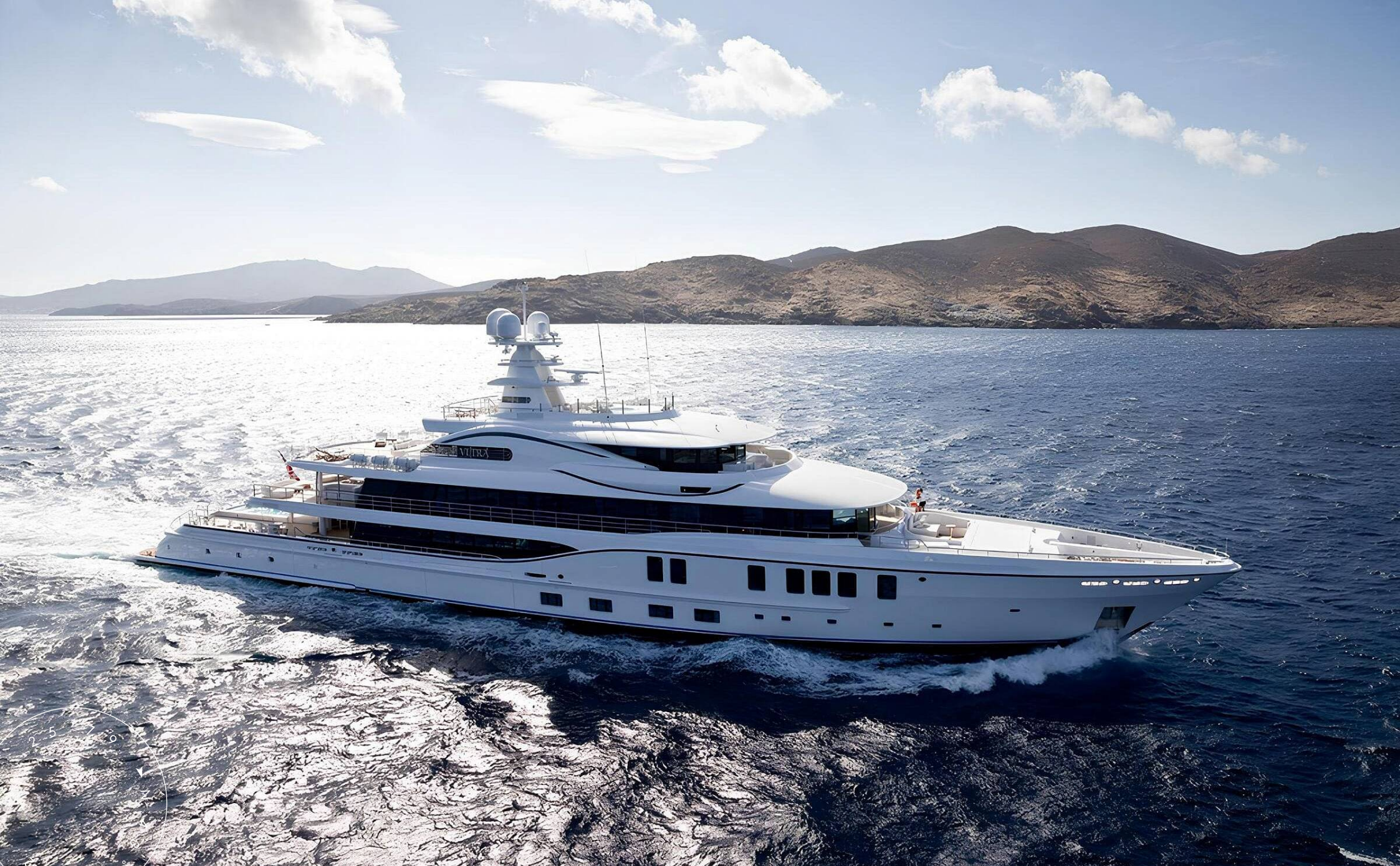
EXTERIOR AMELS 74M 2016 MY PLVS VLTRA