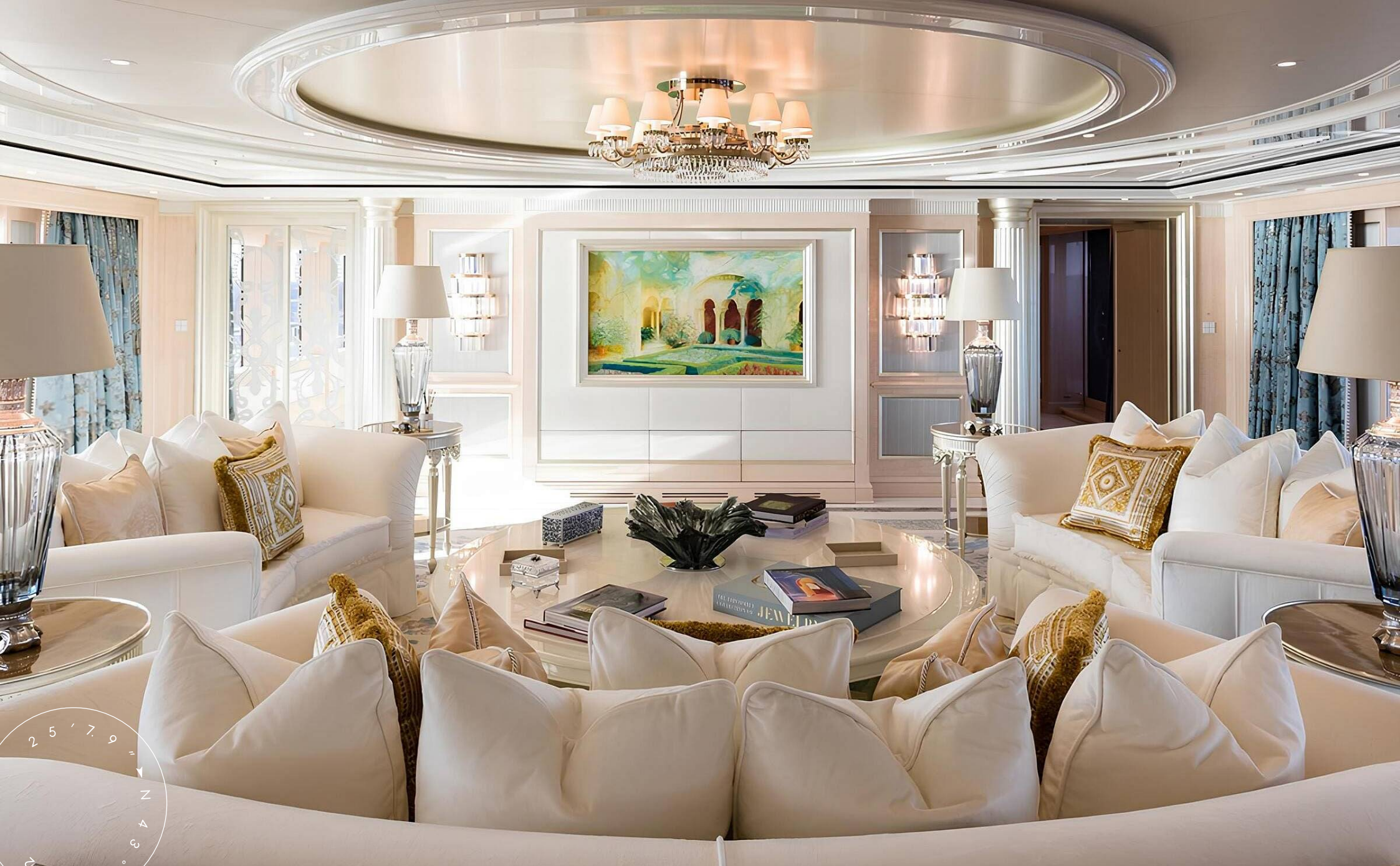
MAIN SALON LOUNGE AREA