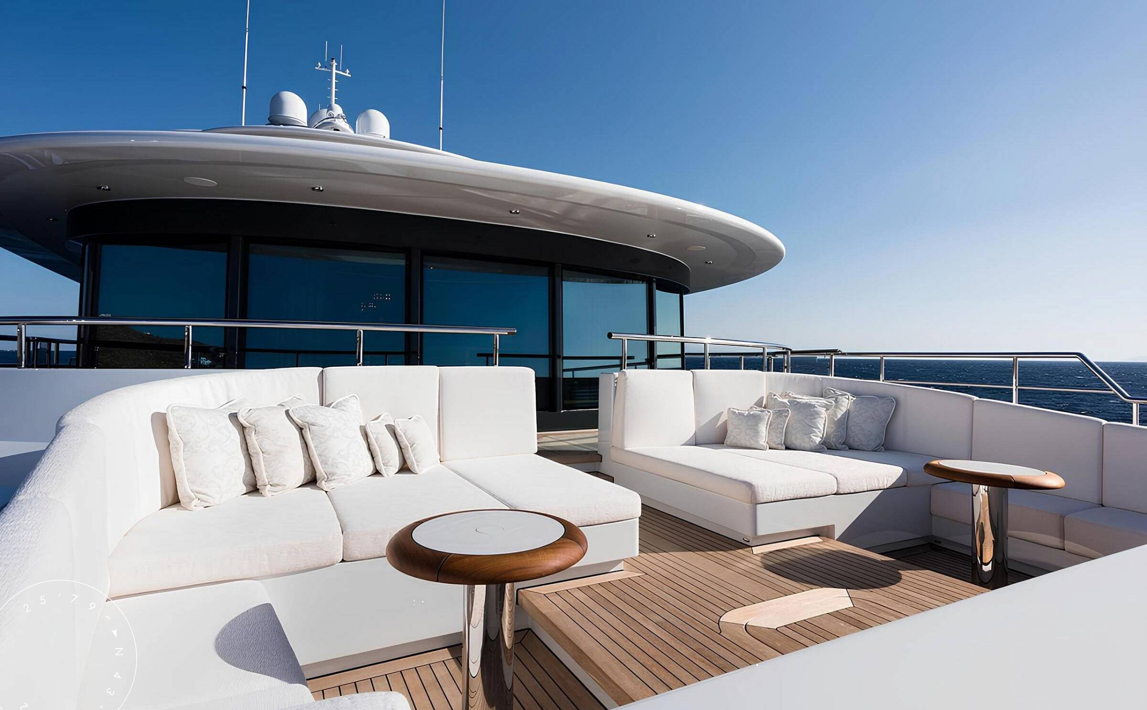
BOW LOUNGE AREA