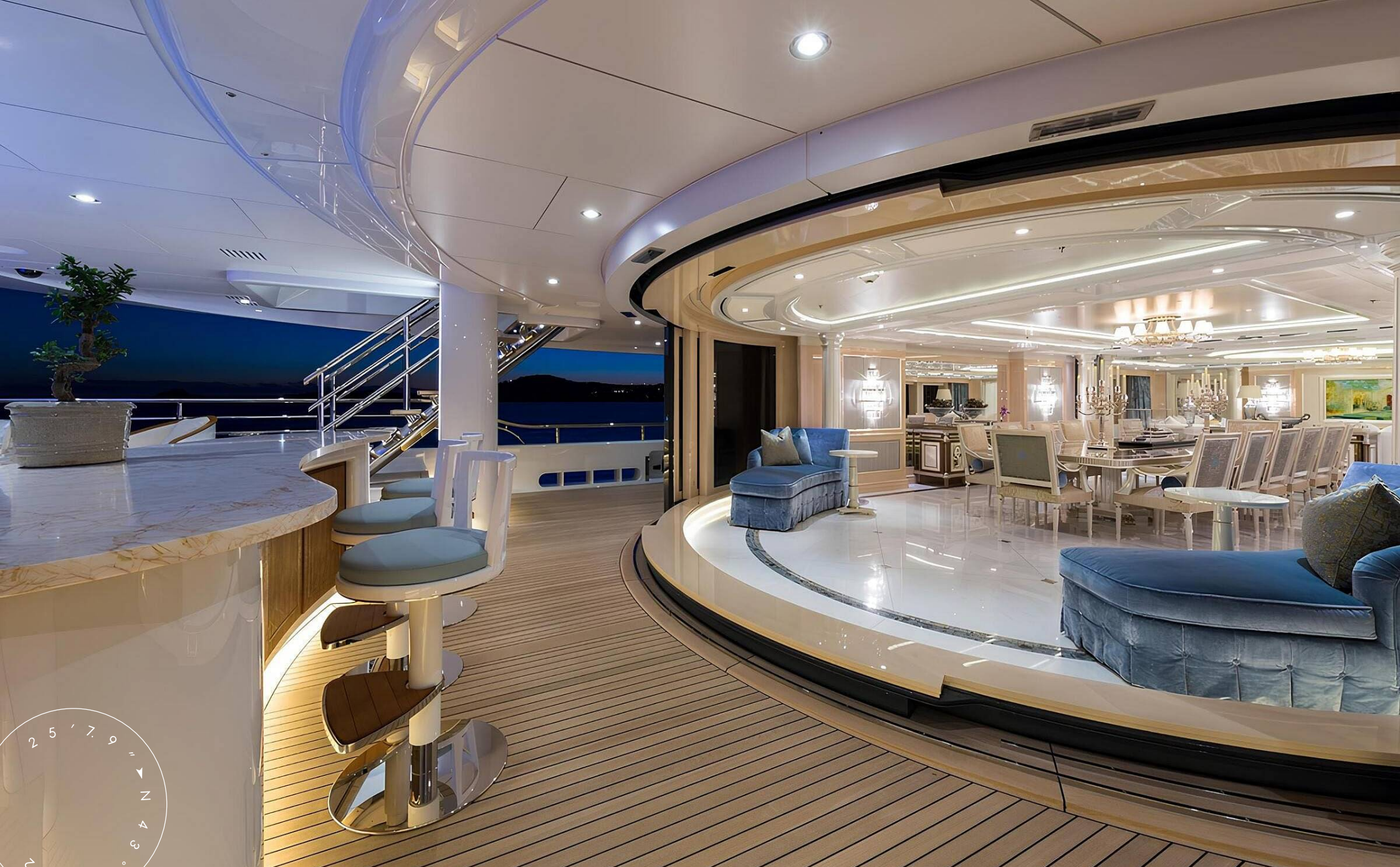
MAIN DECK BAR