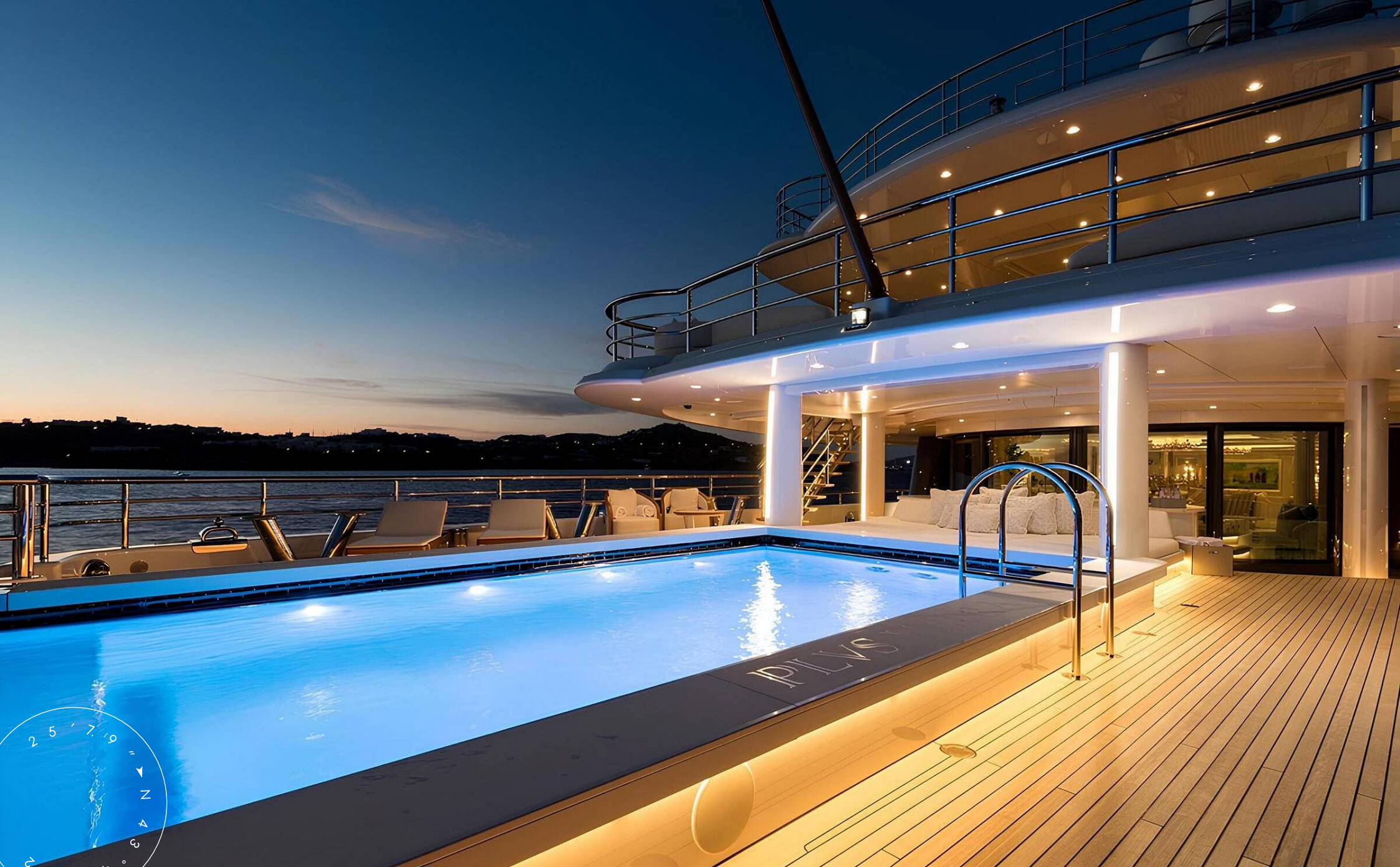
AFT MAIN DECK LOUNGE AREA