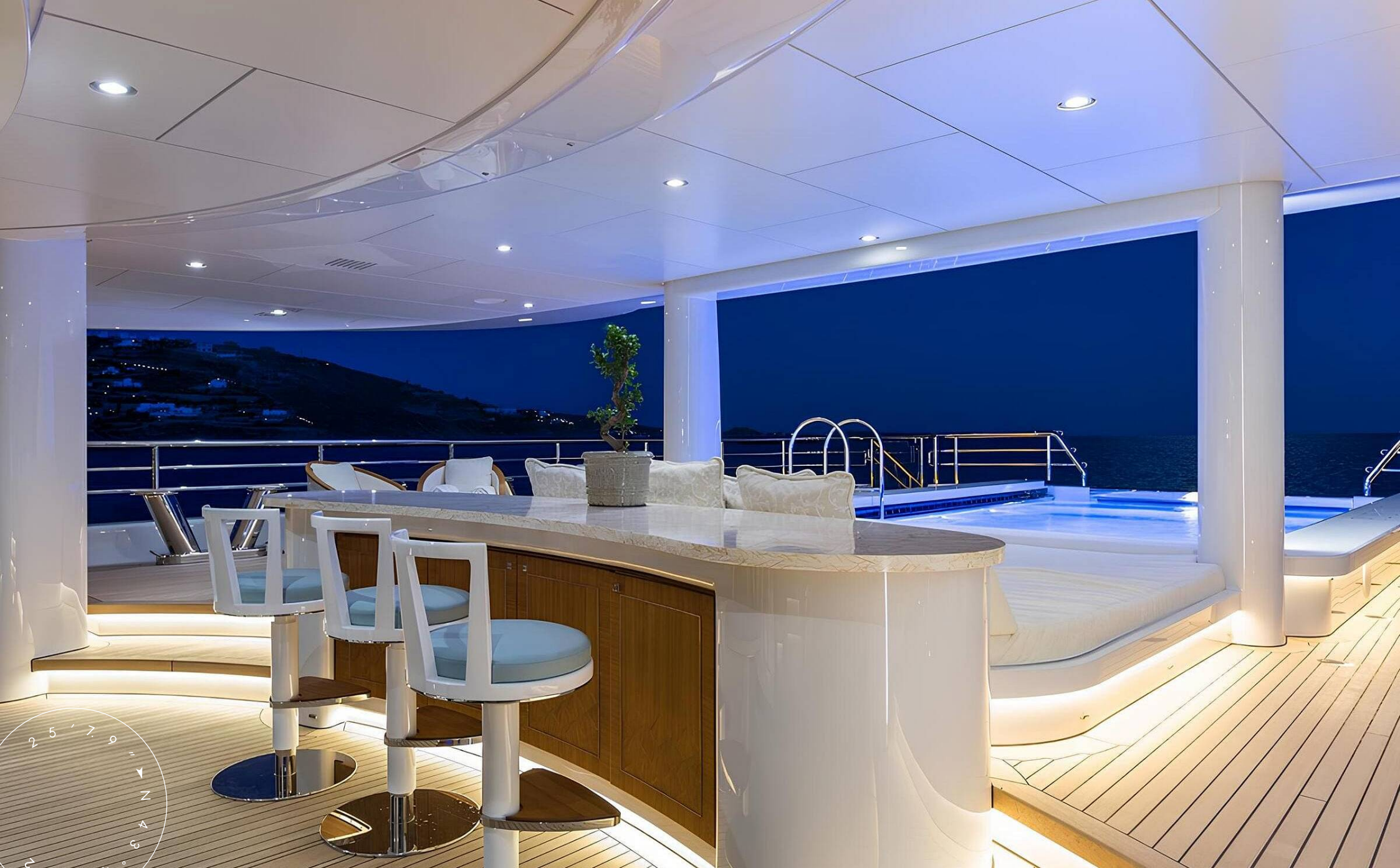
MAIN SALON BAR