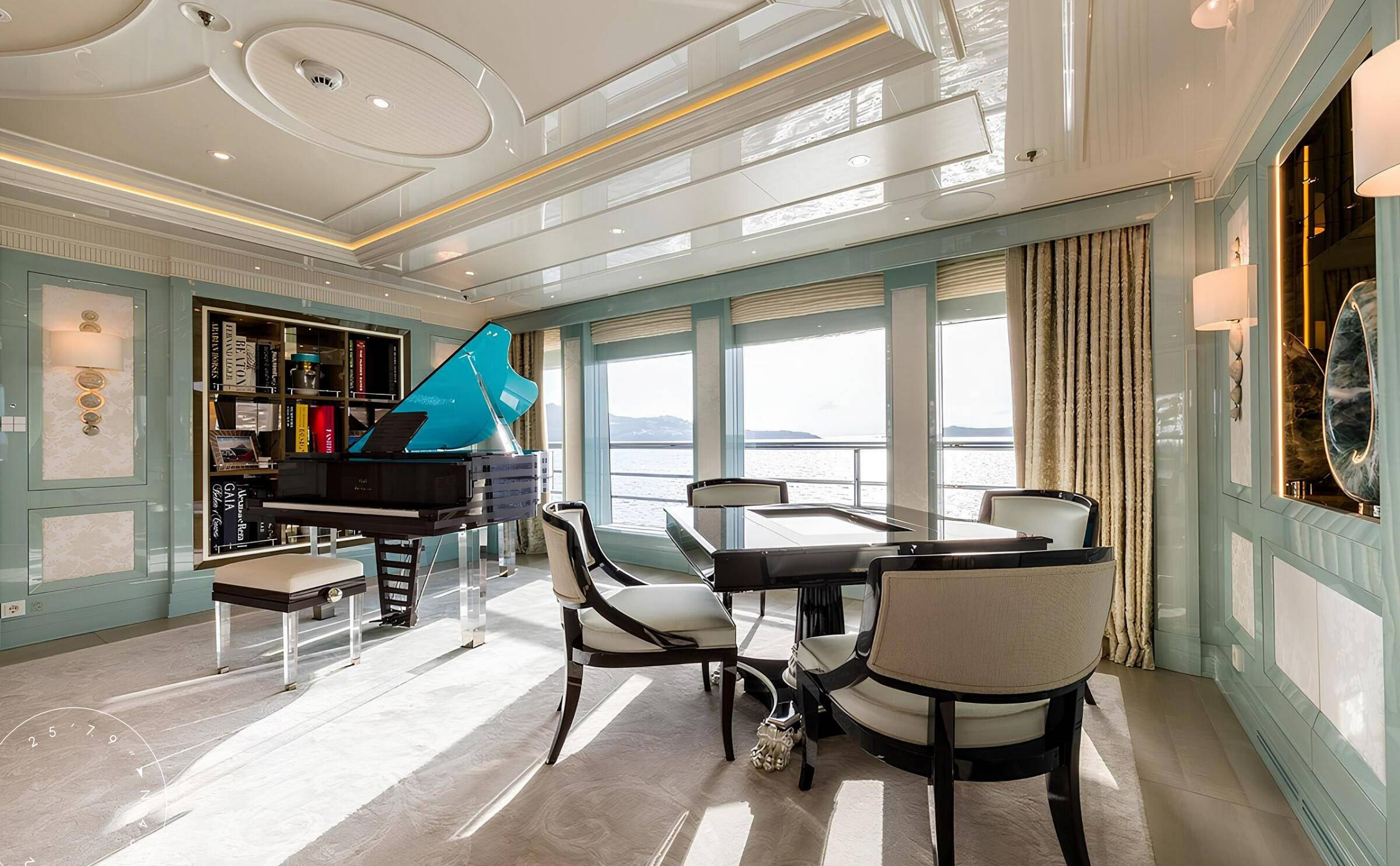
UPPER DECK SALOON