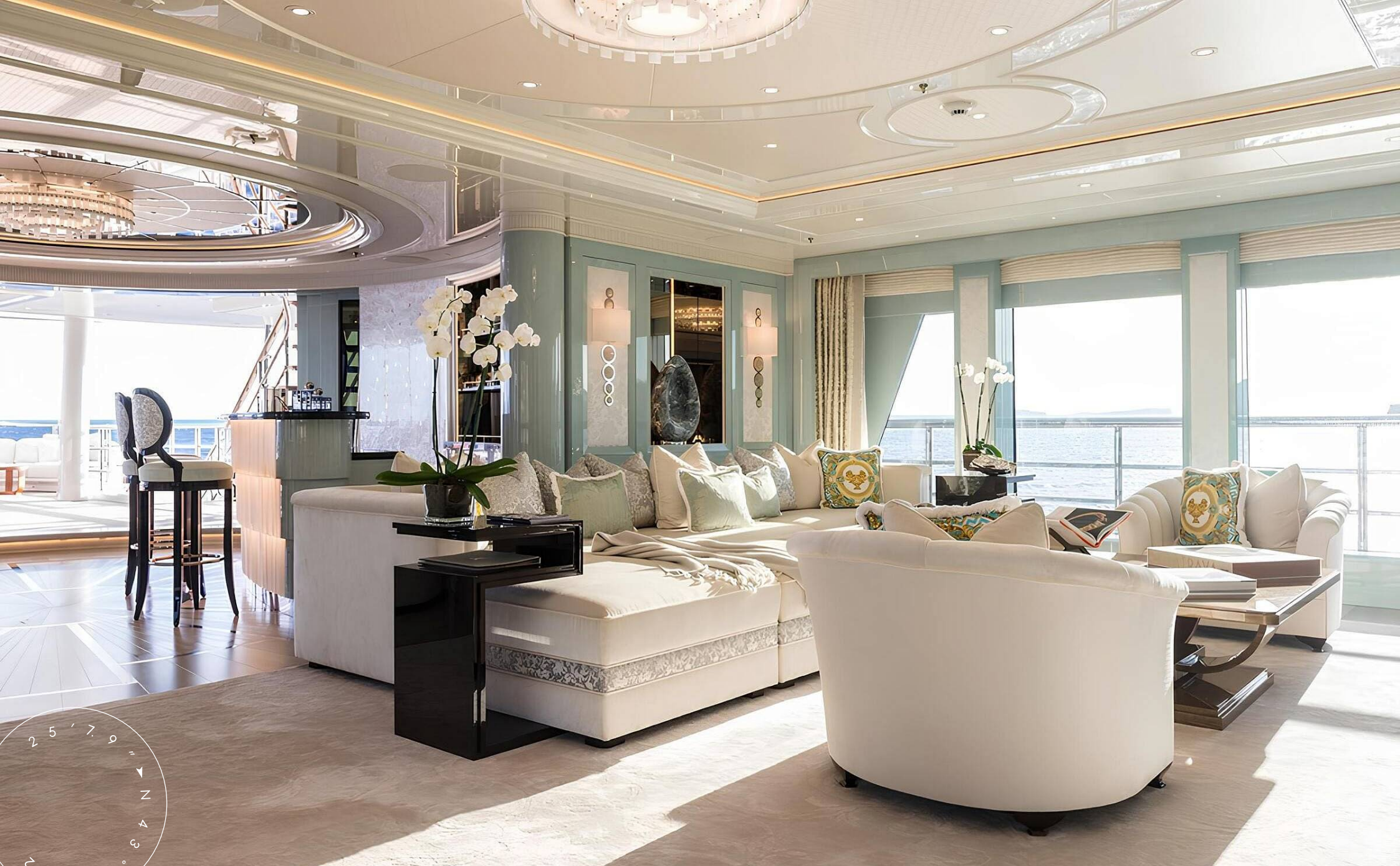
UPPER DECK SALOON