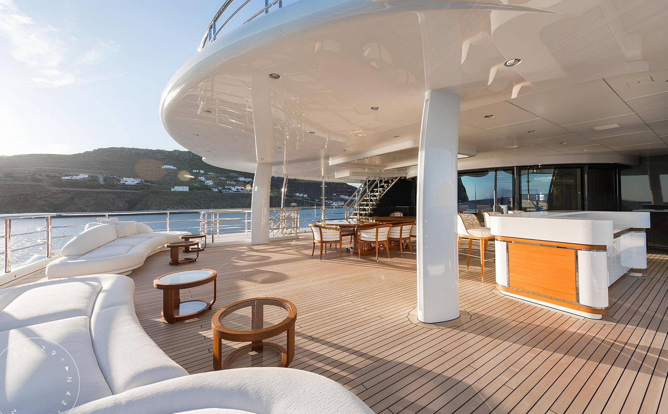
AFT UPPER DECK LOUNGE AREA