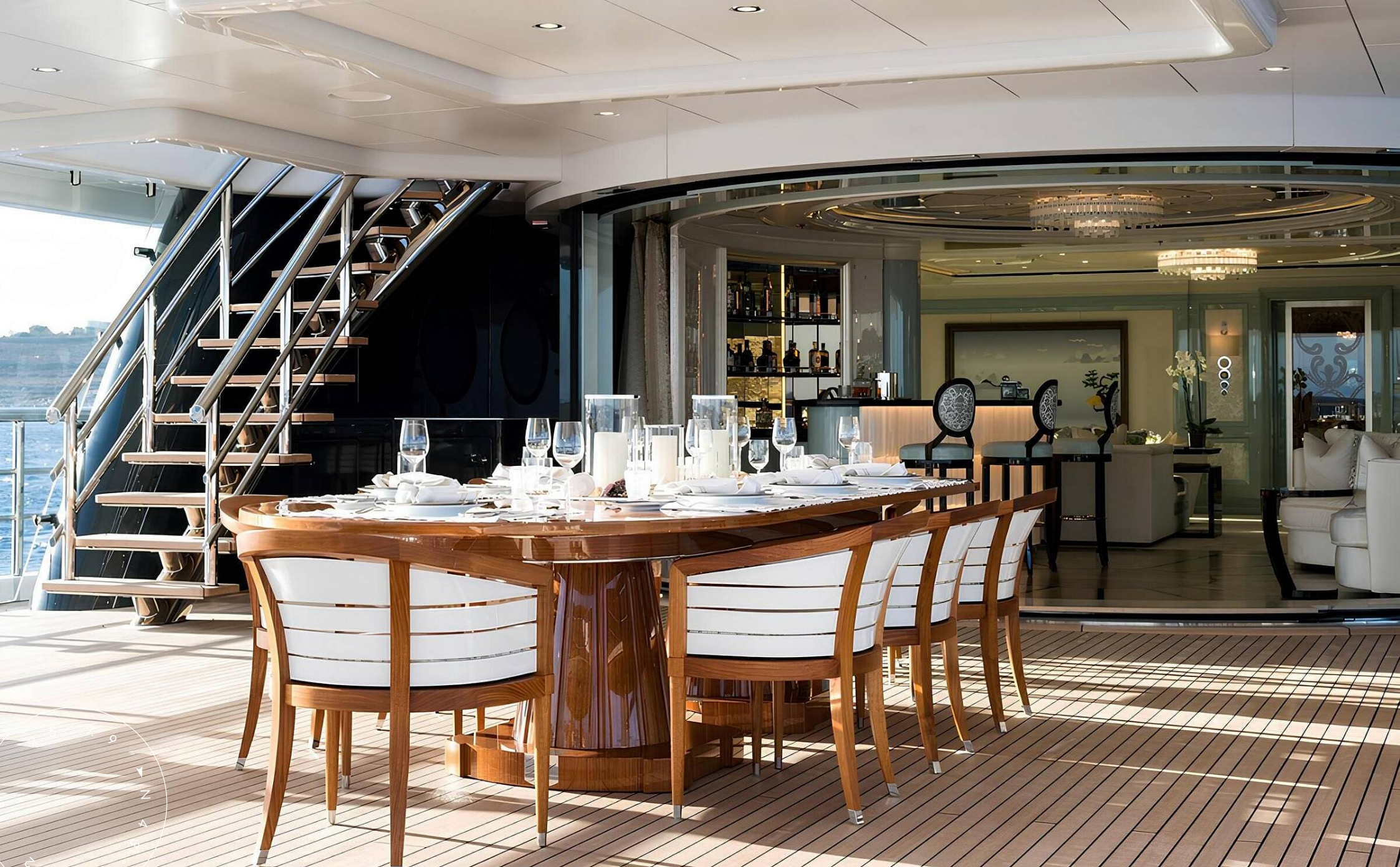
AFT UPPER DECK DINING AREA