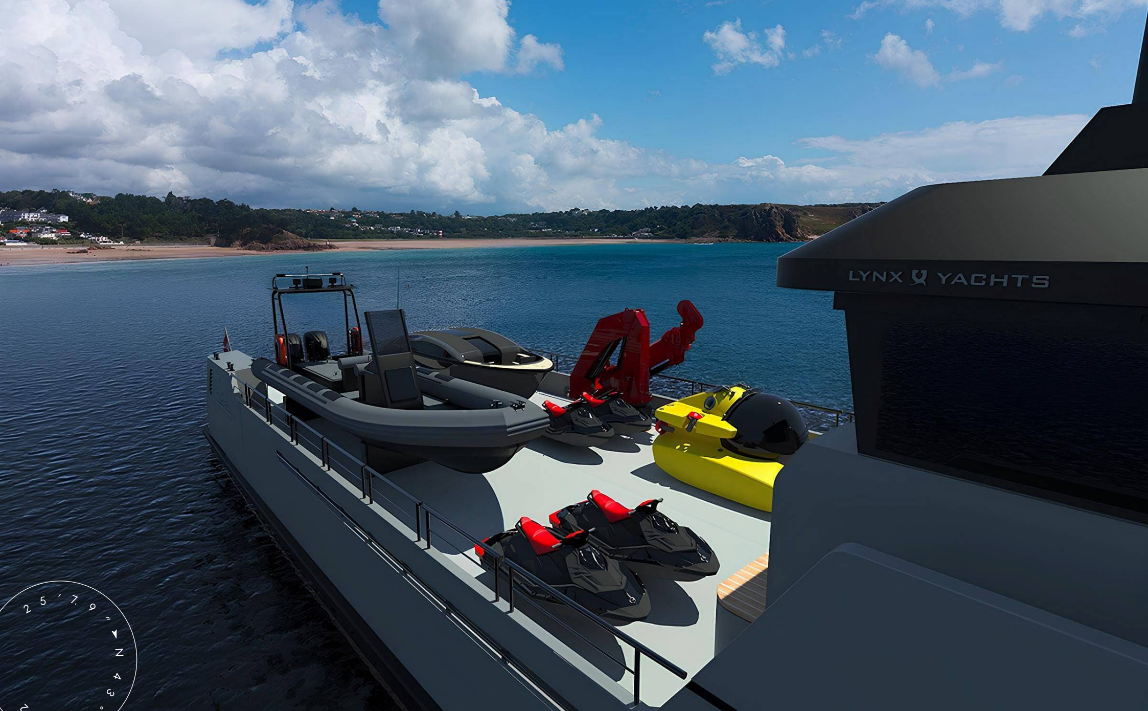
AFT MAIN DECK STORAGE AREA