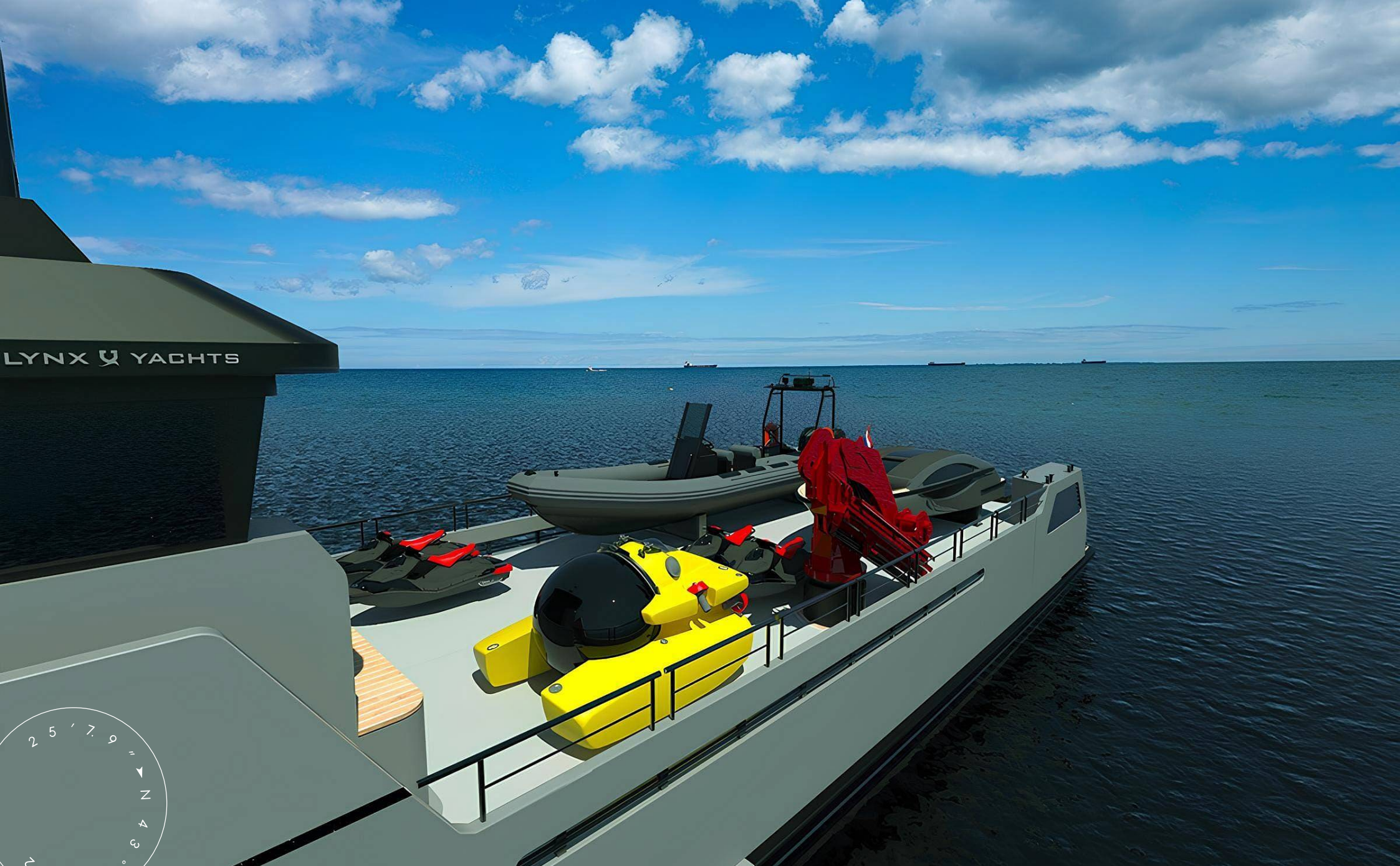
AFT MAIN DECK STORAGE AREA