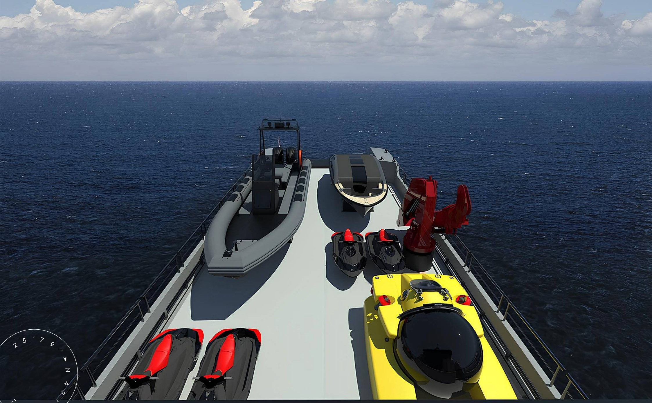
AFT MAIN DECK STORAGE AREA