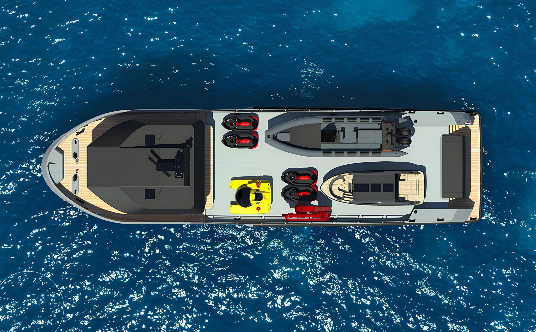
EXTERIOR LYNX YXT 34 2027