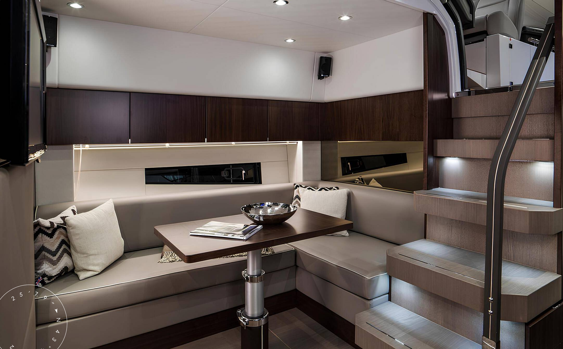
LOWER DECK DINING AREA