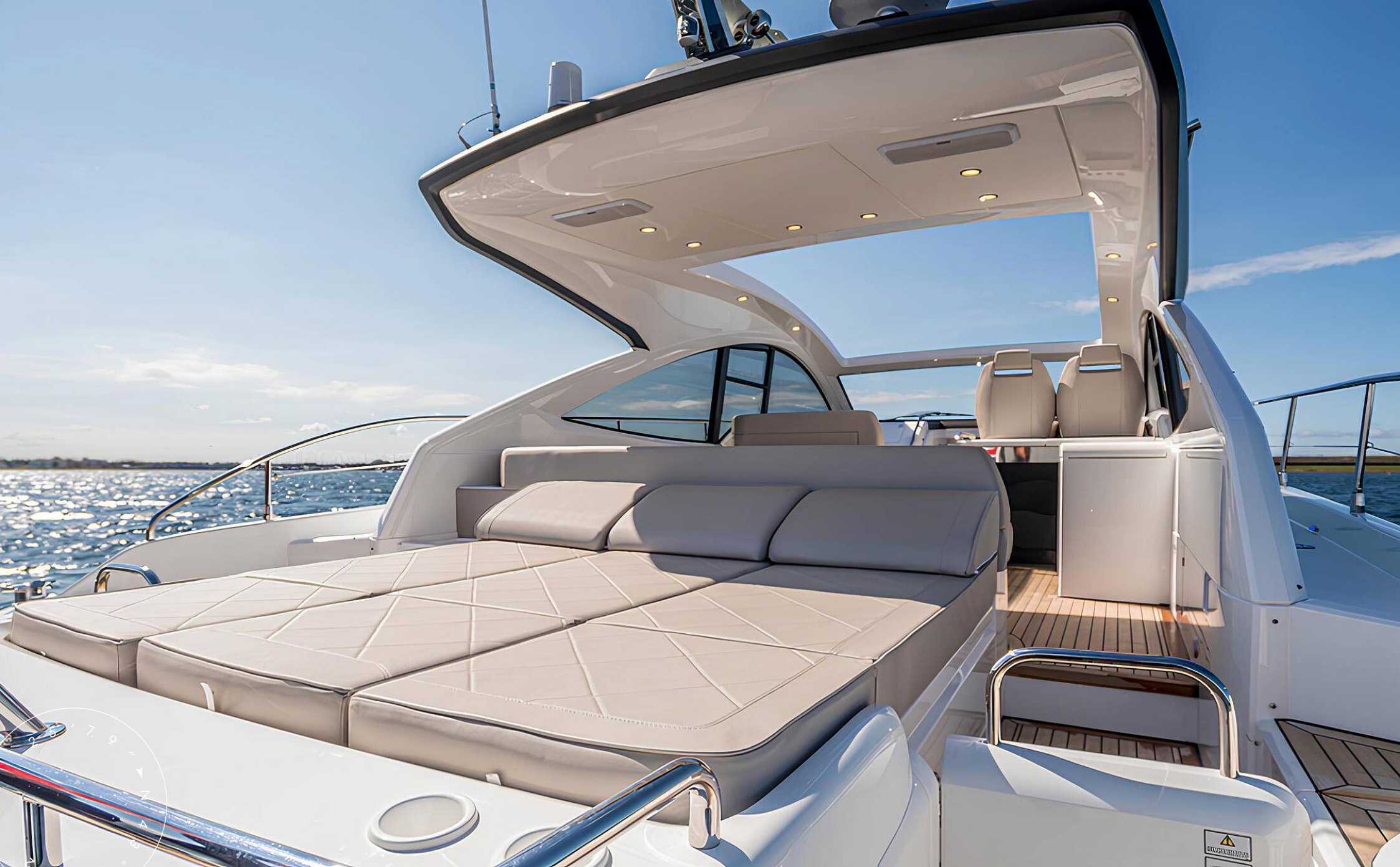
COCKPIT SUNBATHING AREA