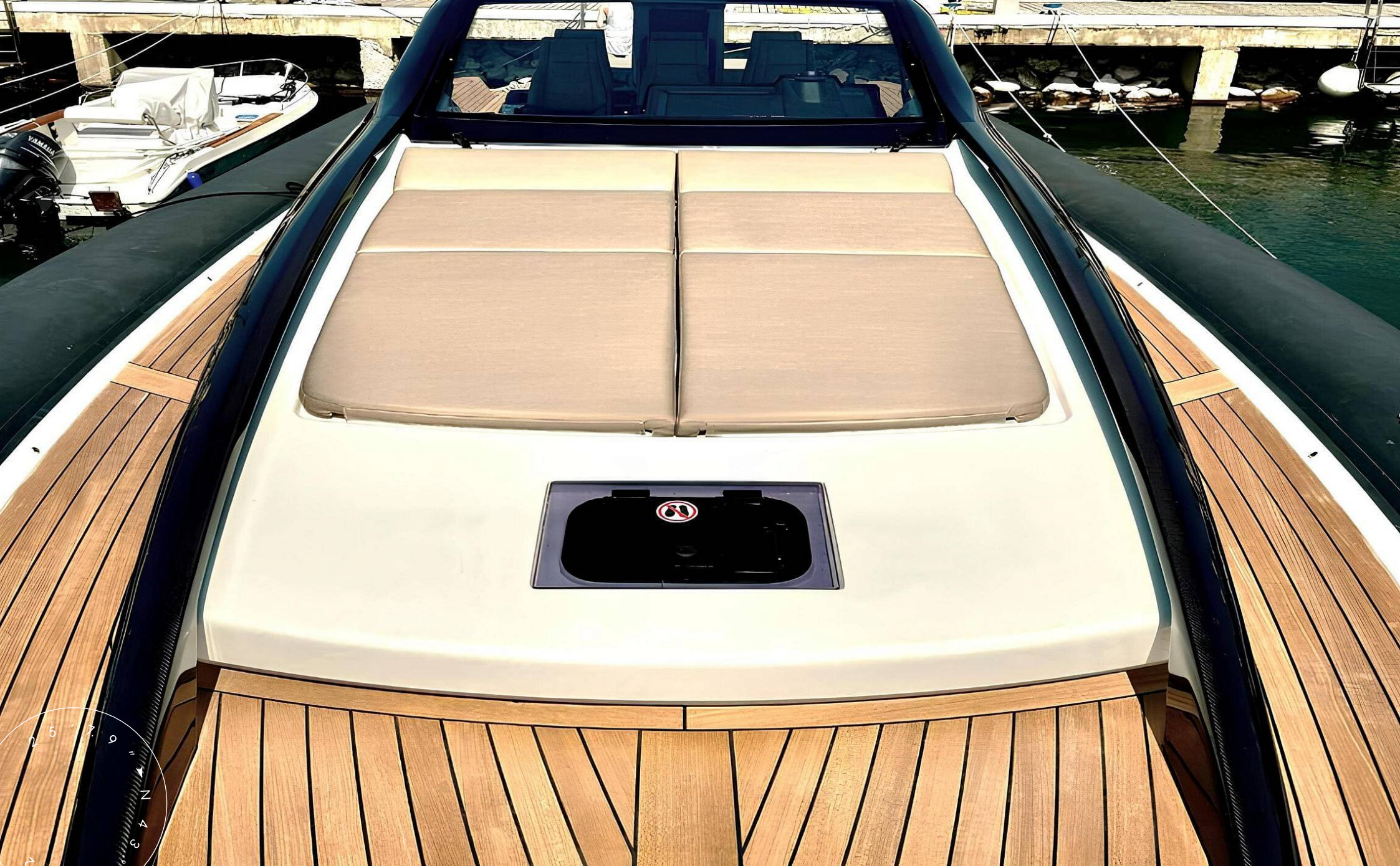
BOW SUNBATHING AREA