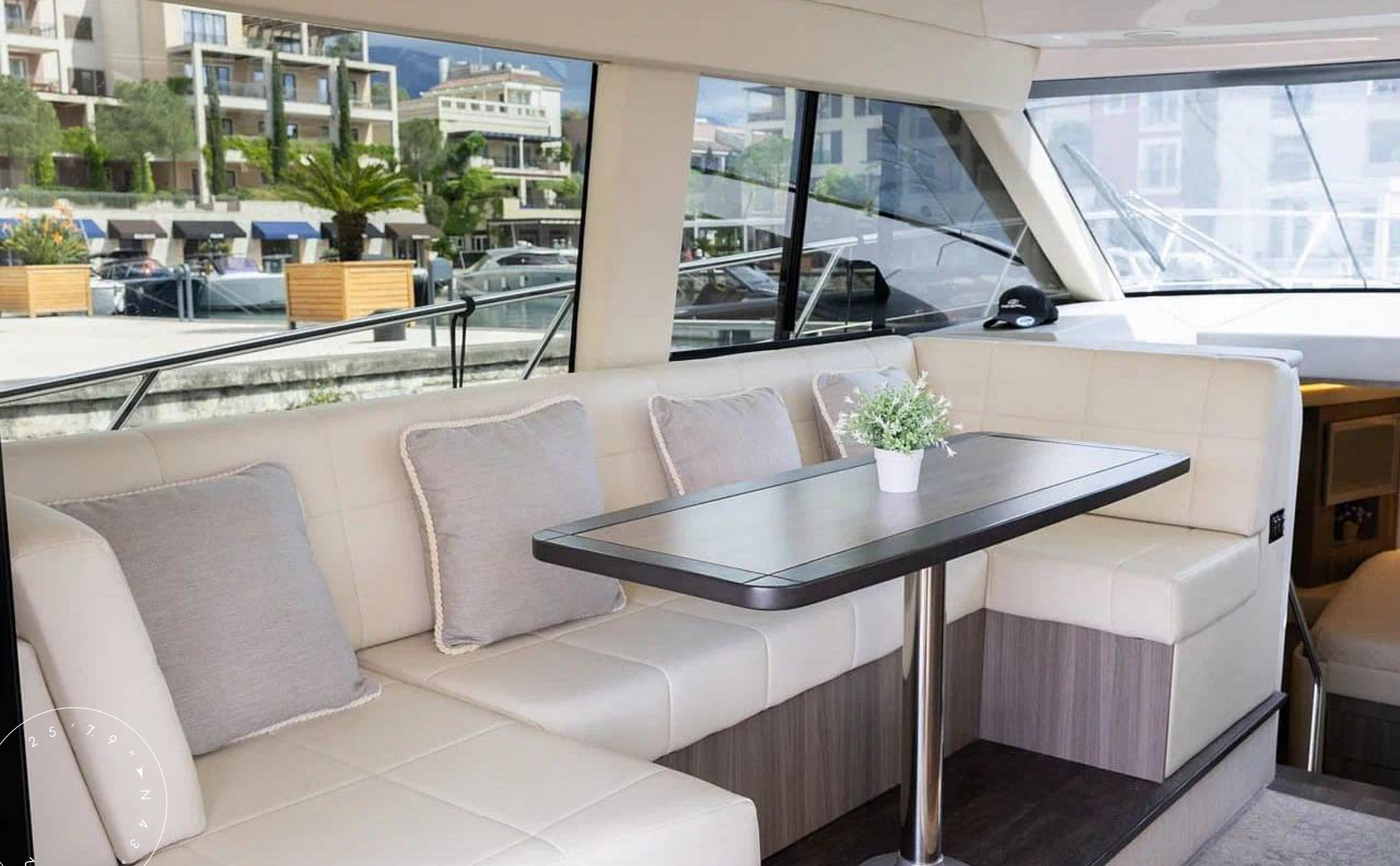
DINING AREA IN THE MAIN SALON