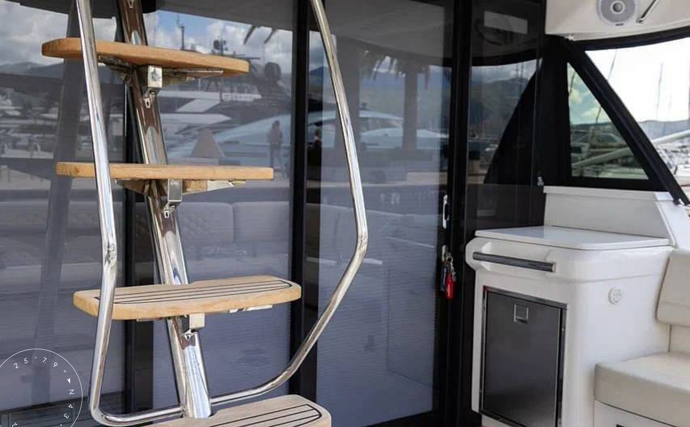
STAIRS TO THE FLYBRIDGE