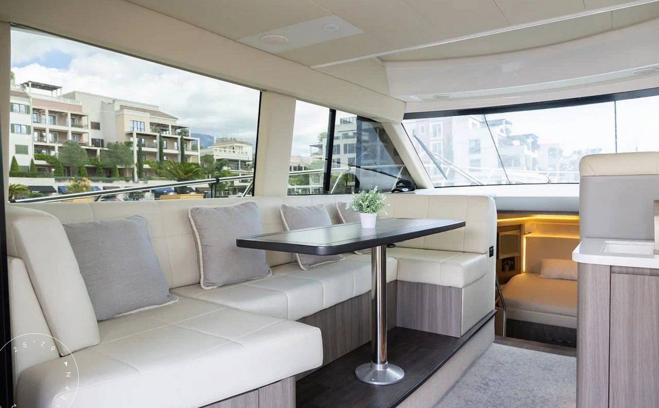
DINING AREA IN THE MAIN SALON