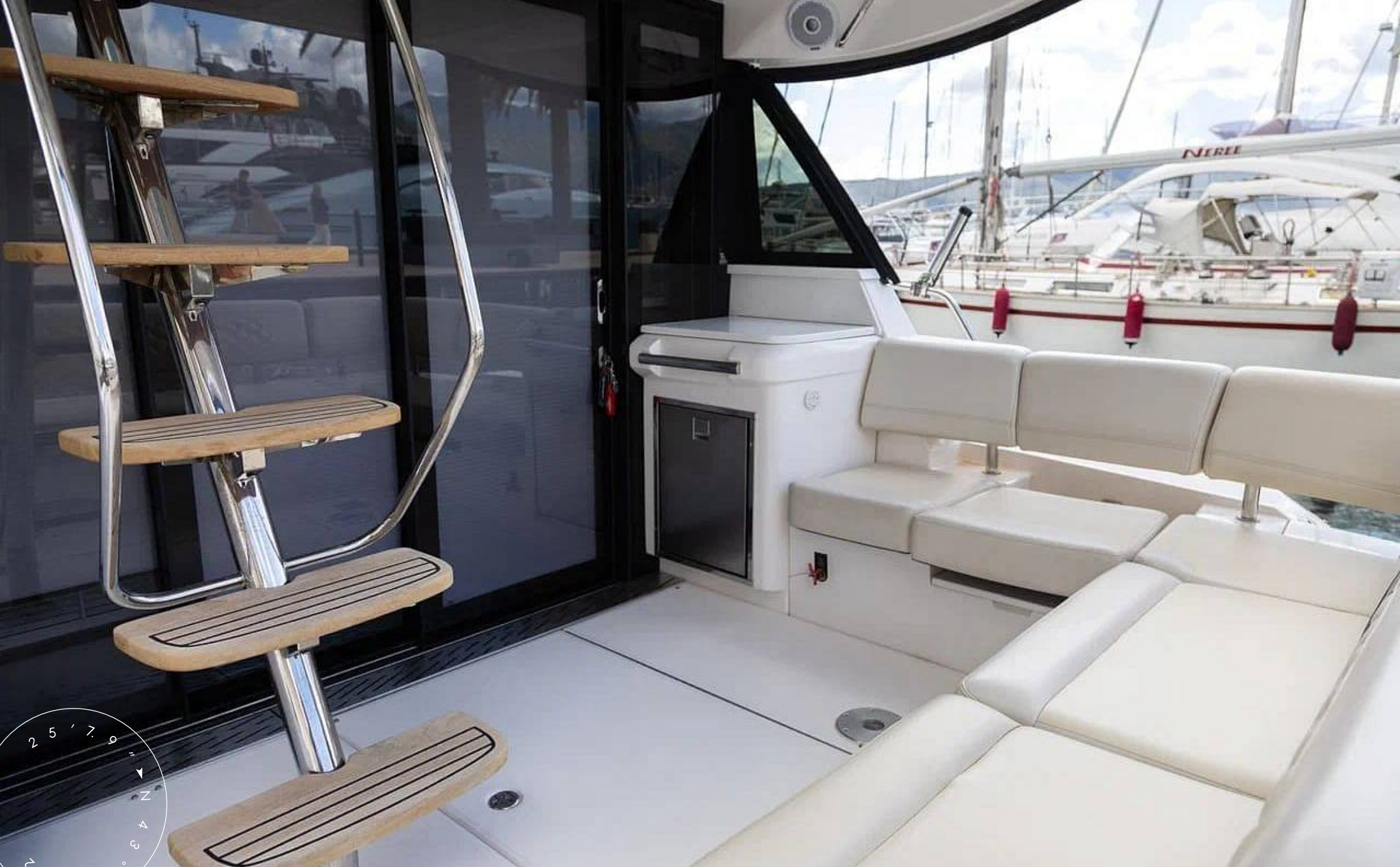
COCKPIT SEATING AREA