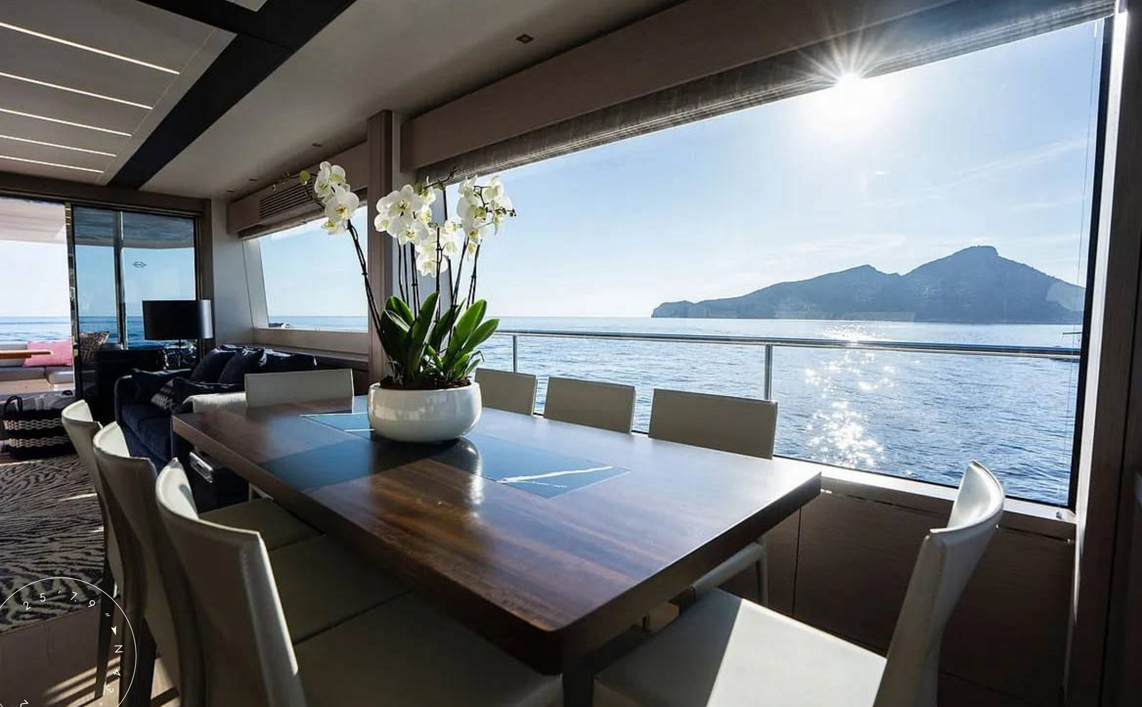
MAIN SALON DINING AREA