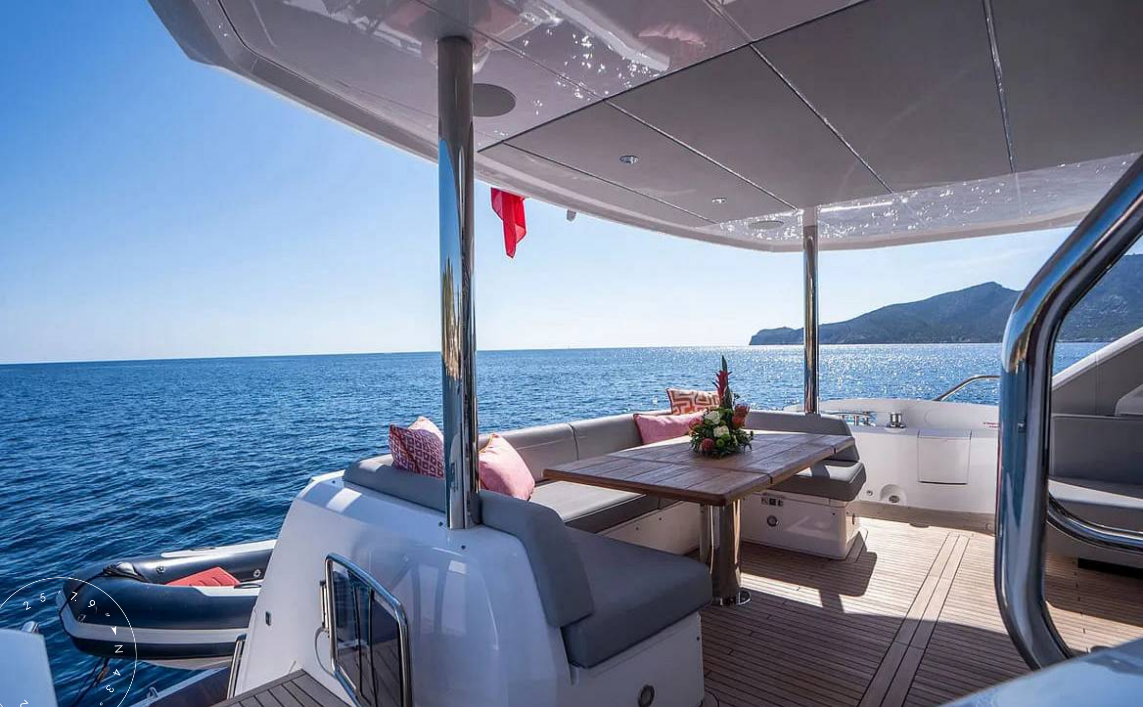
COCKPIT DINING AREA