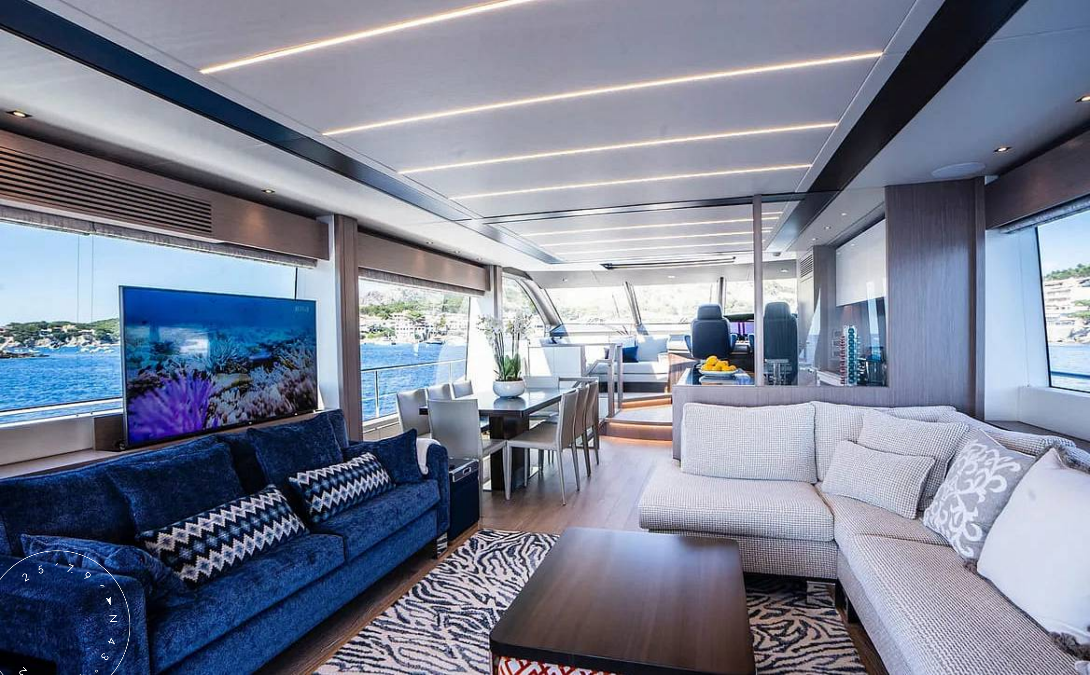
MAIN SALON LOUNGE AREA