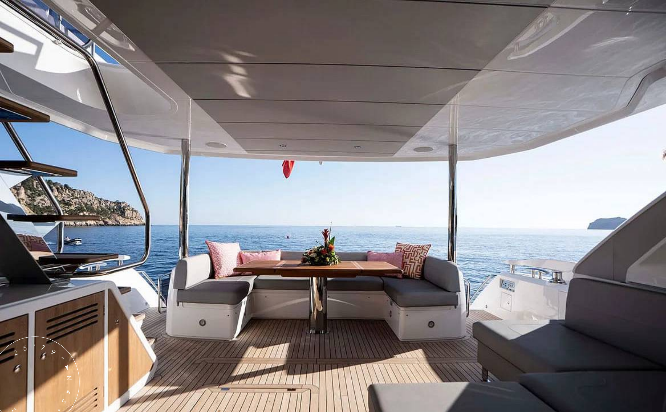
COCKPIT DINING AREA