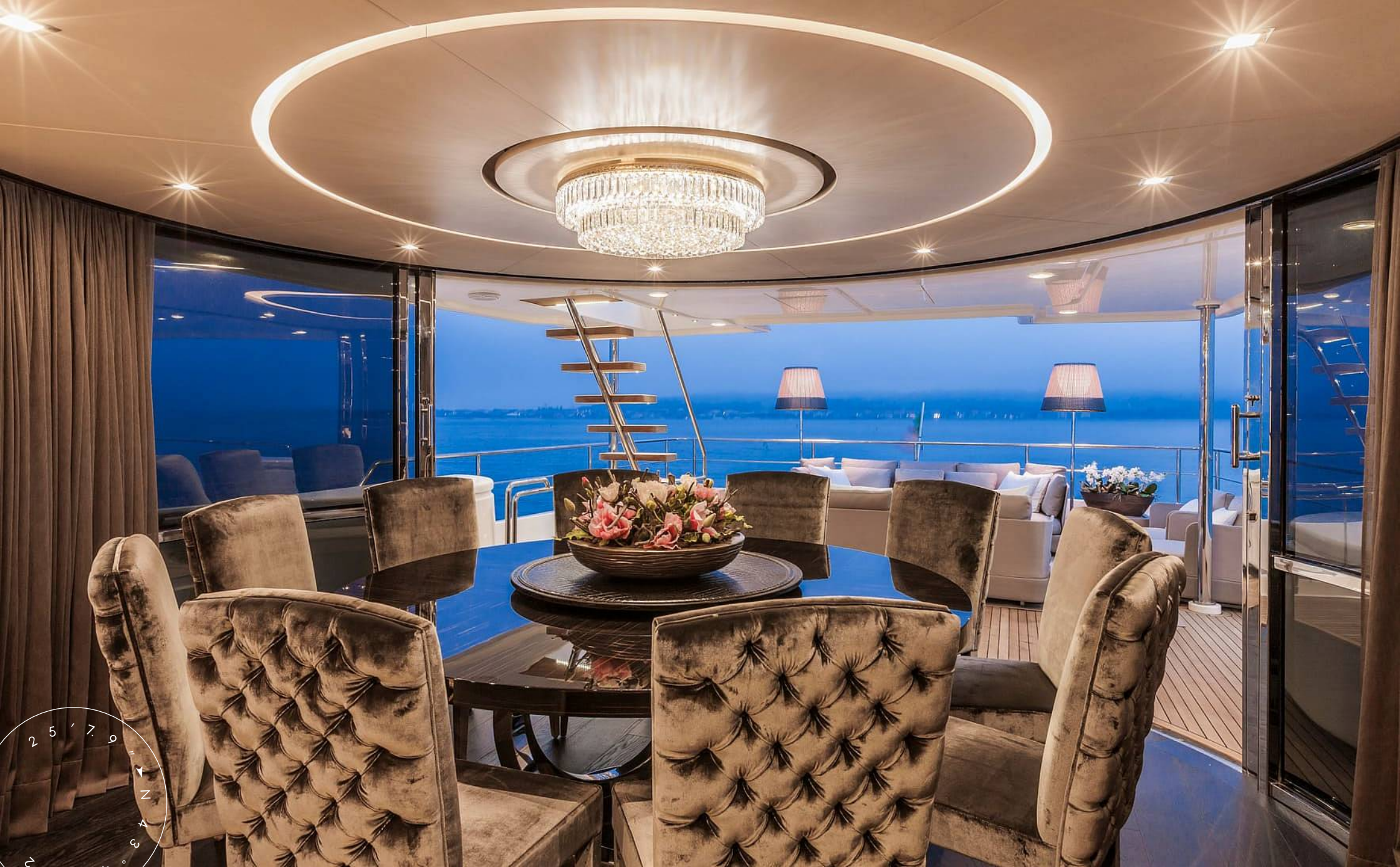
UPPER DECK SALOON DINING AREA