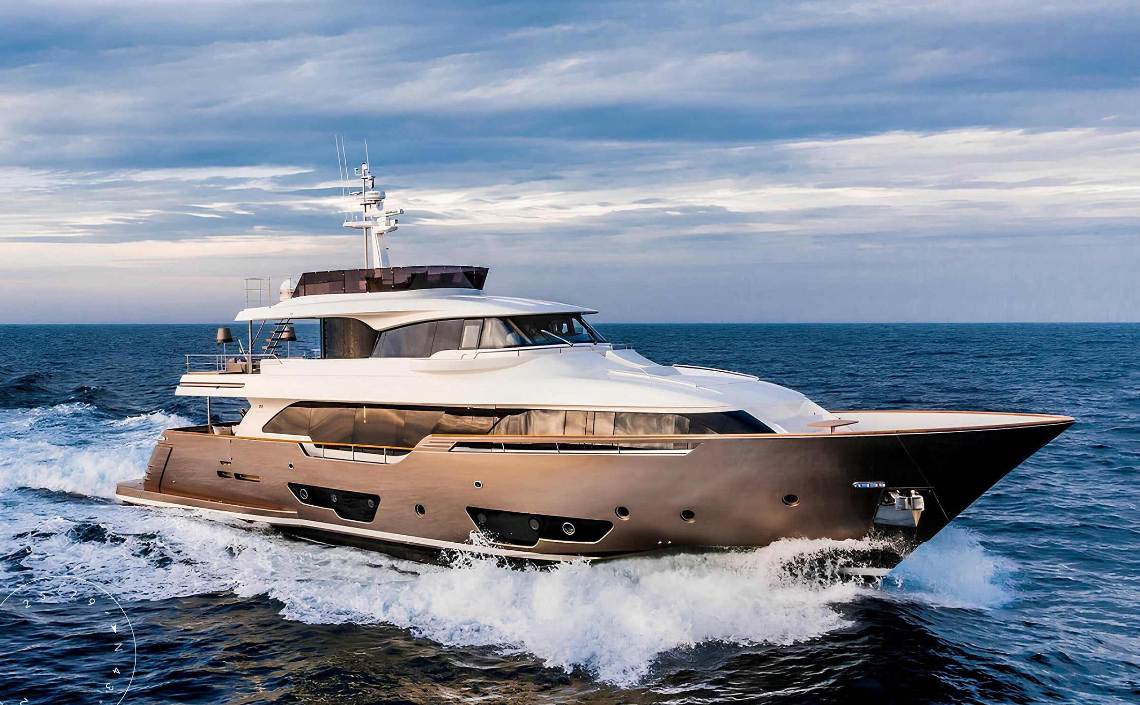
EXTERIOR CUSTOM LINE NAVETTA 28 2015 MY YVONNE