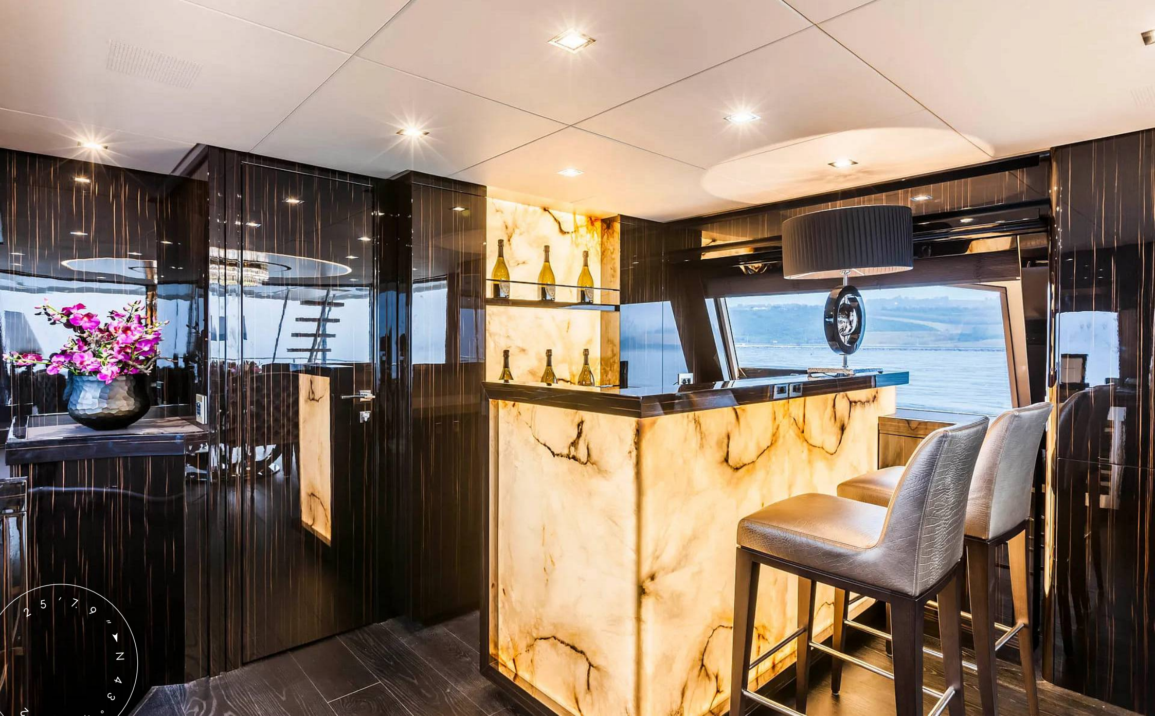
UPPER DECK SALOON BAR