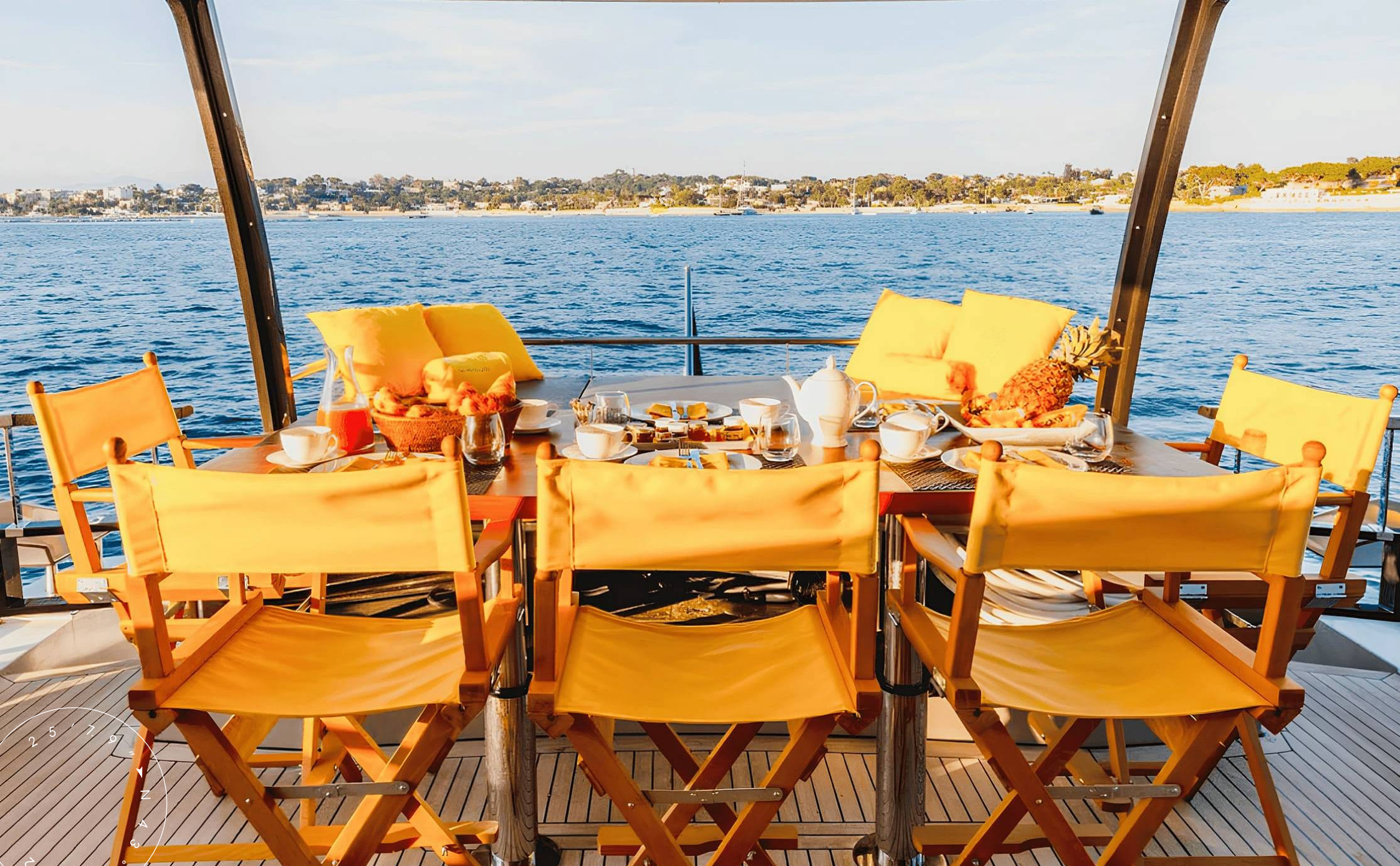
COCKPIT DINING AREA