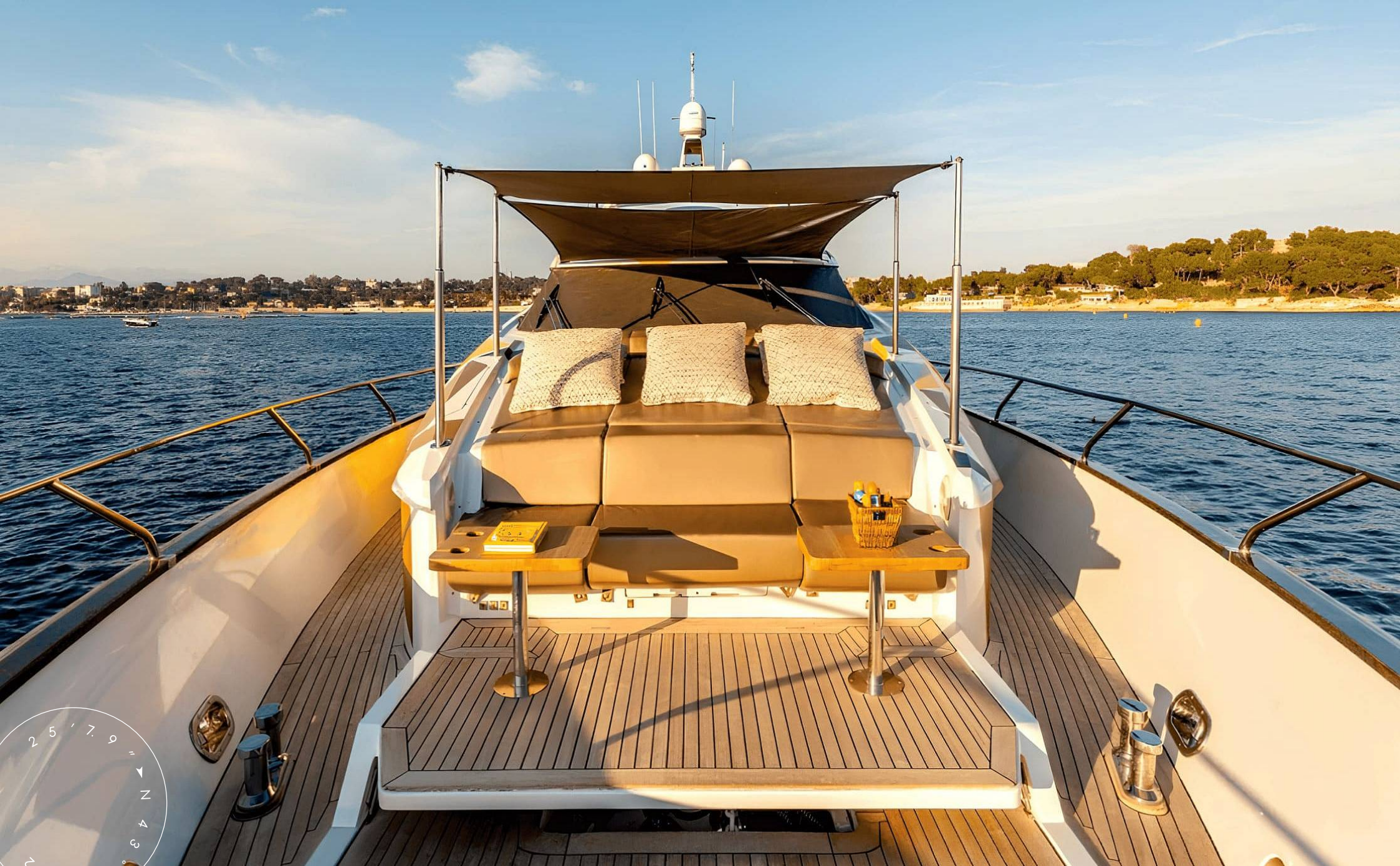
BOW LOUNGE AREA