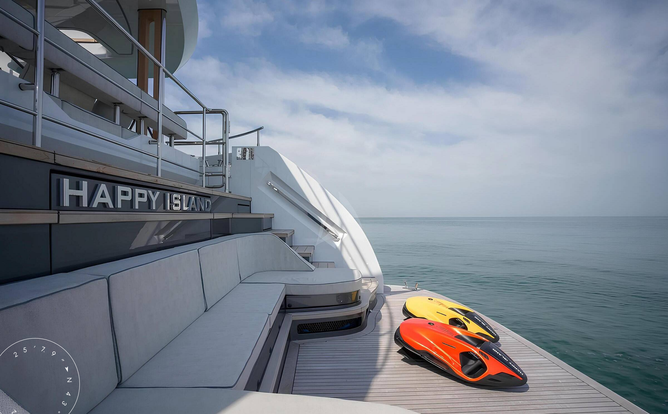
SWIMMING PLATFORM AND WATER TOYS