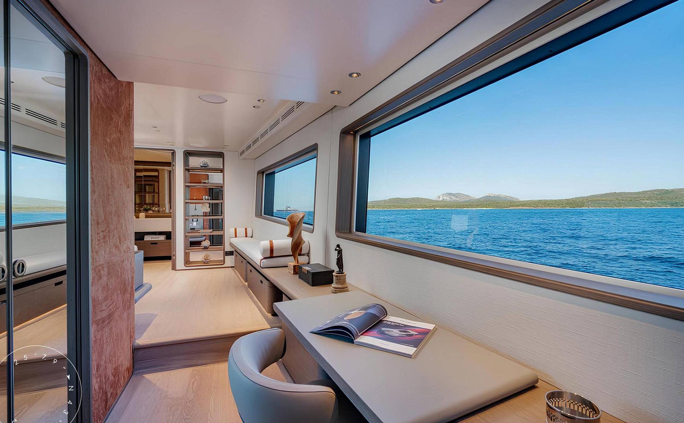
MAKE-UP TABLE IN MASTER CABIN