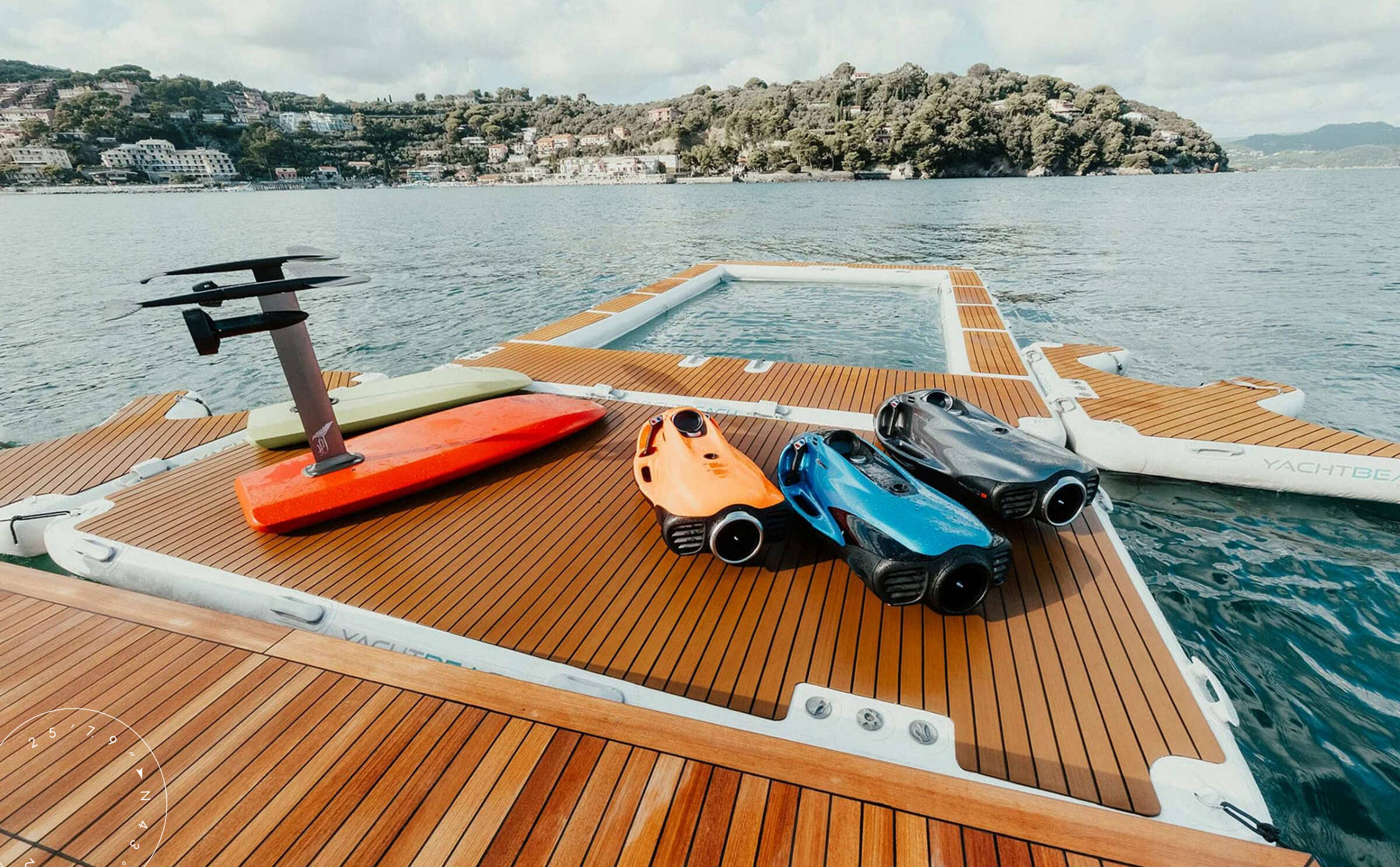
SWIMMING PLATFORM AND WATER TOYS