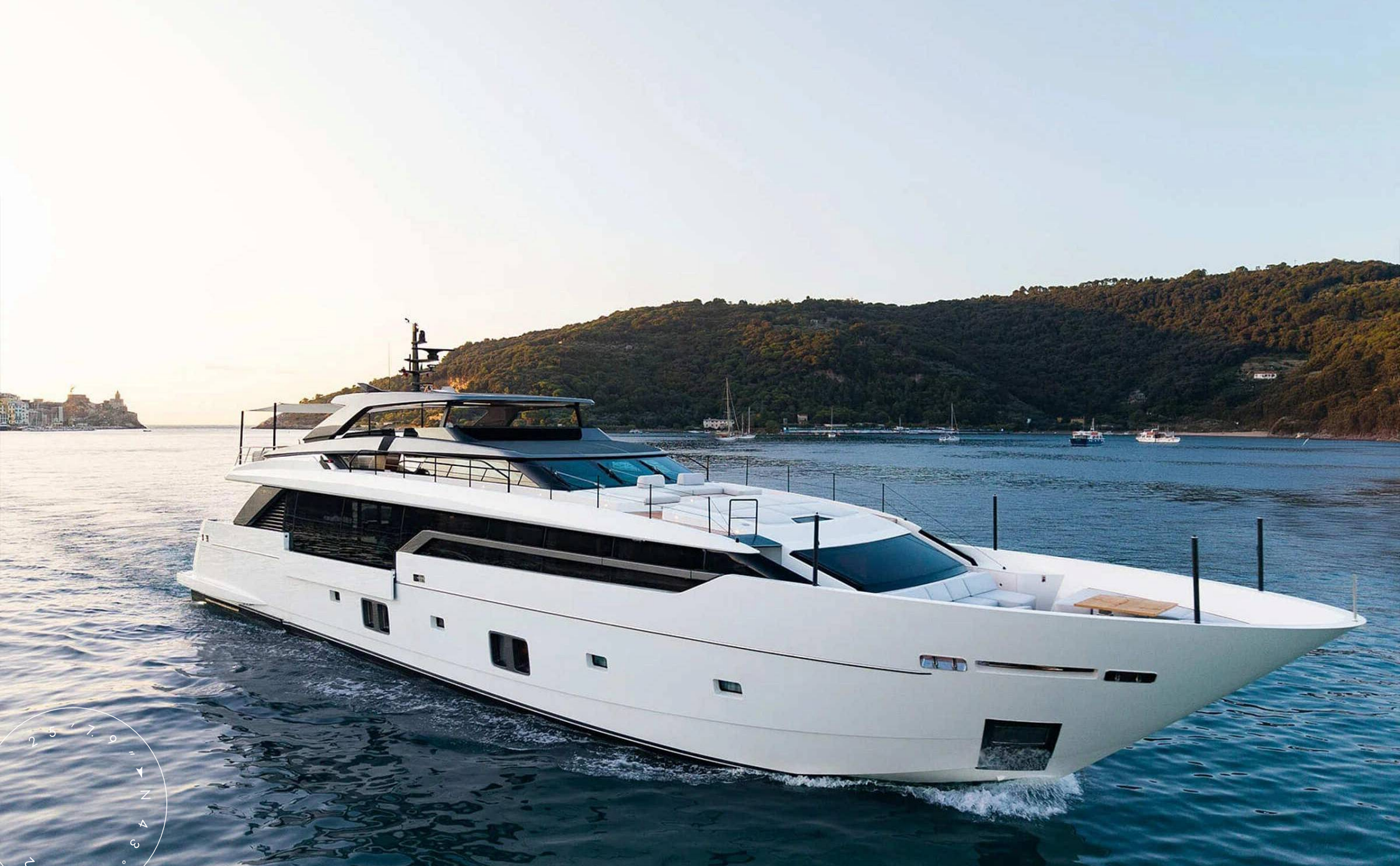
EXTERIOR SANLORENZO SL120 ASYMMETRIC 2025 MY ARESYA