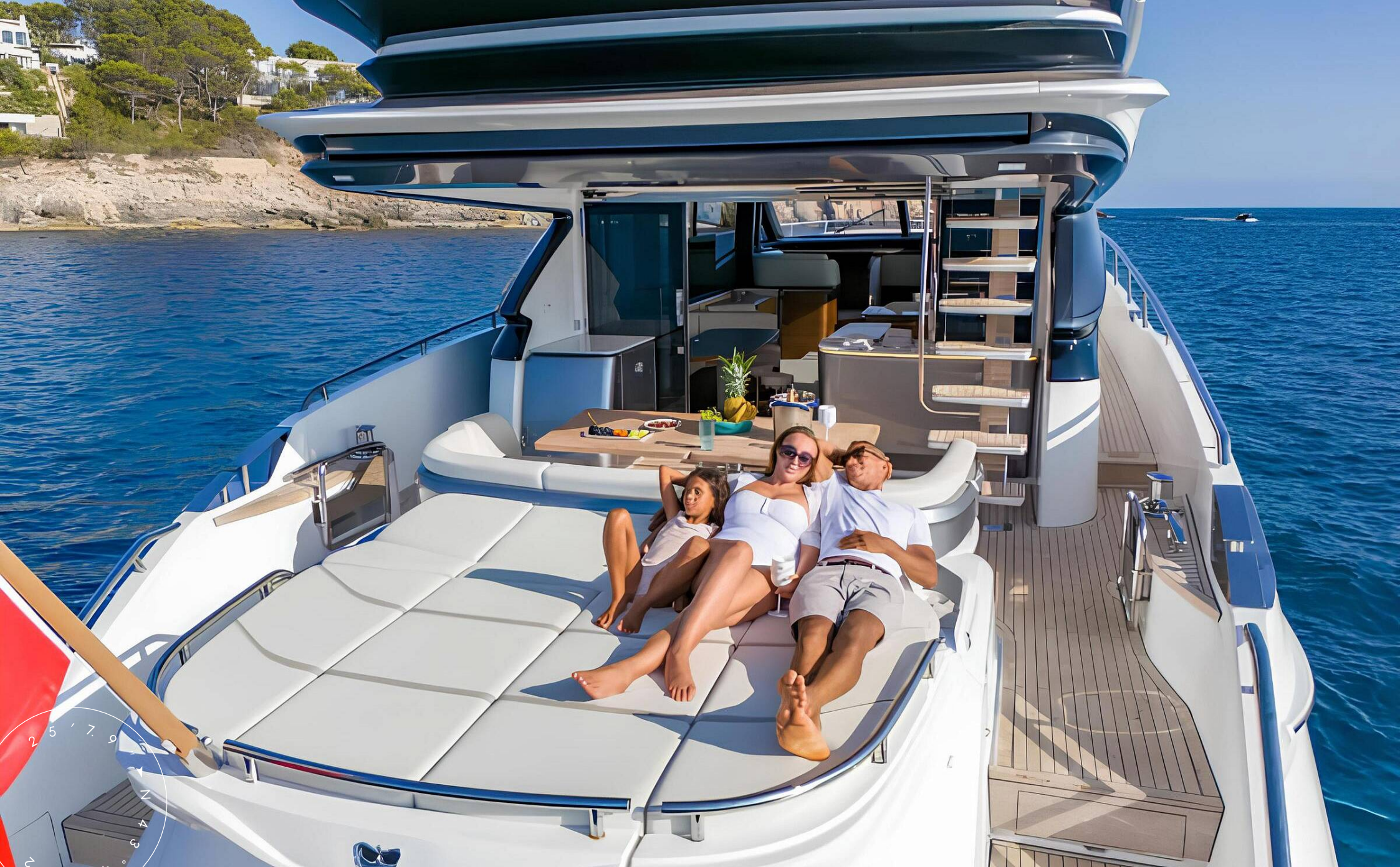
MAIN DECK AFT SUNBATHING AREA