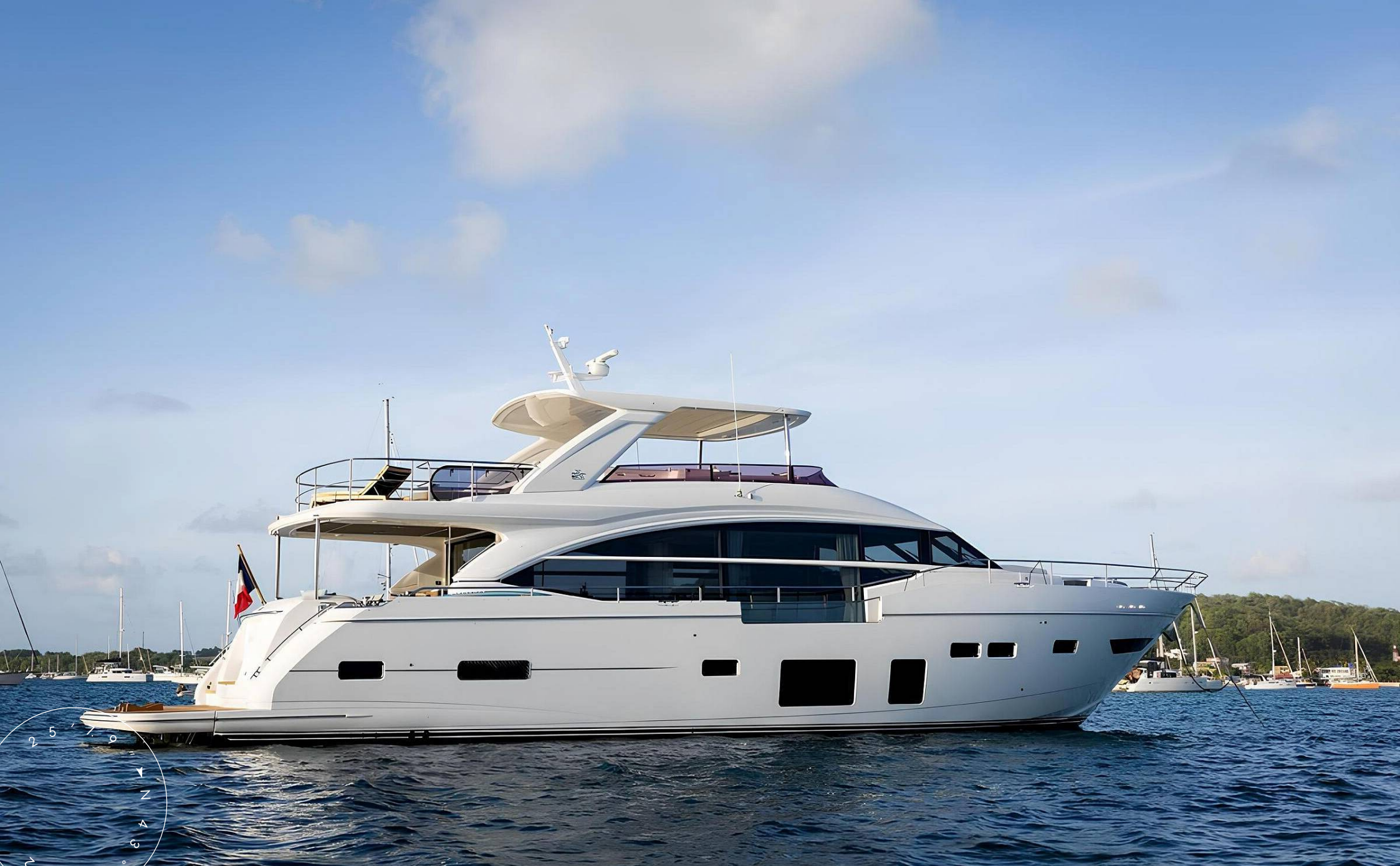
EXTERIOR PRINCESS 75 2018 MY SORANA