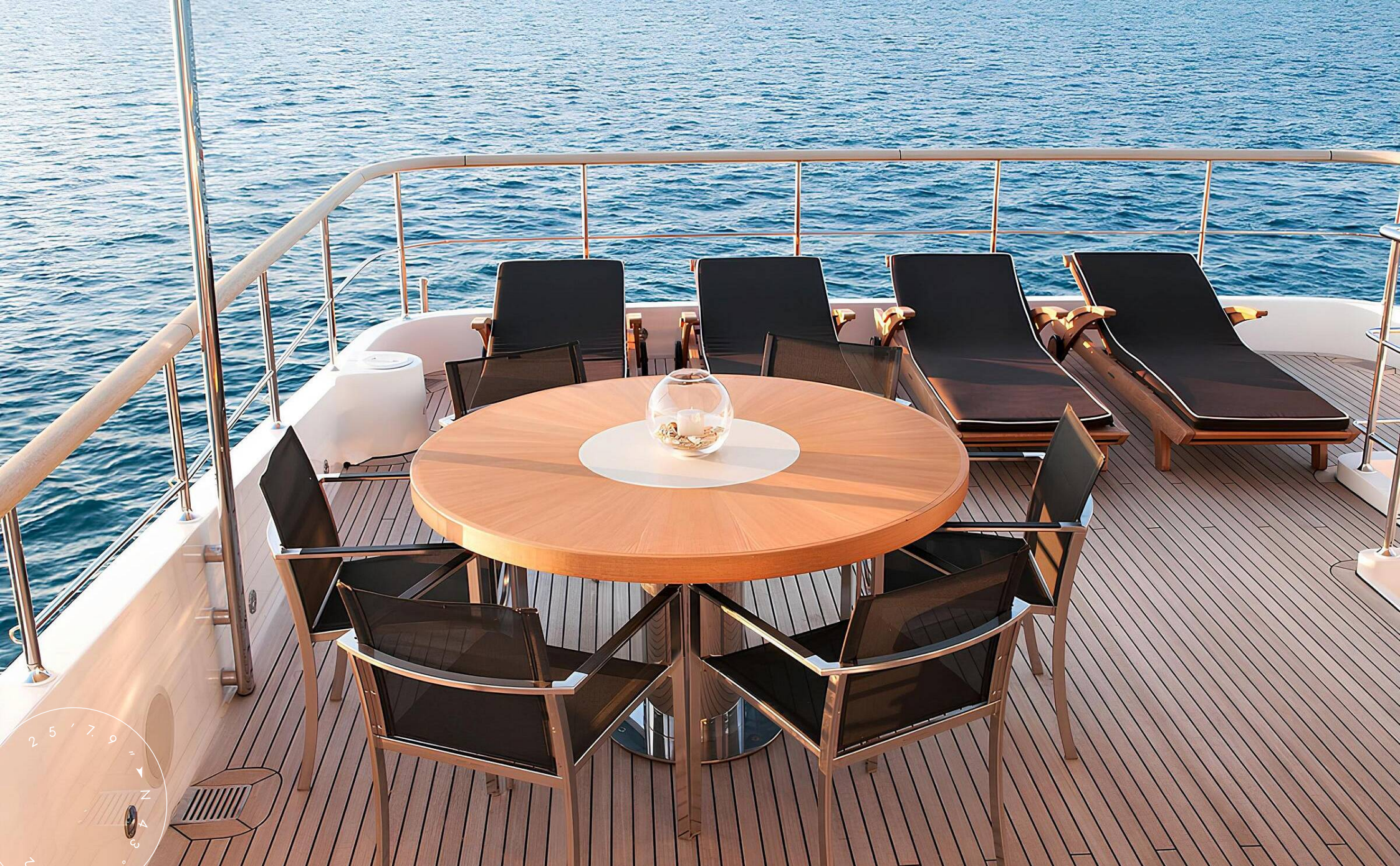
SUNDECK DINING AREA