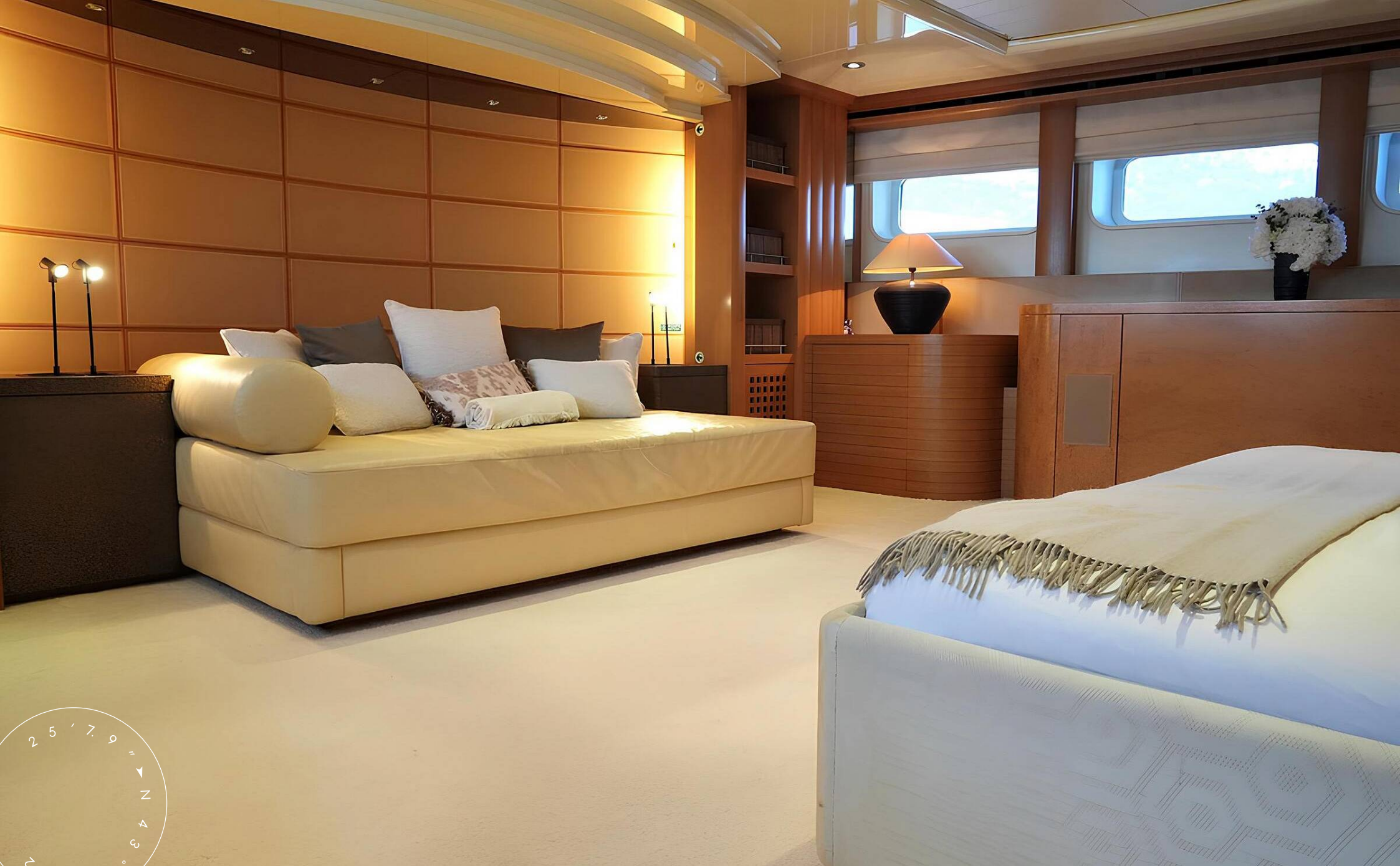
MASTER CABIN LOUNGE AREA