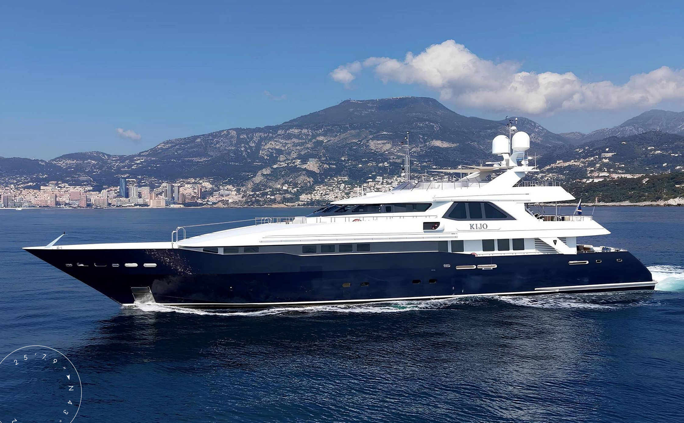
EXTERIOR HEESEN YACHTS 44M 2003 MY KIJO