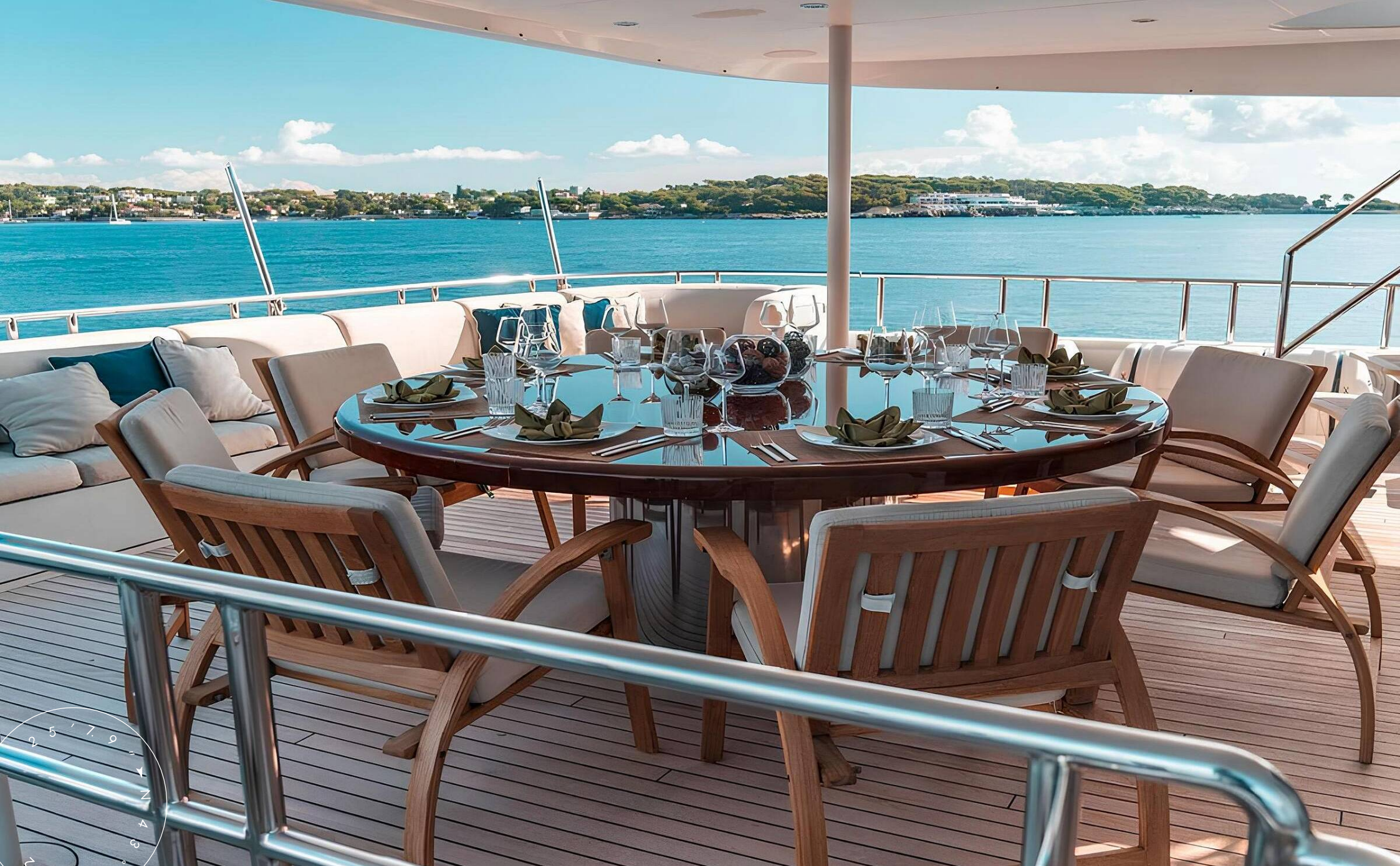
AFT UPPER DECK DINING AREA