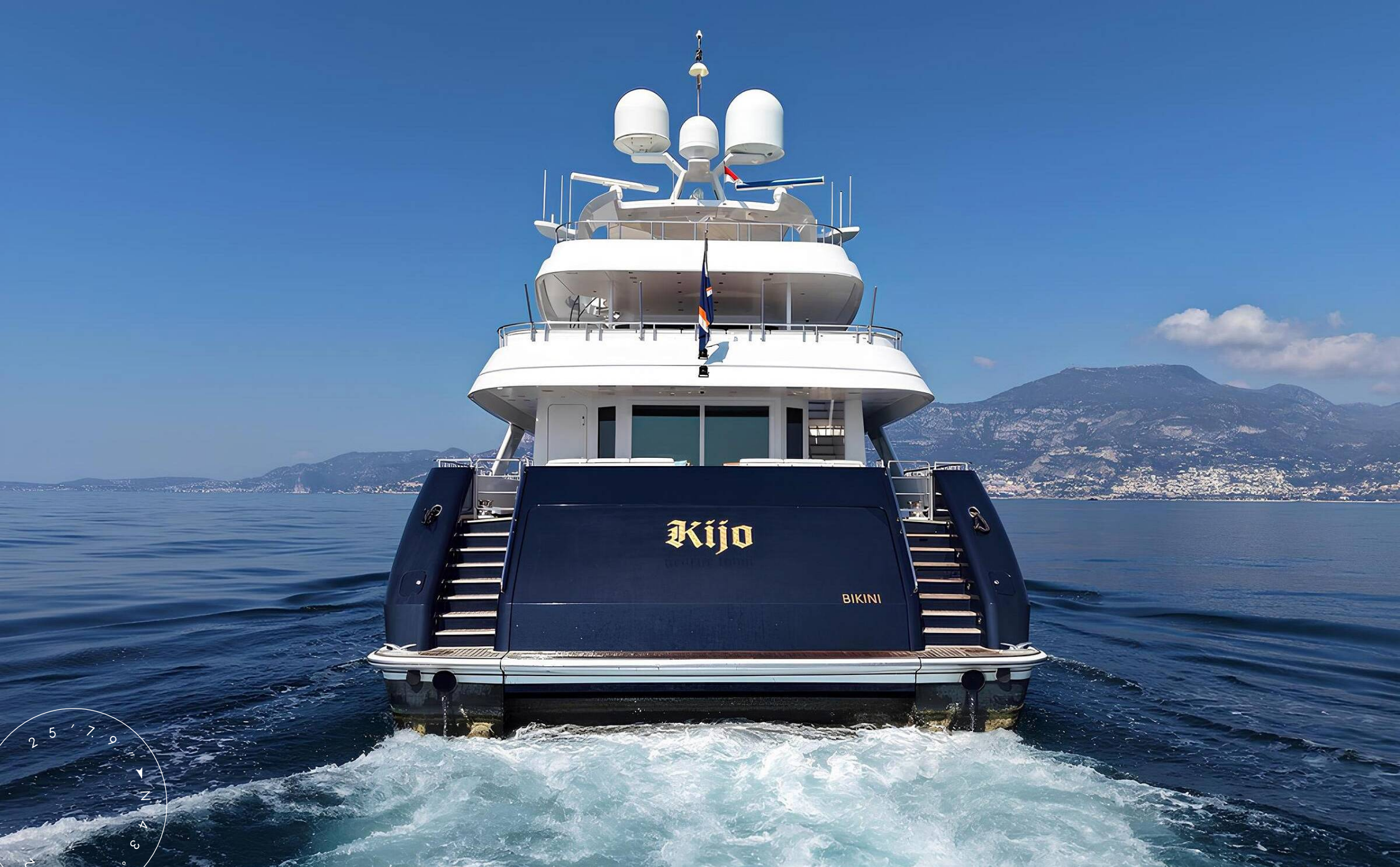
EXTERIOR HEESEN YACHTS 44M 2003 MY KIJ0