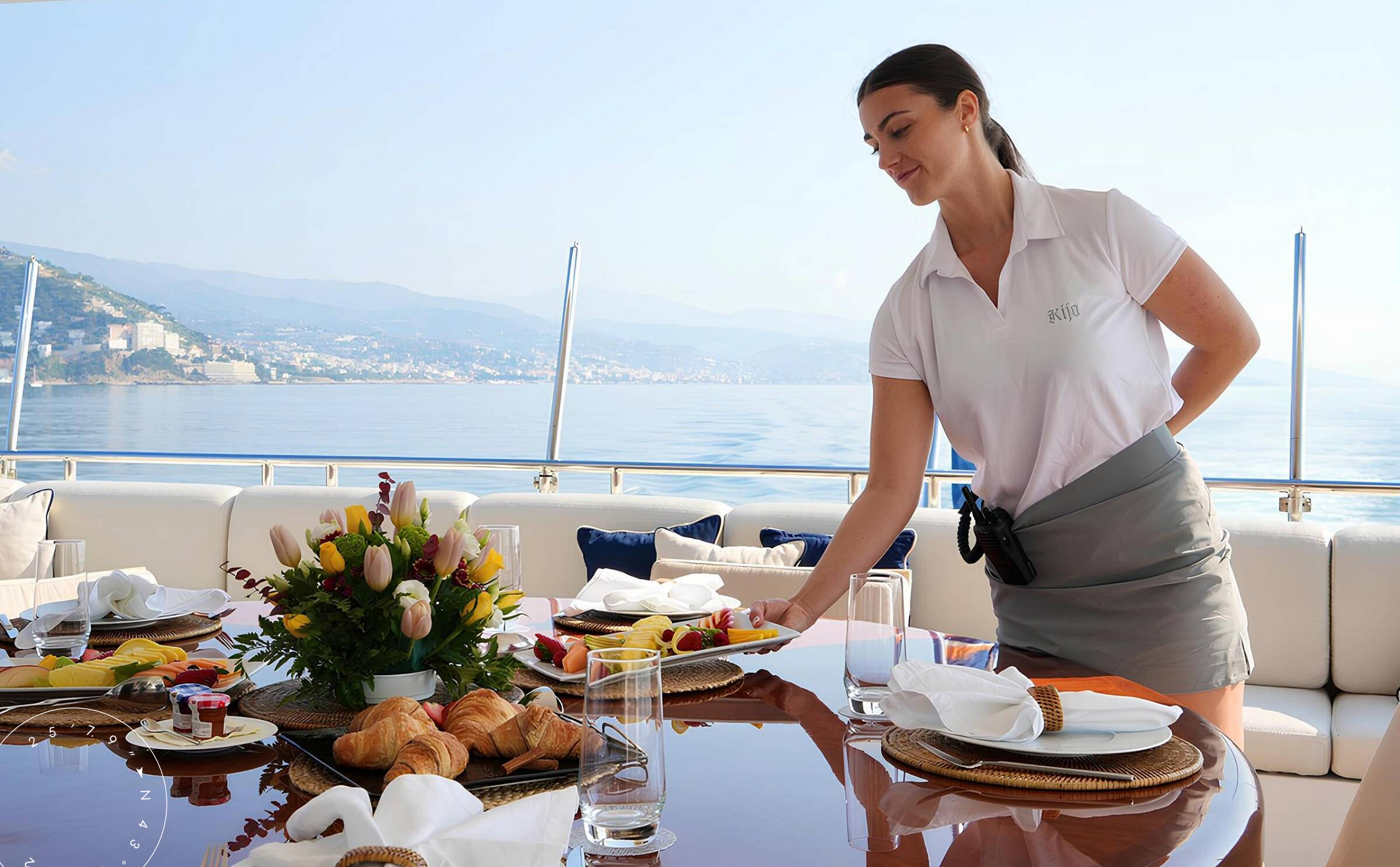
AFT UPPER DECK DINING AREA