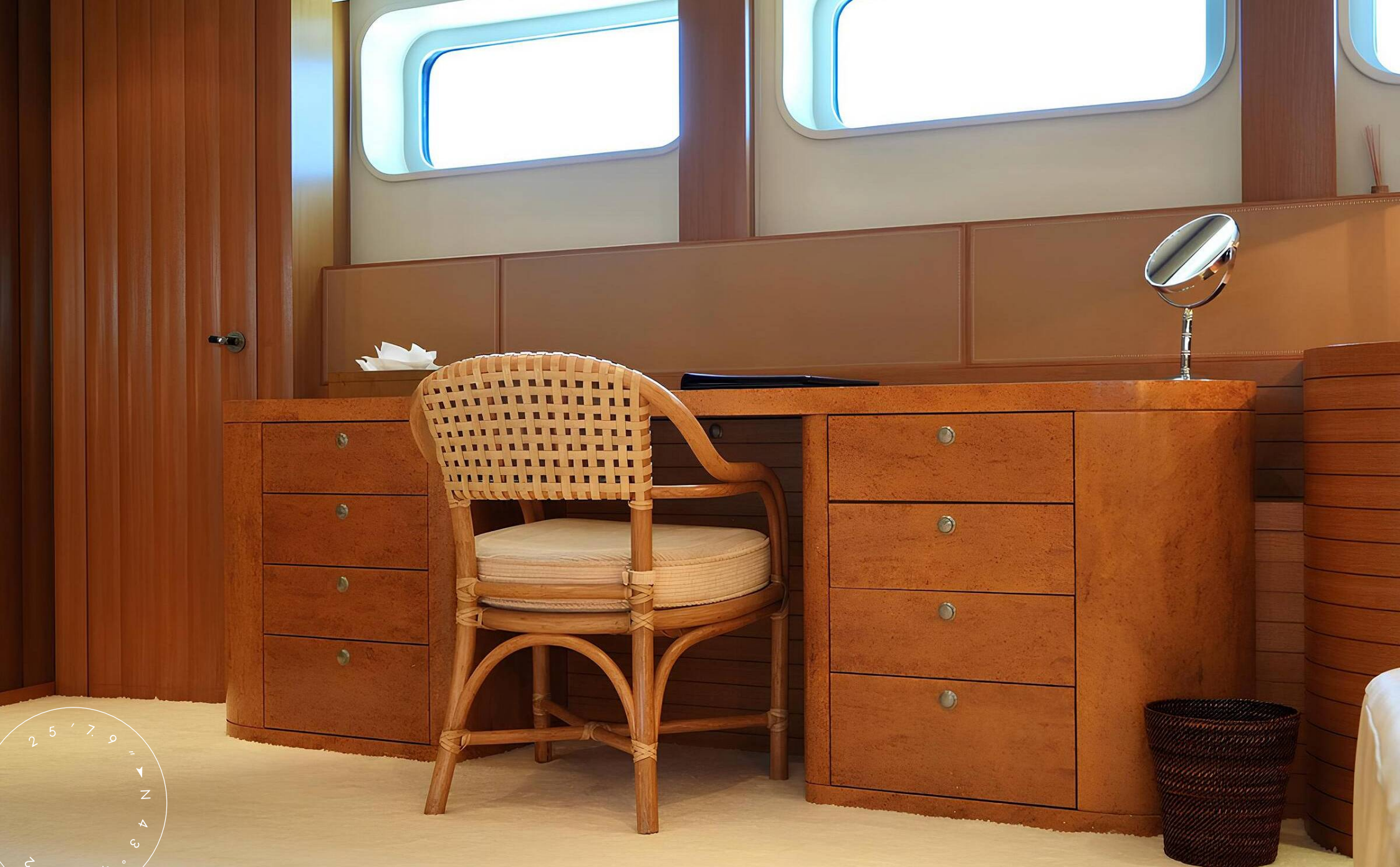
MAKE-UP TABLE IN MASTER CABIN