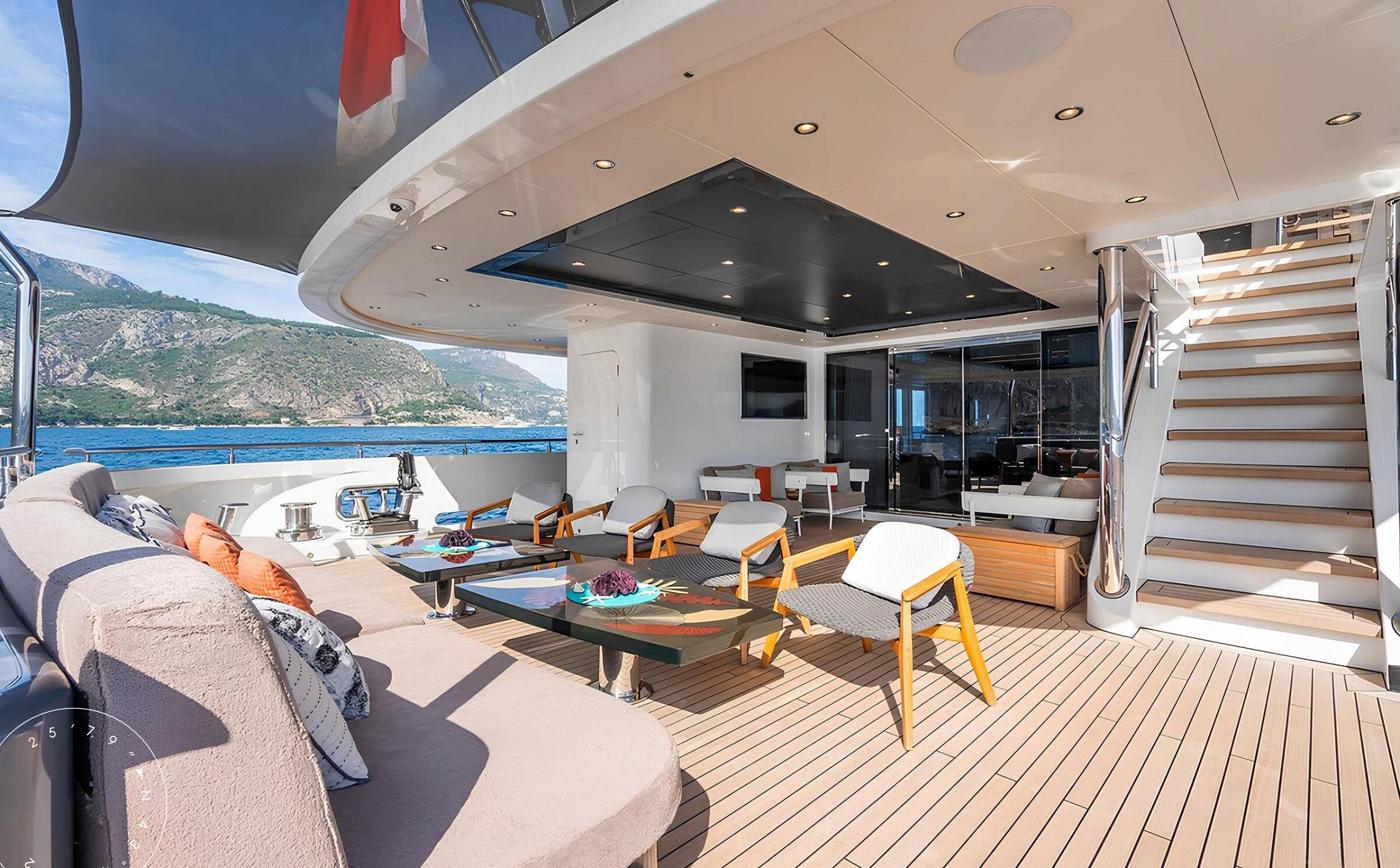
AFT MAIN DECK LOUNGE AREA