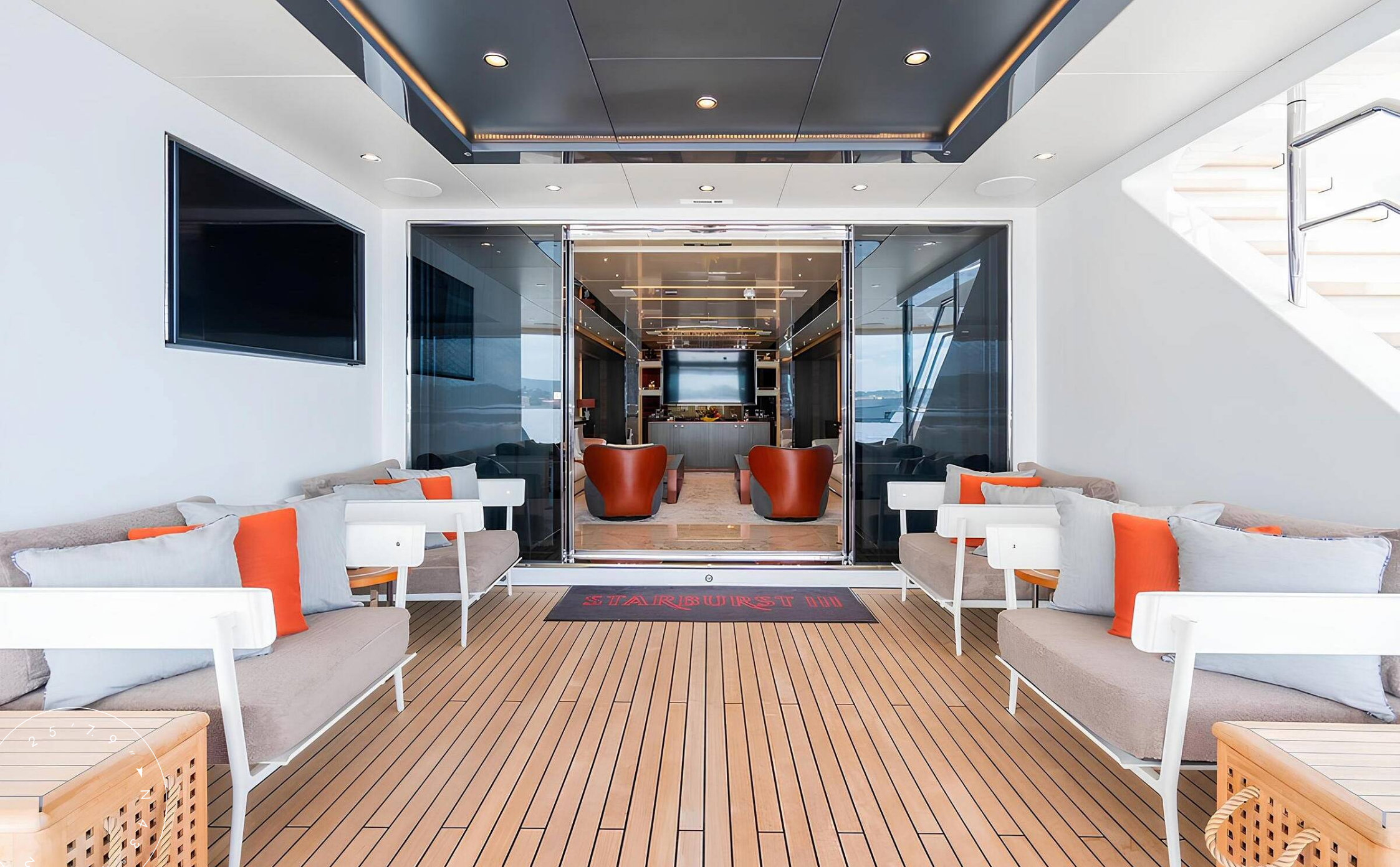
AFT MAIN DECK LOUNGE AREA