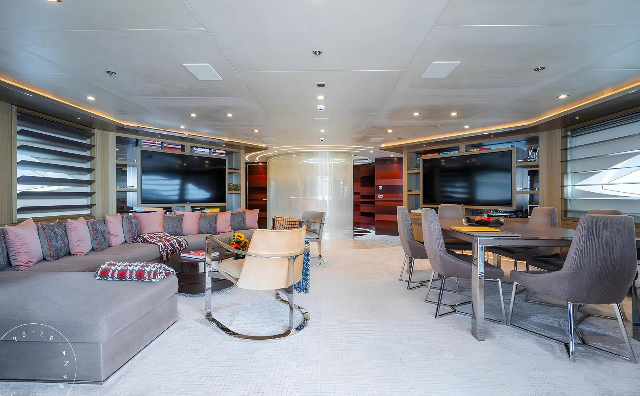
UPPER DECK SALOON