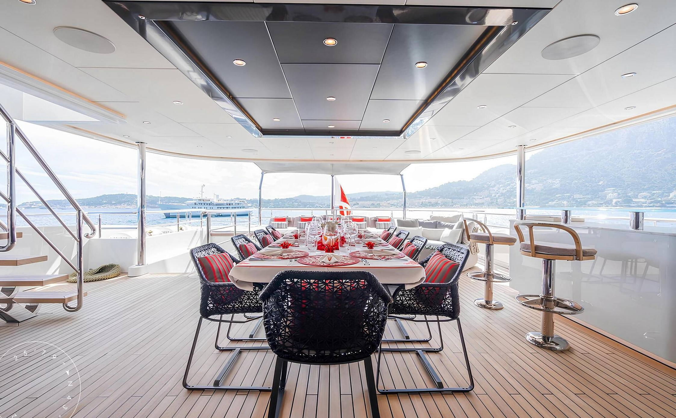
AFT UPPER DECK DINING AREA