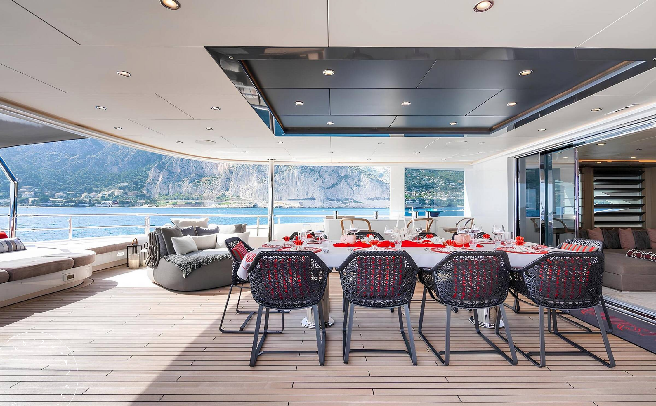
AFT UPPER DECK DINING AREA