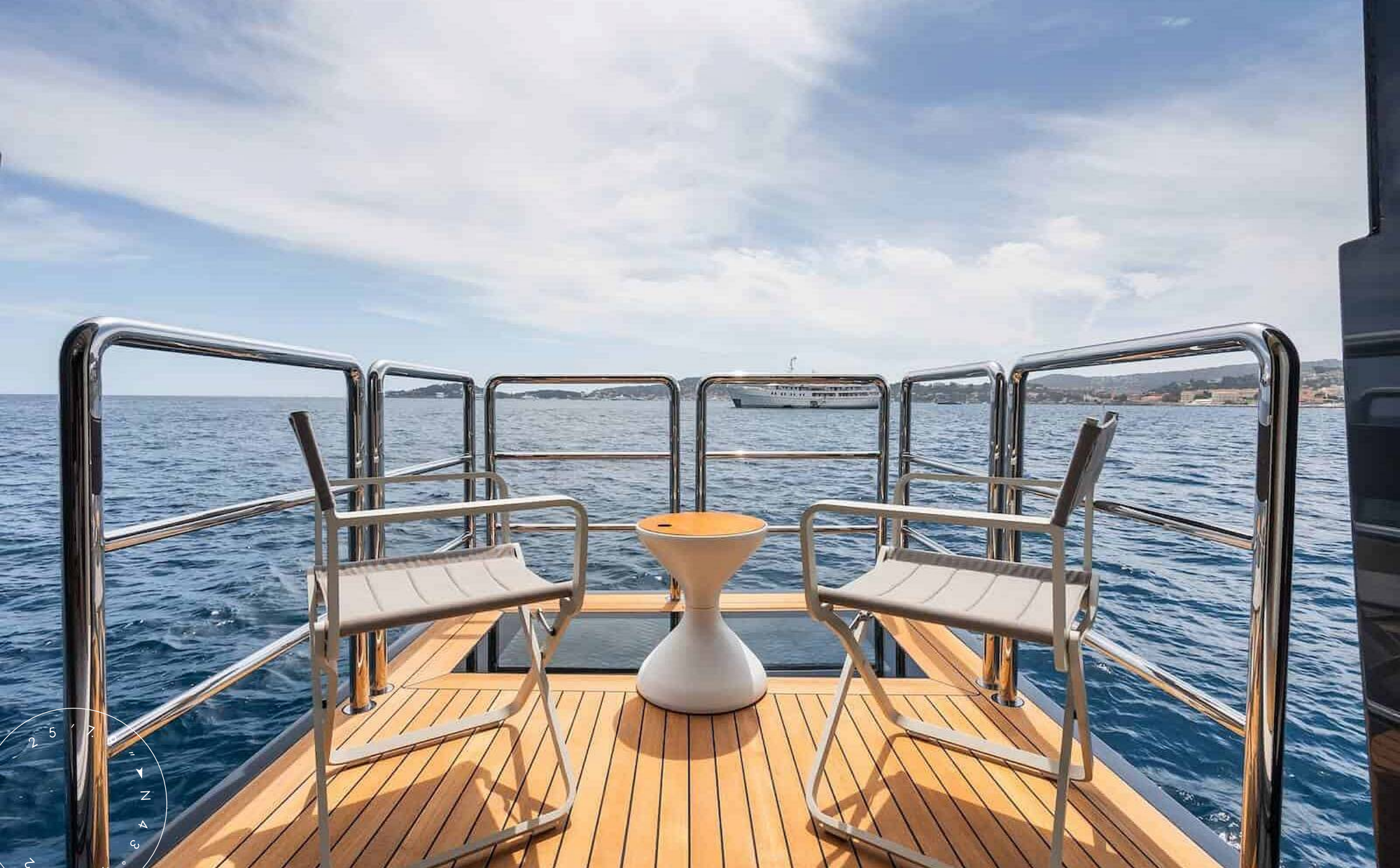
MASTER CABIN FOLDING BALCONY