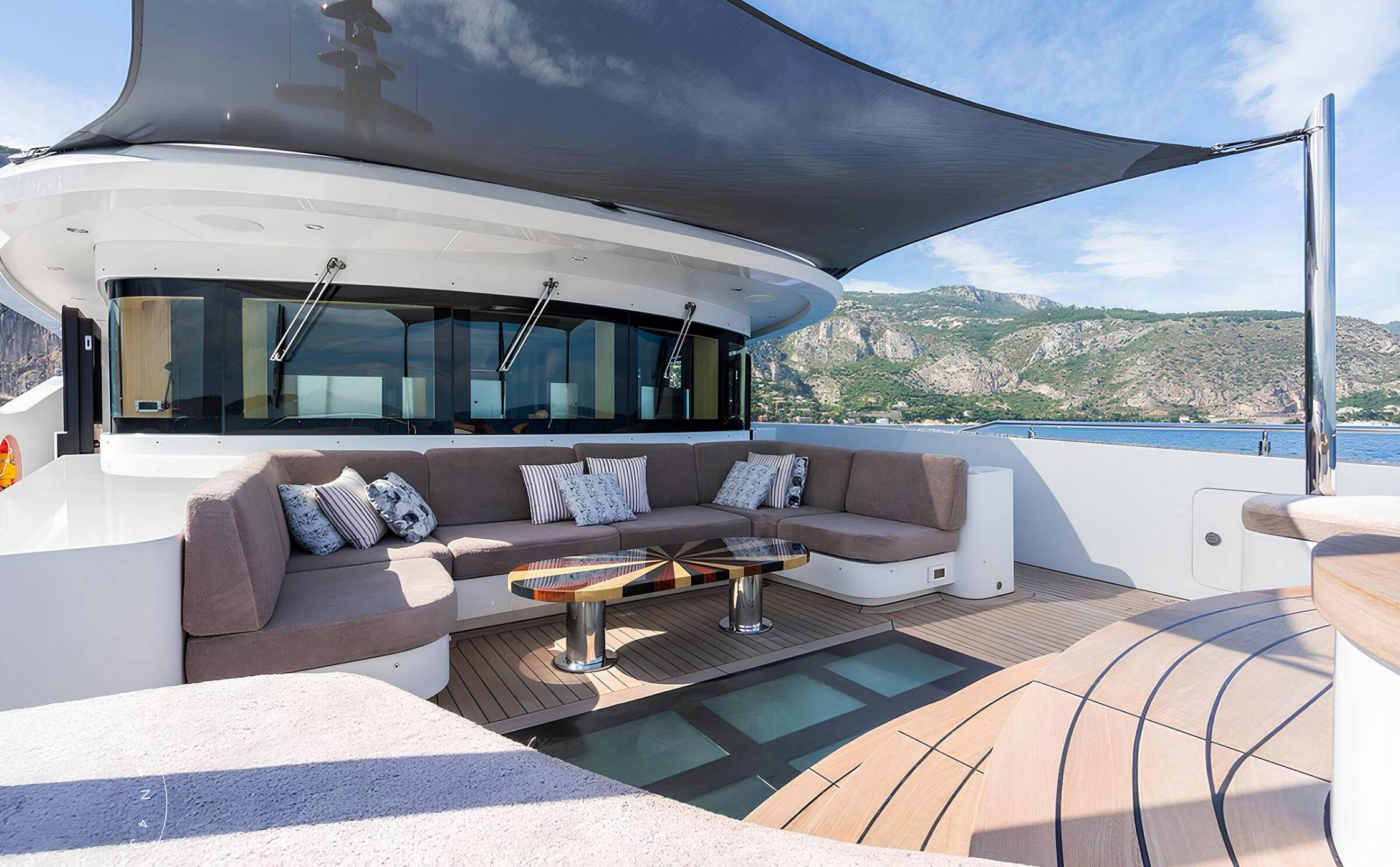
BOW LOUNGE AREA