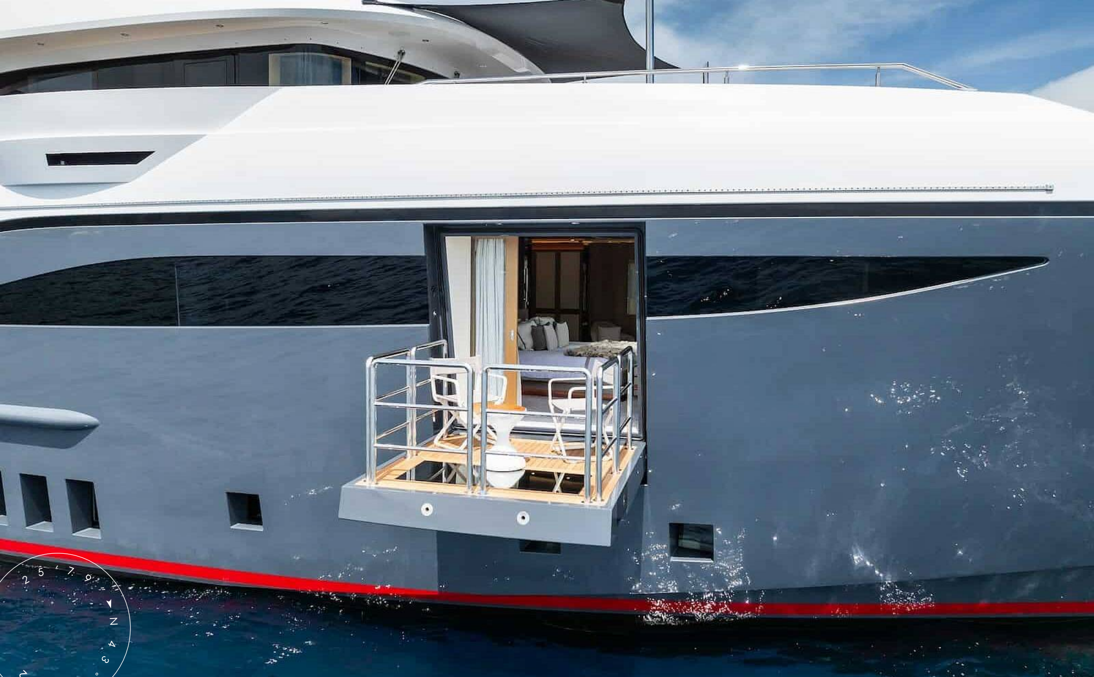
MASTER CABIN FOLDING BALCONY