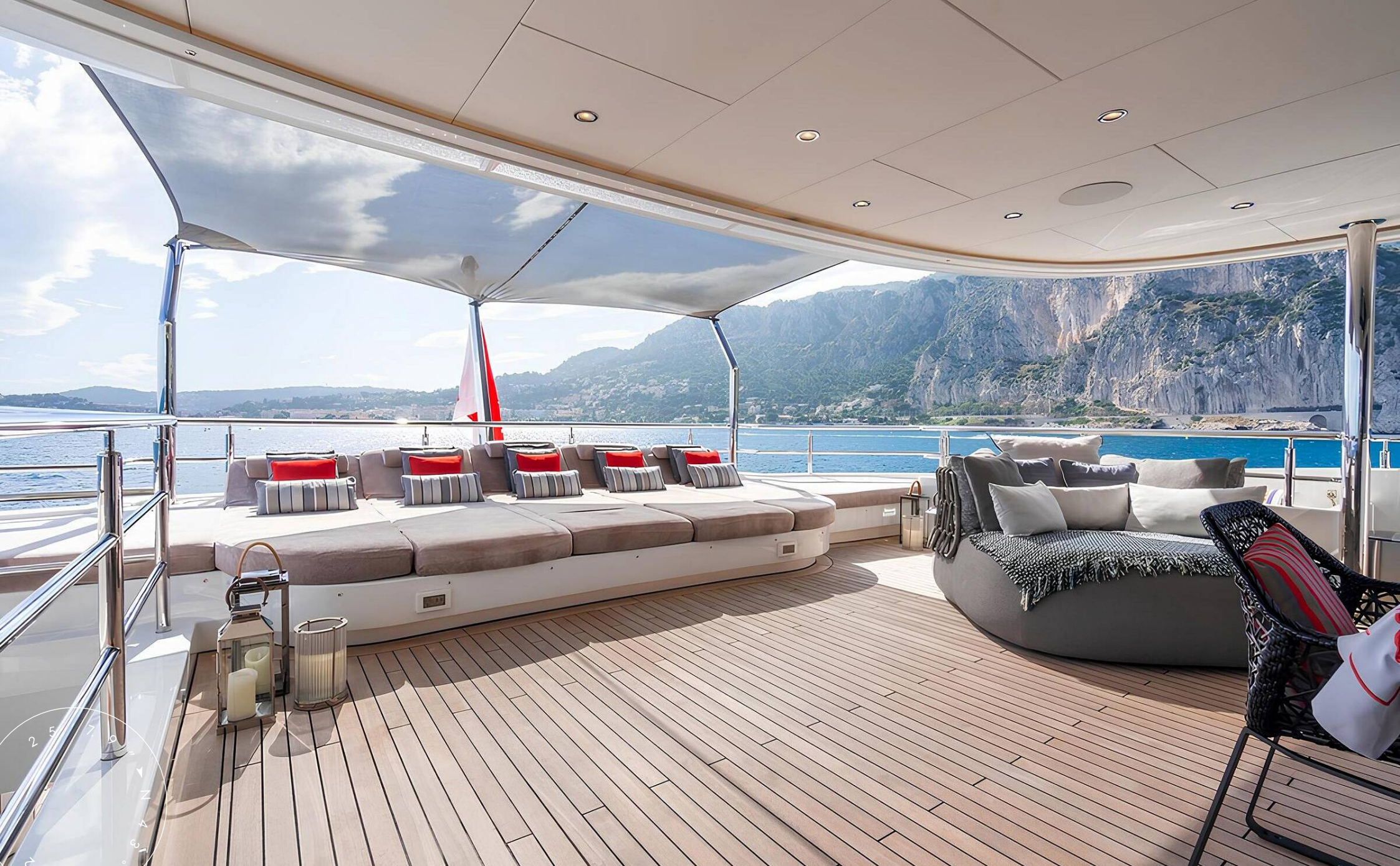
AFT UPPER DECK LOUNGE AREA