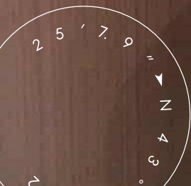
OFFICE IN THE MASTER CABIN