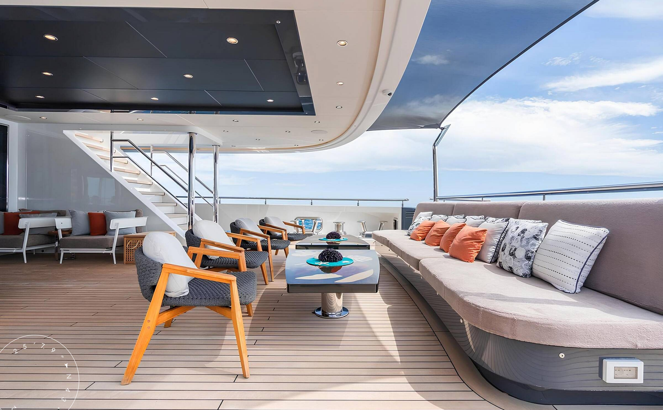
AFT MAIN DECK LOUNGE AREA