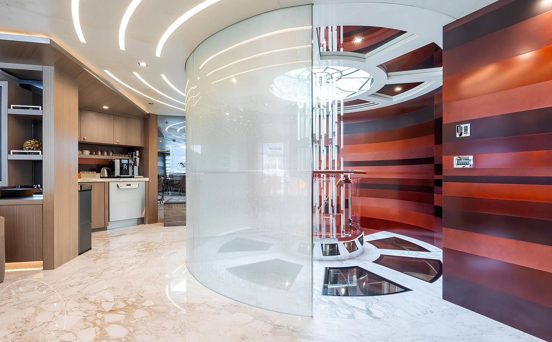
MAIN SALON LOBBY