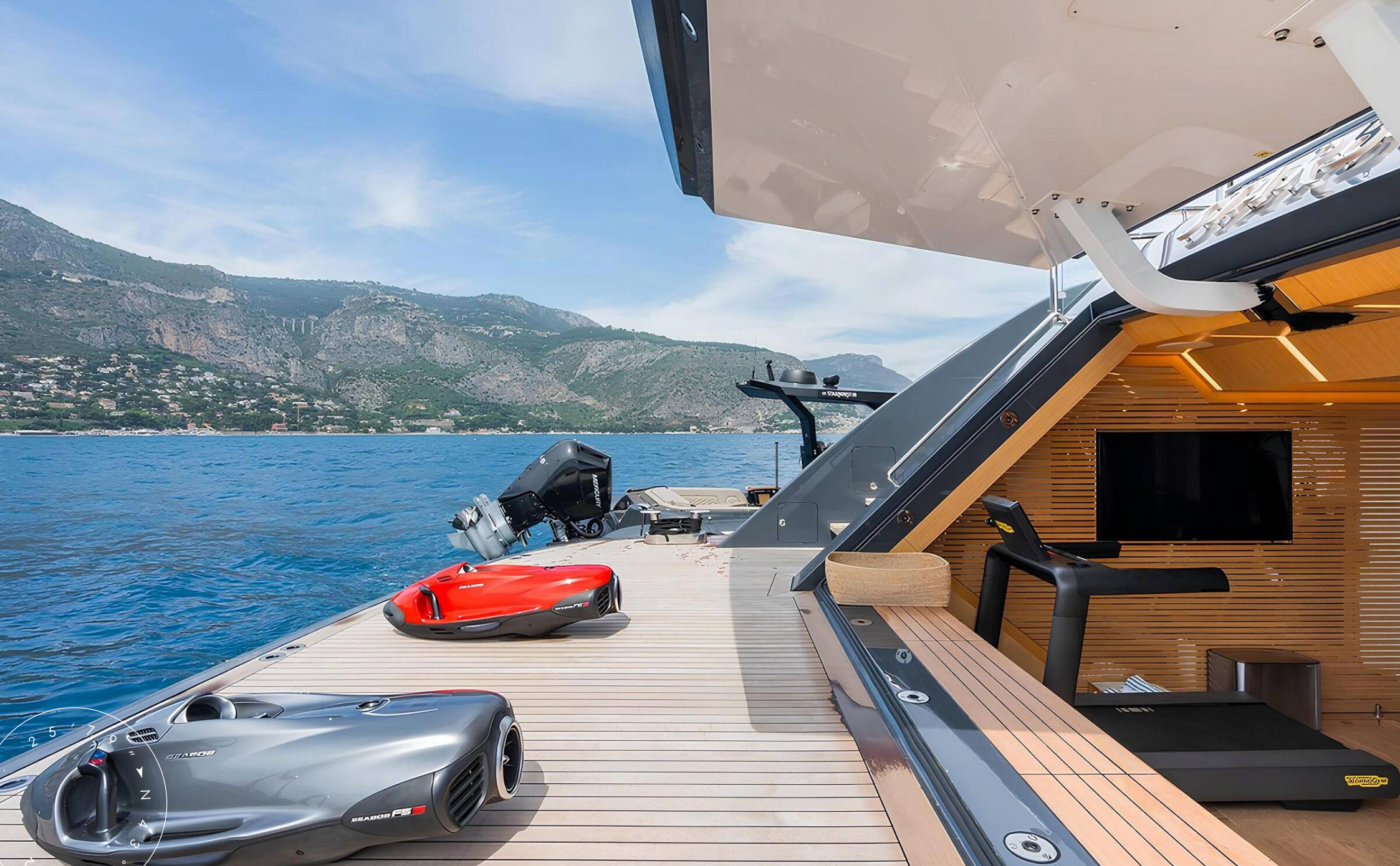
SWIMMING PLATFORM AND WATER TOYS