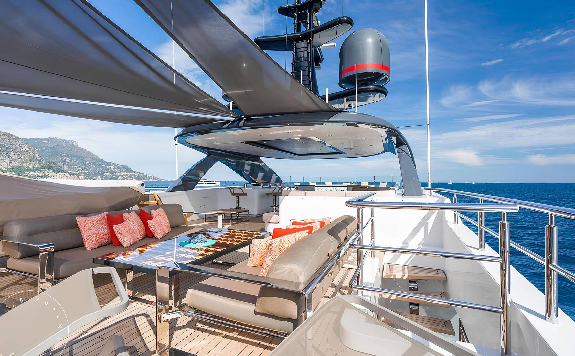
SUNDECK DINING AREA