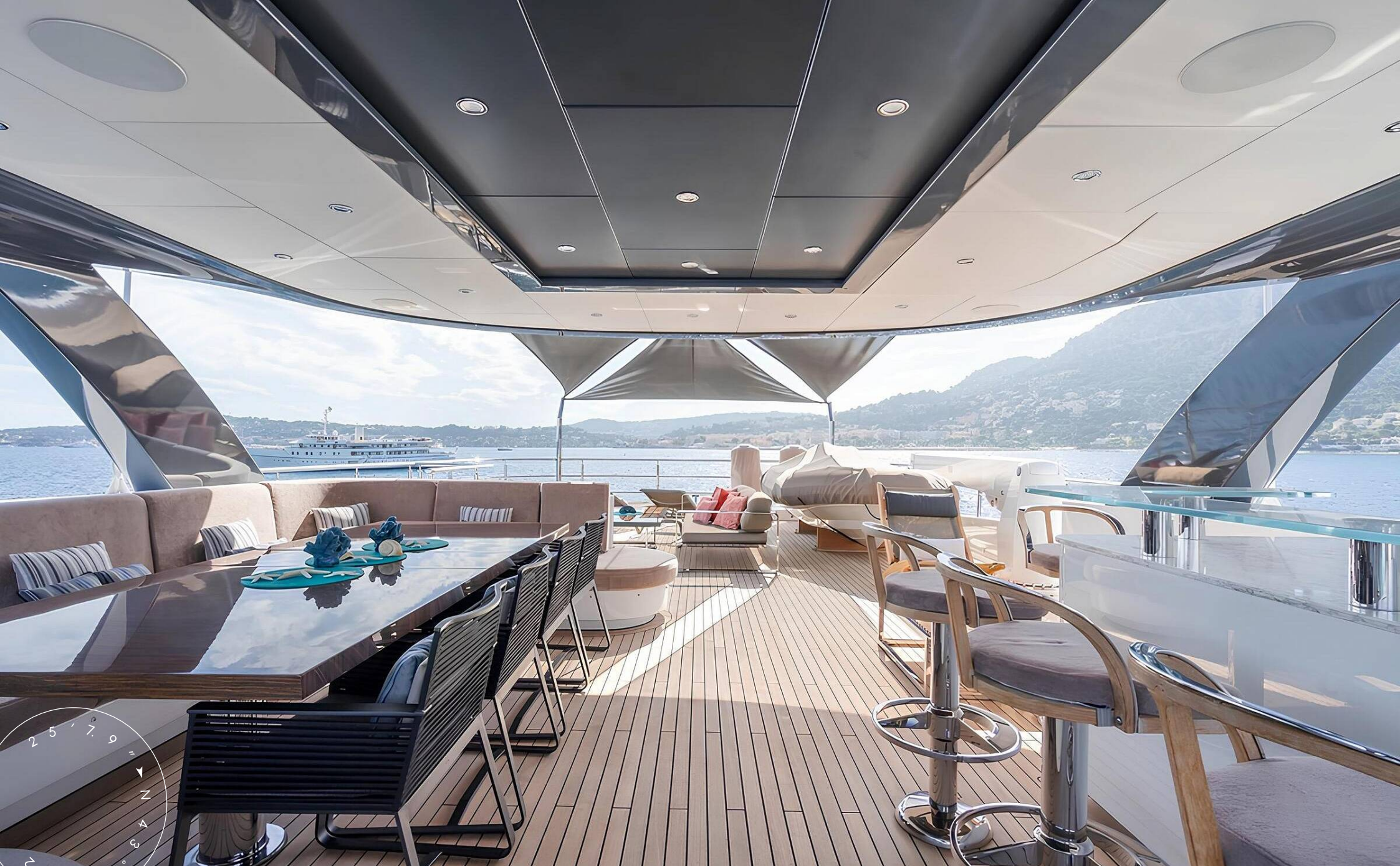
SUNDECK LOUNGE AREA