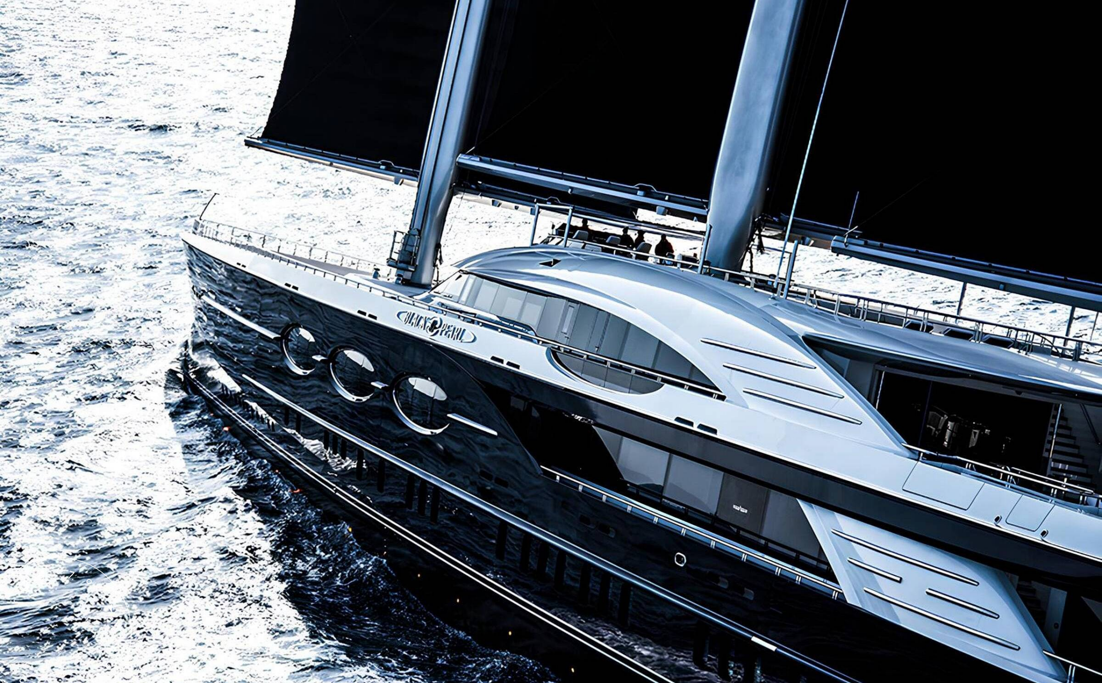
EXTERIOR OCEANCO 105M 2018 MS BLACK PEARL