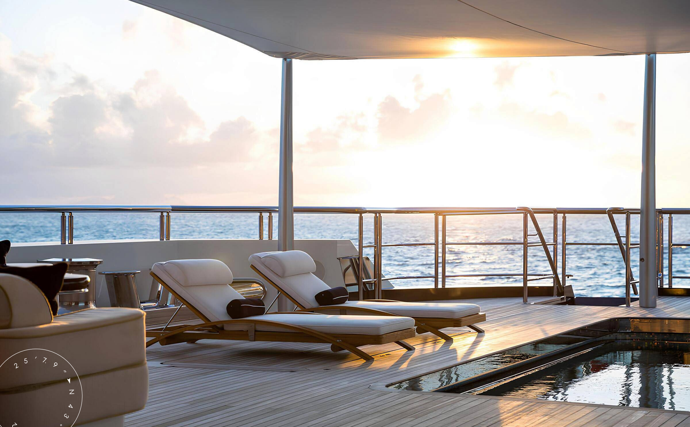
AFT UPPER DECK SWIMMING POOL