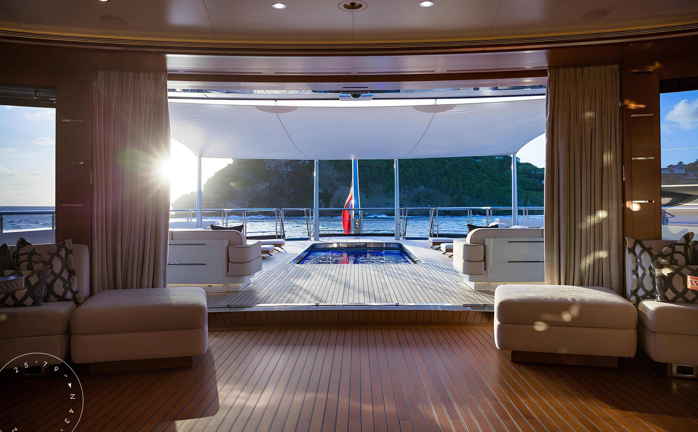
AFT UPPER DECK SWIMMING POOL