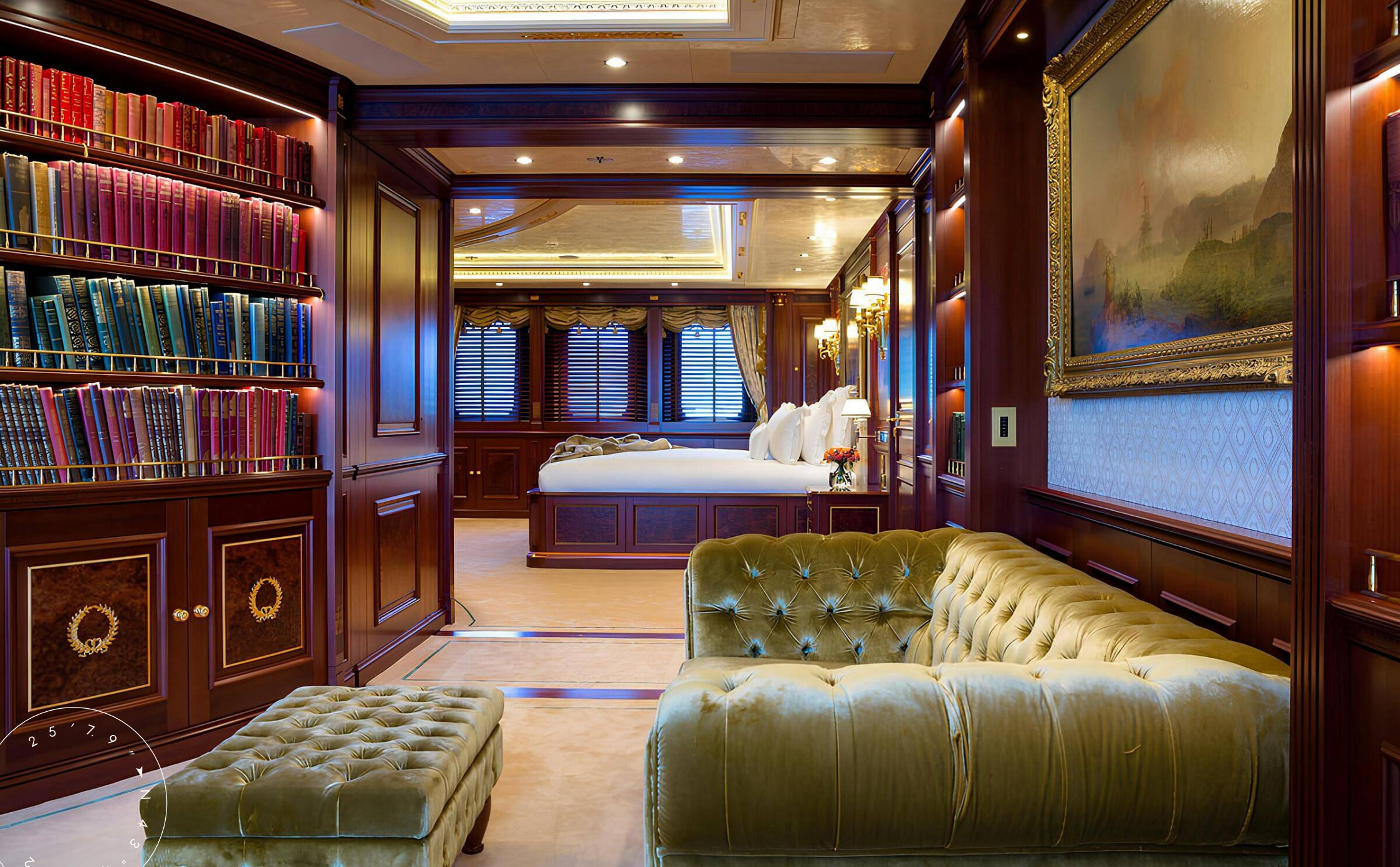
MASTER CABIN LOUNGE AREA