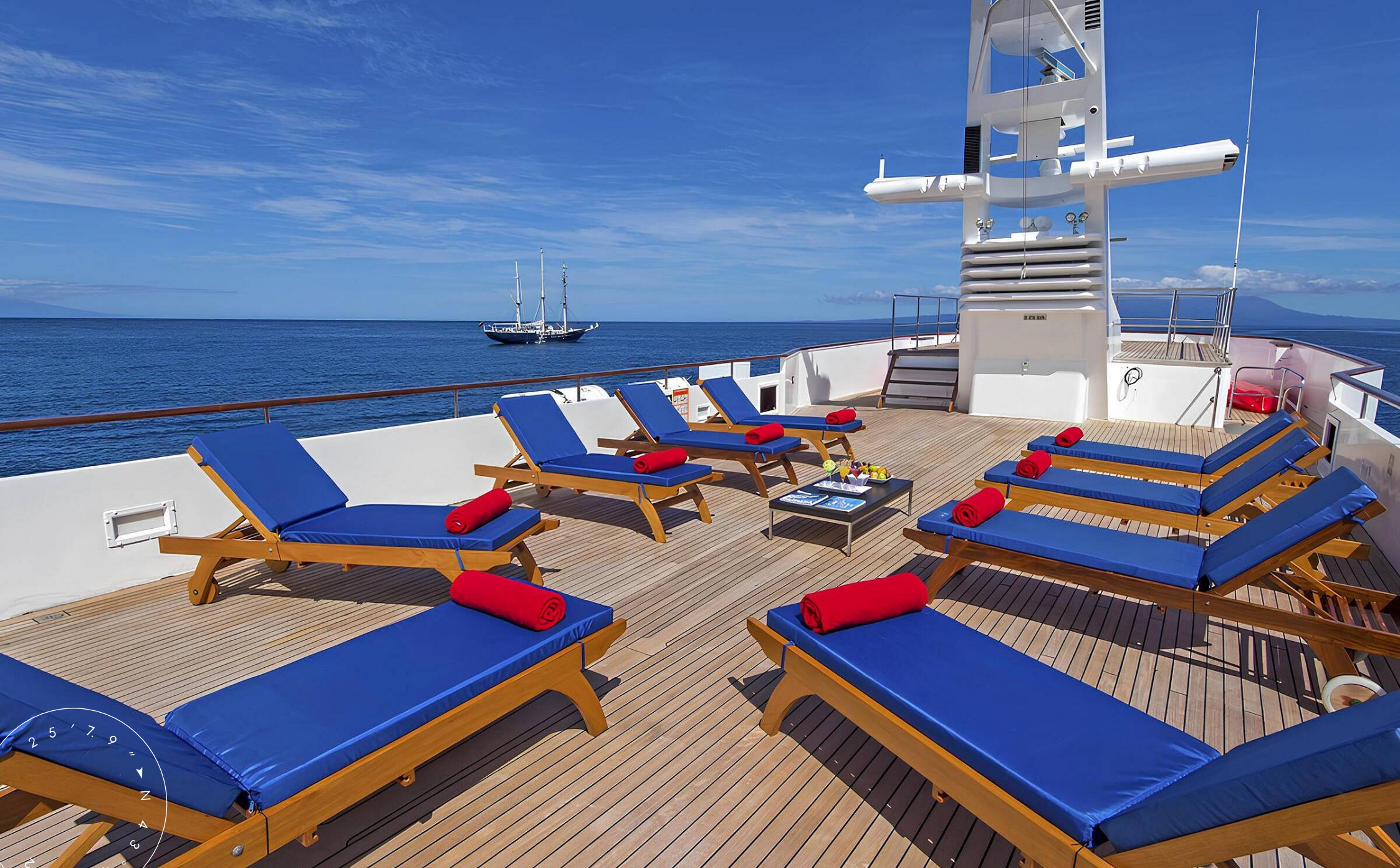
SUNDECK SUNBATHING AREA