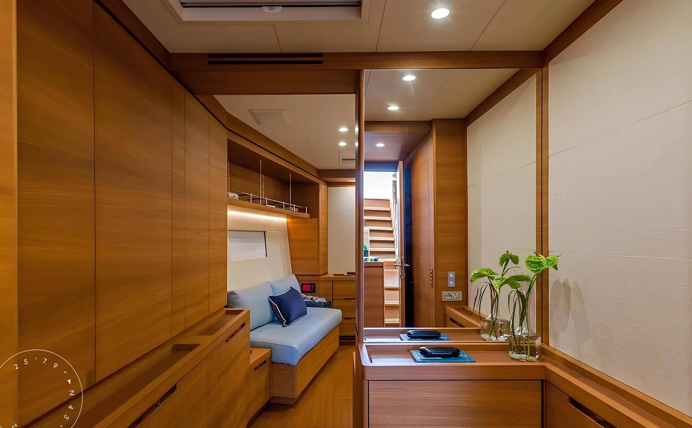
MASTER CABIN LOUNGE AREA