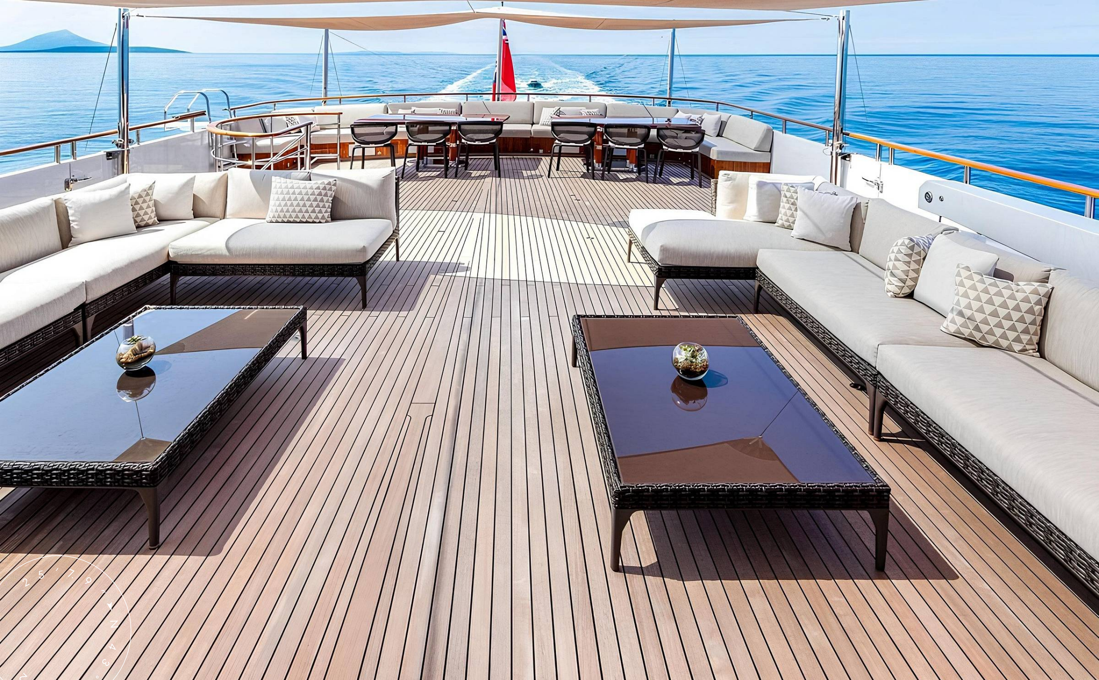
AFT UPPER DECK LOUNGE AREA