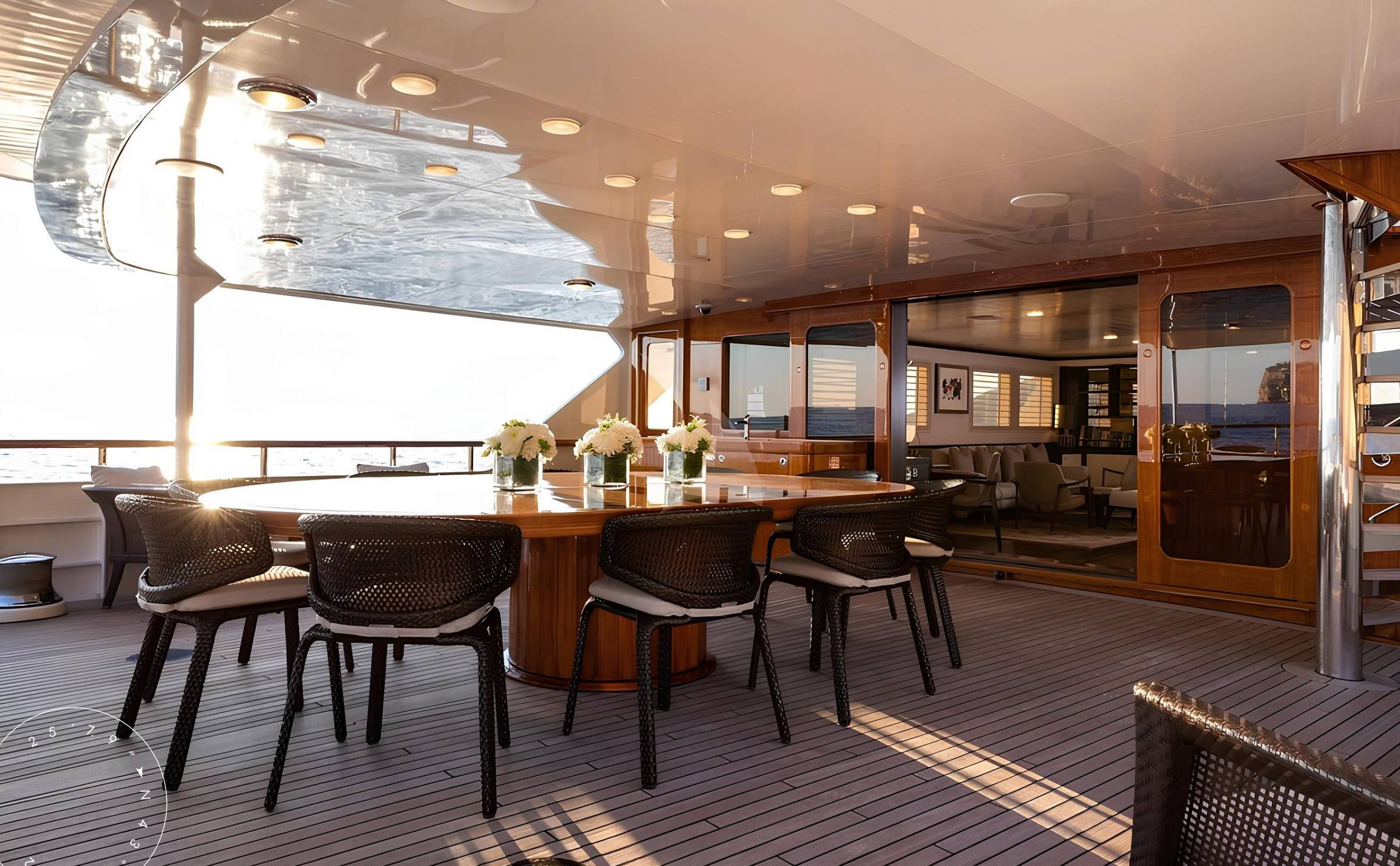
AFT MAIN DECK DINING AREA