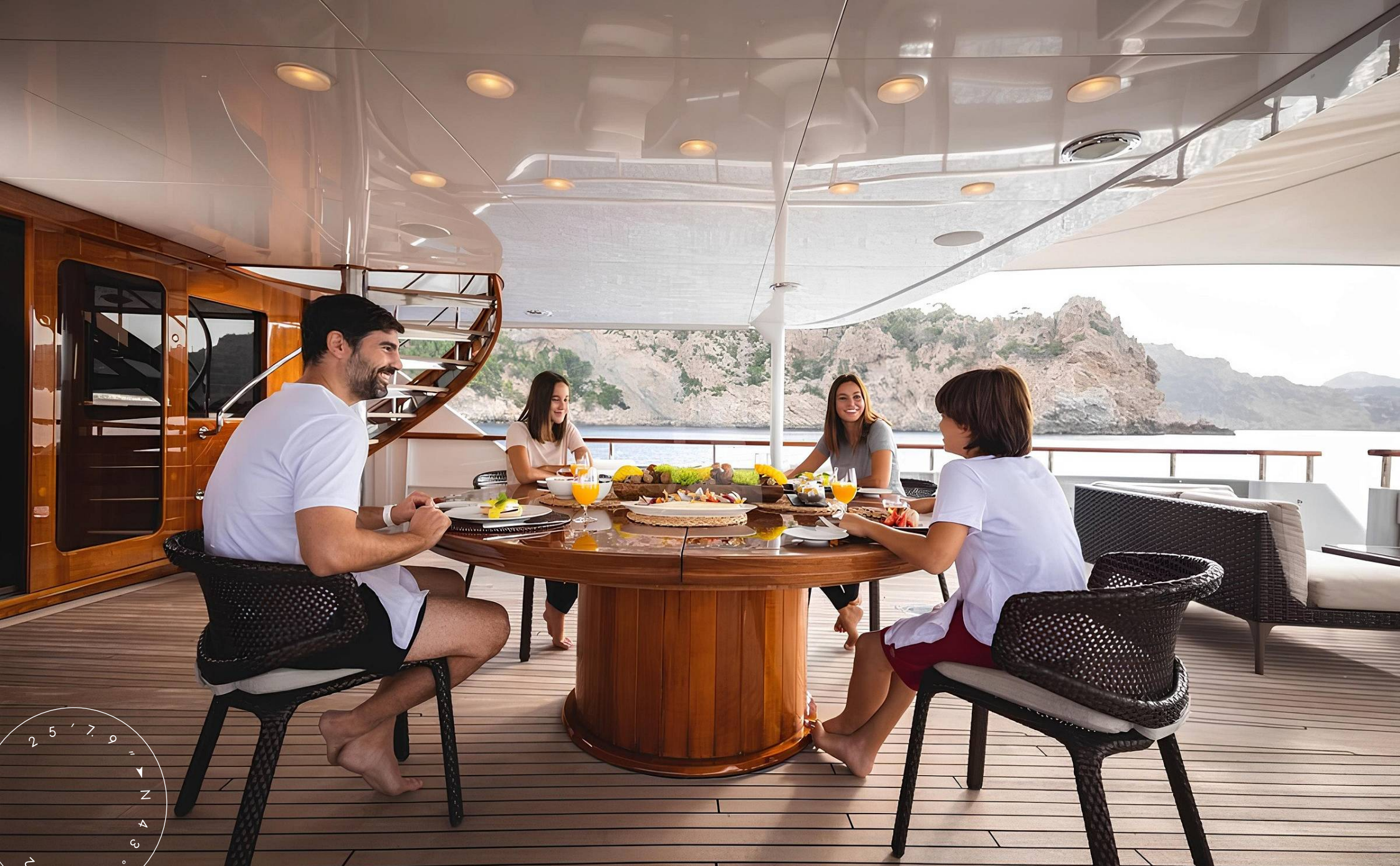
AFT UPPER DECK DINING AREA