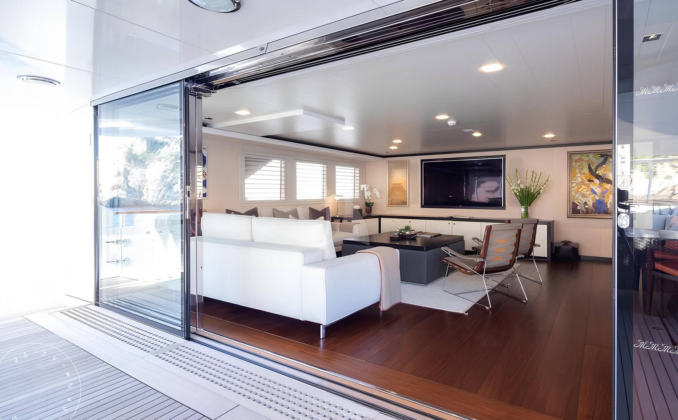
ENTRANCE TO THE MAIN SALON