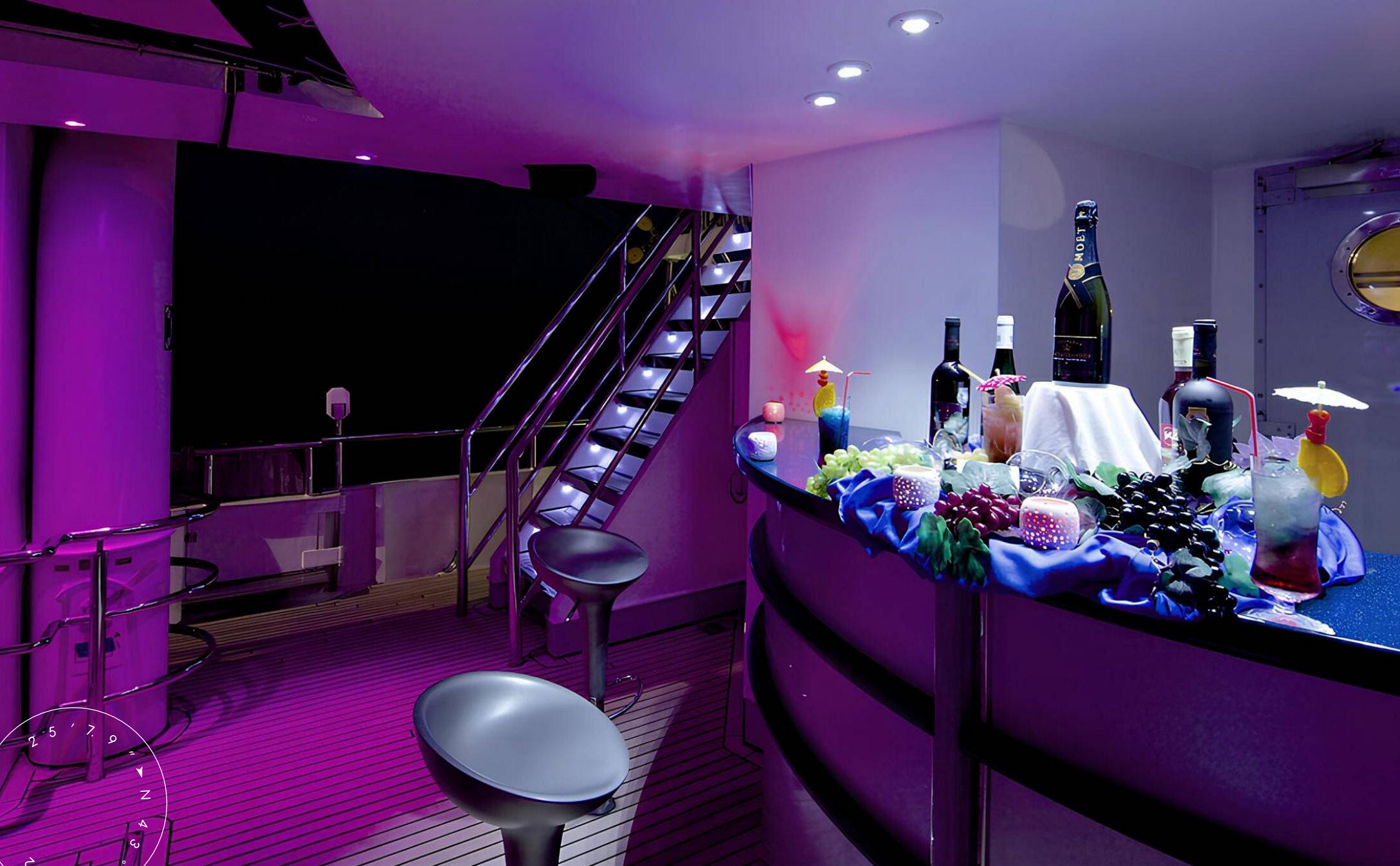
MAIN DECK BAR