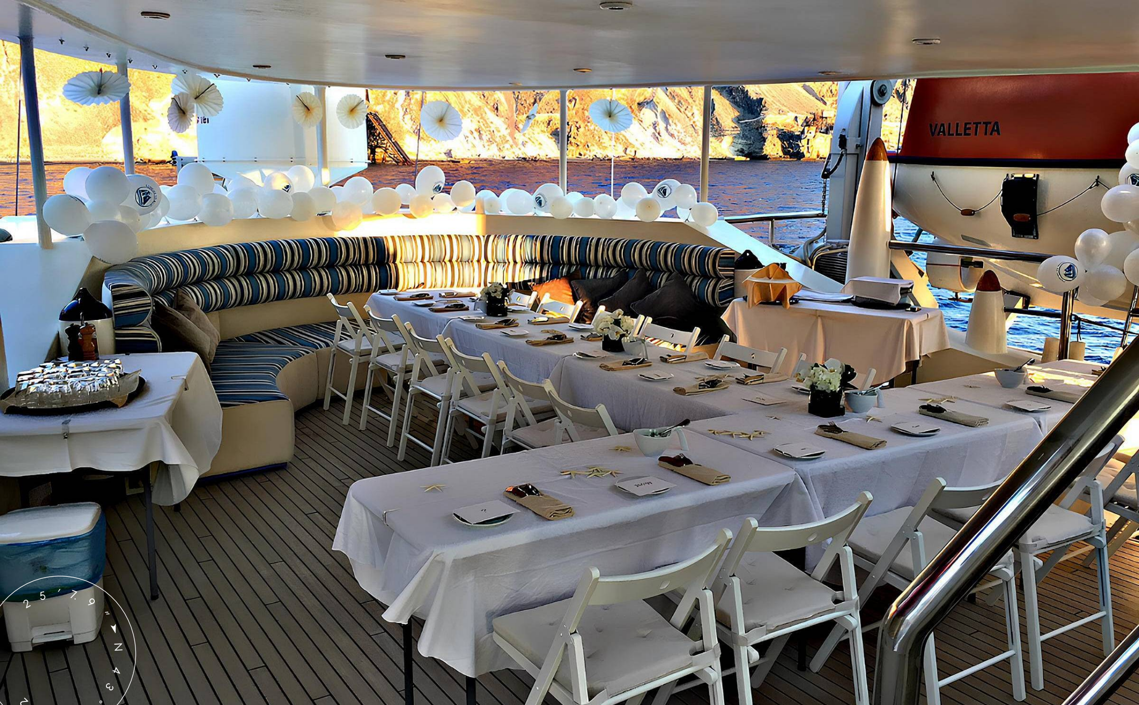
UUPPER DECK DINING AREA