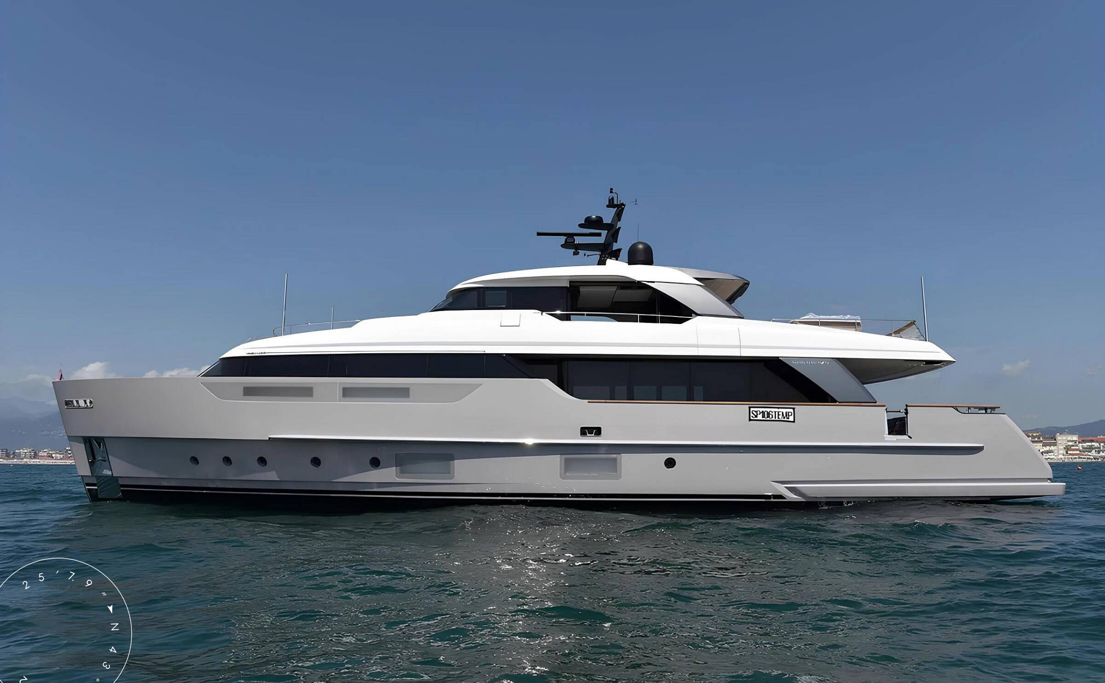
EXTERIOR SANLORENZO SD96 2020 MY MALKIA