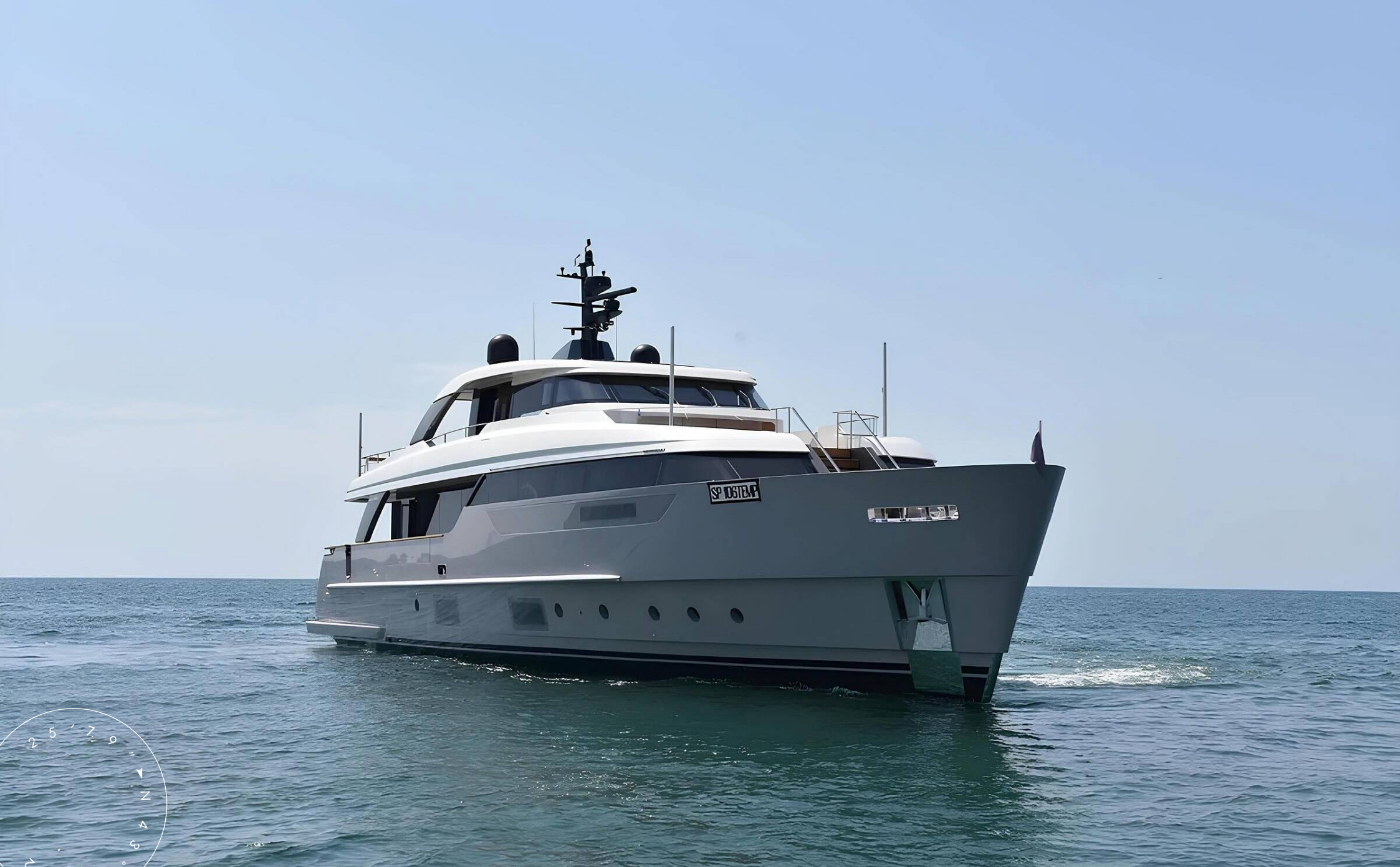
EXTERIOR SANLORENZO SD96 2020 MY MALKIA