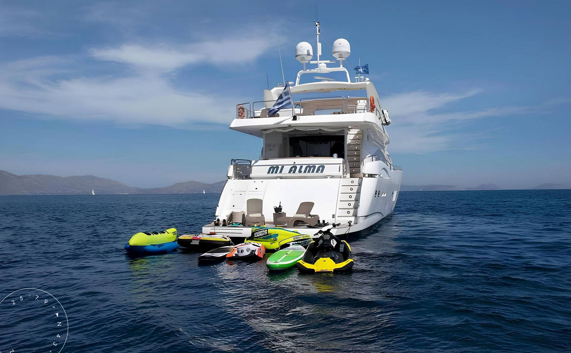
EXTERIOR SUNSEEKER 105 YACHT 2001 MY MI ALMA