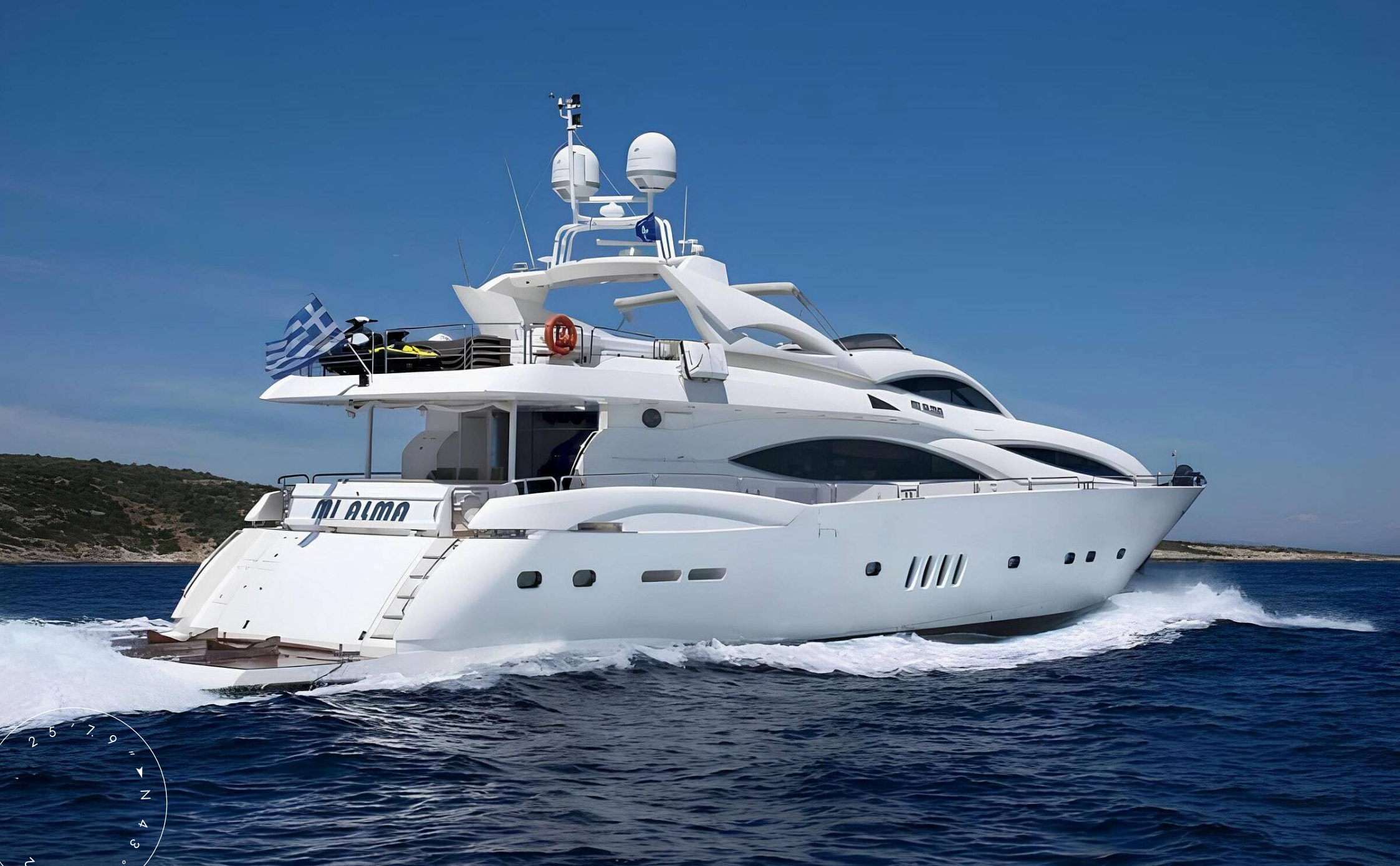
EXTERIOR SUNSEEKER 105 YACHT 2001 MY MI ALMA