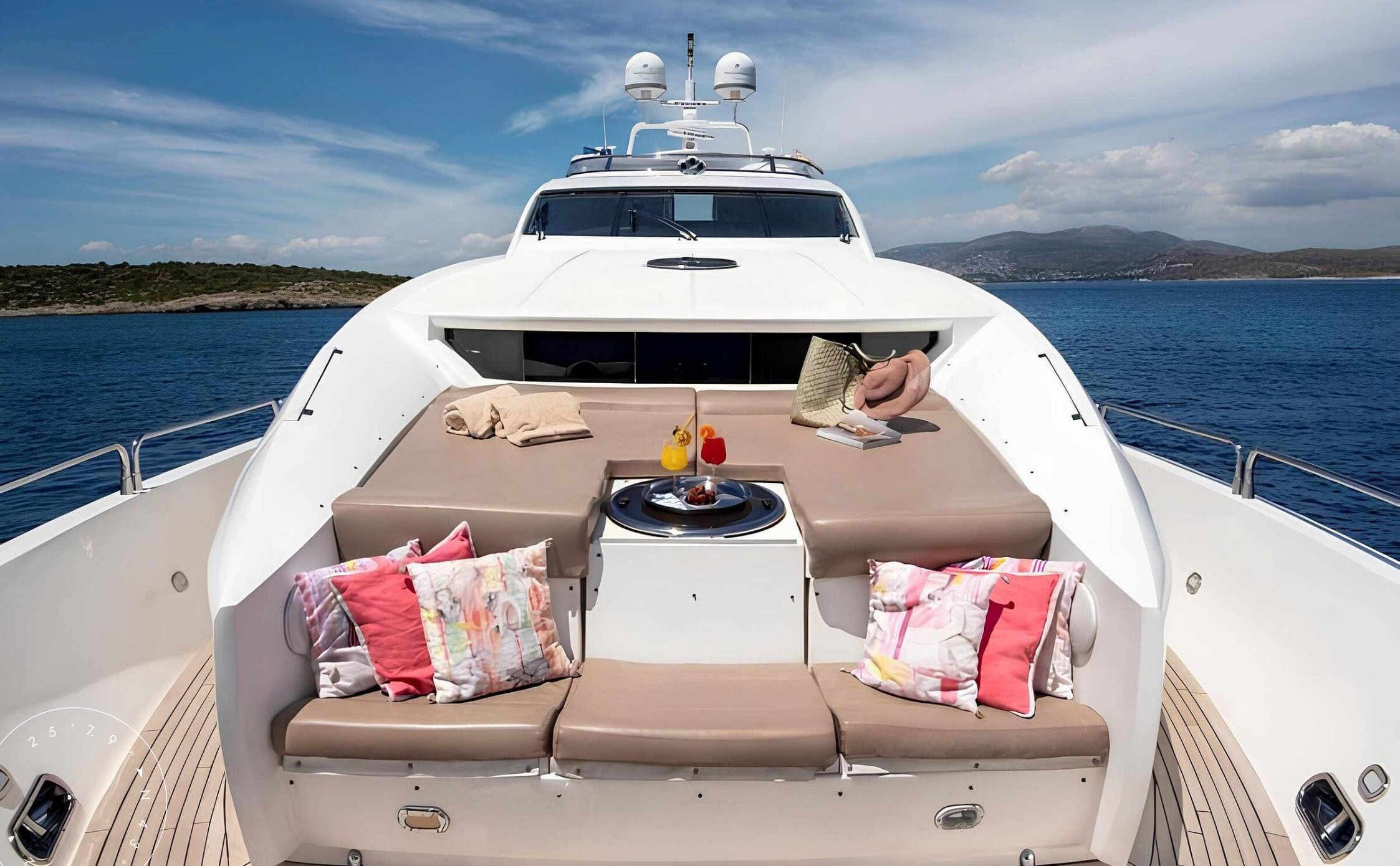
BOW LOUNGE AREA