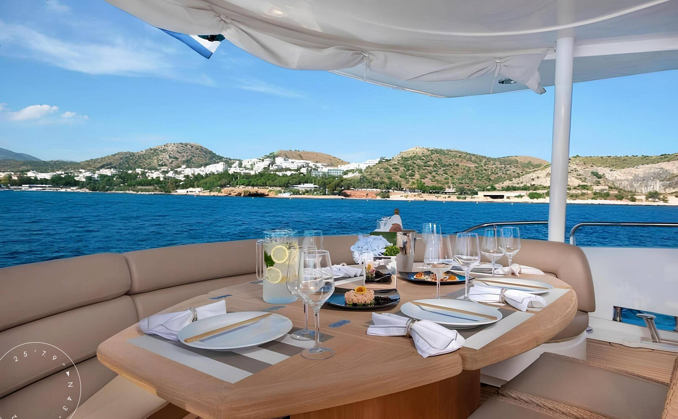
COCKPIT DINING AREA