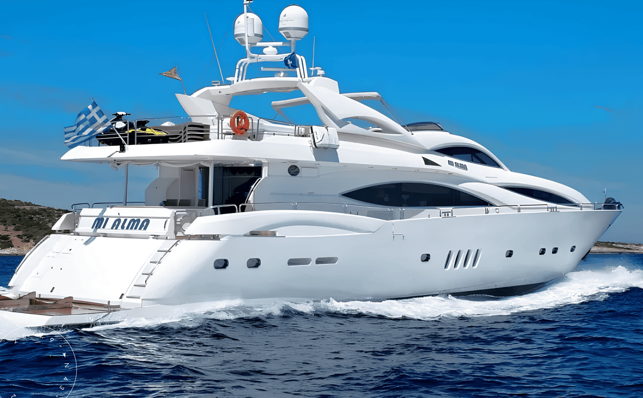
EXTERIOR SUNSEEKER 105 YACHT 2001 MY MI ALMA