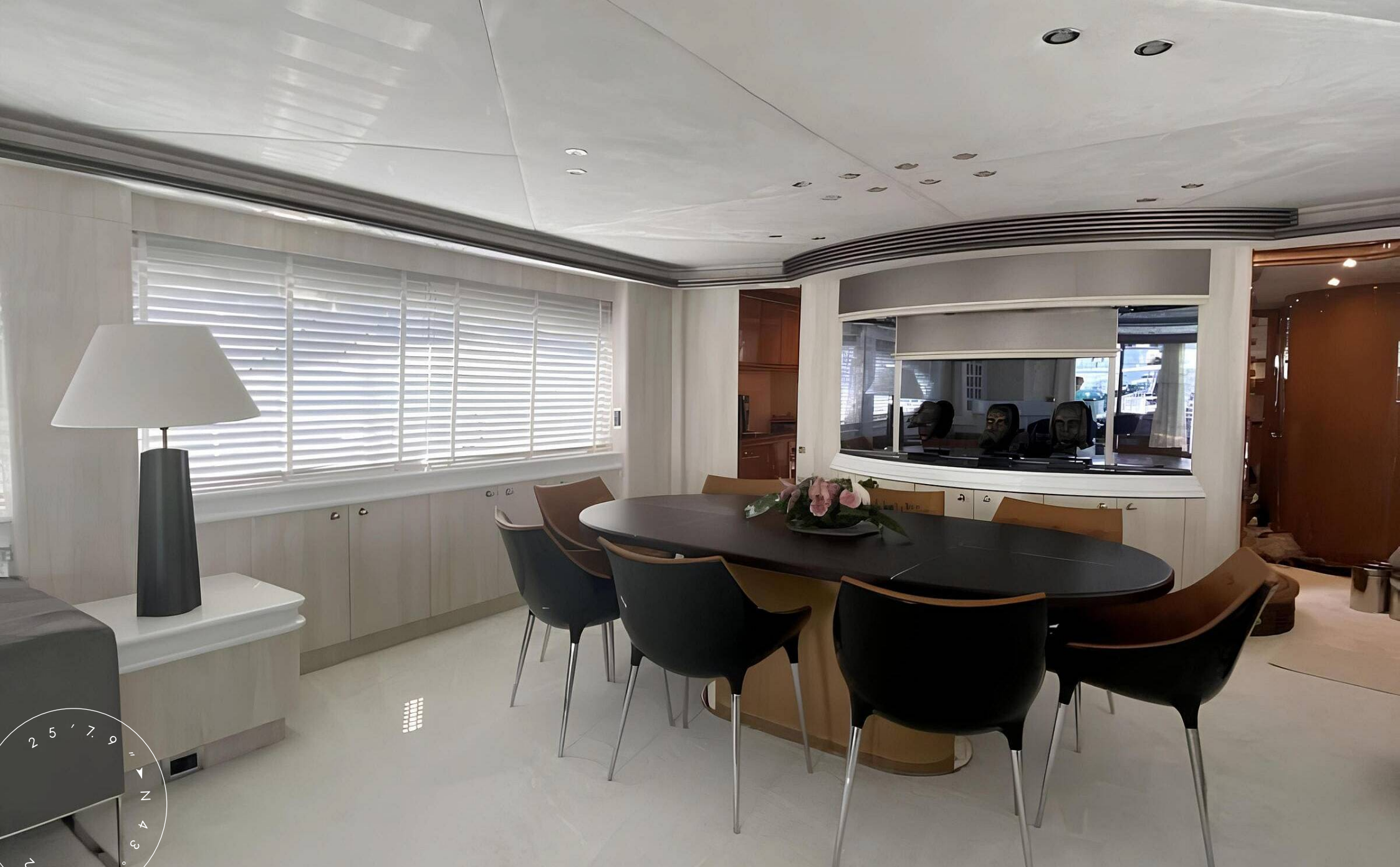
MAIN SALON DINING AREA