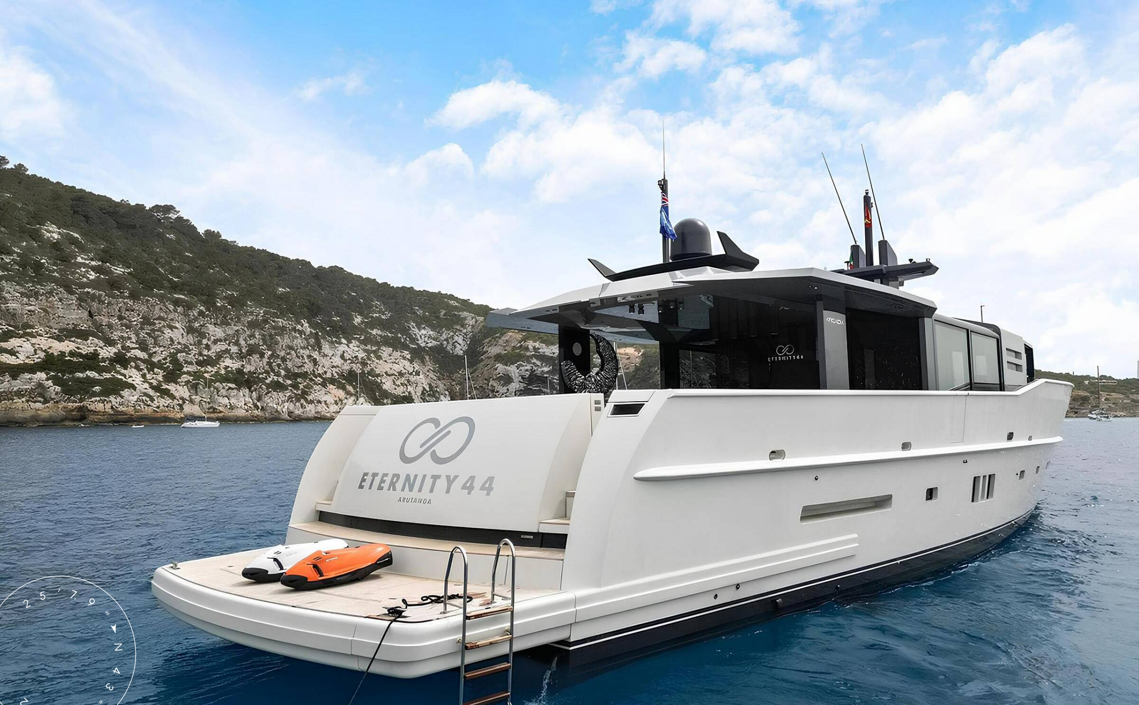
EXTERIOR ARCADIA A85 2010 MY ETERNITY 44