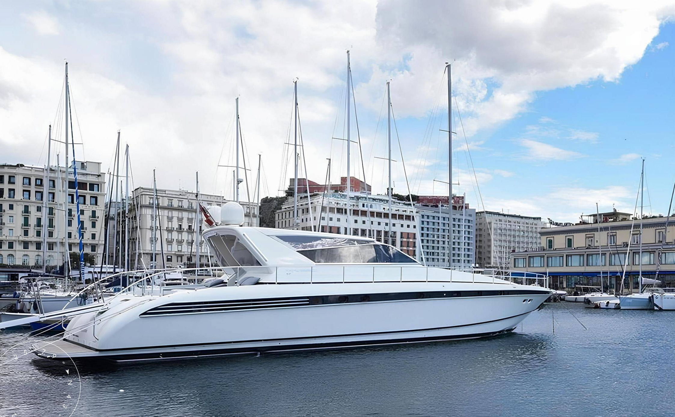
EXTERIOR LEOPARD (ARNO) 23 2004 MY DIDI