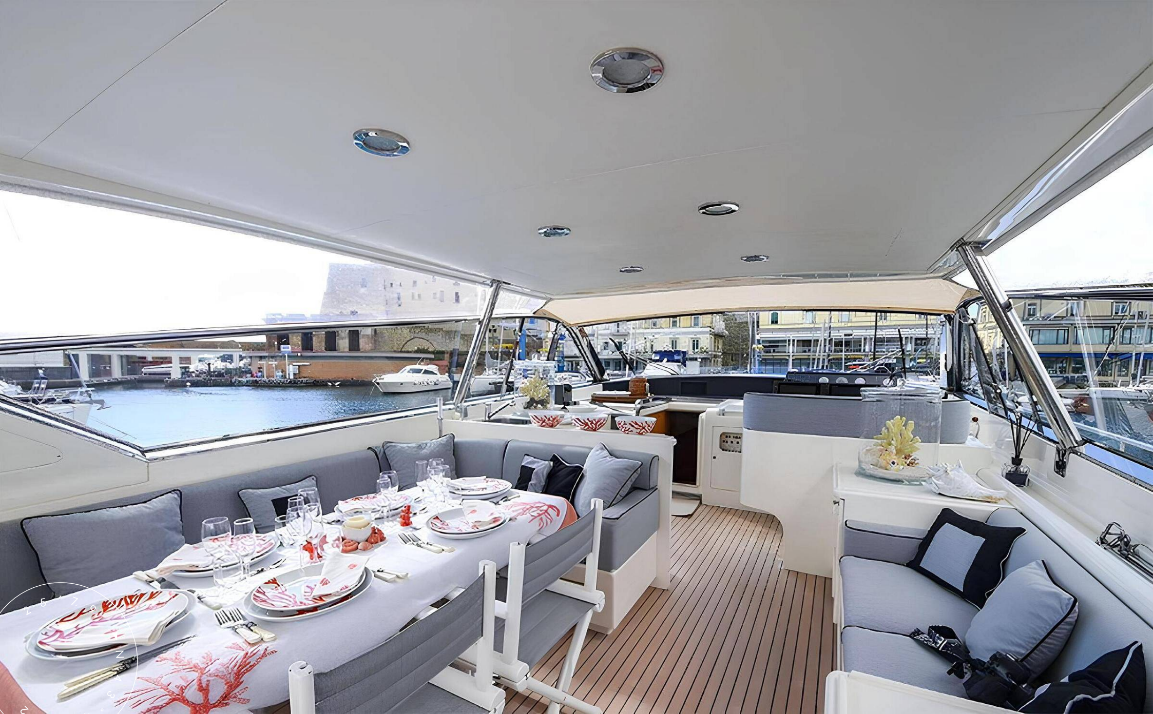
MAIN DECK LOUNGE AREA