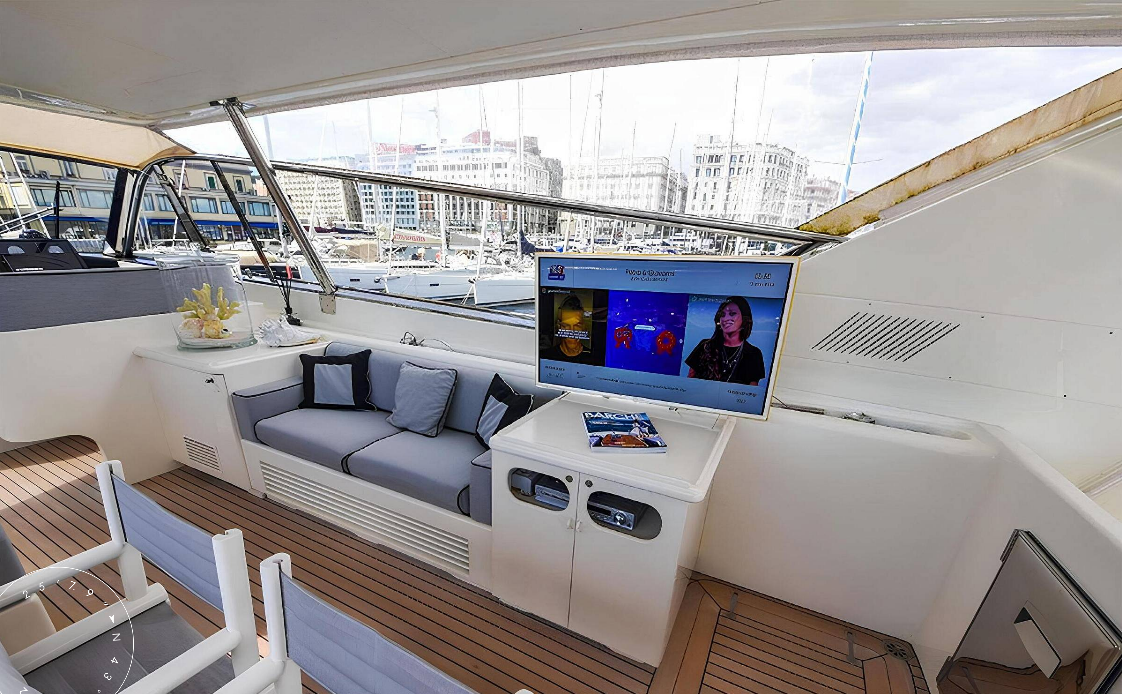
MAIN DECK LOUNGE AREA