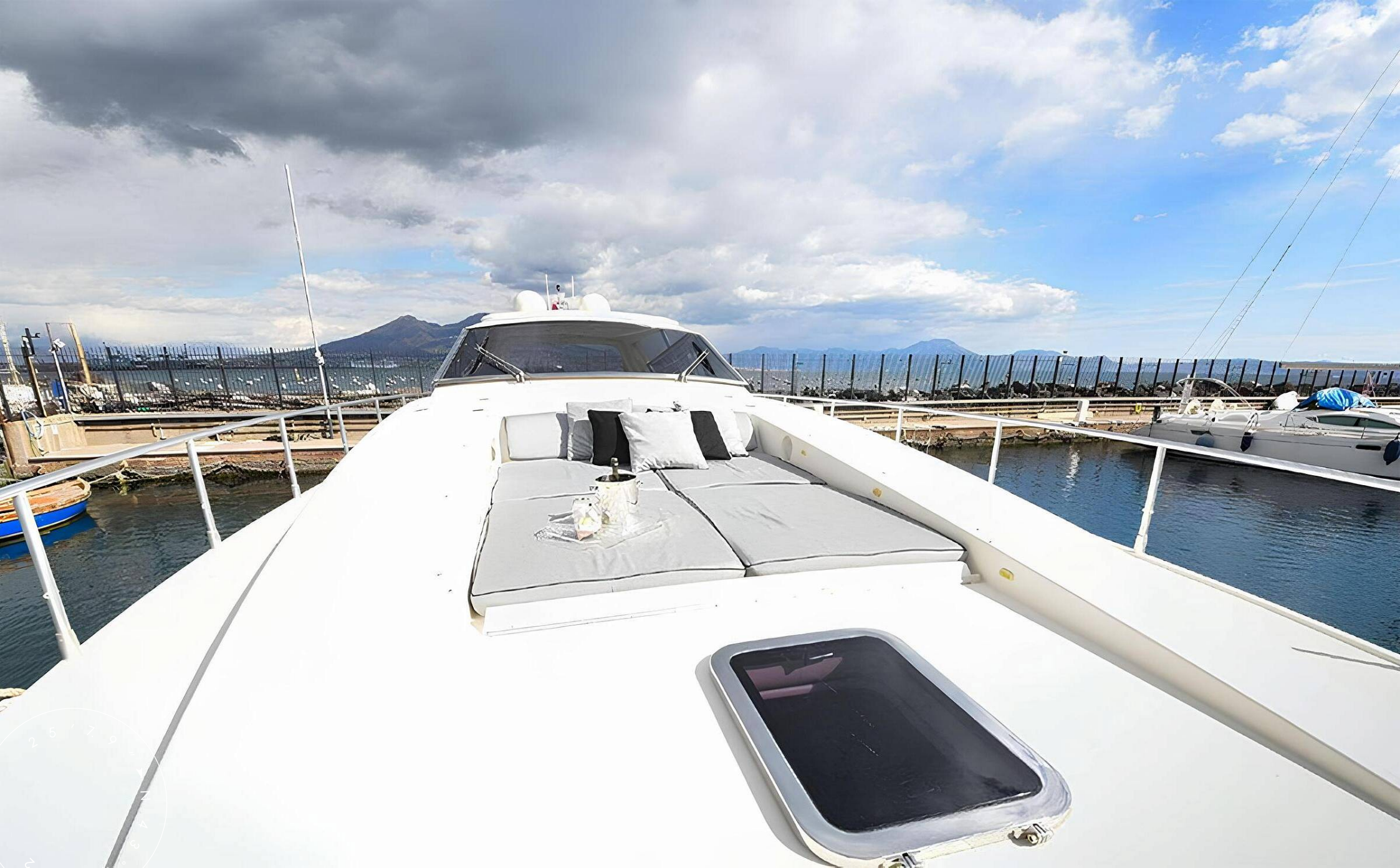
BOW LOUNGE AREA