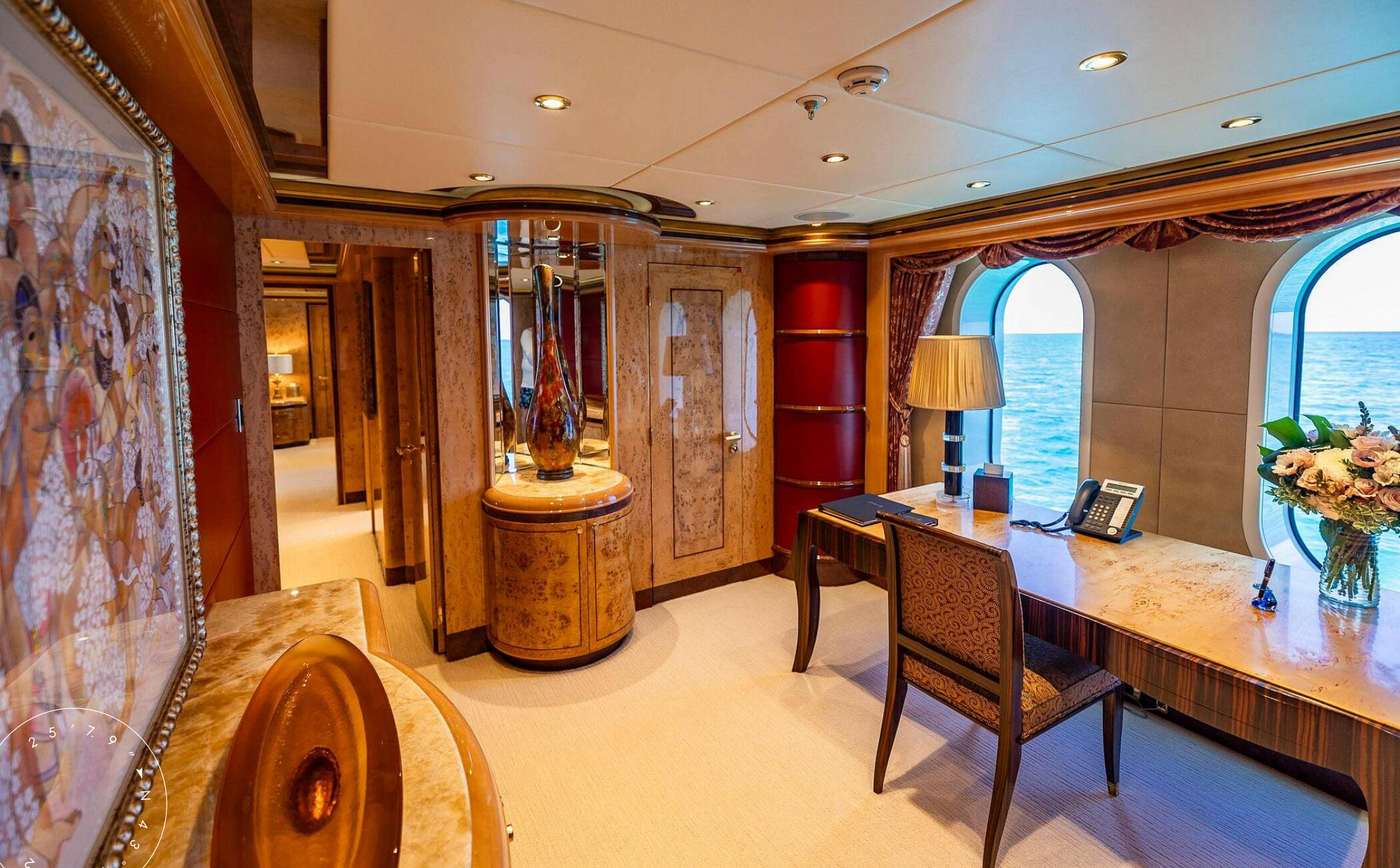
MASTER CABIN OFFICE