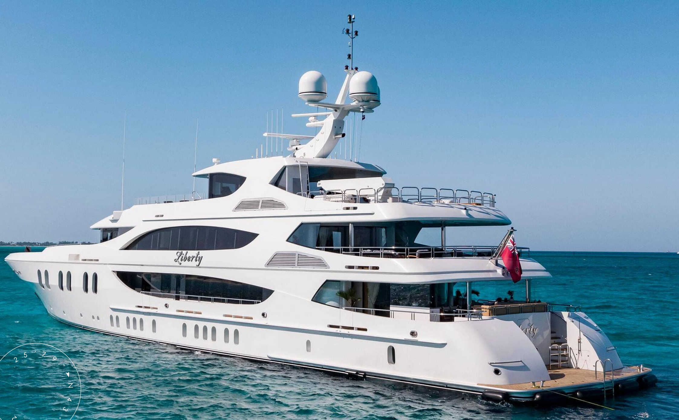
EXTERIOR TRINITY YACHTS 57M 2012 MY LIBERTY 187