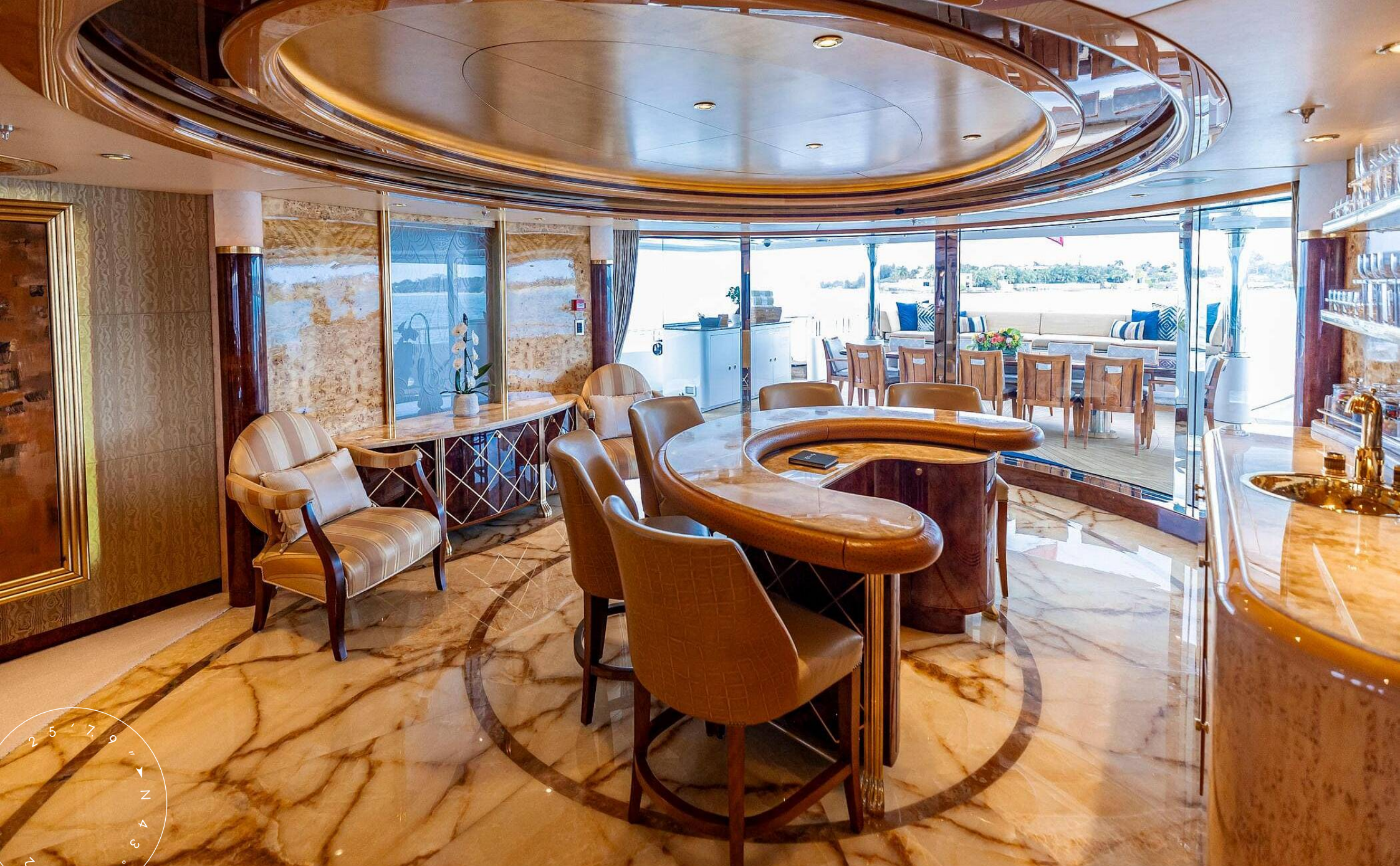
UPPER DECK SALON BAR