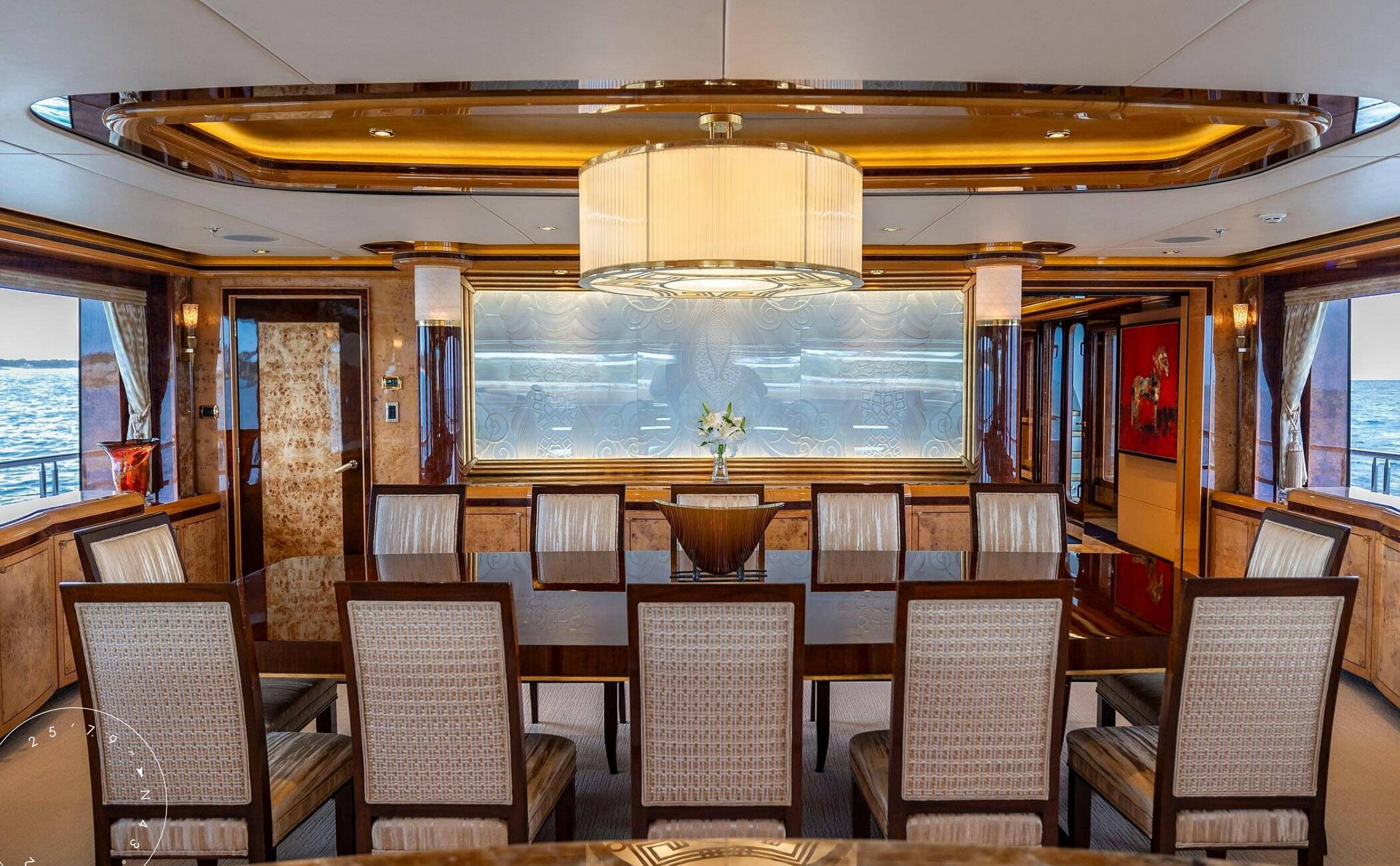
UPPER DECK SALOON DINING AREA