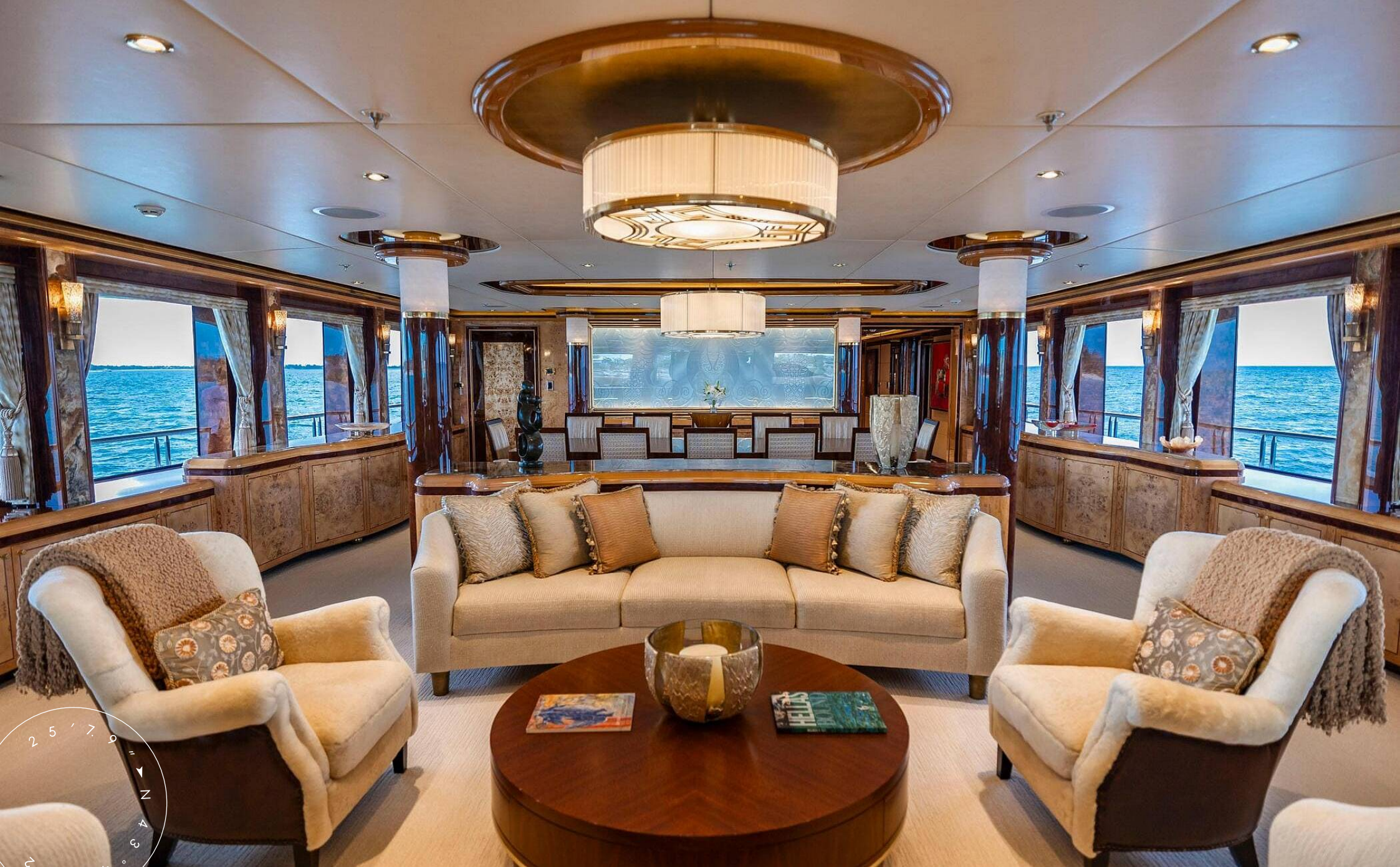
UPPER DECK SALON LOUNGE AREA