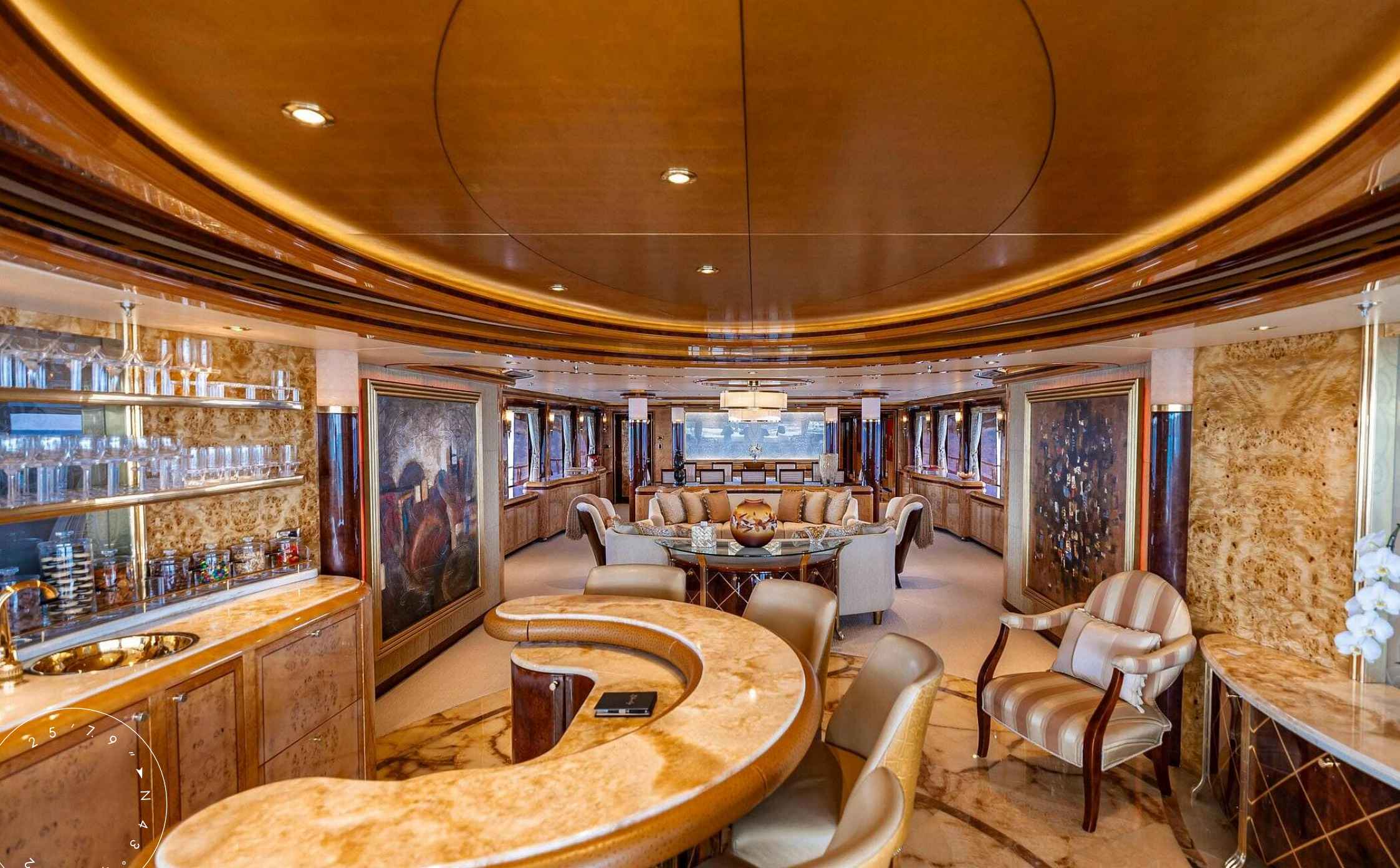
UPPER DECK SALON BAR