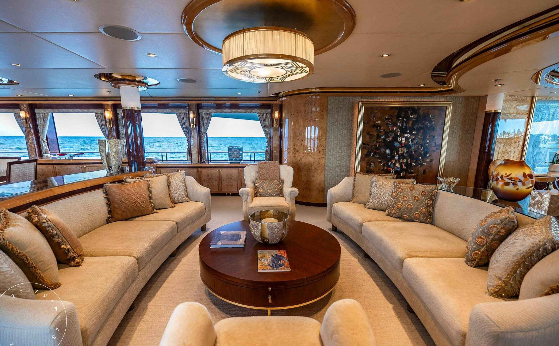
UPPER DECK SALON LOUNGE AREA