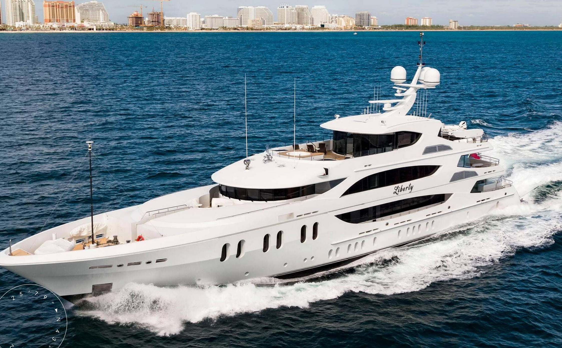
EXTERIOR TRINITY YACHTS 57M 2012 MY LIBERTY 187