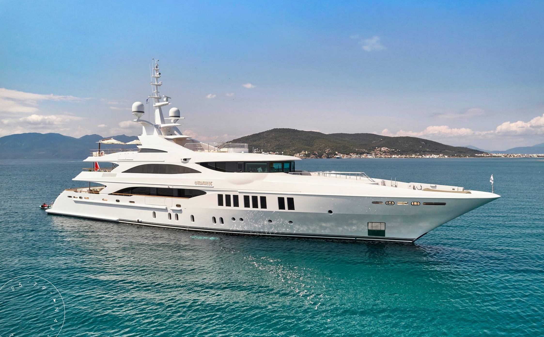
EXTERIOR GOLDEN YACHTS YACHT "O'MATHILDE"