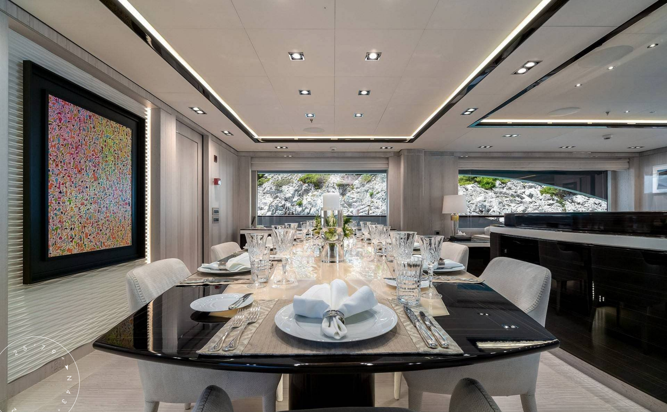
DINETTE IN THE MAIN SALON