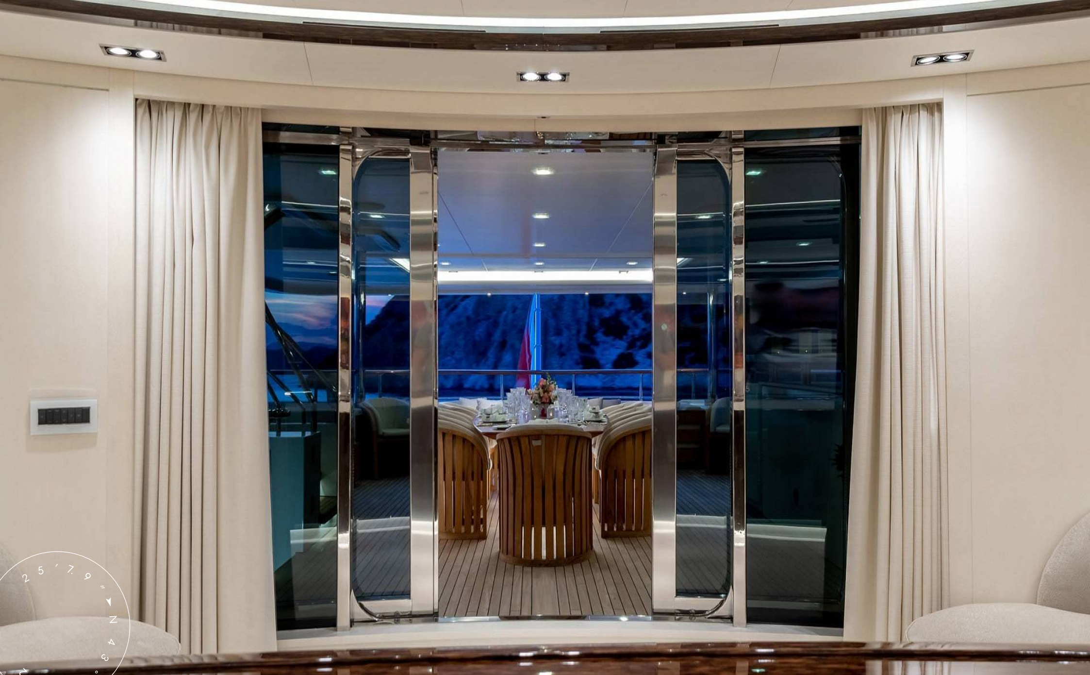
UPPER DECK DINETTE