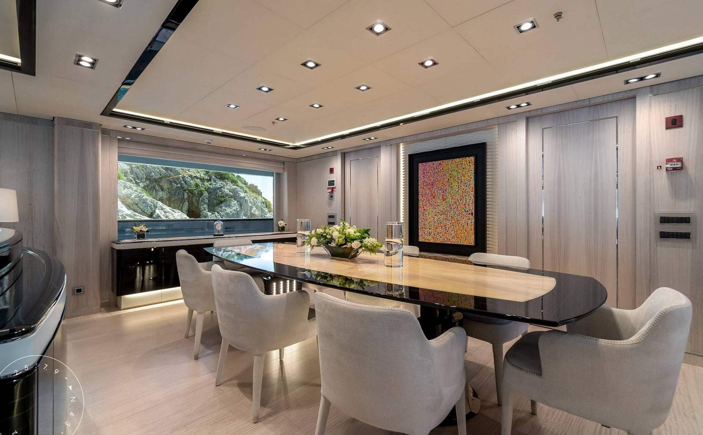
DINETTE IN THE MAIN SALON