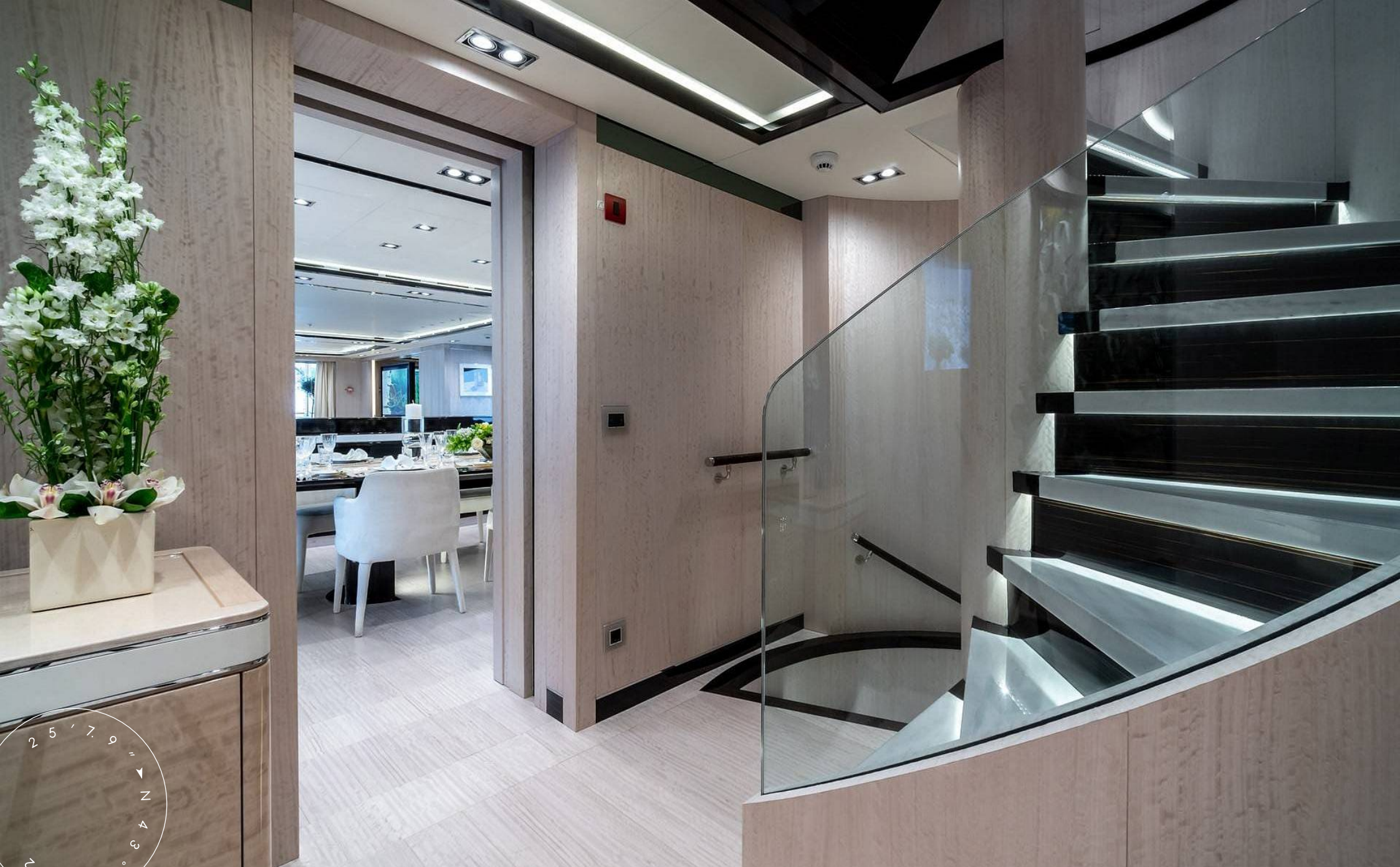
MAIN DECK LOBBY