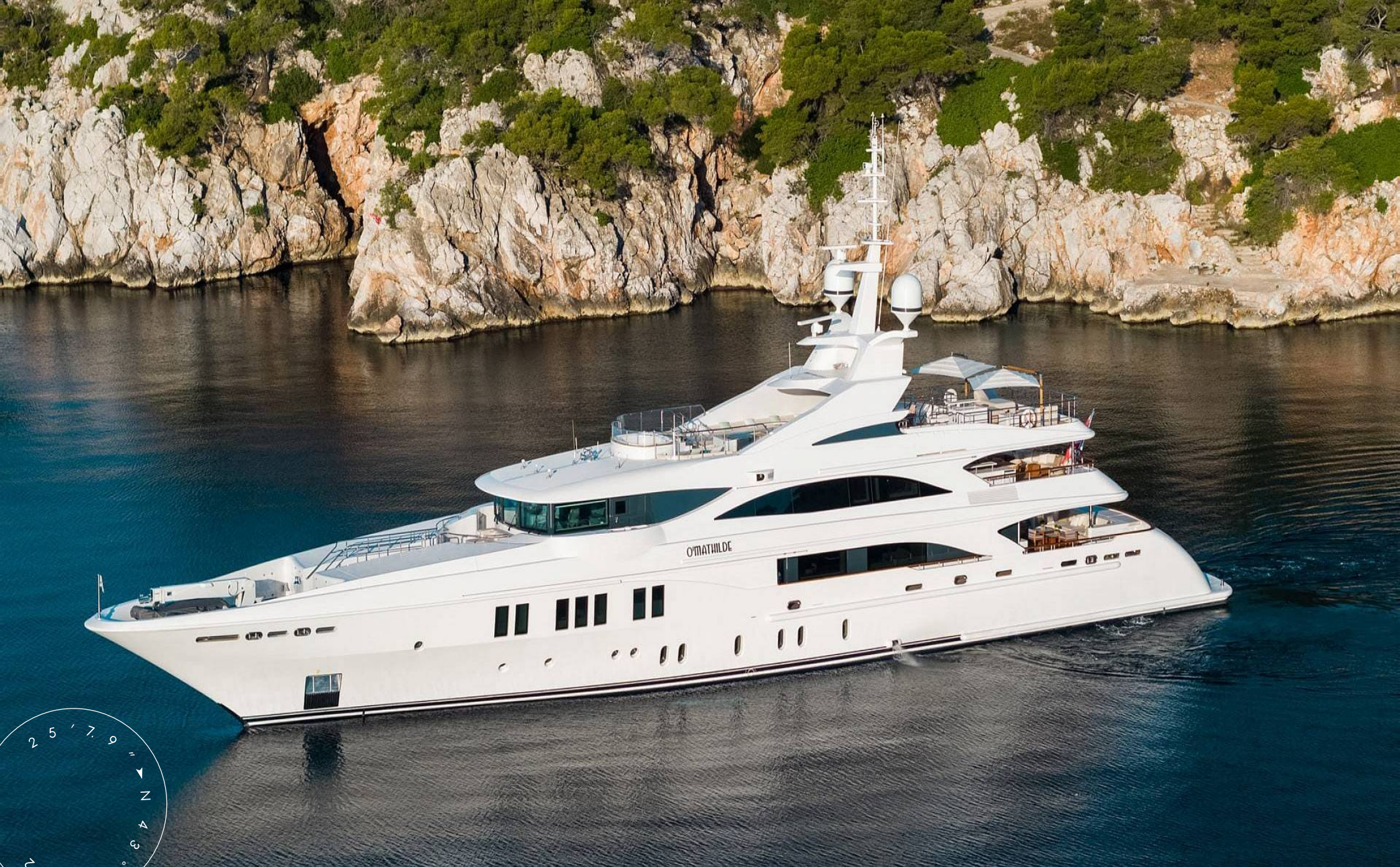
EXTERIOR GOLDEN YACHTS YACHT "O'MATHILDE"