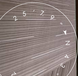
LOWER DECK LOBBY