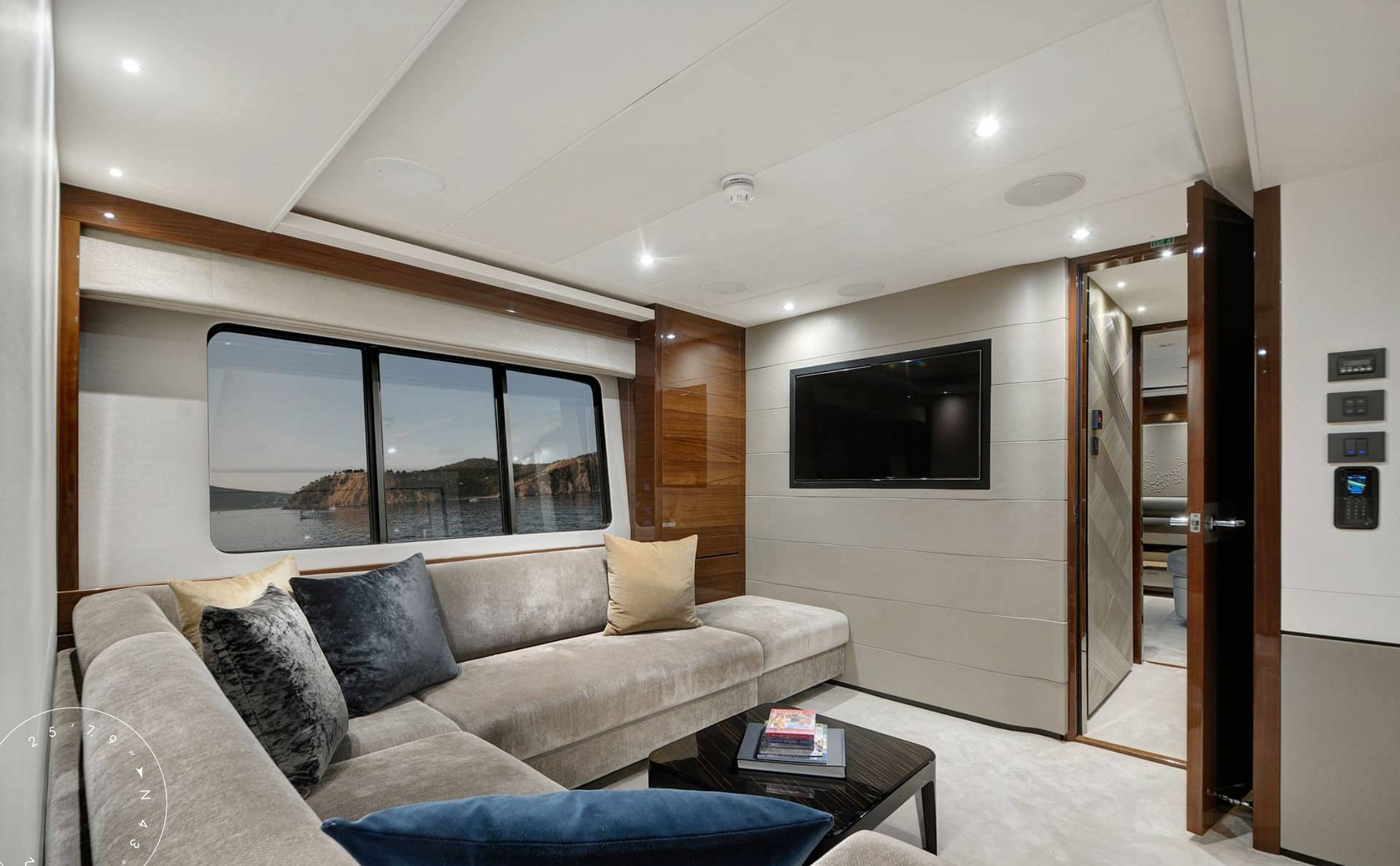
GUEST CABIN (LOUNGE ROOM)