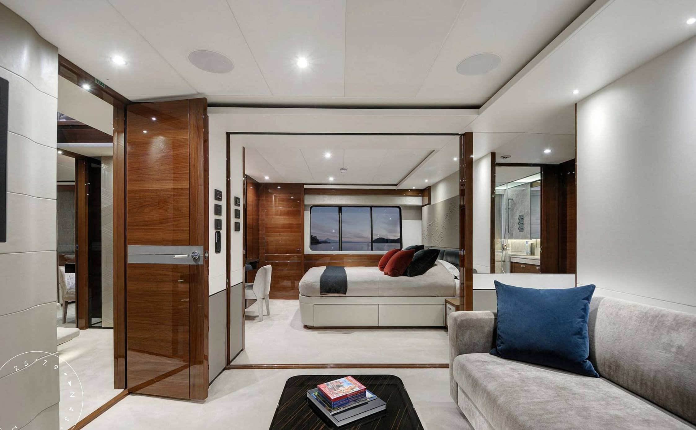
ADJACENT VIP CABIN AND LOUNGE (GUEST ROOM)