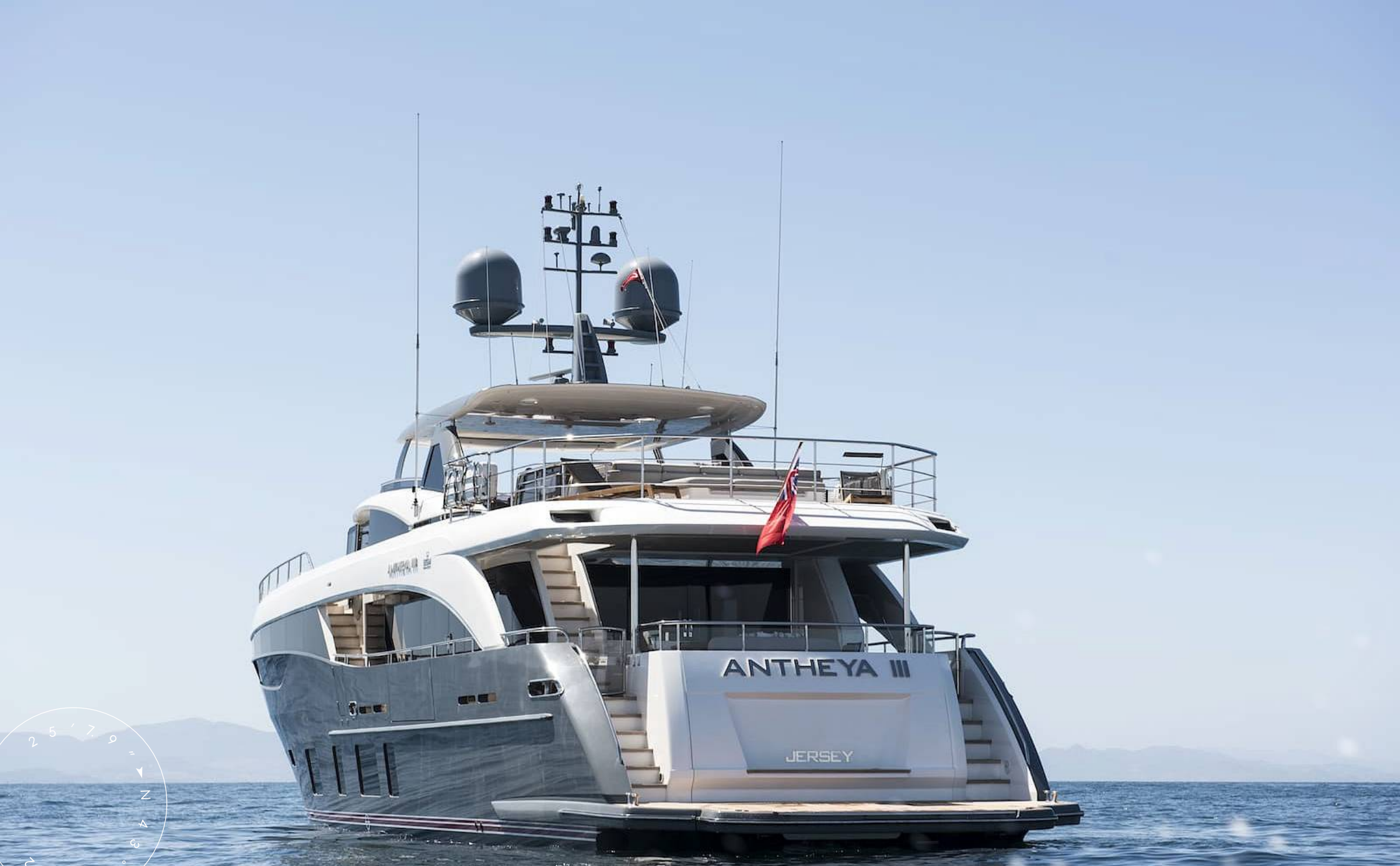
EXTERIOR PRINCESS 35M 2015 MY ANTHEYA III