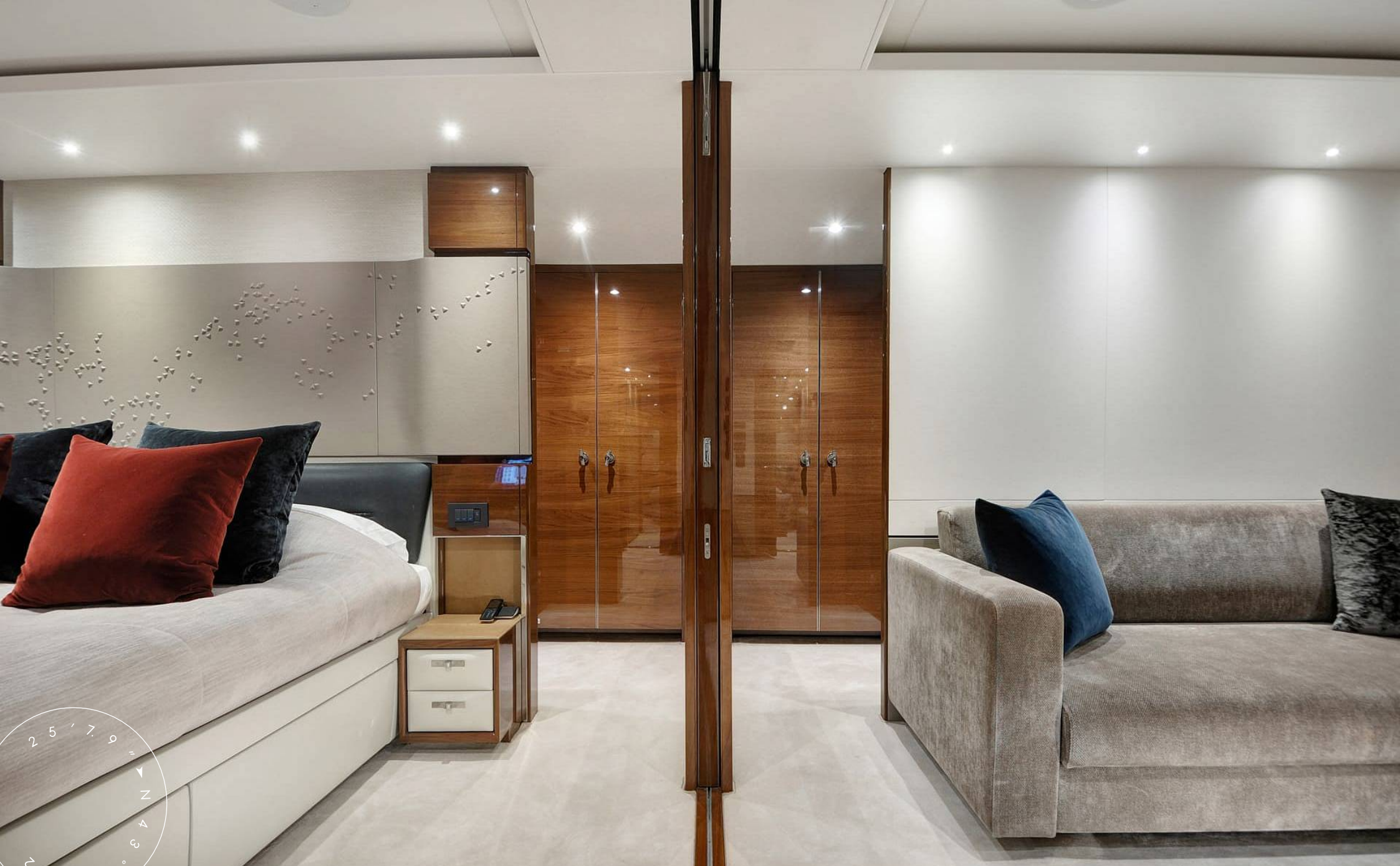
ADJACENT VIP CABIN AND LOUNGE (GUEST ROOM)