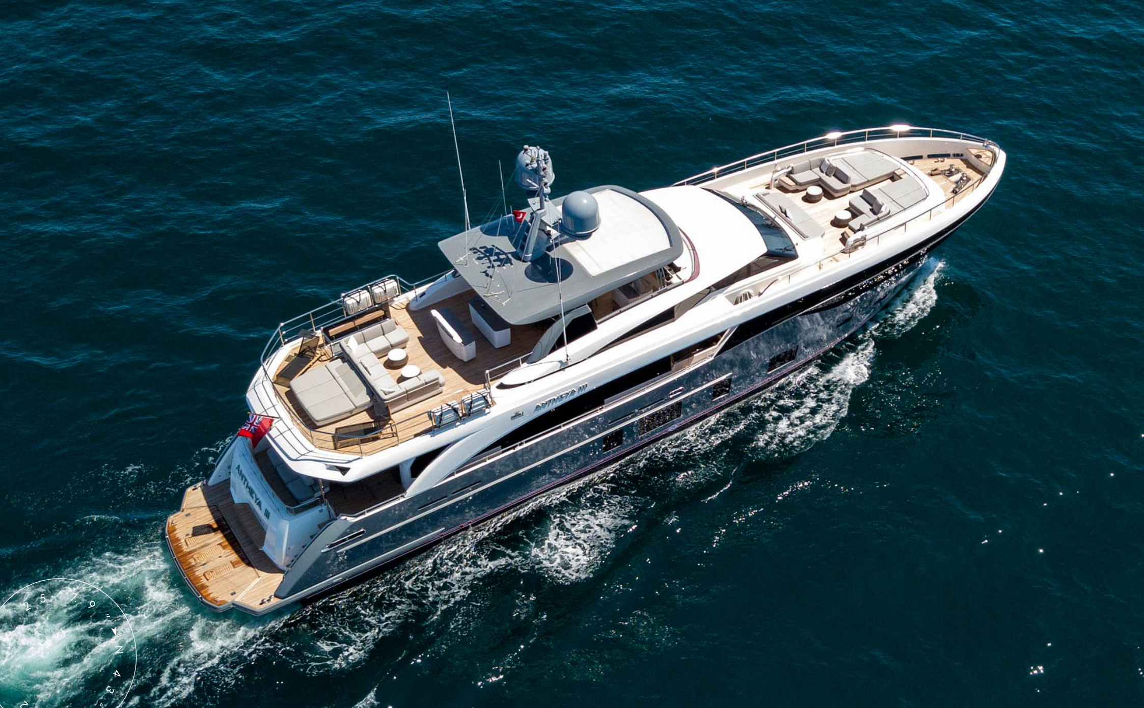
EXTERIOR PRINCESS 35M 2015 MY ANTHEYA III